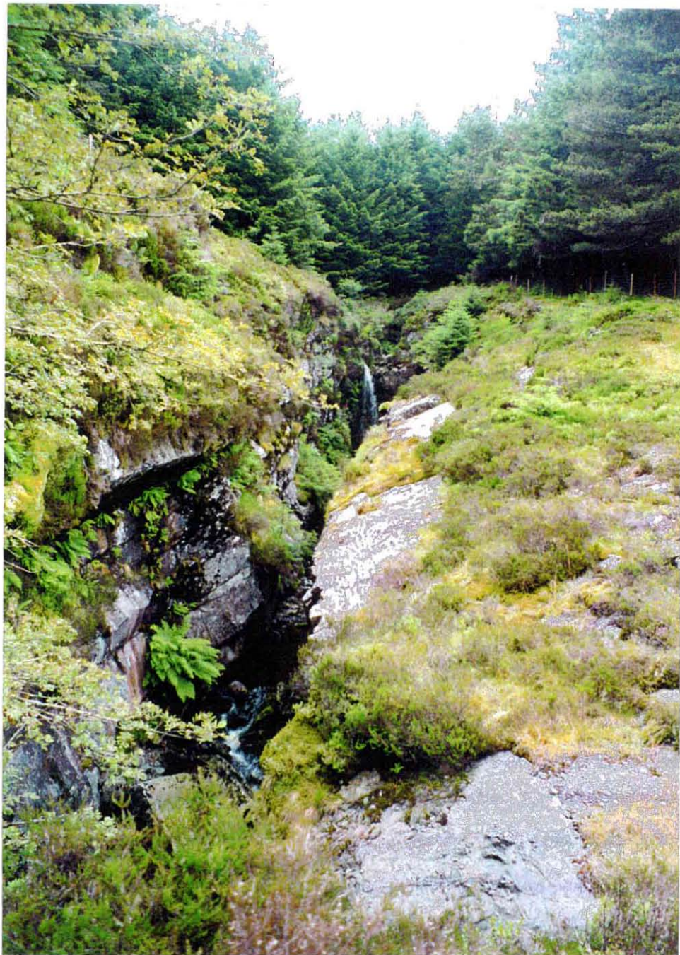
Plate 19: View north of the open-cut workings, prior to harvesting. (August 2000)