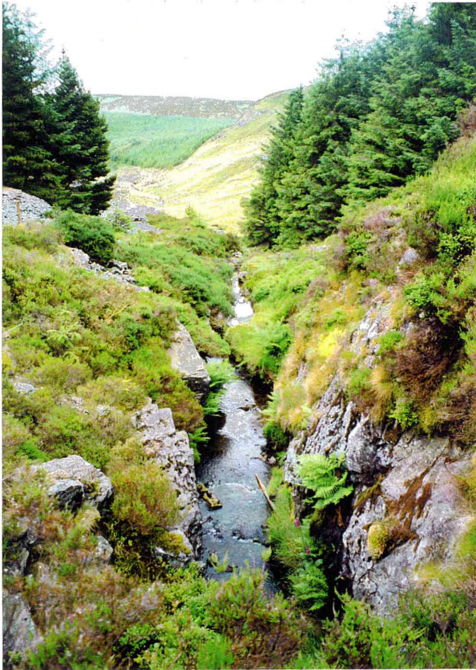
Plate 17: View south down Nant yr Eira from the open-cut workings, prior to harvesting. (August 2000)