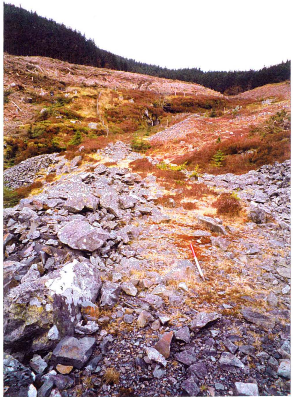
Plate 16: View north-west following harvesting, which has opened up a clear view towards the open-cut. (April 2001)