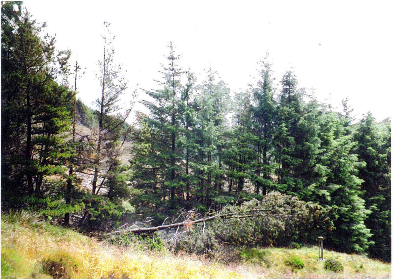
Plate 13 above : View east towards mine building 15118, obscured by conifer crop, prior to harvesting. (August 2000)