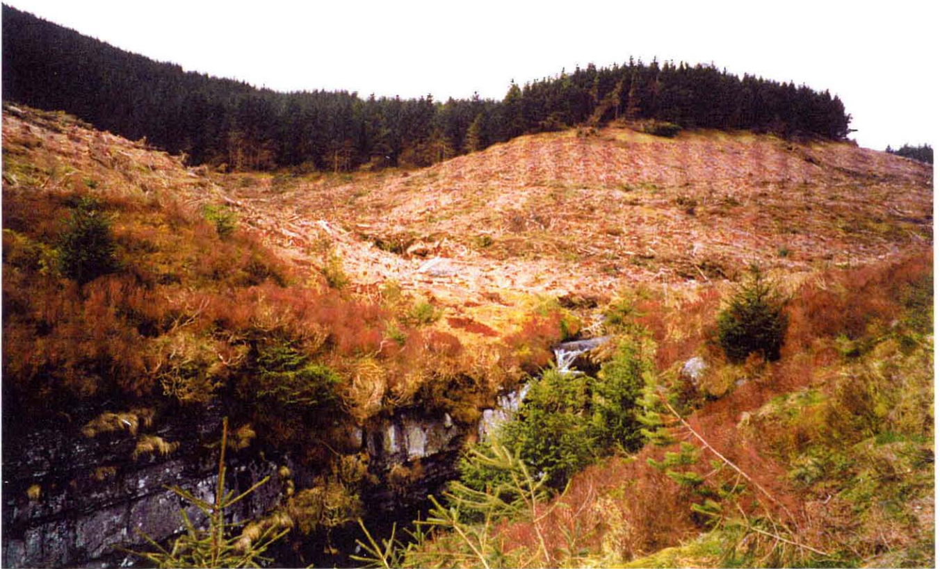
Plate 23: View to north-west over top of open-cut towards the large area of clearfell.

The clearfell operations have opened up in particular the area around the Bronze Age open-cut (18531) and the reservoir (20899). The north side of the cut was previously obscured from view. (April 2001)