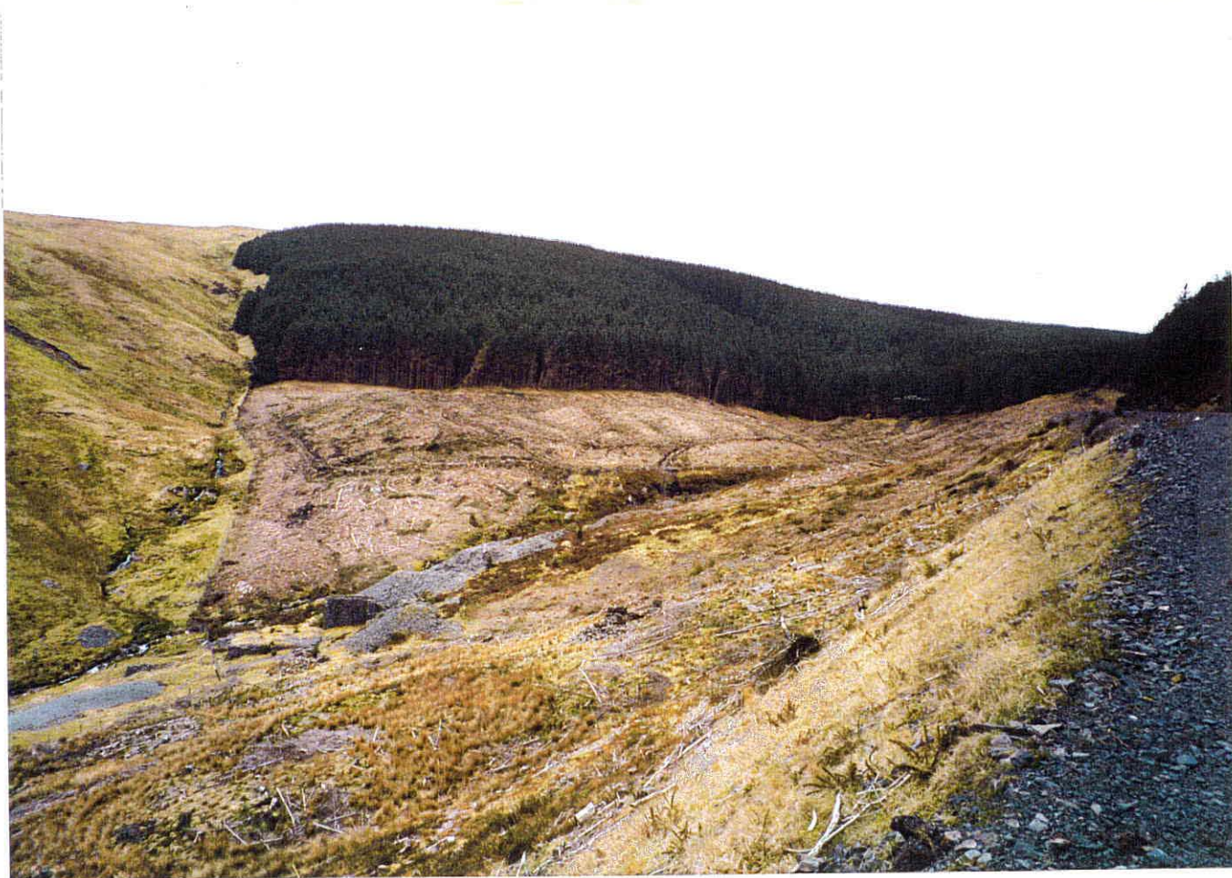
Plate 2 below : View west following harvesting operations (April 2001)