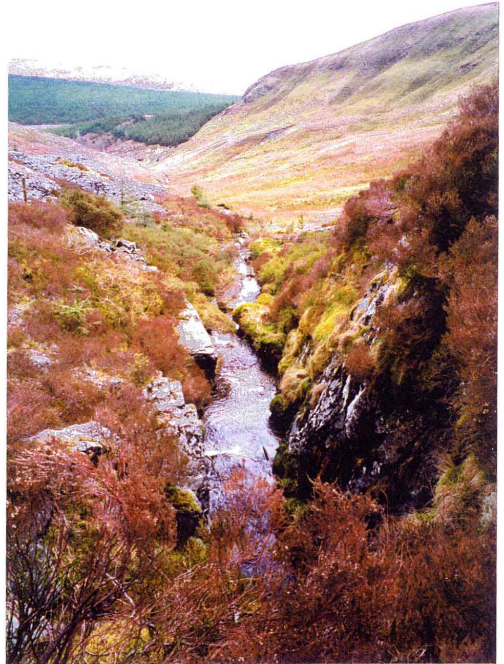
Plate 18: View south following harvesting operations. (April 2001)