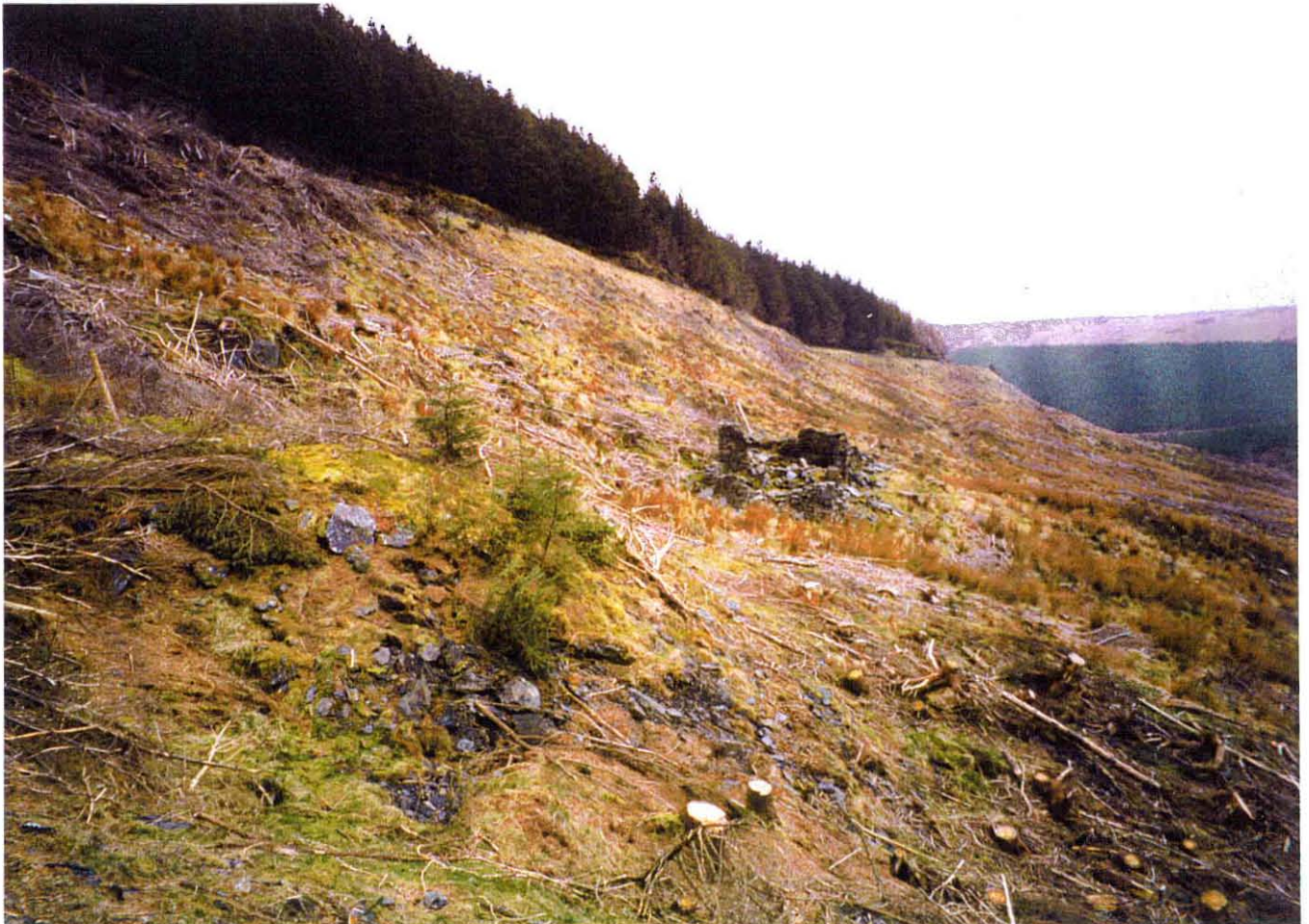
Plate 14 below : View east following harvesting, which has opened up a clear view from the main mine site. (April 2001)