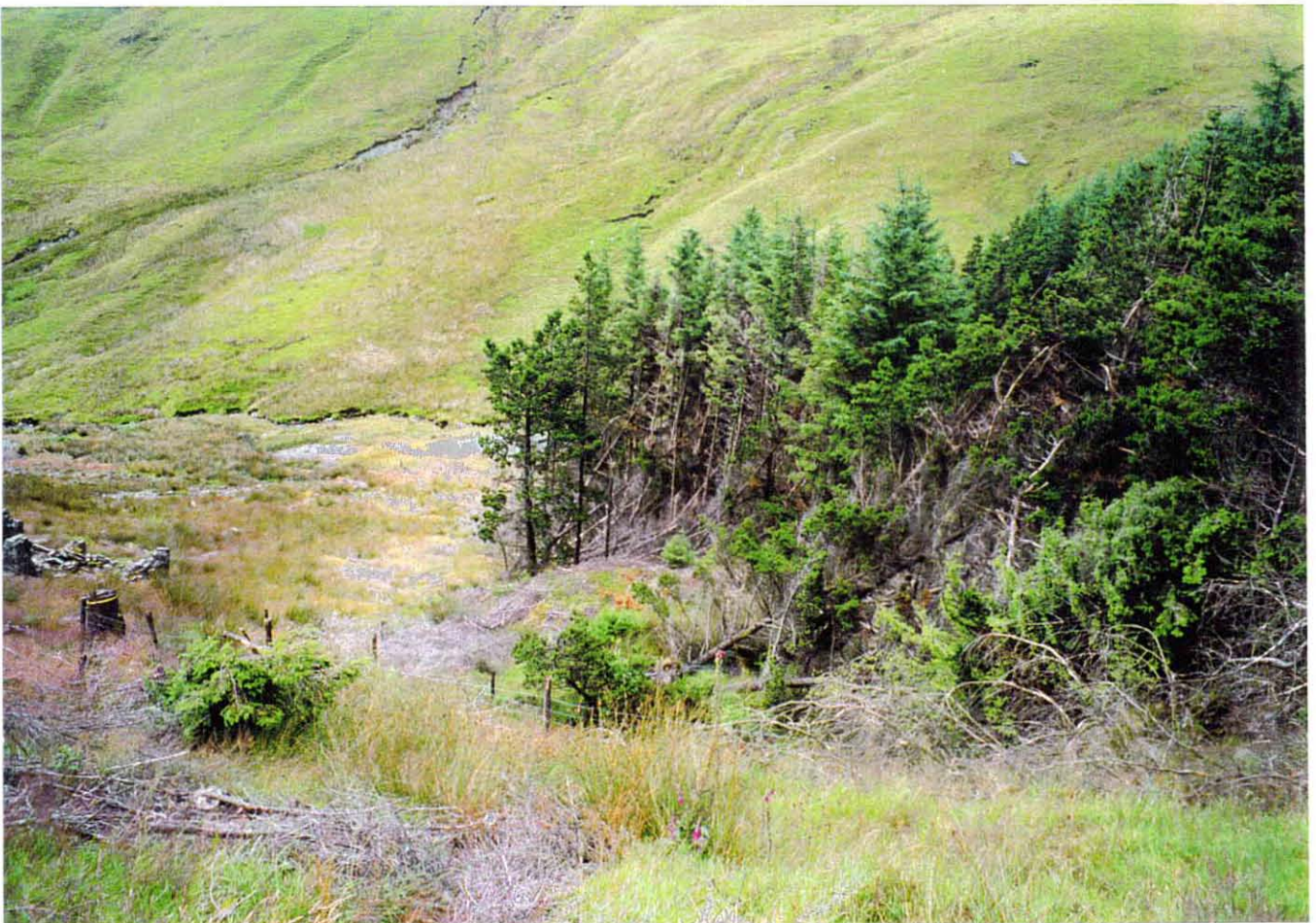
Plate 3 above : View west of lower mine area prior to harvesting. The building on the left of the photograph is the mine building (15118) located east of the main site, located following previous felling operations. (August 2000)