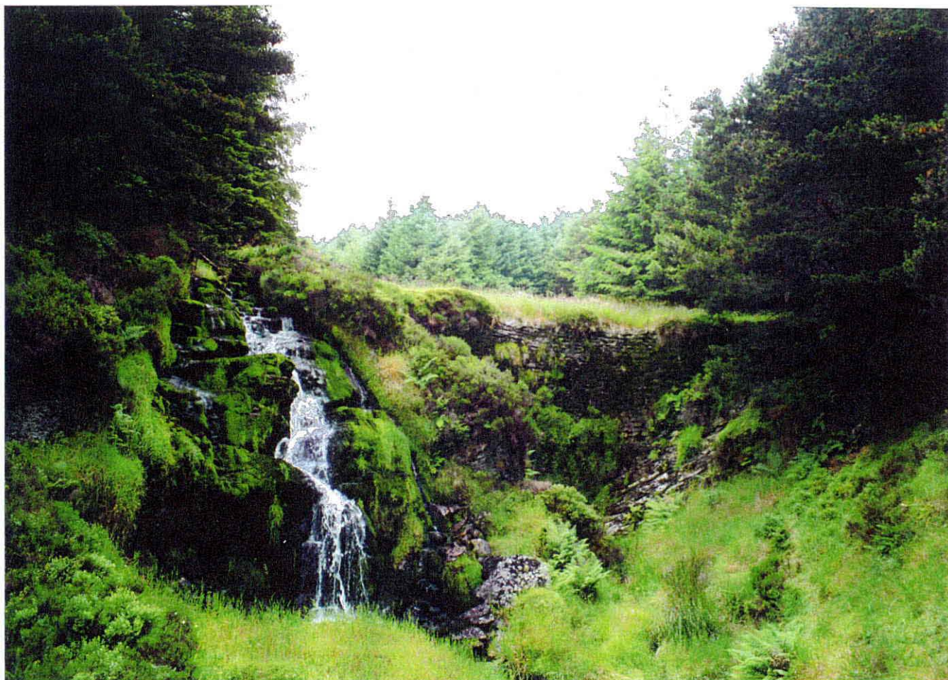
Plate 29 above : View north to reservoir dam wall (20899), prior to clearfell. Conifer crop can be seen to be in close proximity to the structure, particularly on the right (east side). (August 2000)