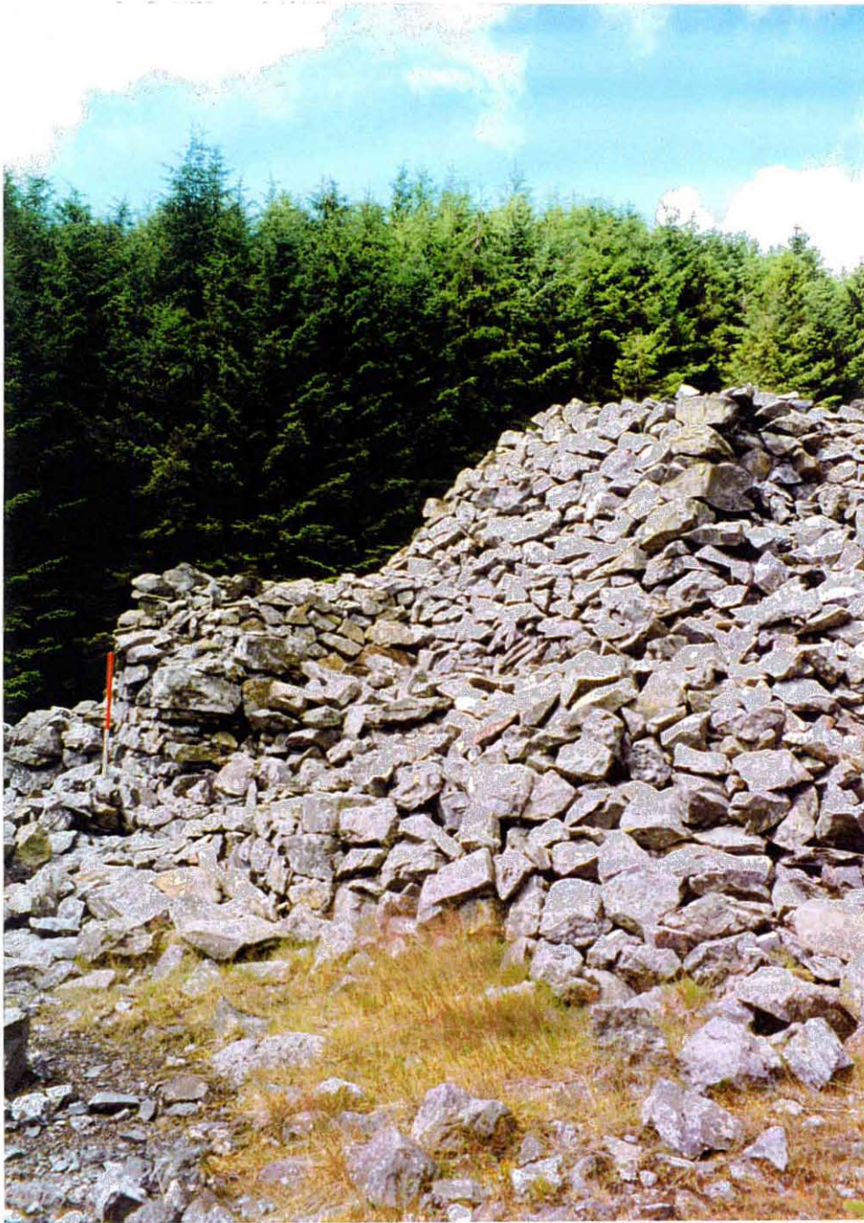
Plate 11: View west to bank of ore-bins 18535, prior to harvesting. (August 2000)