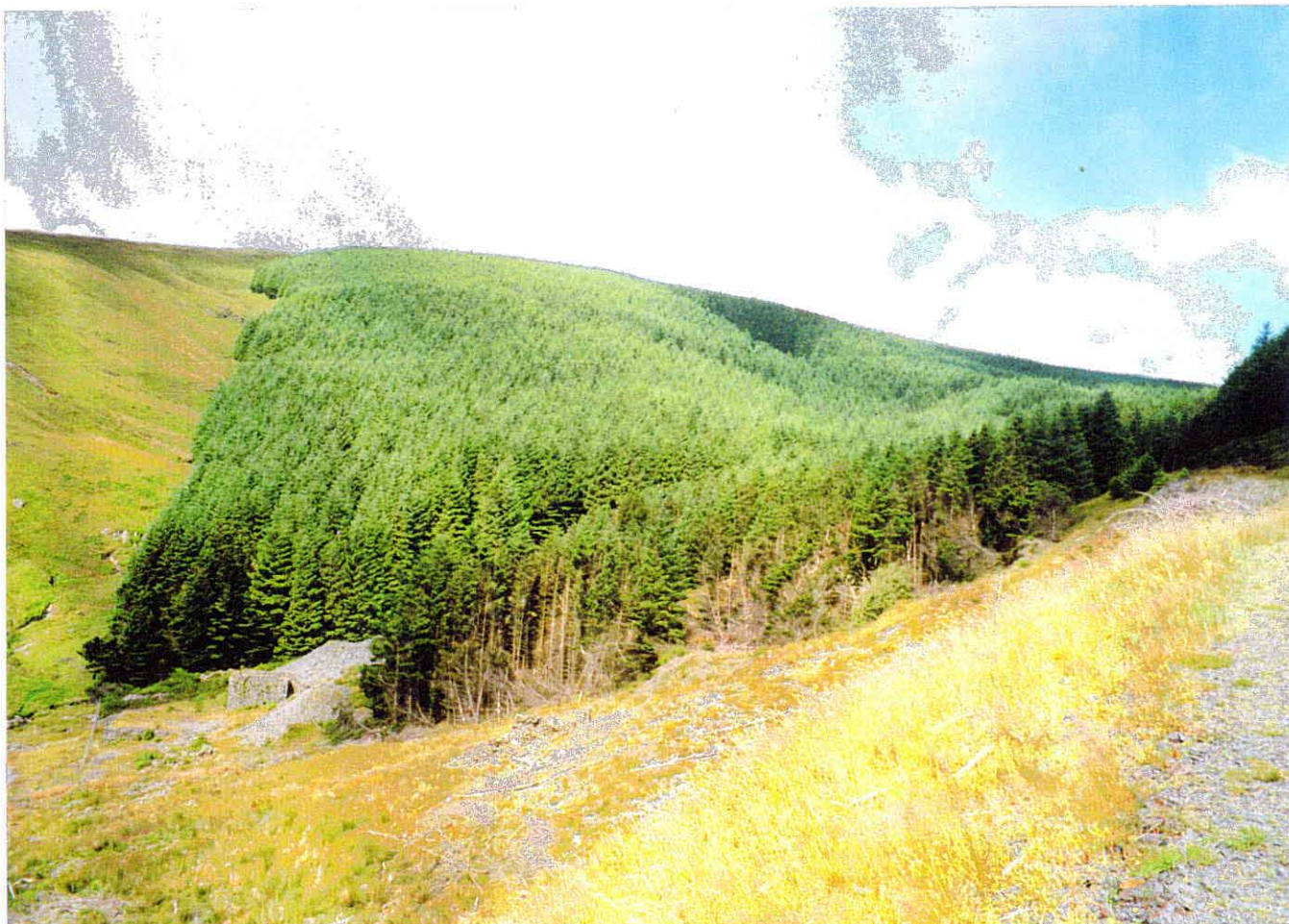
Plate 1 above : View to west, from forestry track towards Nant yr Eira Mine site, prior to harvesting operations. The crusher house wheelpit (18536) and the platform to the south of it (18538) together with two spoil tips can be seen to the left of the clearfell. (August 2000)