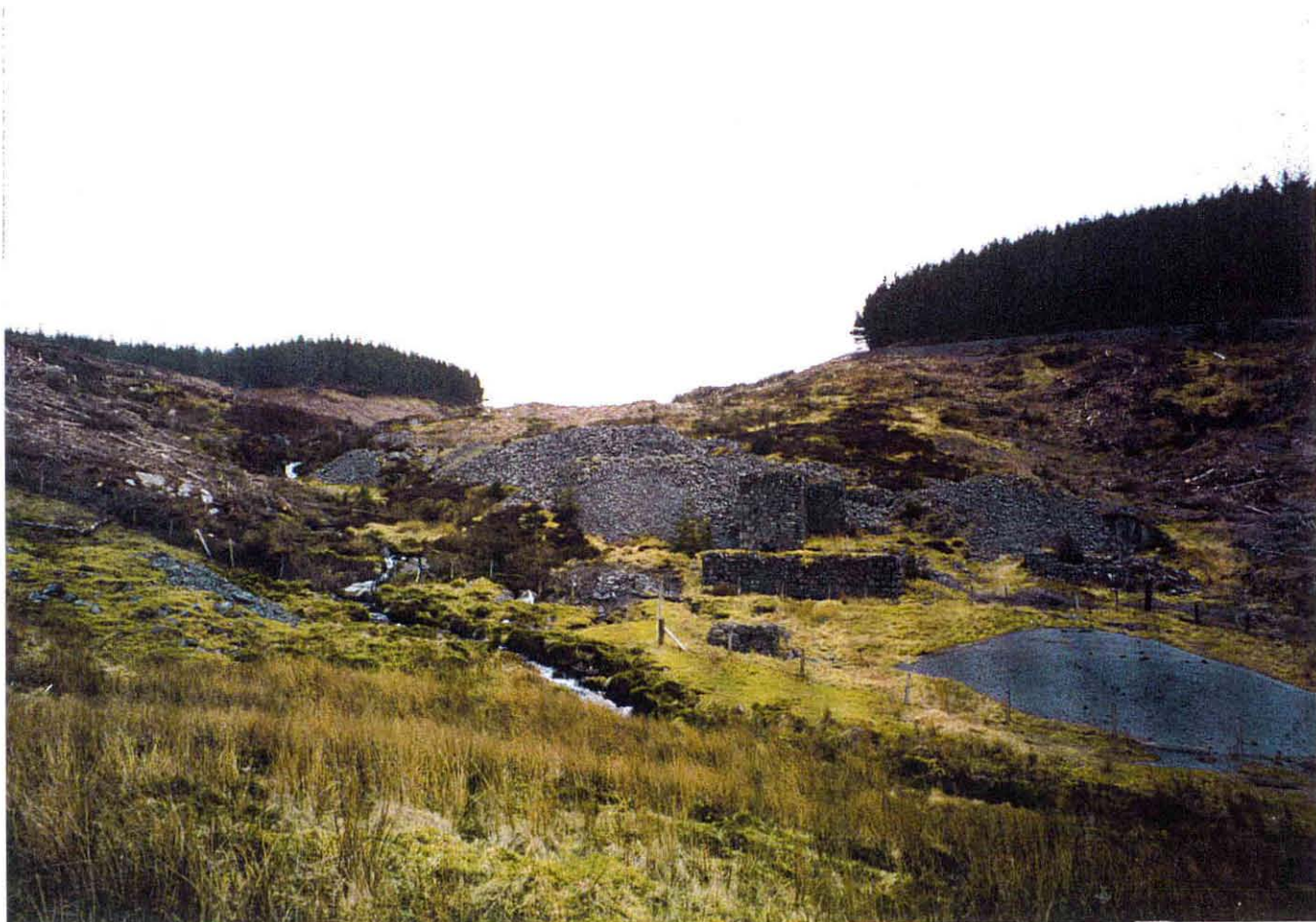
Plate 8 below View following harvesting. (April 2001)