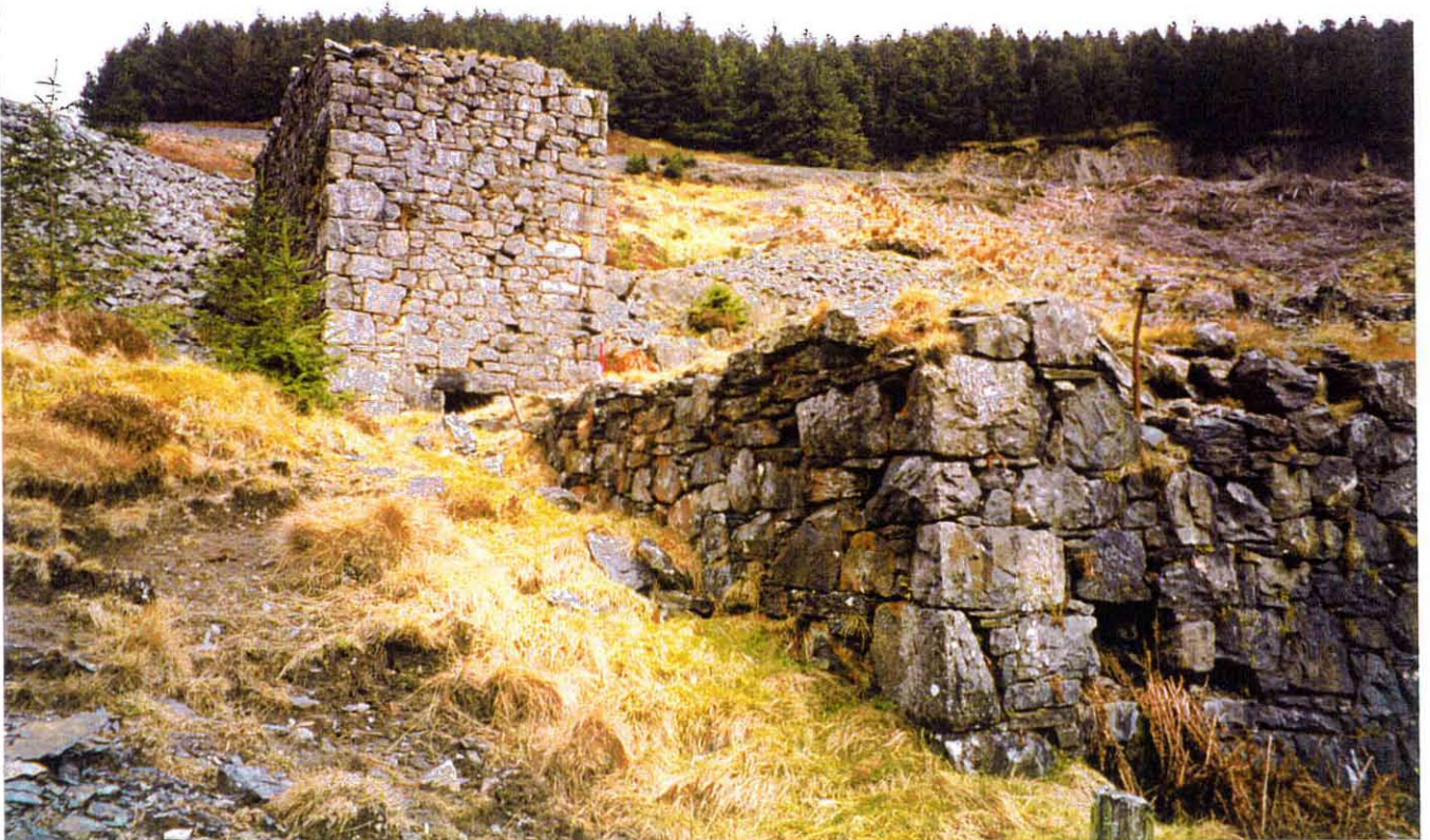
Plate 10 below : View following harvesting operations. (April 2001)