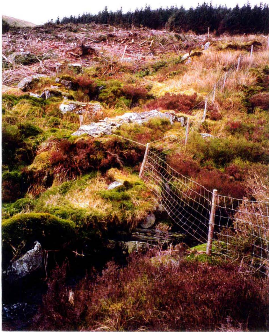
Plate 21: View west to pier base 18696, which presumably helped Transport the diverted stream across the bottom of the open cut to feed the crusher house leat. Pier base no longer overshadowed by conifers. (April 2001)