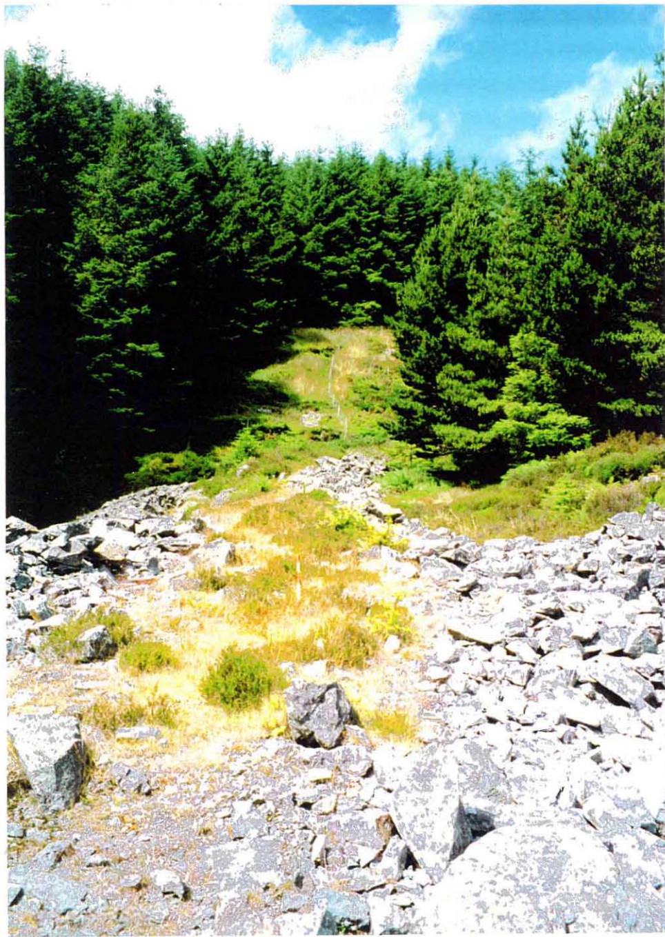
Plate 15: View to north-west along tramway 18534, towards the Bronze Age open-cut (18531) obscured by conifer crop. (August 2000)