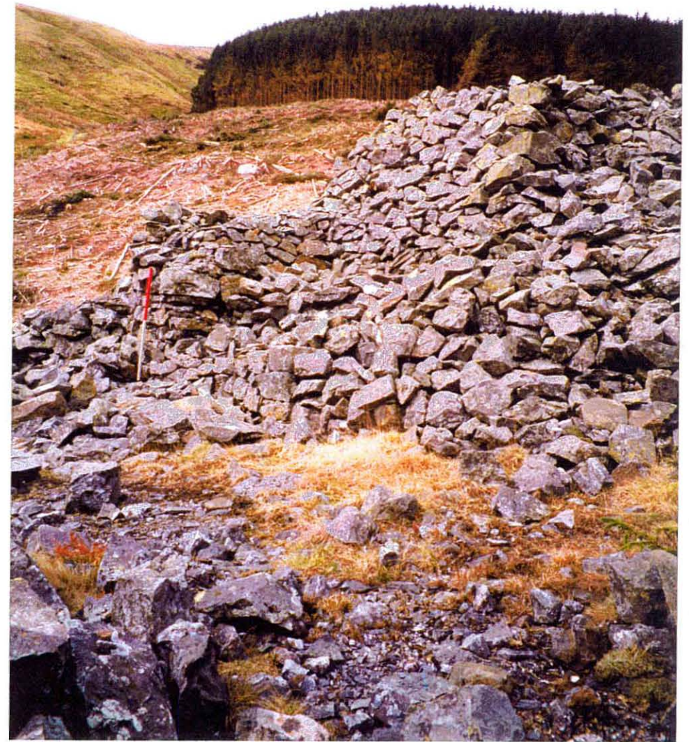
Plate 12: View of ore-bins 18535, following harvesting. (April 2001)