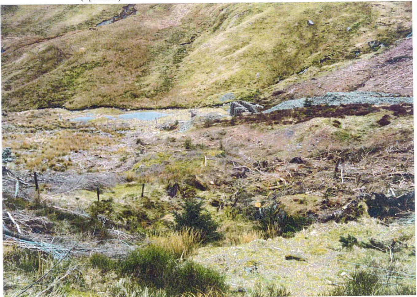
Plate 4 below : View west following harvesting operations. Harvesting has opened up clear views from the east towards the crusher house complex. (April 2001)