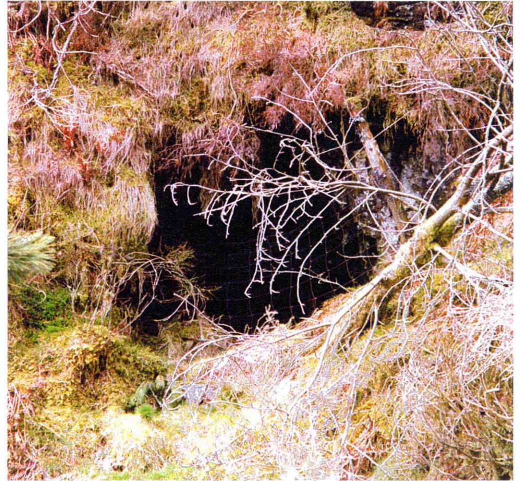
Plates 25 & 26: View west to rock-cut level 15117; cut in west on the right bank of the stream, following removal of overhanging conifer crop. Level located downstream of the dam wall. (April 2001)