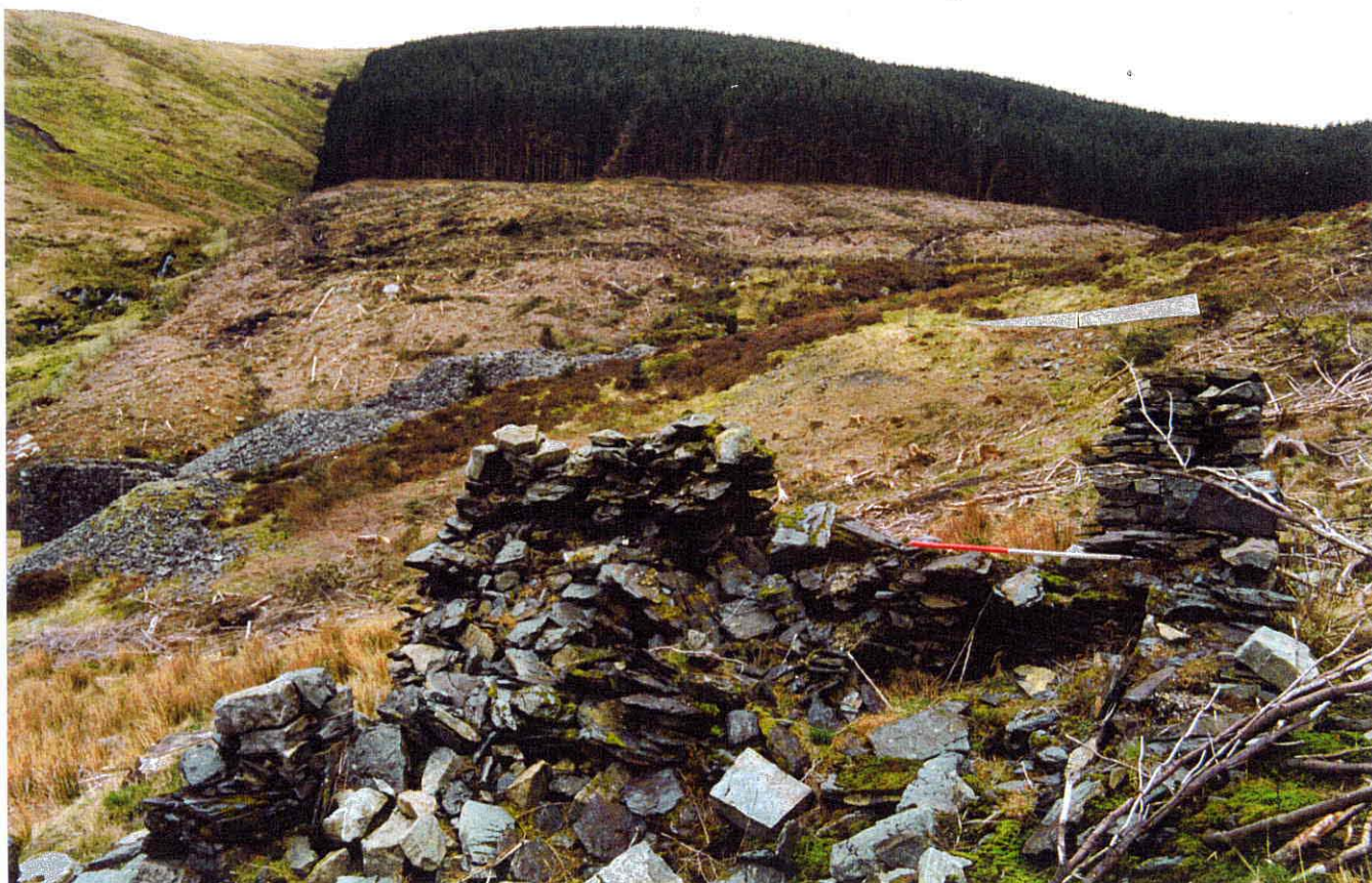
Plate 5 above : View west following harvesting operations from mine building 15118 towards the main site. Harvesting has opened up views towards the earthworks of a spoil tip tramway which extended in a north / south direction. Route of tramway indicated by white line. (April 2001)