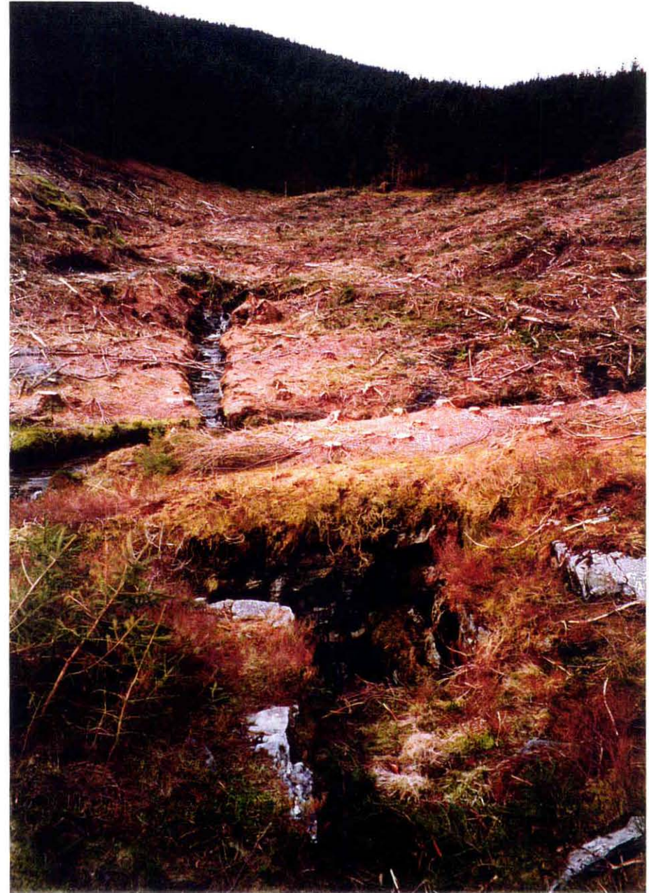
Plate 22: View west from north end of open-cut shows confluence of north-south and west-east flowing streams in area of 'rock bridge' (April 2001)