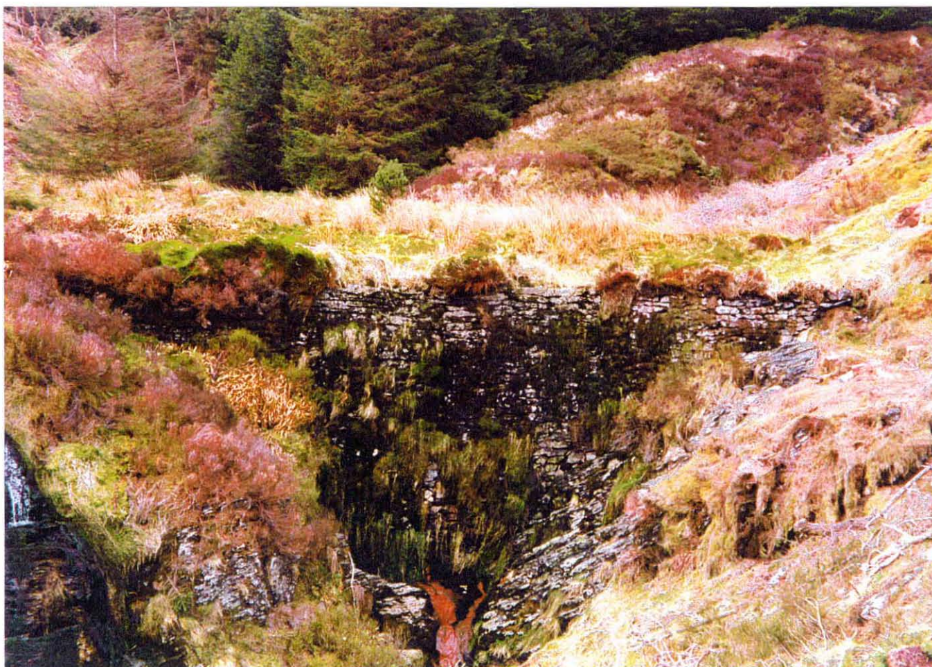
Plate 28 below : View following harvesting, which has removed the crop which was threatening the structure of the dam. (April 2001)