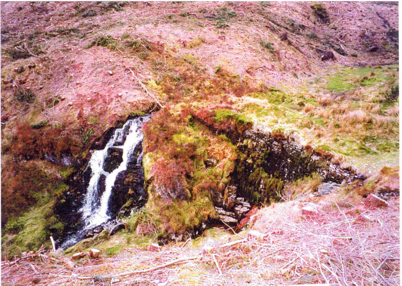
Plate 31 above : View west across the reservoir and dam wall (20899), following harvesting operations, which have removed the threat to the structure of the dam. (April 2001)