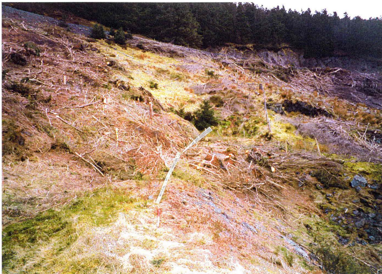
Plate 6 below View northwards over the tramway; route indicated by 2m scale and white line. (April 2001)