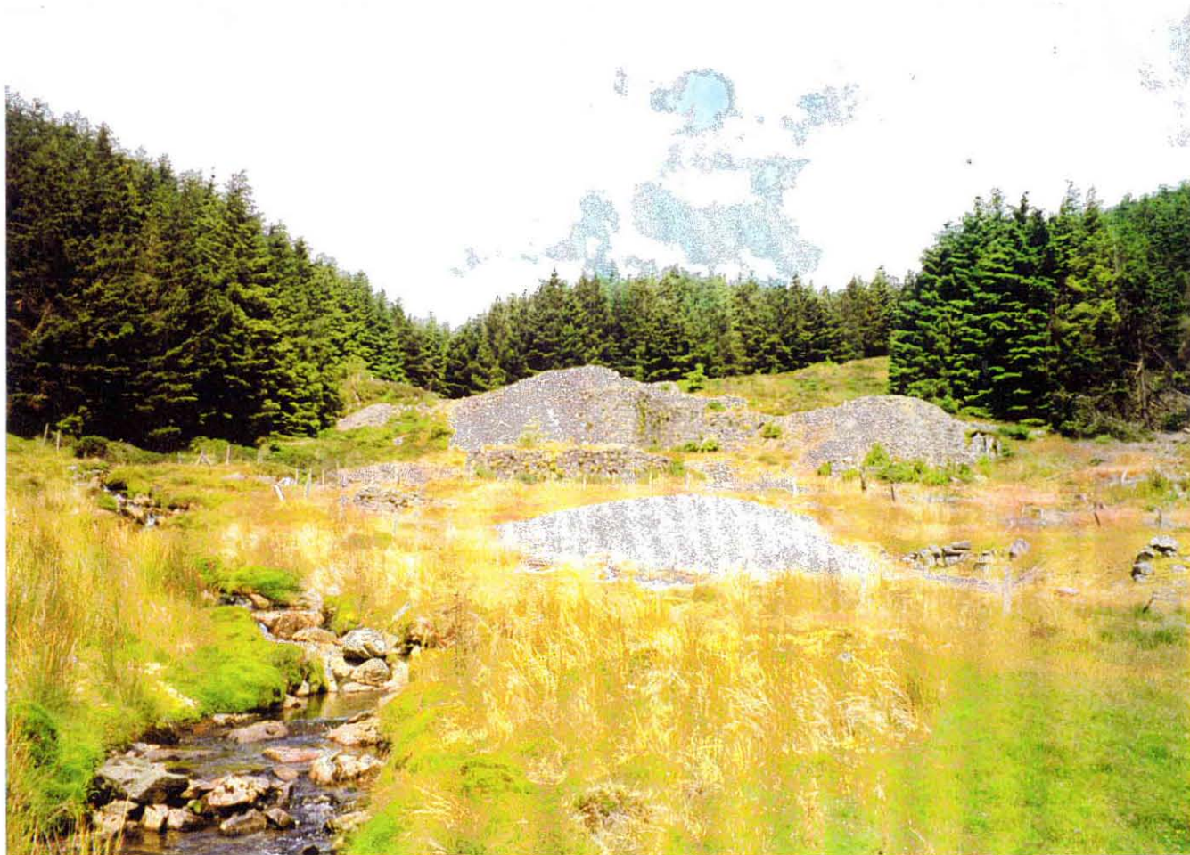
Plate 7 above : View north over Nant yr Eira stream to main mine site, prior to harvesting. Spoil relating to jigging operations can be seen in the foreground and the crusher house, wheelpit and platform area are north of the fenceline, between 2 areas of tipping. The tip on the west side includes ore-bins 18535. (August 2000)