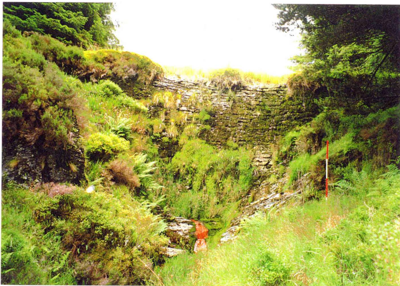
Plate 27 above : View north of Reservoir dam wall (20899), prior to harvesting. (August 2000)