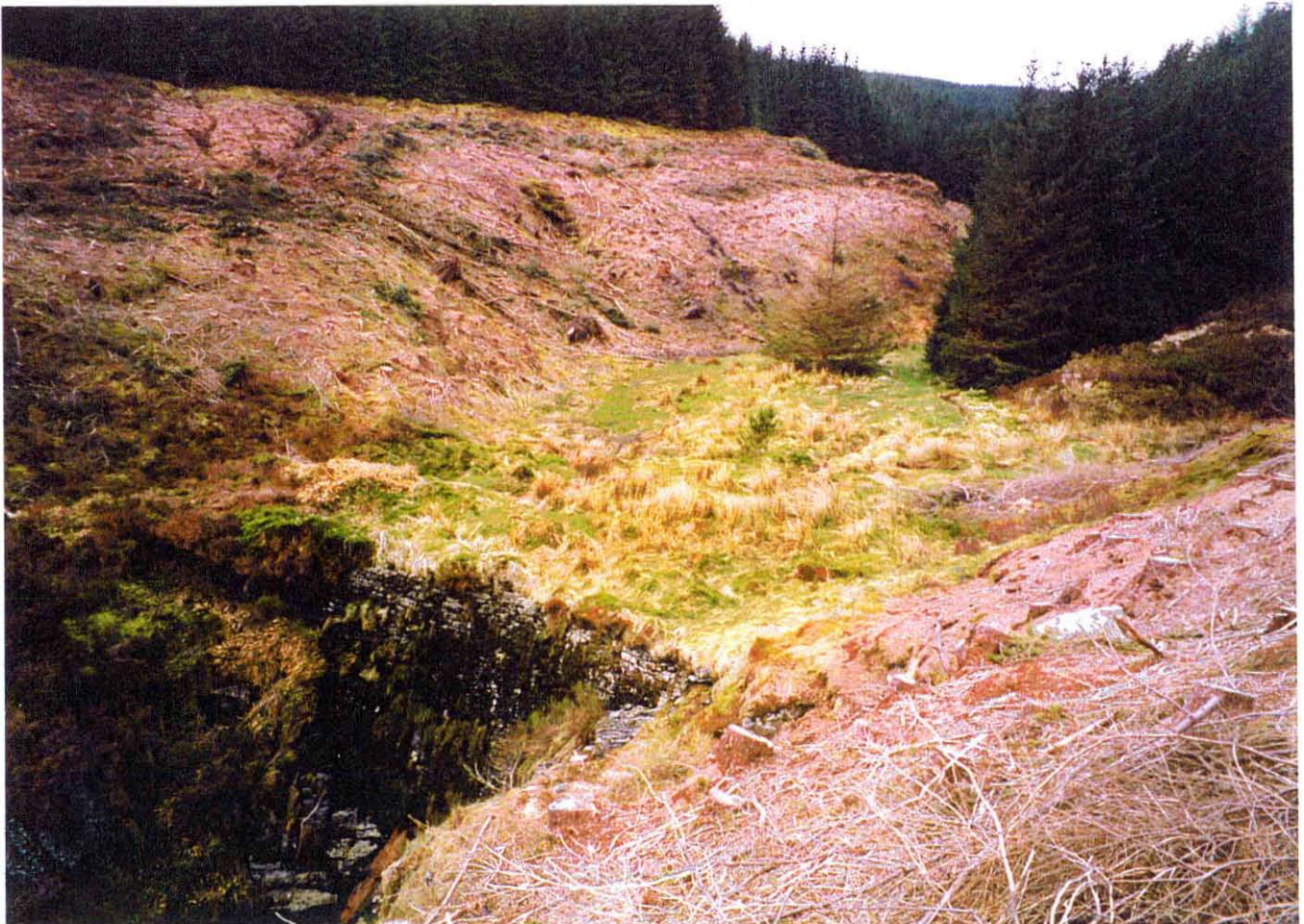
Plate 32 below : View west, following harvesting operations, showing reservoir now displayed on open ground. (April 2001)