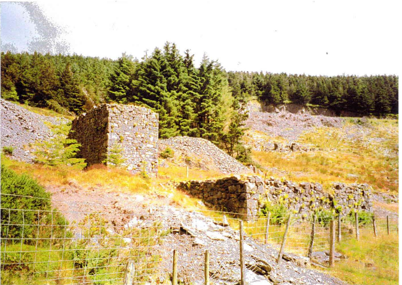
Plate 9 above : View north-east towards crusher house wheelpit (18536) and the platform to the south of it (18538). Mine building 15118 can be seen in the distance to the right of the conifers, prior to harvesting. (August 2000)