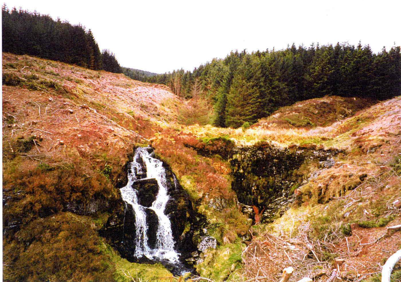
Plate 30 below : View north, as above, following harvesting operations. (April 2001)