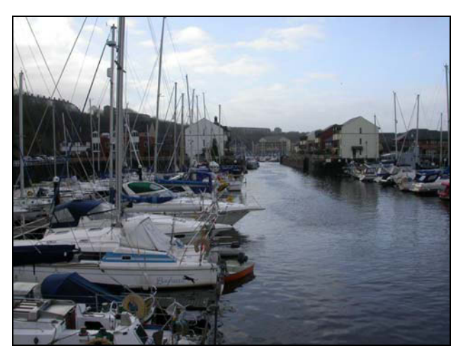
Plate 31 View of Penarth Docks (01713s/34271), looking northwest

A post-medieval dock constructed in 1865. The area has recently undergone considerable residential redevelopment, and is currently used for leisure, rather than industrial, activities.