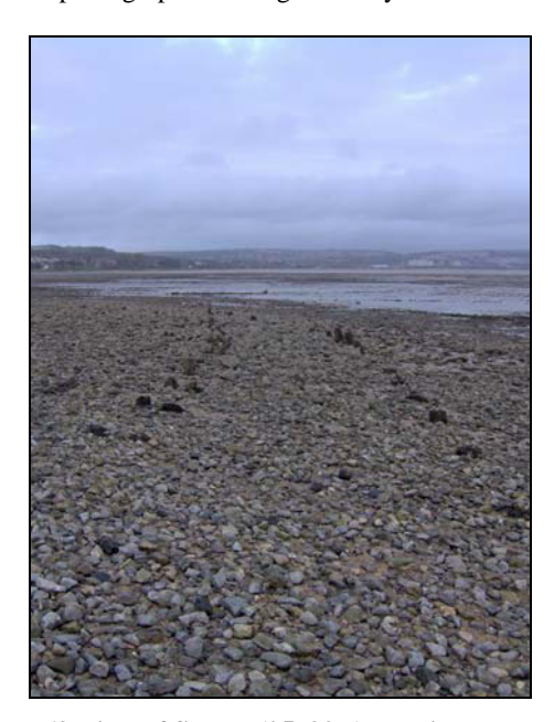
Plate 63 View of Stakes (05799w), looking northeast

The remains of a groyne, depicted on the 2nd edition OS map (1898). It consists of two rows of parallel stakes. The site was visited and photographed during February 2005.