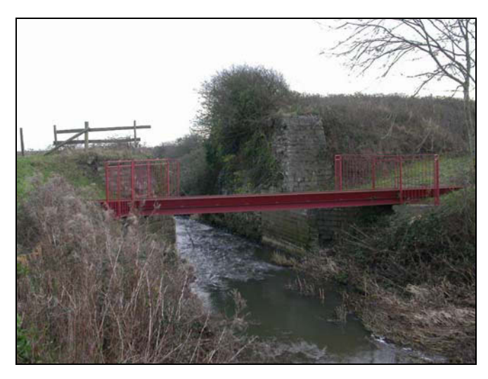
Plate 26 View of Old Peterstone gout (05255g), looking south

A gout in the old sea wall. The site was visited and photographed during February 2005.