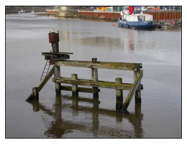
Plate 35 View of Quay? (03989s), looking north

A severely damaged wooden structure on the south bank of the River Ely. The site was visited and photographed during February 2005.