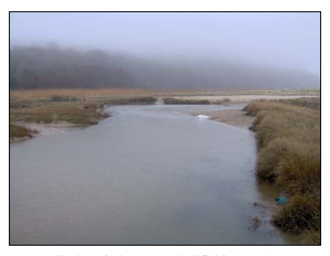
Plate 68 View of Nicholston Pill (05794w), looking east