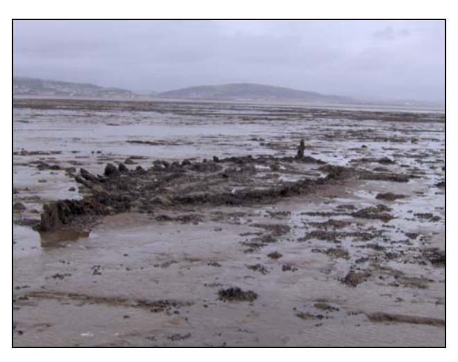
Plate 64 View of Wreck (05800w), looking east

An unidentified wreck located close to a slipway (05798w) and partially covered by sand. It is possible that the vessel is one of the shipwrecks previously identified from documents, and given only a four-figure NGR (see 273575-274344). The site was visited and photographed in February 2005.