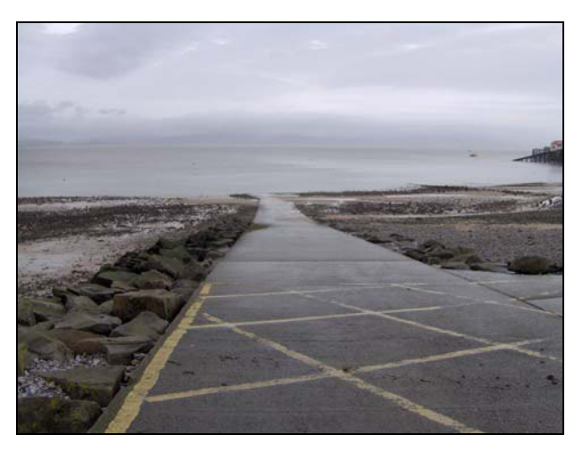
Plate 60 View of Slipway (05796w), looking east

A modern slipway depicted on modern OS maps. The site was visited and photographed during February 2005.