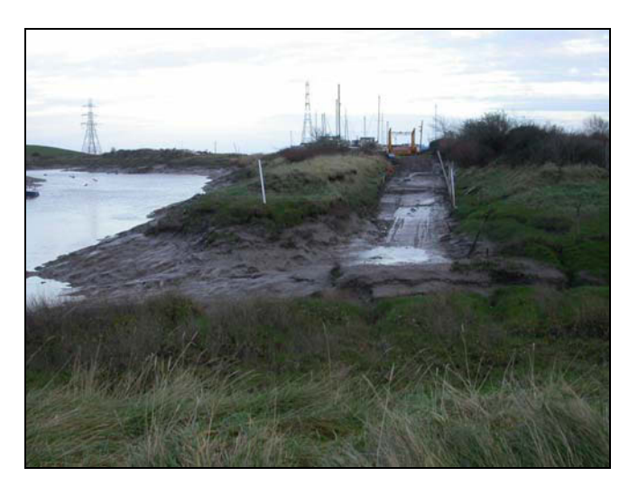
Plate 30 View of Slipway (03990s), looking south

A modern slipway leading from a boatyard on the west bank of the River Rumney, the structure is not depicted on any OS maps. The site was visited and photographed during February 2005.