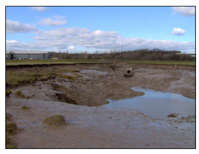
Plate 5 View of Hunger Pill (08901g), looking northwest

Hunger Pill, depicted on the 1st edition OS map (1885). The pill is approximately 270m in length and around 5m wide at its mouth where it opens into the River Wye. The feature is aligned northeast-southwest with several few meanders, and heavy silting was noted. The site was visited and photographed in February 2005.