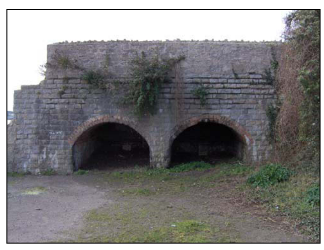
Plate 38 View of adjacent limekilns (03985s), looking southwest

A pair of adjacent limekilns. The site was visited and photographed in February 2005.