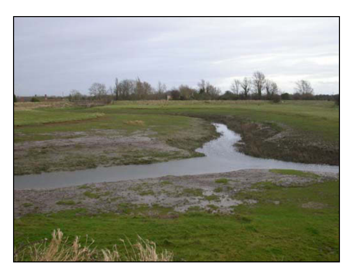
Plate 18 View of Pill (08898g), looking east

An unnamed pill depicted on the 1st edition OS map (1883). The pill is approximately 110m in length and around 4m wide at its mouth where it opens into Goldcliff Pill. The feature is aligned east-west with several meanders. The site was visited and photographed in February 2005.