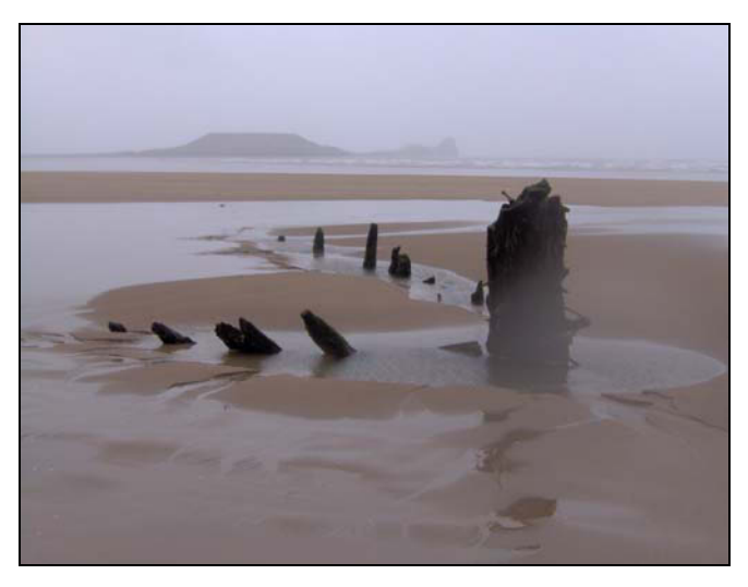
Plate 73 View of The Helvetia (03024w/464), looking south

The most visible shipwreck on Rhossili is that of the Helvetia, a Norwegian Barque that was wrecked on November 1st 1887. The ship was bringing a cargo of 500 tons of timber from New Brunswick to Swansea. The site was visited and photographed in February 2005.