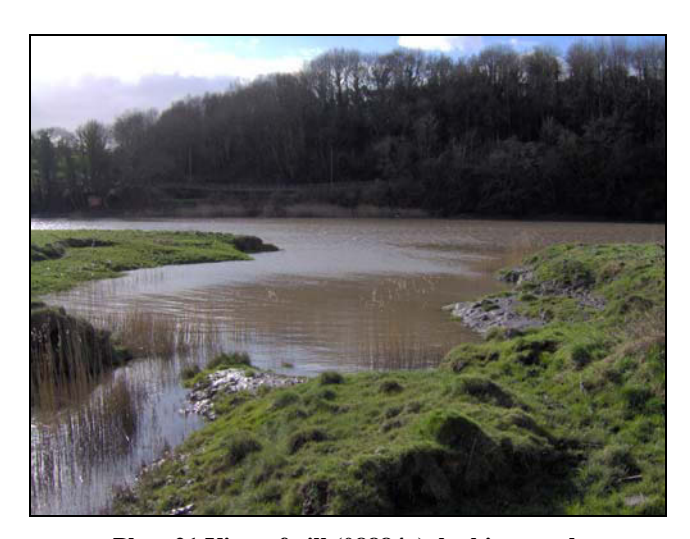
Plate 21 View of pill (08884g), looking south

An unnamed pill which is depicted on the 1st edition OS map (1883). The pill is approximately 80m in length and around 10m wide at its mouth where it opens into the River Usk. The feature is aligned north-south and no meanders were apparent, furthermore no silting was noted. The site was visited and photographed in February 2005.