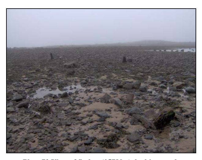
Plate 72 View of Stakes (05789w), looking south

A total of six wooden stakes, roughly arranged into two lines. The timbers protrude approximately 0.65m in height above the ground and on average are 0.30m in diameter. The feature is labelled as 'posts' on the 1st edition OS map (1879). The site was visited and photographed during February 2005.