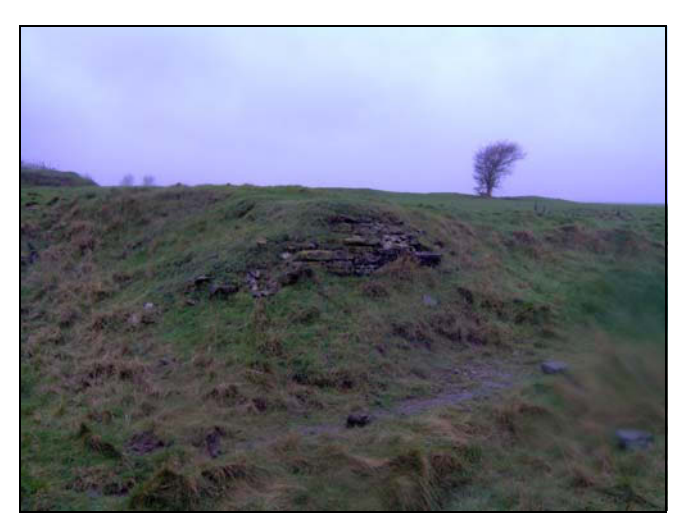
Plate 77 View of Penclawdd Sea Dock (02987.2w/34480/GM398), looking west