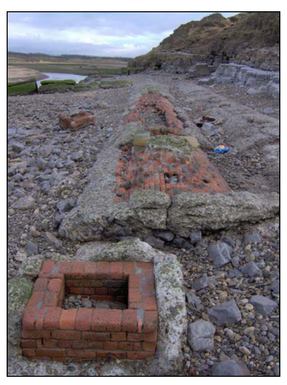
Plate 45 View of Auxiliary Unit 'hide' (05068m), looking northeast

Auxiliary Hides were built in World War 2 to store munitions and be occupied by 'Auxiliary Units, Home Forces' in the case of invasion. They are typically composed of an underground chamber, roofed with corrugated iron; the end walls were brick, with a brick shaft at one end leading to the main entrance, and an escape at the other end with a second brick shaft. In this case, the hide appears to have been camouflaged by covering the hide with concrete that incorporates the local shale.