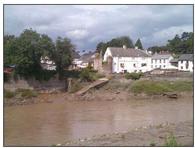
View of a Caerleon slipway with Hanbury Tower behind, looking north

GGAT report no. 2005/039 Project no. GGAT 76