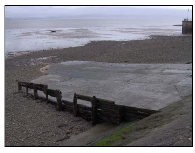
Plate 59 View of Slipway (05795w), looking southeast

A post-medieval slipway, depicted on the 2nd edition OS map (1898). The site was visited and photographed during February 2005.