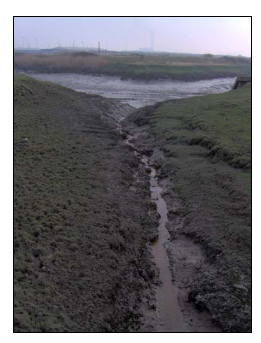
Plate 25 View of Tredegar Pill (08892g), looking southeast

Tredegar Pill is depicted on the 1st edition OS map (1884). The pill is approximately 40m in length and around 1m wide at its mouth where it opens into the River Ebbw and is aligned east-west. The site was visited and photographed in February 2005.