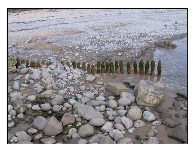
Plate 42 View of a stakes (03984s), looking north