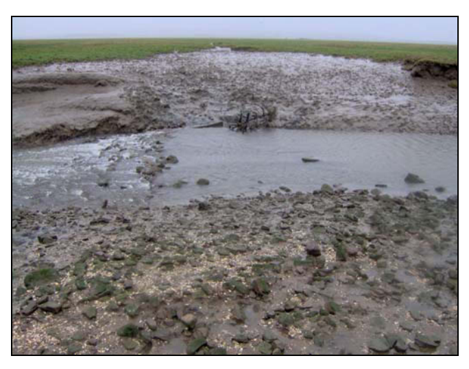
Plate 78 View of possible ford (05787w), looking north

A possible ford not depicted on any OS maps. The site was visited and photographed during February 2005.