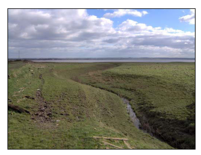
Plate 7 View of Mathern Pill (08903g), looking southeast

Mathern Pill is named on the 1st edition OS map (1891). The pill is approximately 420m in length and around 5m wide at its mouth where it opens into the River Severn. The feature is aligned northwest-southeast and numerous meanders were apparent. The site was visited and photographed in February 2005.