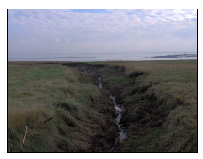
Plate 10 View of Passage Wharf Pill (08883g) with Charston Rock and Lighthouse in the distance, looking southeast

A pill, labelled as 'Lower Pill' on the 1st edition OS map (1881), but as 'Passage Wharf Pill' on the 2nd edition OS map (1902). The pill meanders northwest-southeast and is approximately 330m in length and around 2m wide at its mouth where it opens into the River Severn. The site was visited and photographed in February 2005.