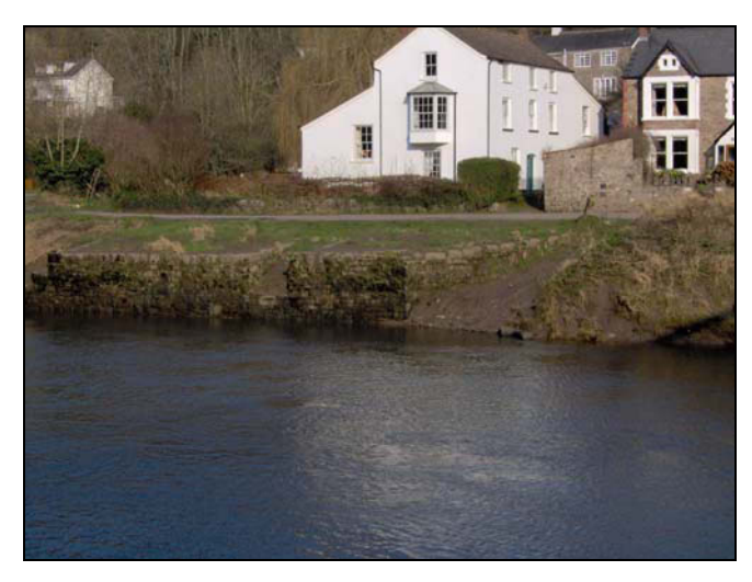
Plate 4 View of Quay (08895g), looking northeast

A quay, depicted on the 1st edition OS map (1879). The site was visited and photographed in February 2005.