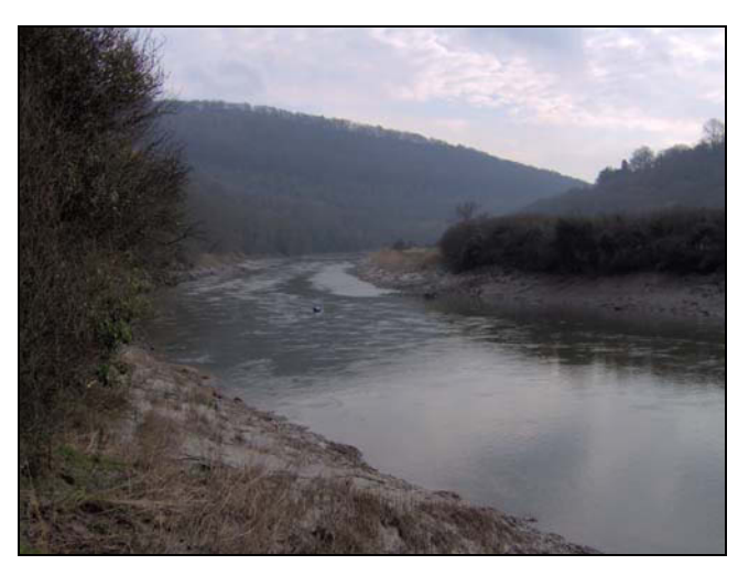
Plate 2 View of Plum Weir (00755g), looking southeast

A medieval weir. The site was visited and photographed in February 2005.