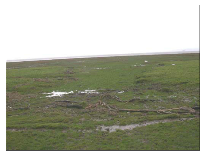
Plate 15 View of Collister Pill (08889g), looking south

Collister Pill is depicted on the 1st edition OS map (1882). The feature is almost completely masked by a build-up of alluvium and only slightly raised areas either side of the pill remain. The site was visited and photographed in February 2005.