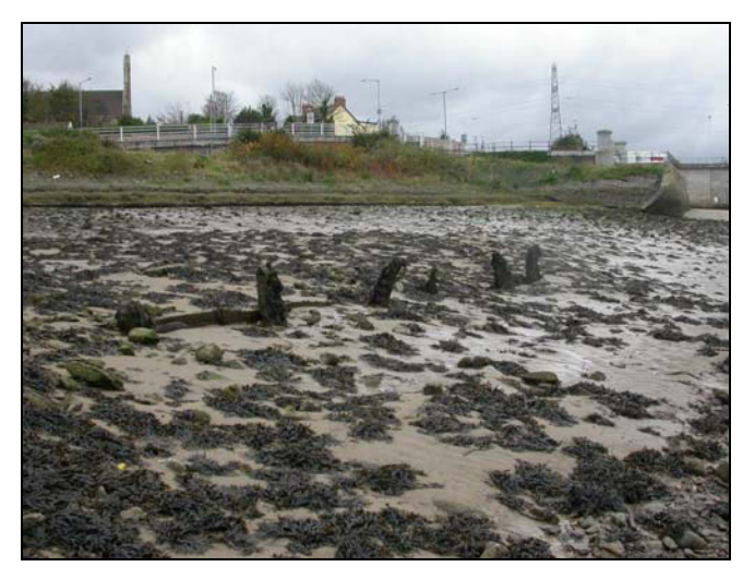
Plate 80 View of Timber revetment (05813w), looking south

A 26.2m long section of timber revetment identified during a site visit on 27/10/2005 as part of the current fieldwork. It comprised twelve uprights, with gaps for two more (one of which was present out of situ ) and horizontal planking on the landward side and extended in a northeast-southwest direction between NGR SS5631398126 and SS5633098146. The two ends were more exposed than the central part of the feature, with a maximum visible height 0.80m at the southwest end and 0.60m at the northeast end. The upright timbers had diameters of approximately 0.25m and their spacing varied between 1.60m and 2.10m apart. The planks were 0.35m wide, but only one line of these was exposed. The timbers showed no obvious signs of being worked, but were covered in a considerable amount of seaweed and barnacles.