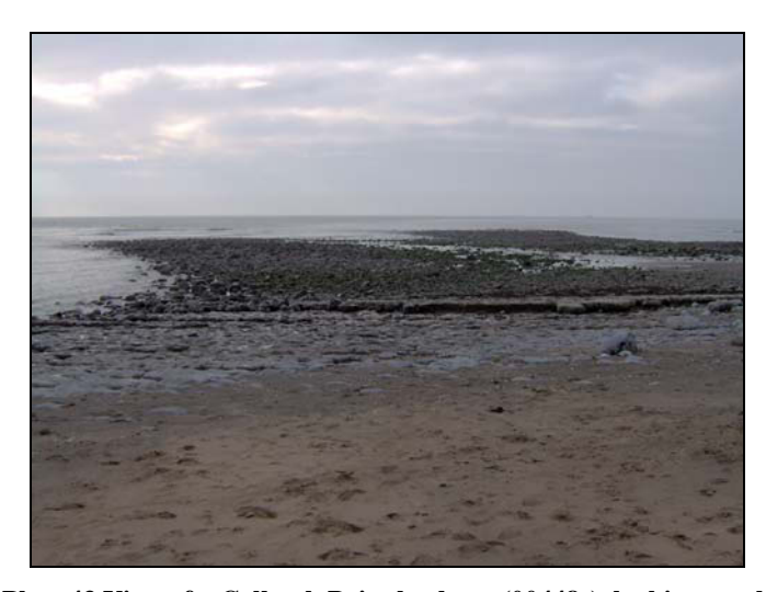
Plate 43 View of a Colhugh Point harbour (00448s), looking south

There are distinct traces of an ancient port or harbour entrance recorded at Colhugh Point. There are 56 eroded, but still substantial, timber posts known locally as 'The Black Man' or 'The Black Boys'. The average width of the posts is 0.3m and they are spaced between 0.1m and 0.7m apart. The timber has been dated to the 13th century and whilst they may be remnants of a harbour, they are more likely to be a 'weirplace' used to catch fish on the incoming tide. There is also a linear feature to the east of the Black Boys, which may be the remnants of the harbour. It is composed of 208 stone blocks, which form a protective curve against the prevailing southwesterly winds and waves. The site was visited and photographed in February 2005, although no structures were visible.