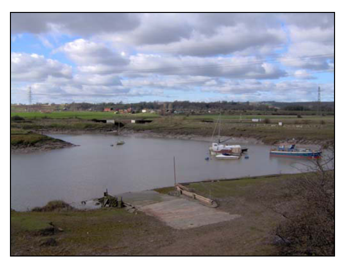
Plate 6 View of Harbour (01154g), looking northwest

The site of a harbour of unknown date. The area is still used to moor boats and a modern slipway is visible. The site was visited and photographed in February 2005.