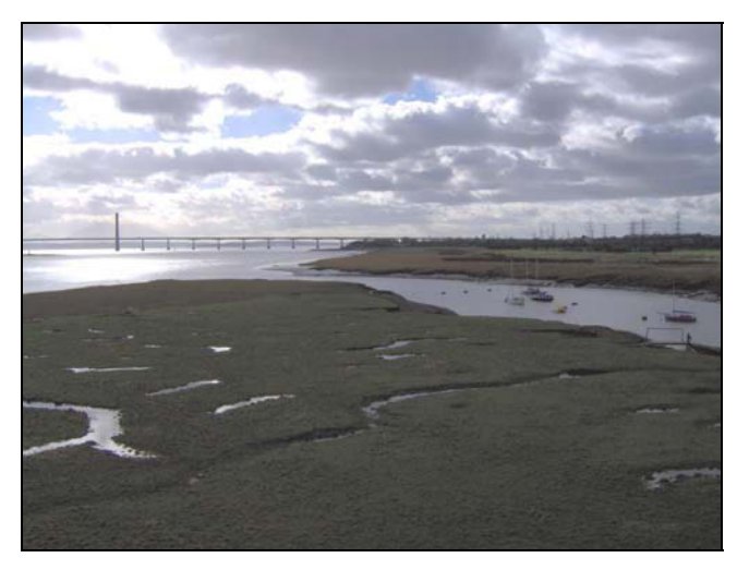
Plate 9 View of St Pierre Pill (08905g), looking southwest

St Pierre Pill is depicted on the 1st edition OS map (1891). The pill is approximately 250m in length and around 15m wide at its mouth where it opens into the River Severn, although it extended much further inland prior to the construction of the railway line, which narrowed the watercourse at this point. The feature is aligned north-south. The site was visited and photographed in February 2005.