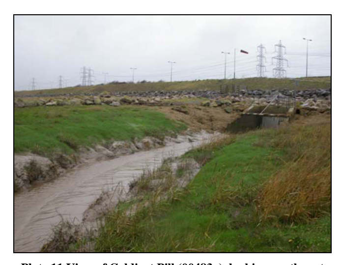
Plate 11 View of Caldicot Pill (00483g), looking northwest

The mouth of Caldicot Pill (formerly known as the Troggy) is much silted and is confined to a single channel by a modern seawall. Whilst there are no surviving indications of its use as a harbour, it is recorded that Brochmael son of Meyric, King of Gwent in the early 10th century, made a grant to the church at Llandaff, which included landing rights at the mouth of the Troggy. As the record states it was an old established harbour, it may date back as far as the Roman period, and it has been suggested that it was the landing place for the crossing from the end of the Via Julia at Avonmouth. An 18th-century map of the area indicates that the Troggy originally meandered further to the east, and was diverted to its present course towards a shipyard, where it was used to float vessels. No features were visible when the site was visited in February 2005. It is likely that any remains on the harbour site were damaged during the construction of the M4 motorway and Pill Farm Industrial Estate.