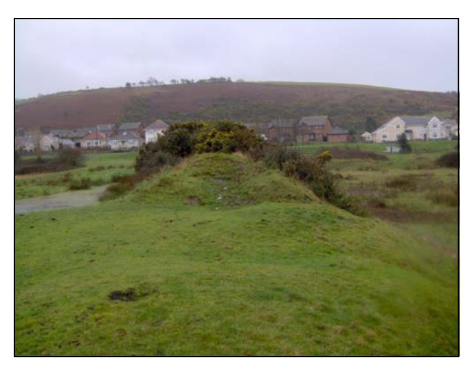
Plate 76 View of Penclawdd Sea Dock (02987.2w/34480/GM398), looking southeast

The well preserved remains of a tidal dock, which once served the Penclawdd Canal. The remains consist of a jetty, a breakwater and the remnants of the canal itself. The site was visited and photographed during February 2005.