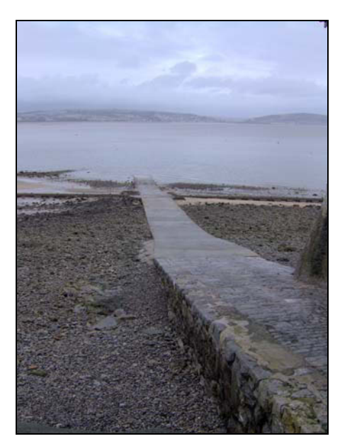
Plate 61 View of Slipway (05797w), looking east

A post-medieval slipway, depicted on the 1st edition OS map (1881). The site was visited and photographed during February 2005.