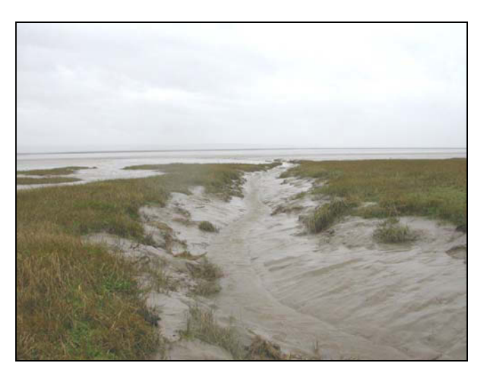
Plate 12 View of Caldicot Pill (00483g), looking south