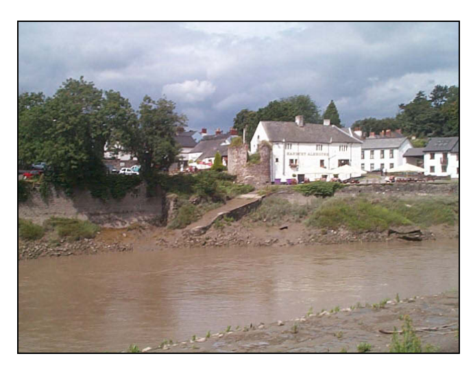
Plate 22 View of slipway (08885g) with Hanbury Tower (00543g/94870/MM037) behind, looking north

A post-medieval slipway situated close to the medieval Hanbury Tower (00543g/94870/MM037), which itself is adjacent to the Hanbury Arms public house. Due to the proximity of this section of the riverbank to the Hanbury Tower, it is considered possible that that the area was utilised as a harbour during the medieval period. The site was visited and photographed in February 2005.