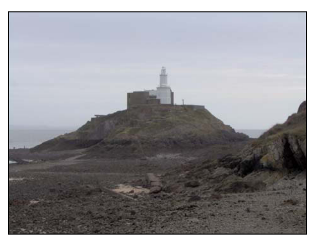
Plate 58 View of Mumbles Lighthouse (00828w/180), looking south

The lighthouse erected in 1793 by the industrialist architect William Jernegan. The design consists of two octagons set within each other and separated by a stairway. Two coal-fired lights were used to differentiate the light from nearby Flatholm lighthouse. The site was visited and photographed in February 2005.