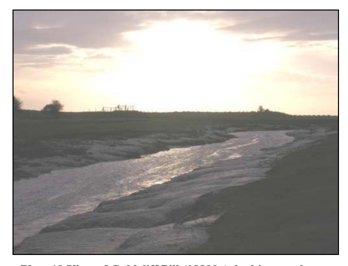
Plate 19 View of Goldcliff Pill (08899g), looking southwest

Goldcliff Pill is depicted on the 1st edition OS map (1883). The pill is approximately 1200m in length and around 10m wide at its mouth where it opens into the River Severn. The feature is aligned northeast-southwest and numerous meanders were apparent, some silting was also noted. The site was visited and photographed in February 2005.