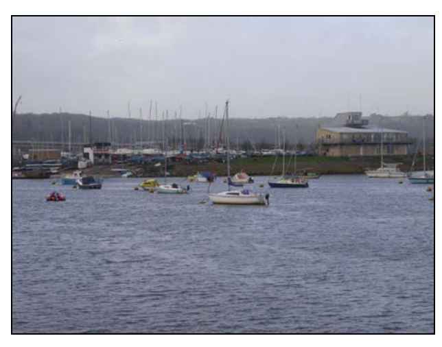
Plate 32 View of Ferry (02731s), looking north

The site of a post-medieval ferry across the Ely.