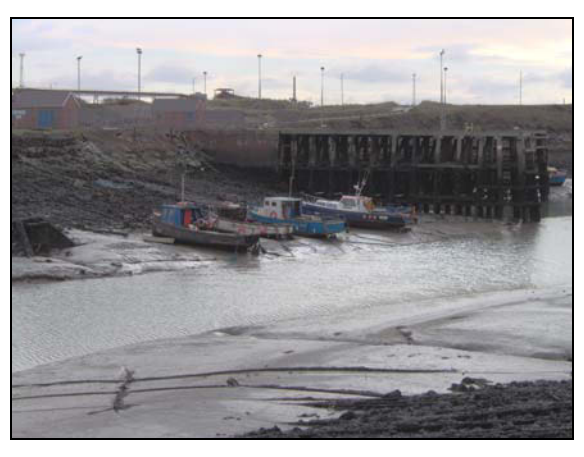
Plate 49 View of Port Talbot lock (03124w), looking northeast

A post-medieval lock depicted on the 1st edition OS map. The site was visited and photographed in February 2005.