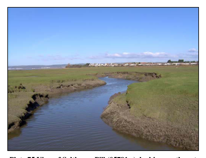
Plate 75 View of Salthouse Pill (05791w), looking northwest

Salthouse Pill is depicted on the 1st edition OS map (1879). The pill is approximately 2km in length and around 15m wide at its mouth where it opens into the River Loughor. The feature is aligned roughly northwest-southeast with numerous meanders. The site was visited and photographed during February 2005.