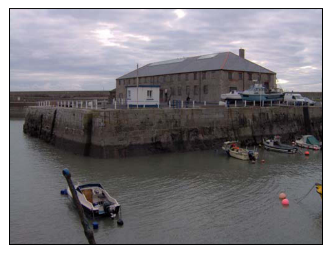
Plate 46 View of Porthcawl harbour (02537m/34275), looking south

A post-medieval harbour, built by 1811. It is still in used by both leisure and fishing vessels, and is protected as a listed building. The site was visited and photographed during February 2005.