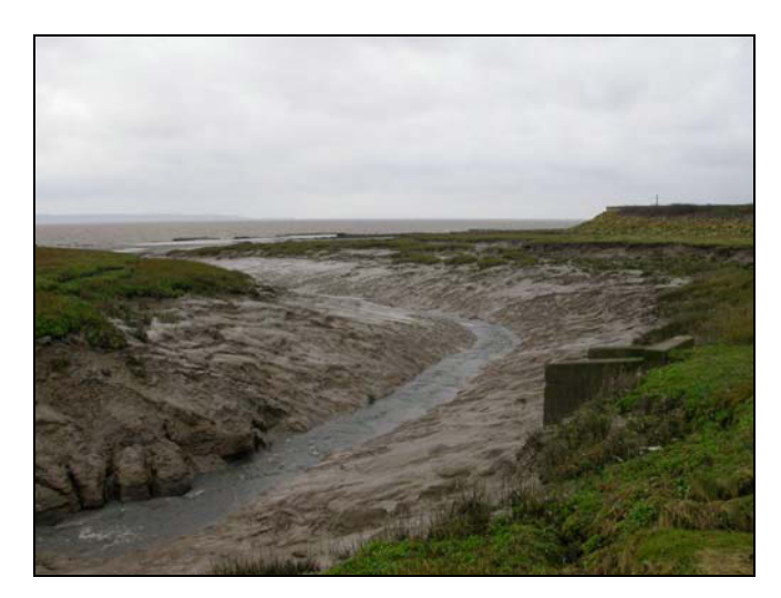
Plate 16 View of Magor Pill (08902g), looking south