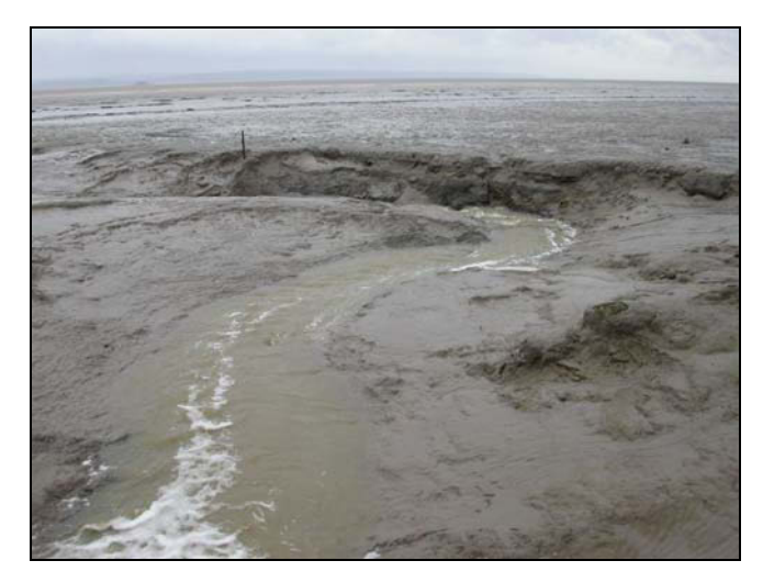
Plate 13 View of West Pill (08896g), looking south

West Pill, which is probably the site of Westhowcke mentioned by Lewis (1927, 320), is depicted on the 1st edition OS map (1882). The pill is approximately 80m in length and around 2m wide at its mouth where it opens into the River Severn. The feature is aligned northwest-southeast with numerous meanders and heavy silting was also noted. The site was visited and photographed in February 2005.