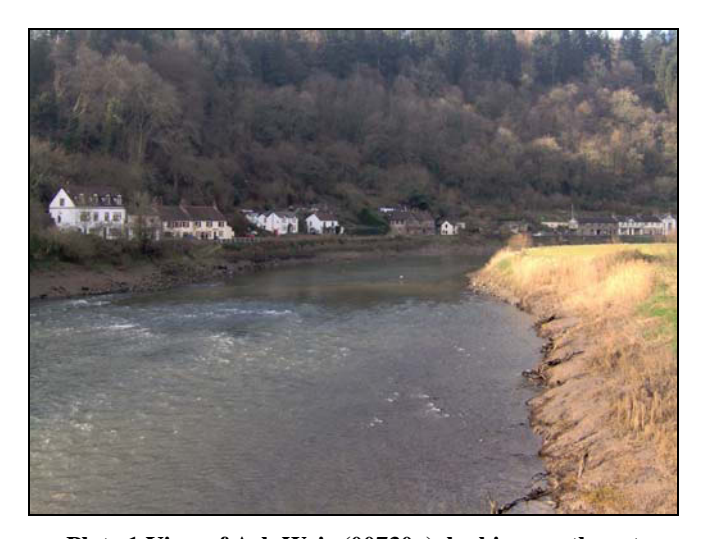
Plate 1 View of Ash Weir (00730g), looking northwest

A medieval weir. The site was visited and photographed in February 2005.