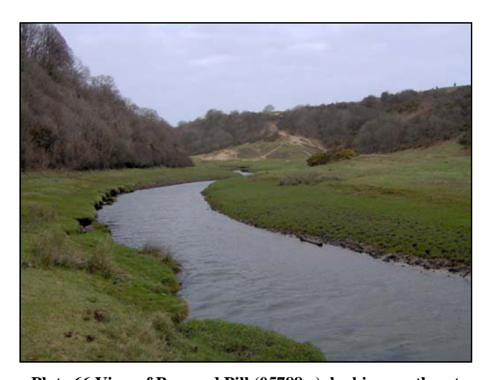
Plate 66 View of Pennard Pill (05788w), looking northeast

Pennard Pill depicted on the 1st edition OS map (1878). The pill is approximately 600m in length and it meanders north to south across Threecliff Bay; it is around 20m wide at its mouth where it opens into the Bristol Channel. The site was visited and photographed during February 2005.