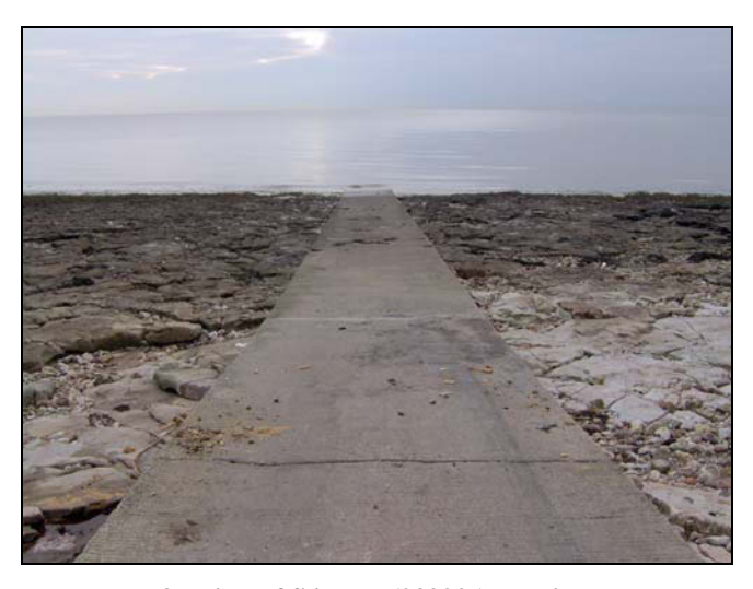
Plate 37 View of Slipway (03992s), looking south

A modern slipway depicted on OS maps. The site was visited and photographed during February 2005.