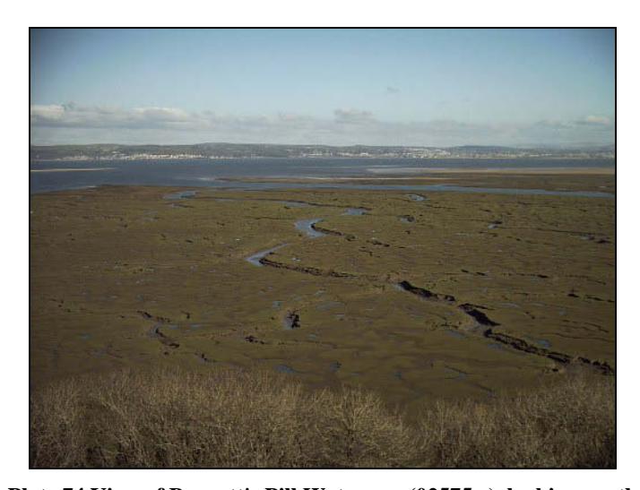
Plate 74 View of Bennett's Pill Waterway (02575w), looking north

Bennet's Pill is located on the marsh immediately to the north of Landimore running southeast-northwest before turning to the north to run out into the estuary. The pill is approximately 800m in length and around 15m wide at its mouth. Numerous meanders were apparent, and moderate silting was noted. The site was visited and photographed in February 2005.