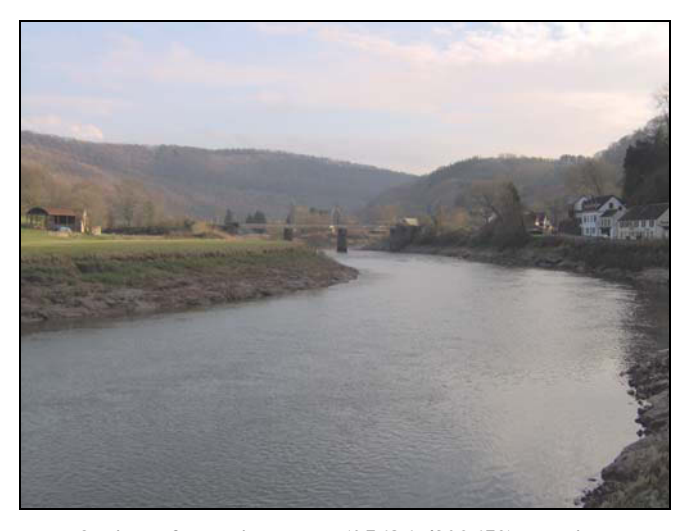
Plate 3 View of Floating Dock (05686g/309652), looking south

The total length of the dock, between the rear, west wall and the dock gates recorded as 47m. The width was difficult to determine along the entire length due to the continuing erosion of the tide, but at its widest point in the west it was 6.6m wide and this narrowed to 5.5m wide between the dock gate settings. This reduction in width appears to start where the wheel pit and its associated culvert begins, just to the east of the Abbey Mill boat house. The base of the dock is cut into the bedrock and the outfall drops down to low tide level of the River Wye. The site was in-filled in 1997, as part of the Tintern flood alleviation scheme. The site was visited and photographed in February 2005.