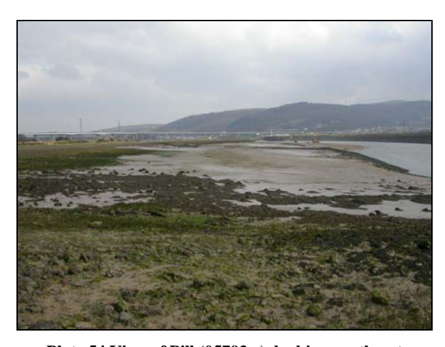
Plate 54 View of Pill (05793w), looking northeast

An unnamed pill, depicted on the 3rd edition OS map (1918). The site was visited and photographed in February 2005. The pill is relatively short and broad, and it is aligned northeast-southwest. The feature is approximately 500m in length and around 40m wide at its mouth where it joins the River Neath.