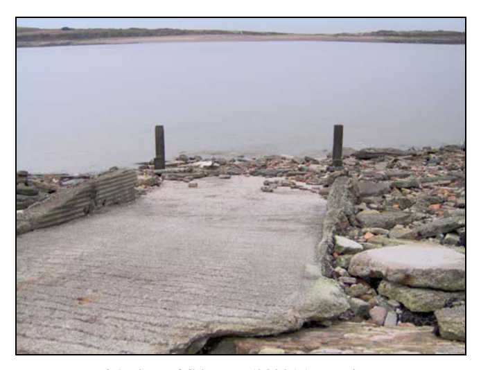
Plate 36 View of Slipway (03991s), looking south

A modern slipway depicted on OS maps. The site was visited and photographed during February 2005.