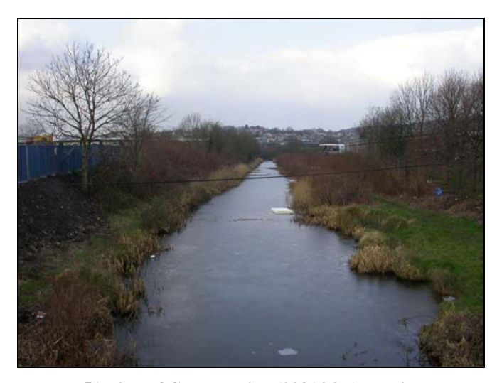
Plate 51 View of Canal cutting (02814.0w), looking west

A stretch of the Tennant canal with a bridge, southwest of Neath Abbey. As the subsoil along the route of the canal was composed of such soft sand, the canal bottom was constructed of masonry. The site was visited and photographed in February 2005.