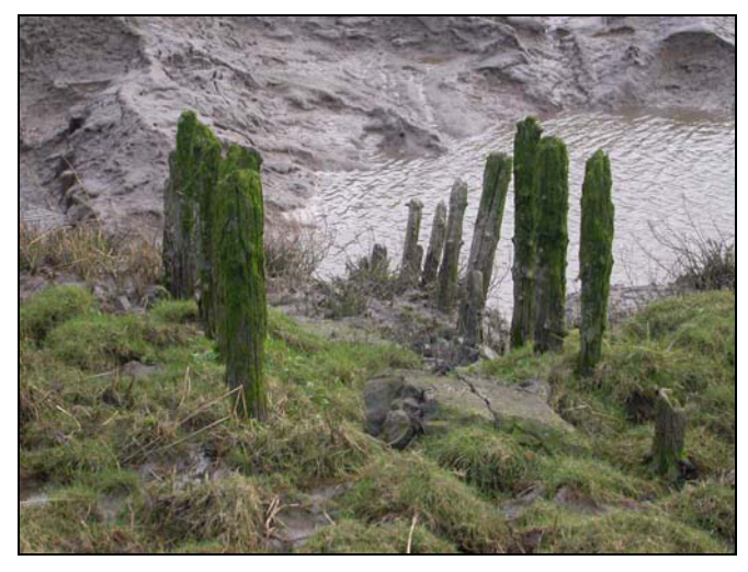
Plate 28 View of Stakes (08893g), looking south