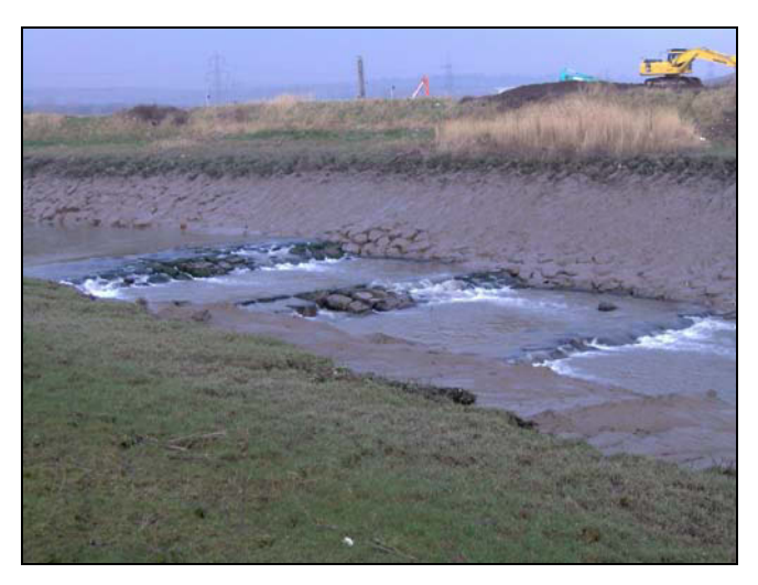
Plate 24 View of Weir (08891g), looking northeast

Full Description A post-medieval weir. The site was visited and photographed in February 2005.