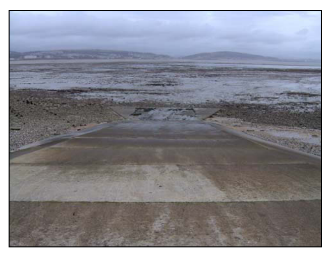
Plate 62 View of Slipway (05798w), looking east

A slipway depicted on modern OS maps. The site was visited and photographed during February 2005.