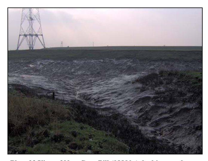
Plate 23 View of New Gout Pill (08890g), looking southwest

New Gout Pill is depicted on the 1st edition OS map (1883). The pill is approximately 280m in length and around 5m wide at its mouth where it opens into the River Ebbw. The feature meanders in an eastwest direction, and heavy silting was noted along the channel. The site was visited and photographed in February 2005.