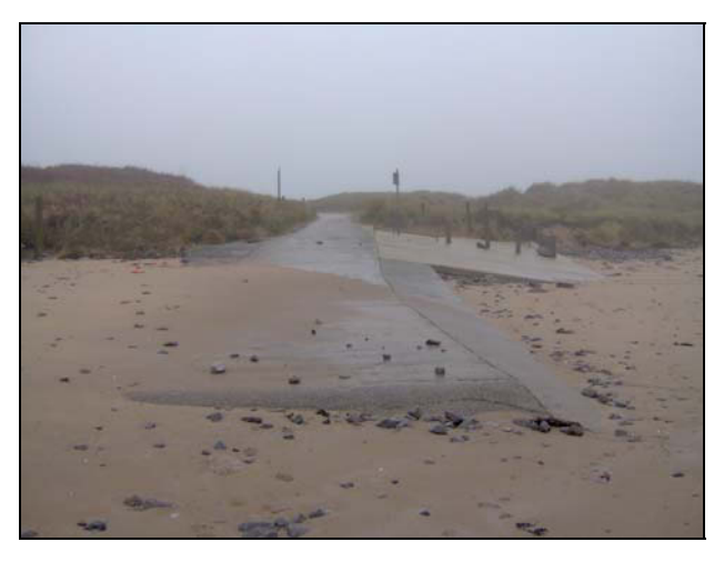
Plate 71 View of Slipway (05790w), looking northwest

A modern slipway depicted on OS maps. The site was visited and photographed during February 2005.