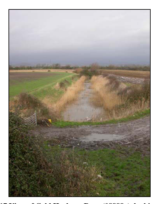
Plate 17 View of Cold Harbour Reen (08888g), looking north

Cold Harbour Reen, depicted on the 1st edition OS map (1882). The site was visited and photographed in February 2005.