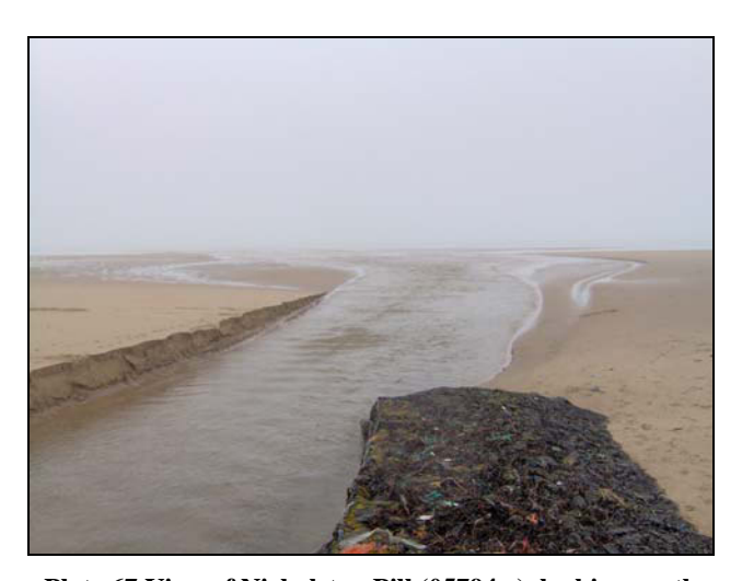
Plate 67 View of Nicholston Pill (05794w), looking south