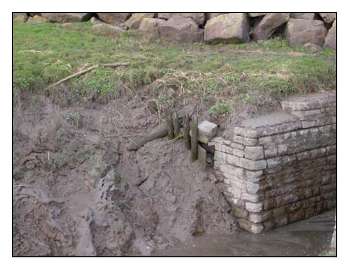
Plate 29 View of opening to New Quay gout (08894g) and wooden posts, looking northeast

New Quay Gout, depicted on the 1st edition OS map (1883). The site was visited and photographed during February 2005. A series of associated wooden posts running perpendicular to the gout were also observed.