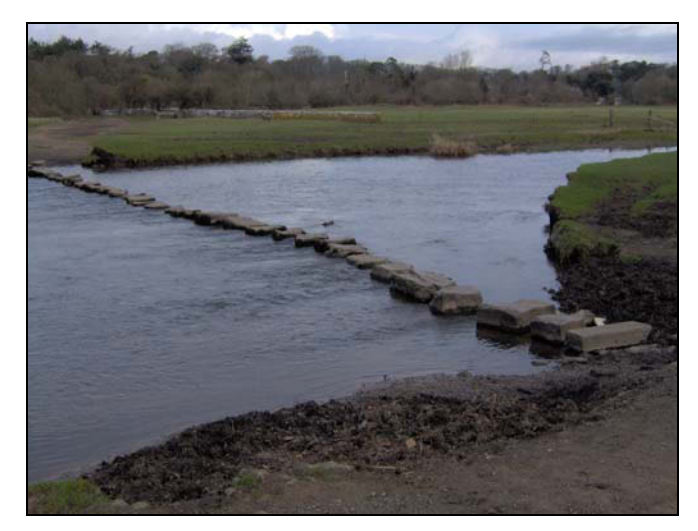
Plate 44 View of Stepping stones (00273m/32814/GM184), looking north

The stones, 33 in number, are rectangular and cubic blocks with sides up to 1m in length. The site was visited and photographed during February 2005.