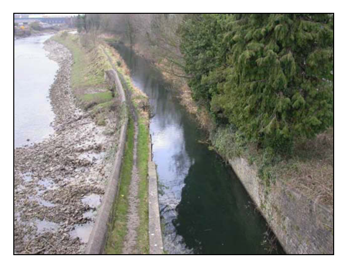
Plate 50 View of Neath Canal (01027.0w/34444/GM394), looking southwest

The Neath and Tennant (01070.0w) Canals provided twenty-one miles of waterway from Aberdulais to Swansea and from Glynneath to Briton Ferry. The two canals were built separately, the Neath Canal under Acts of Parliament of 1791 and 1793. The site was visited and photographed in February 2005.