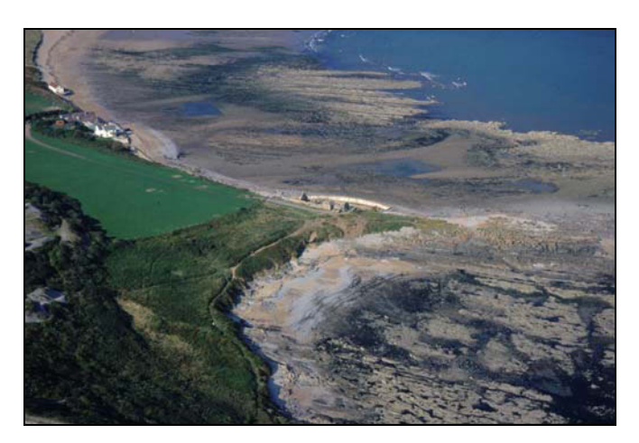
Plate 70 Aerial photograph of the Port Eynon, with Salthouse (00192w/182/GM471) in centre, looking northeast, courtesy of Roger Parmiter