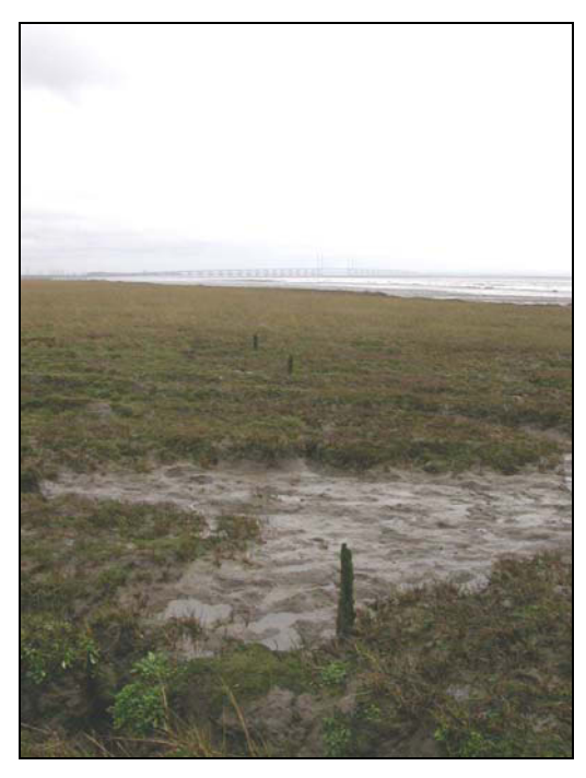
Plate 14 View of Stakes (08897g), looking northeast

A single line of wooden stakes, roughly 0.75m visible above the ground. On average the stakes are 0.15m in diameter. The site was visited and photographed in February 2005.