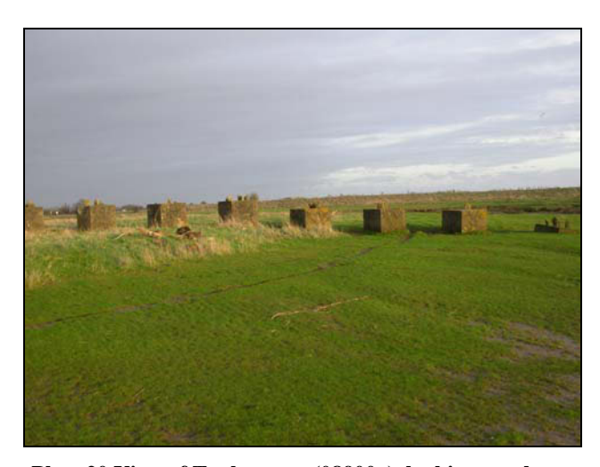
Plate 20 View of Tanks traps (08900g), looking northeast

A series of modern tank traps arranged across Goldcliff Pill. The site was visited and photographed in February 2005.