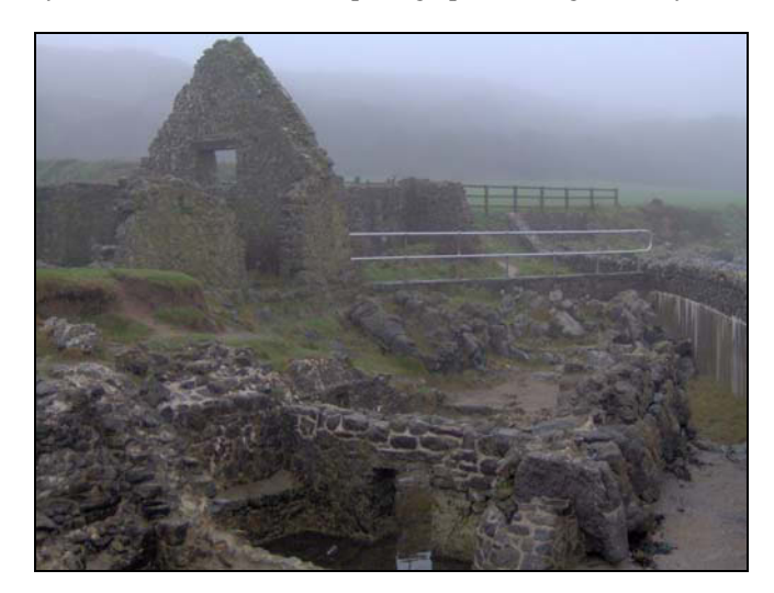
Plate 69 View of Port Eynon Salthouse (00192w/182/GM471), looking northwest

Situated on Port Eynon Point overlooking the bay are the ruins of a building known as 'The Salt House' (Wilkinson et al 1998). The structure consists of three masonry-lined chambers set into the beach. The largest measures 20m by 3m, with walls up to 1.8m thick. Documentary evidence suggests that the site was initially occupied in the 16th century as a fortified base for one John Lucas and his piracy and smuggling activities. There was certainly a reference in a survey of the Gower in 1697, to a saltworks being in existence for at least 40 years. The site was abandoned and fell into disrepair after a storm in the early 18th century. The site was visited and photographed during February 2005.