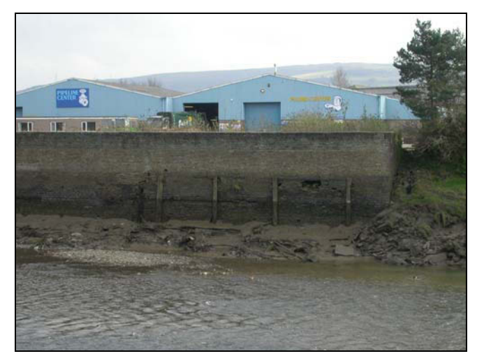
Plate 56 View of Neath town quay (05793w), looking south

A post-medieval quay, no further information available. The site was visited and photographed during February 2005.