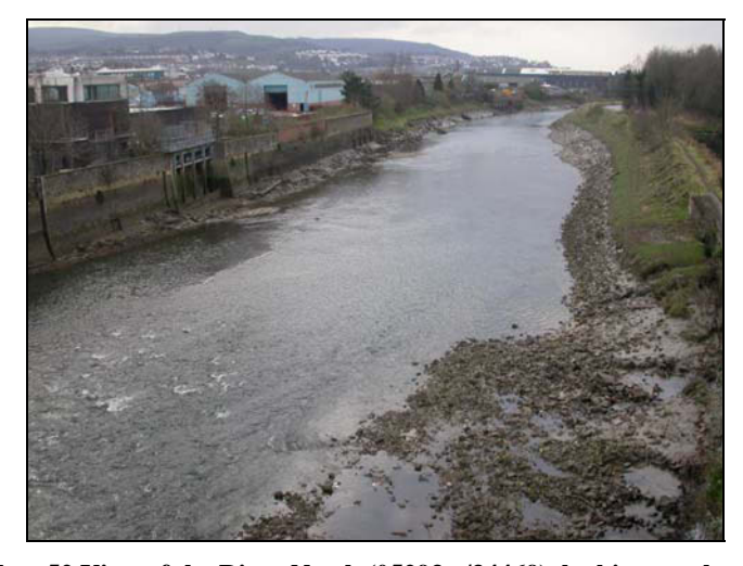
Plate 52 View of the River Neath (05293w/34469), looking southwest

The River Neath has changed its course many times throughout history. There is a record as early as 1249 of a dispute between Lord Leison ap Margam ap Caradoc and Neath Abbey caused by the river, which marked the boundary between their estates, having changed its course. The frequent movements of the river have caused the periodic destruction of many of the former ground surfaces of the valley bottom and their replacement with new sediments. The frequent flooding of the area will also have caused the deposition of considerable quantities of silt. This has been borne out by the evidence from boreholes. The site was visited and photographed during February 2005.