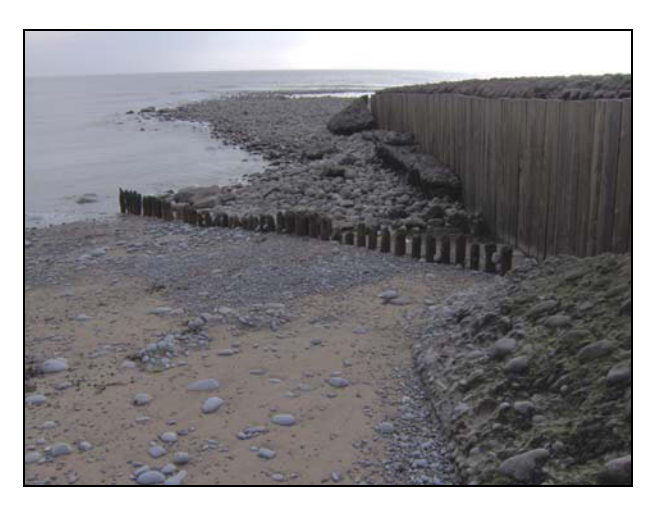
Plate 41 View of a stakes (03984s), looking south

A line of 29 rounded wooden stakes. The group is aligned northwest/southeast and the stakes average 0.25m in diameter. The site was visited and photographed in February 2005.