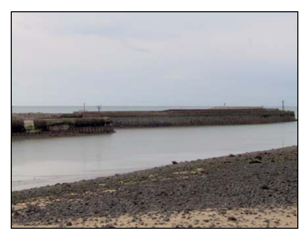
Plate 48 View of the Port Talbot breakwater (03123w), looking south

A post-medieval breakwater depicted on the 1st edition OS map (see PRN 04726w). The site was visited and photographed in February 2005.