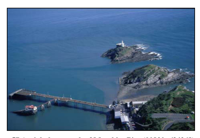
Plate 57 Aerial photograph of Mumbles Pier (00820w/34268) and Lighthouse (00828w/180), looking south

A post-medieval pier. The site was visited and photographed during February 2005.