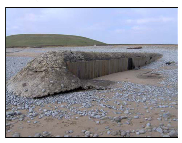
Plate 40 View of a groyne (03983s), looking northwest

A series of 21 post-medieval groynes noted during the site visit and photographed in February 2005.