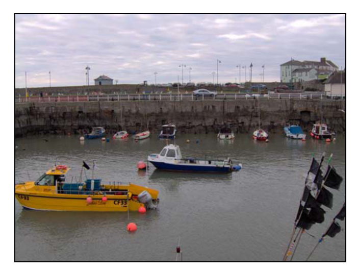
Plate 47 View of Porthcawl harbour (02537m/34275), looking west