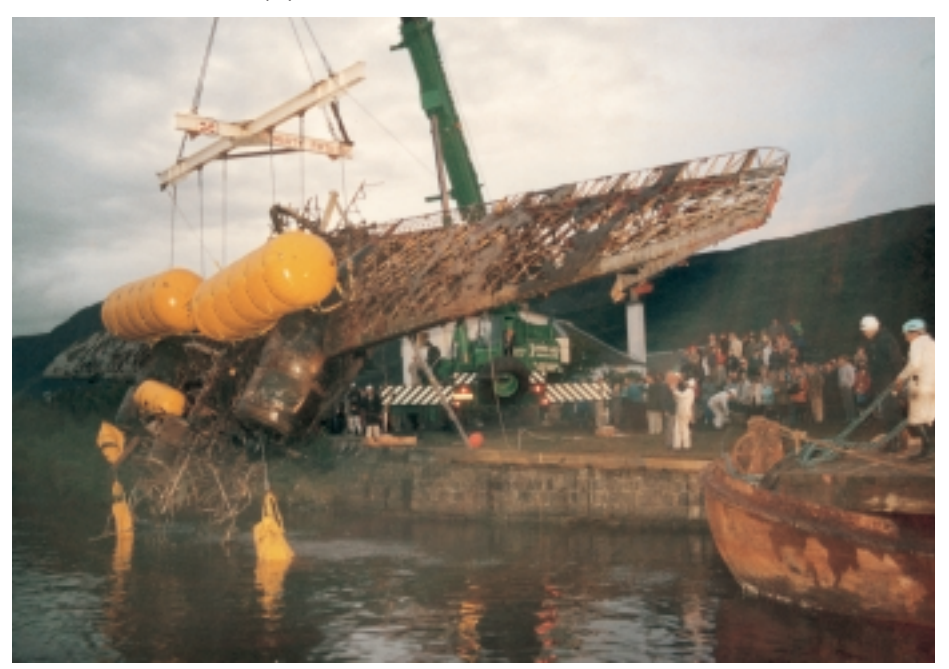
Submerged crash sites perhaps offer the best potential for the future. The remains of a Wellington bomber which crashlanded in Loch Ness on New Year's Eve 1939 are seen here being recovered in 1985. Carefully restored, the aircraft is now displayed at Brooklands Museum and is one of only two complete Wellingtons known to survive out of a total production run of 11,500.