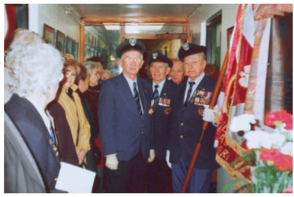
Crash sites are places of loss and commemoration. In 1980 building work for a school-based community centre in Wigston, Leicestershire, uncovered the remains of a Polish Air Force Avro Lancaster which had crashed on the site in 1946, killing the crew. Today, a memorial plaque in the school is the focal point for an annual service conducted by members of Leicester's large Polish community.

wishes to minimise the potential risks to excavators and has a moral obligation to the families of dead servicemen to protect their relatives' remains from disturbance, hence applications for a licence to excavate will be refused where there is a risk that such operations may disturb either ordnance or human remains. Even where a licence is granted, however, aircraft wreckage may include items of equipment other than weapons and ammunition that can pose a potential danger, even though they were not regarded as hazardous when the aircraft was lost. For example, the dials of many aircraft instruments were painted with radium-based luminous paints; instruments so treated are now regarded as posing a significant radiological hazard. A note of guidance, available on application