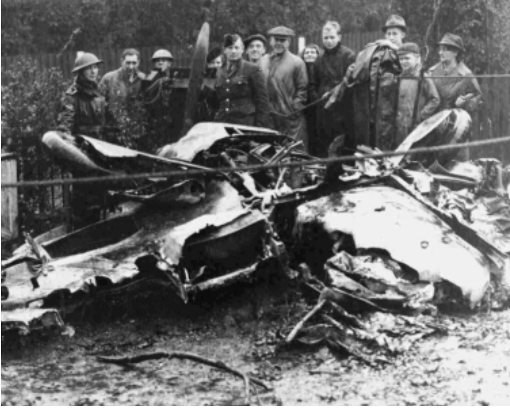
Civilians and an RAF guard gather around the wreckage of a Luftwaffe Messerschmitt 109 fighter which broke up in midair and fell on a London street during the Blitz. After being assessed for intelligence purposes, most such wreckage was sent for scrap.

Crash sites constitute a unique archive of World War II and earlier military aircraft. Many aircraft preserved in museums have either undergone major restoration or are late production models which have been converted to resemble