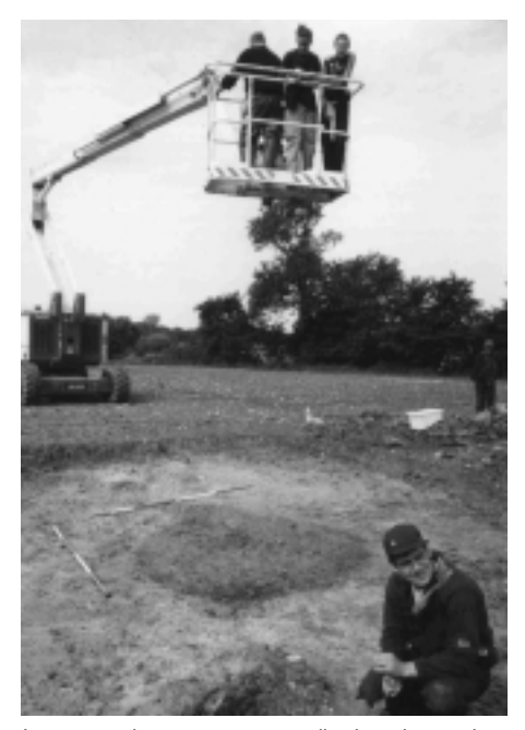
In exceptional circumstances, normally where the speed and angle of impact caused the wreckage to be buried at much greater depths, lowland crash sites may yield much information. The dark circular patch in the centre of the photograph is the entry hole created by a Supermarine Spitfire hitting the ground vertically at a speed of 400 mph. Although the wings broke off on impact, subsequent excavation recovered the complete fuselage, from engine to tail section, compacted from 9m to less than 1.5m.