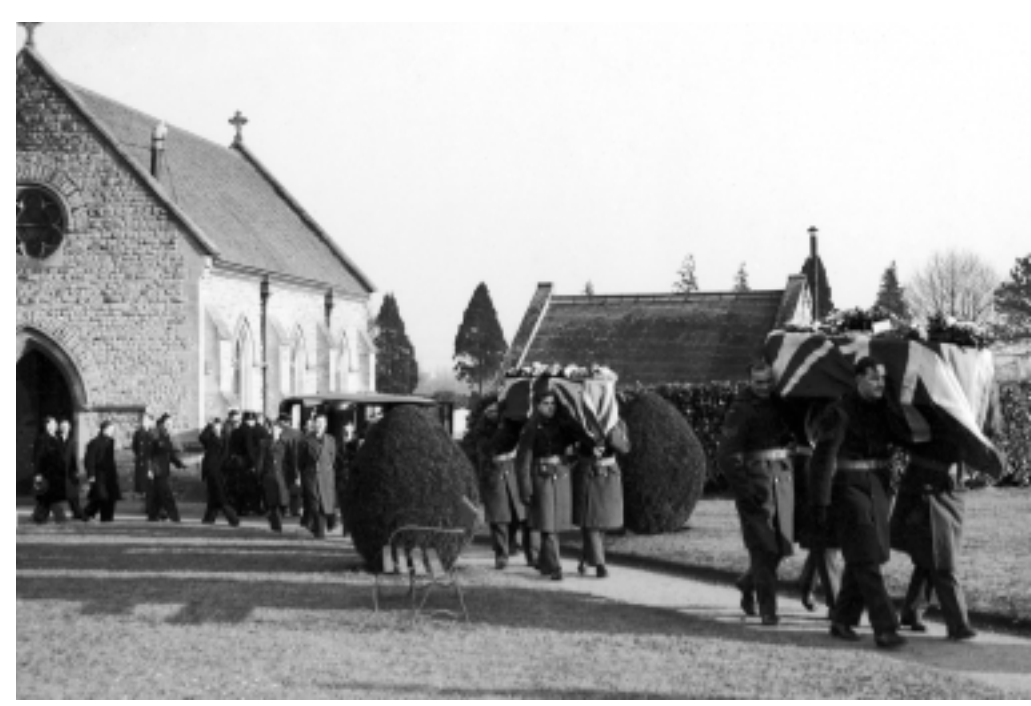
Many crashes involved fatalities. It is estimated that in the region of 80,000 aircrew of all nationalities were killed flying from or over the UK during WWII. Not all of these losses occurred as a result of combat; RAF Bomber Command alone lost 8,000 aircrew in training accidents. The photograph shows a common wartime scene: RAF aircrew from a Midlands-based Operational Training Unit being buried with full military honours

In many cases investigation may reveal nothing more than small surface scatters of debris. In others, however, substantial pieces including engines, portions of airframes and the equipment and effects of crew members may survive. At a very few sites – chiefly those in inaccessible areas such as mountains, marshland or inter-tidal zones – large components still lie where they fell.