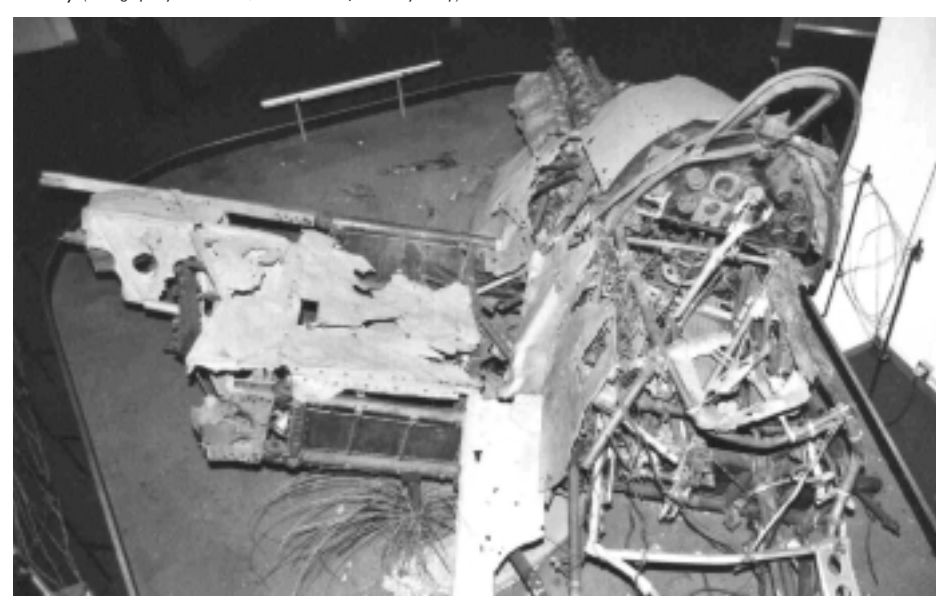
Under certain circumstances, preservation in tidal or inter-tidal zones can be exceptional. The cockpit, centre section and Merlin engine of this Hawker Hurricane, a casualty of the Battle of Britain, were recovered from the beach at Walton on the Naze in Essex, and are now on display at the RAF Museum, Hendon.