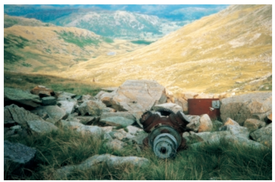
Propeller stubs and reduction gear (above) and remains of a wing section (below) from a Halifax that crashed in the Lake District in 1944. Although much depleted by souvenir hunting and recovery, upland crash sites represent the only places in England where recognisable or substantial remains still lie intact on the surface.

Some crash sites are visible, for example as spreads of wreckage within upland environments, or are exposed at low tide. In most cases, however, a scatter of surface debris may mask larger deposits, often buried at great depth. The initial impetus for recoveries comes from both eyewitness reports and documentary research. The debris field can be located by systematic walking across ploughed fields to identify surface concentrations of wreckage or with a magnetometer to assess the extent of buried remains, on the basis of which a point or points of impact can be estimated. Given the potential weight of the components, and their depth, excavation is often carried out using mechanical excavators.