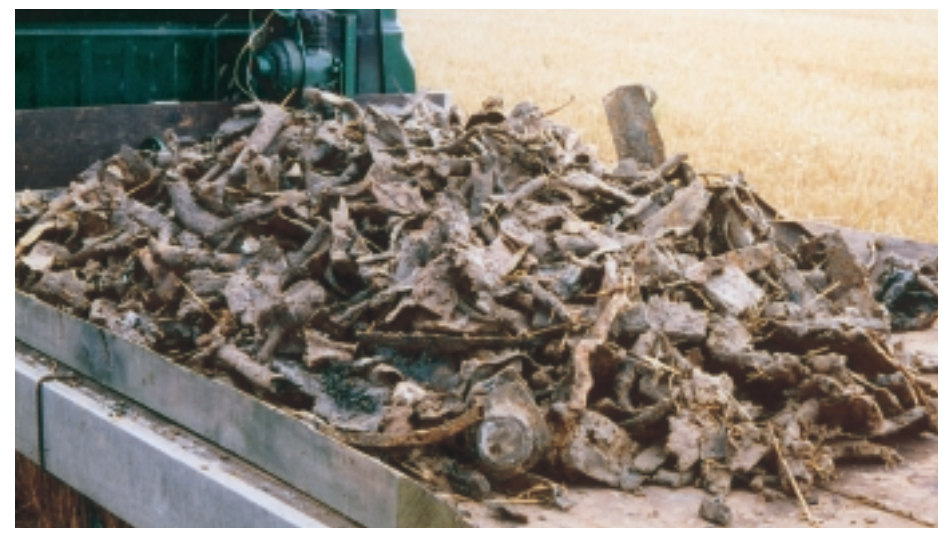
Because of contemporary recovery operations and subsequent agriculture, survival at most lowland crash sites will often consist of nothing more than a surface scatter of debris. The wreckage in the illustration — all that remains of a Vickers Wellington bomber weighing 12,000kg — represents the result of a careful magnetometry survey followed by systematic recovery.