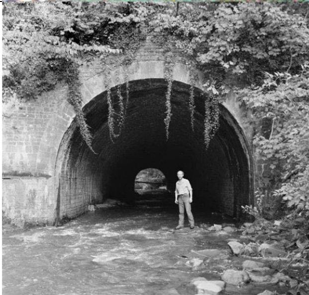
Clydach side.

Generally sound but a detailed survey should be carried out at regular intervals – say five years or after exceptional flows.