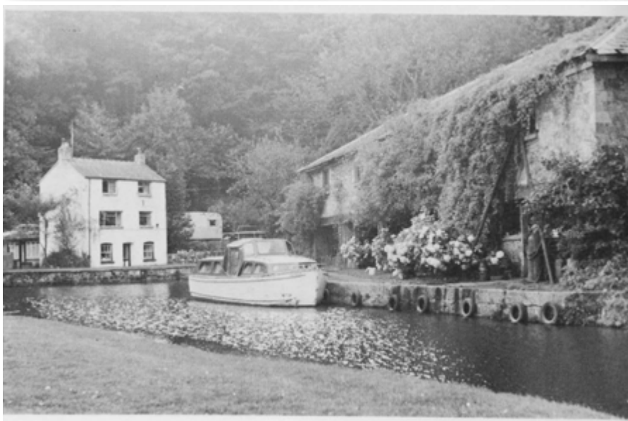
Stevens Pl 28