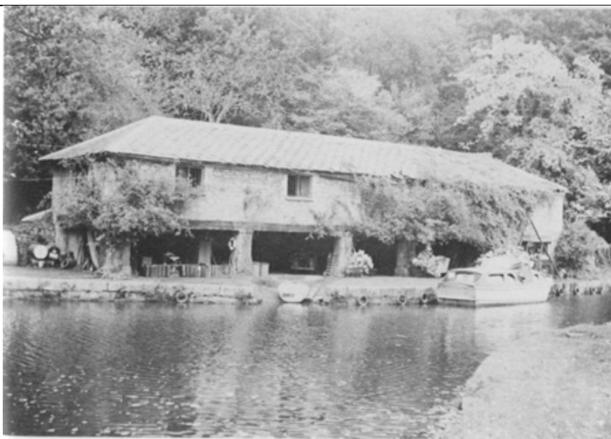
Stevens Pl 30