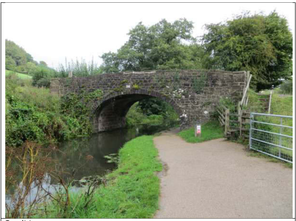
Condition: Sound but a detailed survey desirable. Significant colonisation by plants.