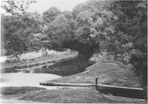
Plate 25 The dry dock at Govilon with the river aqueduct in the background. There are stop plank grooves in the left foreground and a drain paddle for the dock in the right foreground. The water drains through a culvert to the river near the aqueduct. Note the windlass to the left of the paddle for lifting a drain plug from the bed of the canal.