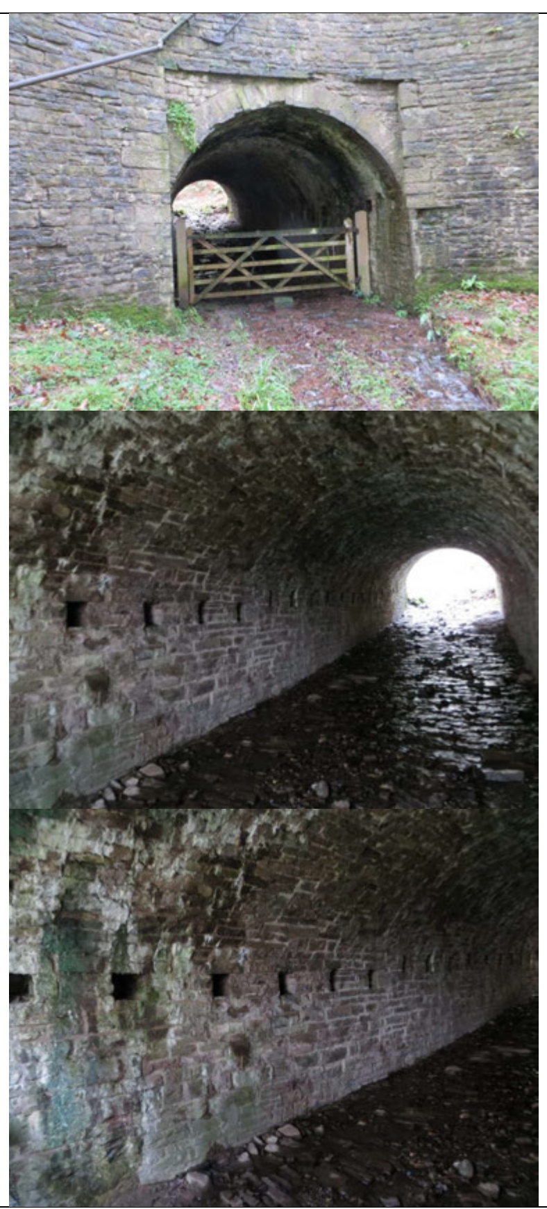
Condition: Good. Detailed survey of retaining walls required.