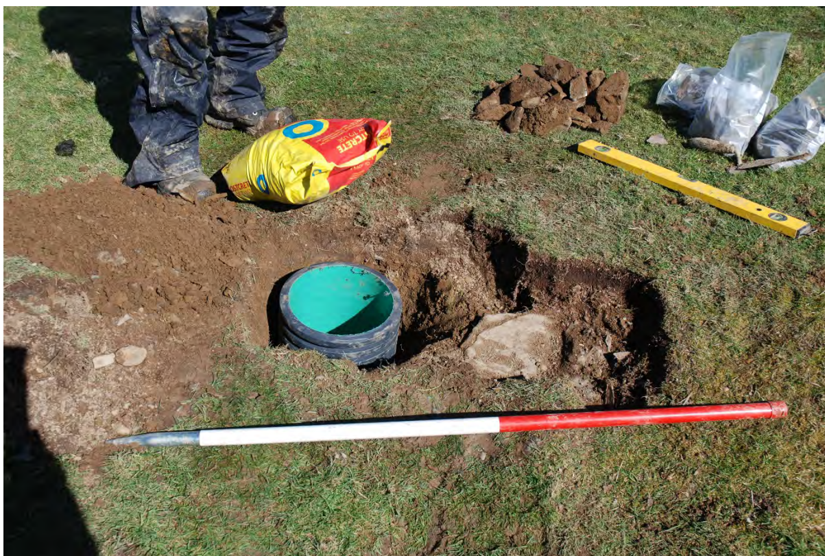
Plate 5. Northeast view showing plastic pipe that will hold the waymarker in place.