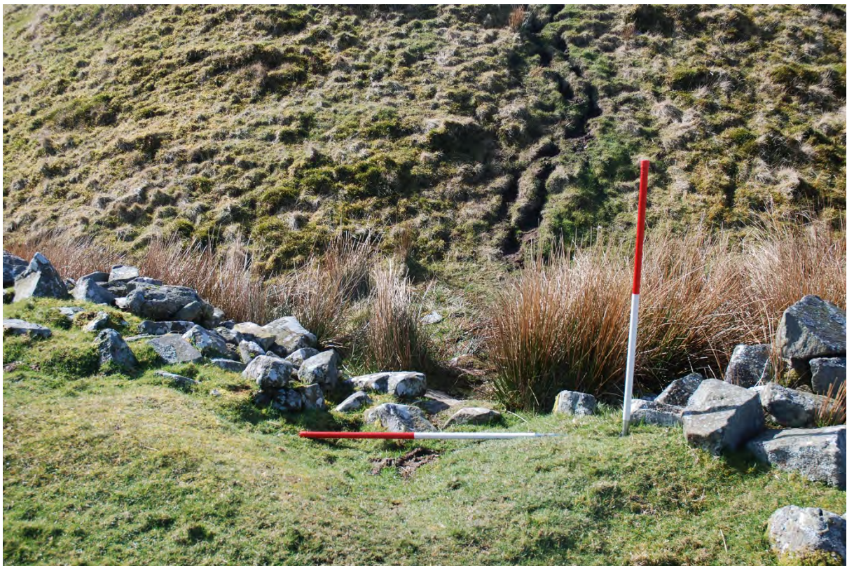
Plate 9. Southwest view showing gap in wall at base of the motte (northeast side of the motte).

Work area 2 (SH 70556 38694 & SH 70537 38657) (see appendix 1)