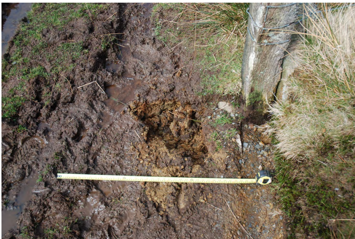
Plate 18. Northeast view showing gate area with the stone removed.