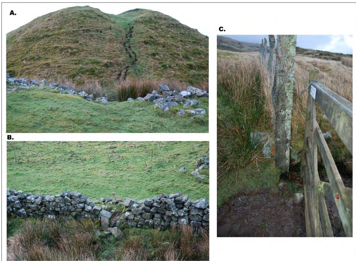
Figures 1A. Shows the degree of erosion on the northeast side of the mound and the gap in the stones at the base of the mound. 1B. Shows gap at the base of the mound on the southwest side of the mound. 1C. Shows the gate getting caught on the stone.