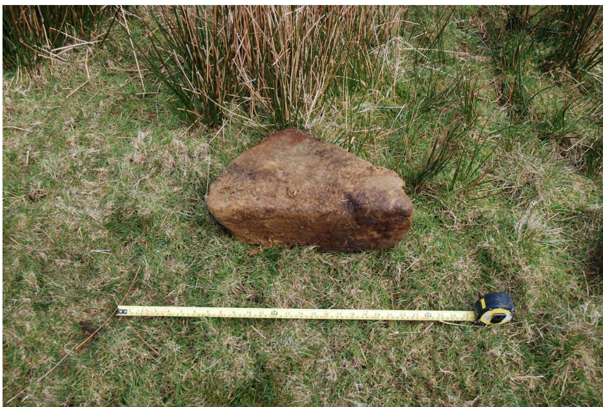
Plate 19. East view showing the removed stone.