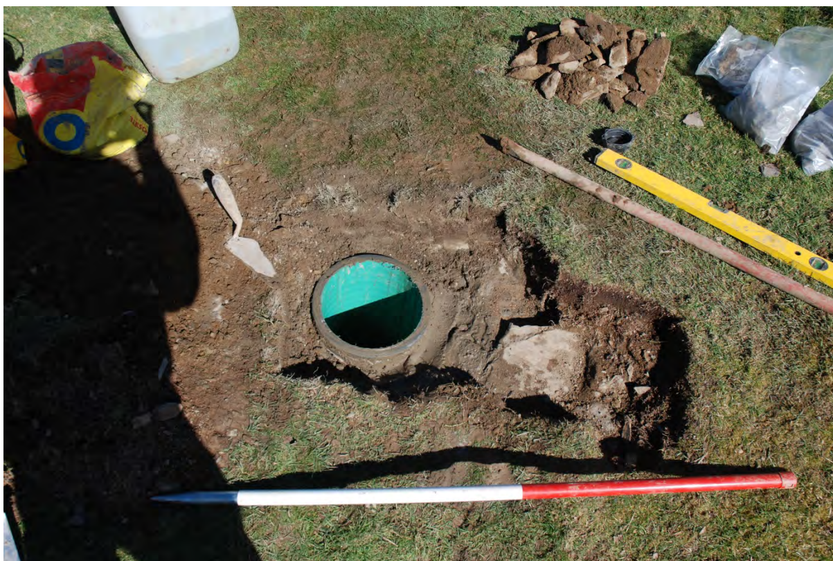
Plate 6. Northeast view showing postcrete in place around plastic pipe.