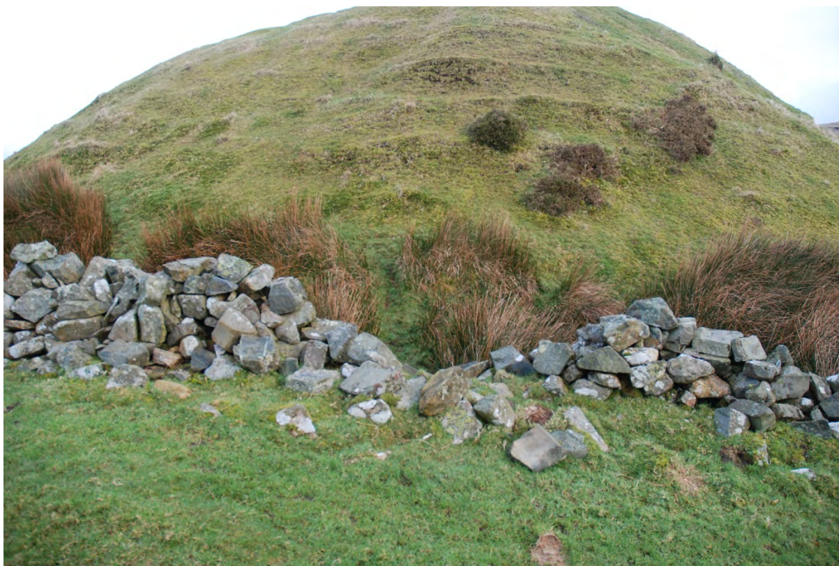
Plate 15. Northeast view showing collapsed stone and gap at the base of the motte (southwest side of the motte)