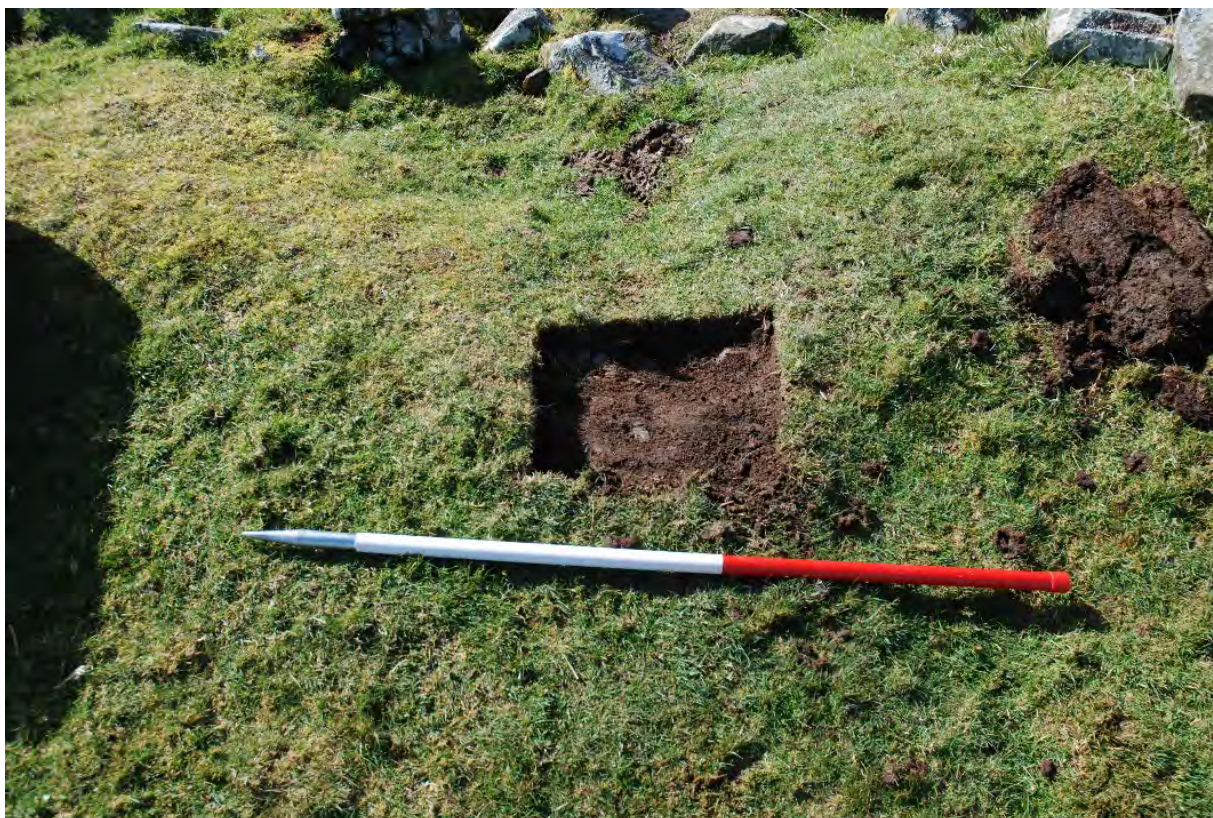
Plate 2. Southwest view showing the initial excavation location with turf layer removed and top of context 1.