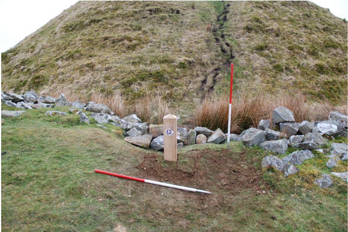
Plate 8. Southwest view showing waymarker in place with soil and turf backfilled.

Work area 2 (SH 70556 38694 & SH 70537 38657) (see appendix 1)