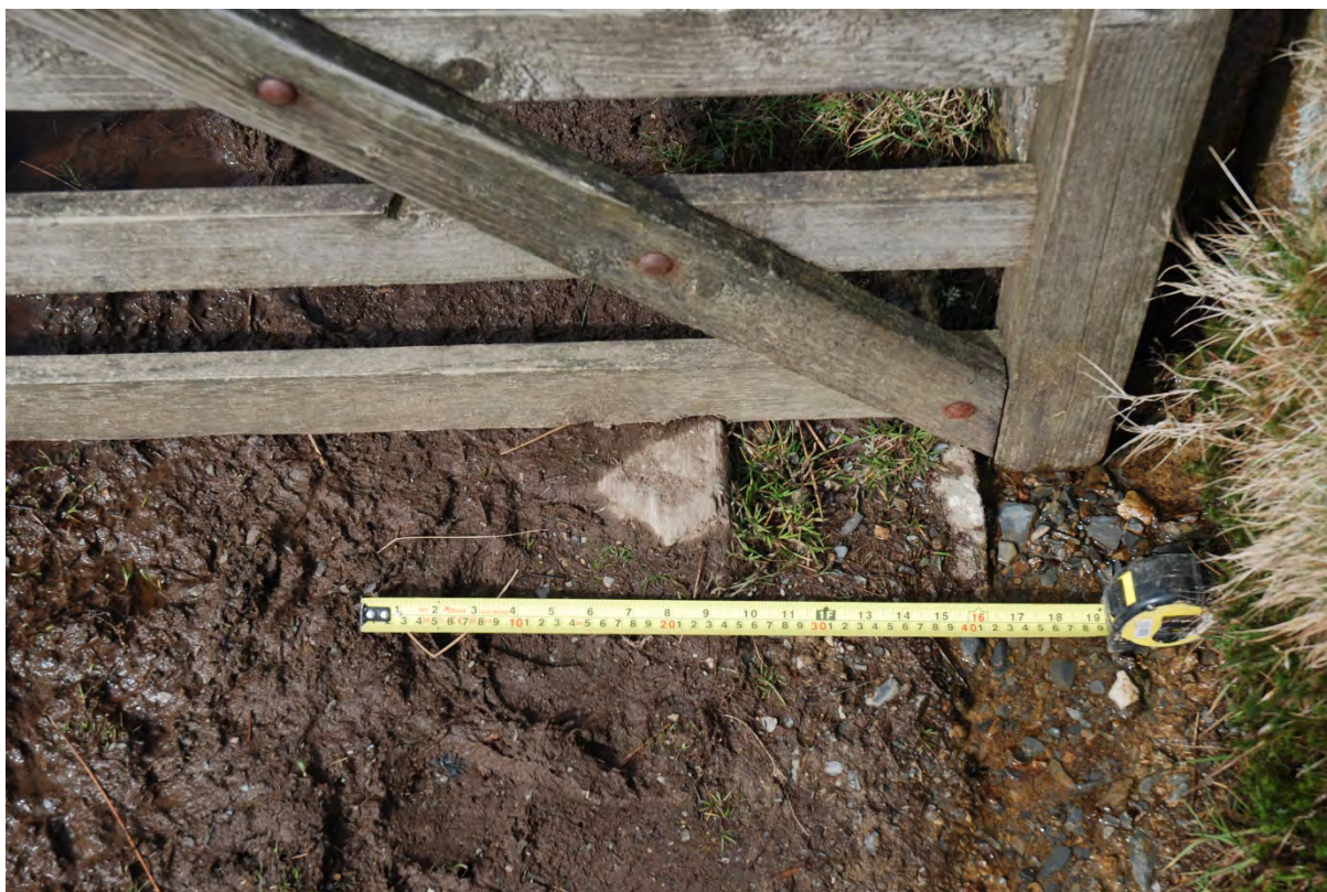
Plate 17: Northeast view showing the gate area with the stone to be removed.

Work area 3 (SH 70782 38634) (see appendix 1)