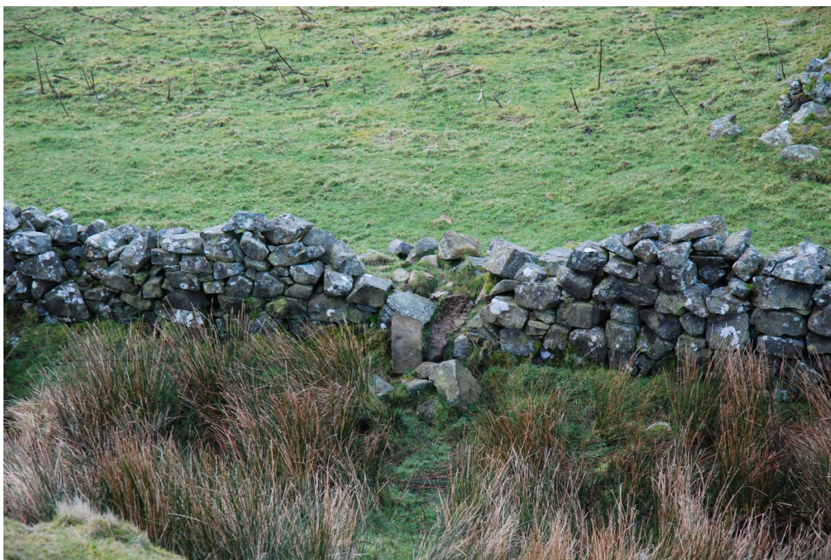
Plate 13. Southwest view showing collapsed stone and gap at the base of the motte (southwest side of the motte)