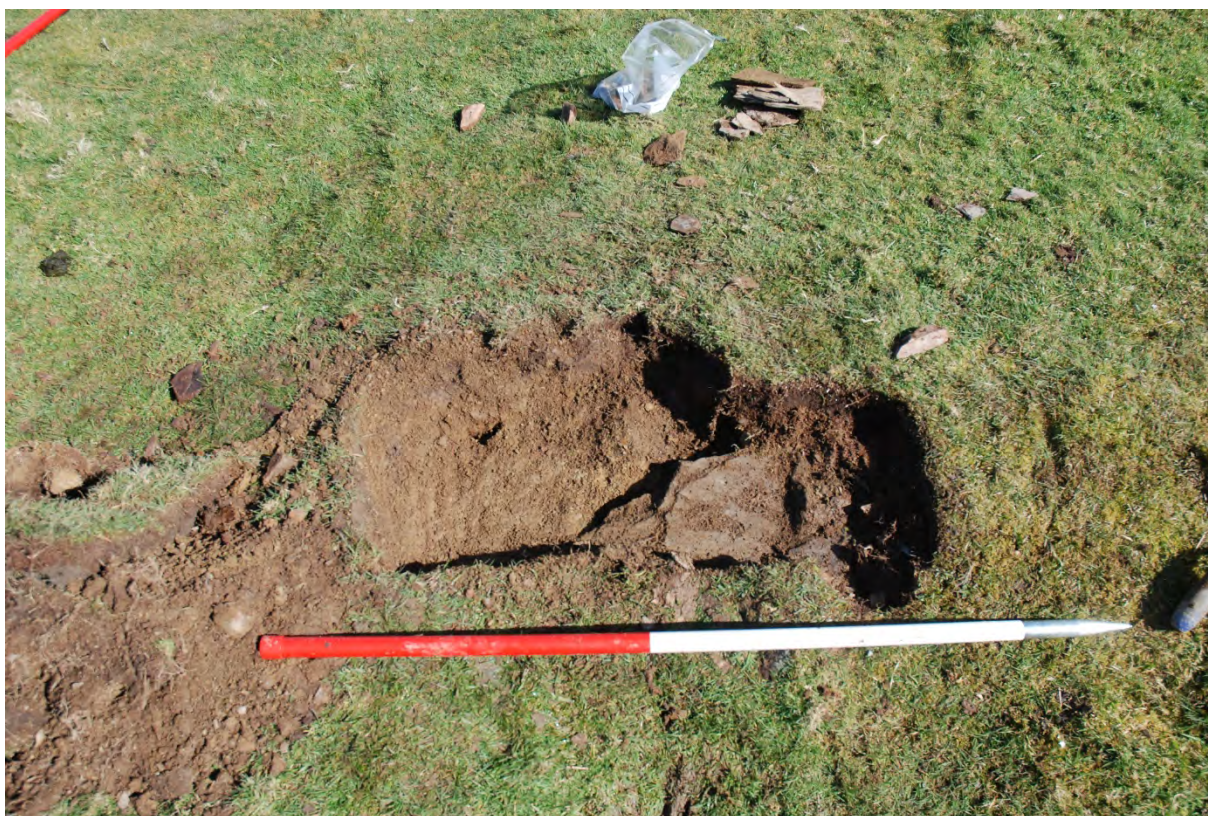
Plate 3. Northeast view showing the initial excavation location with stone (on right) and final excavation location with turf and content of context 1 removed. Also showing top of context 2.