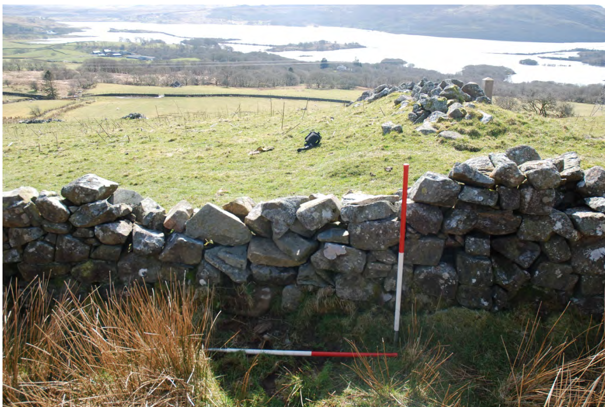
Plate 14. Southwest view showing the gap filled with stones at the base (southwest side of the motte)