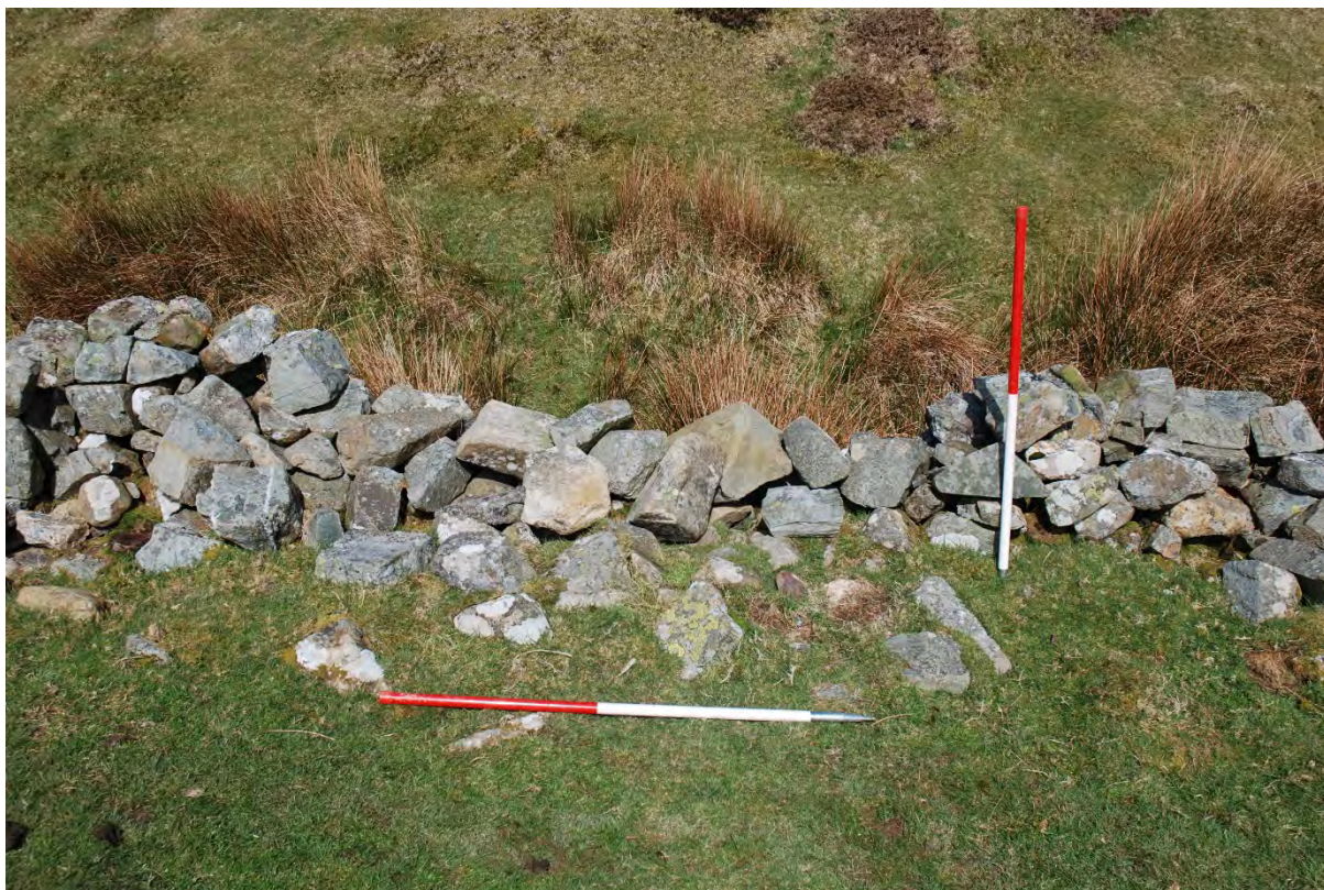
Plate 16. Northeast view showing the gap filled with stones at the base (southwest side of the motte).

Work area 3 (SH 70782 38634) (see appendix 1)