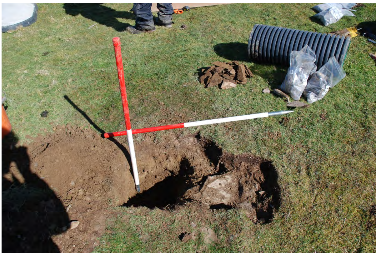
Plate 4. Northeast view showing content of context 2 removed.