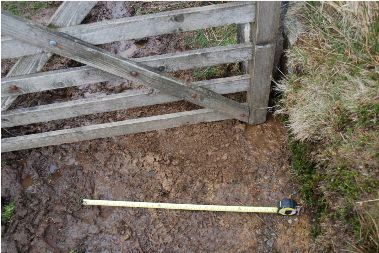
Plate 20. Northeast view showing gate area with a backfill of redundant soil from work area 1 (see appendix 1).