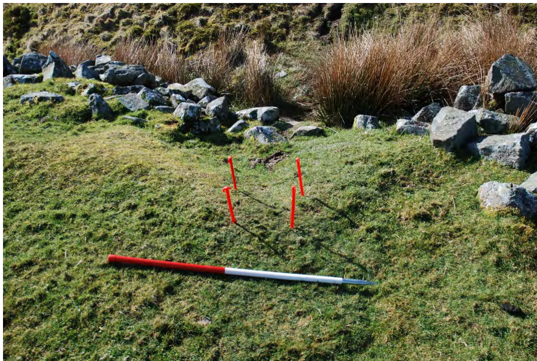
Plate 1. Southwest view showing the initial excavation location where waymarker would be installed.