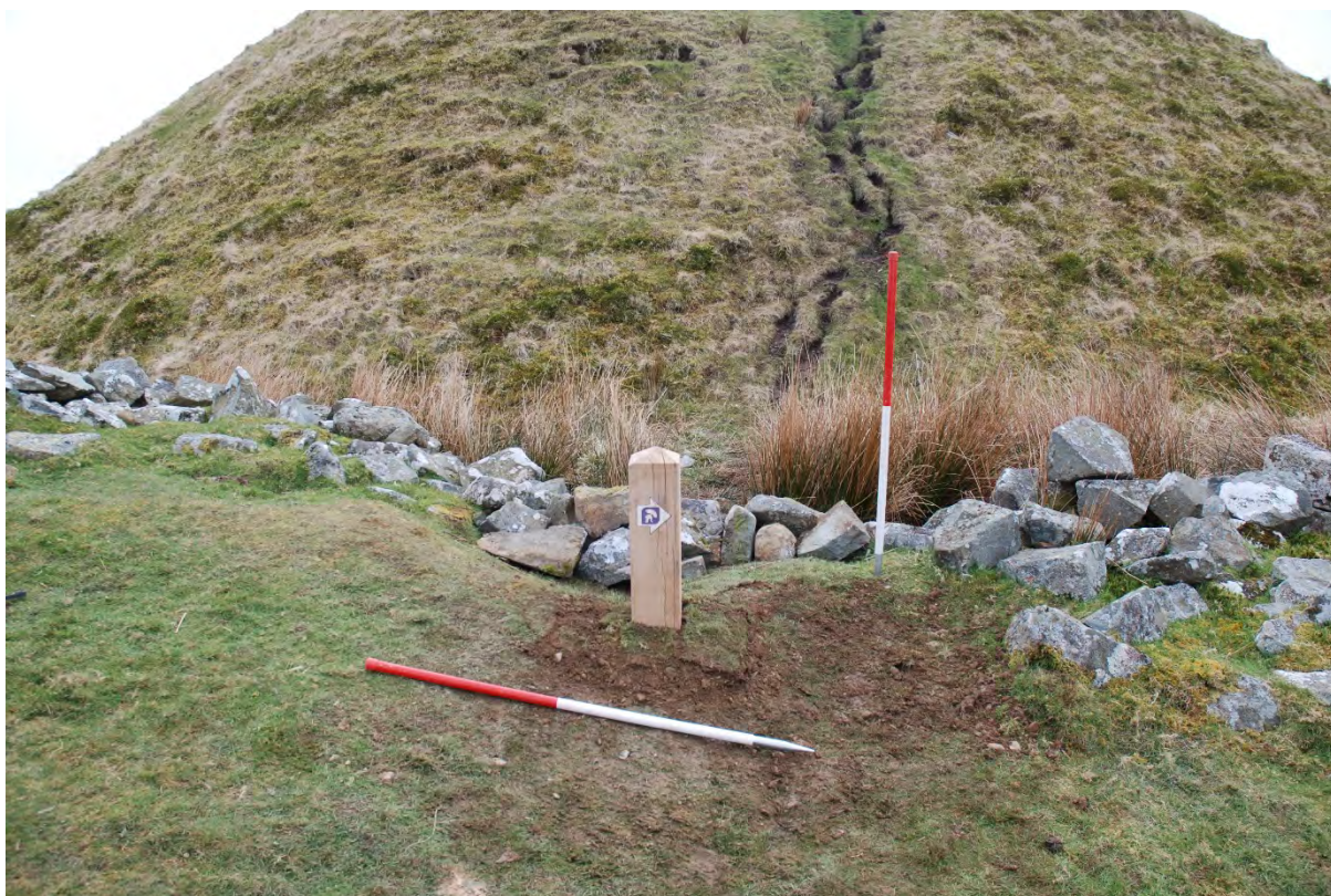
Plate 10. Southwest view showing the gap filled with stones at the base (northeast side of the motte)