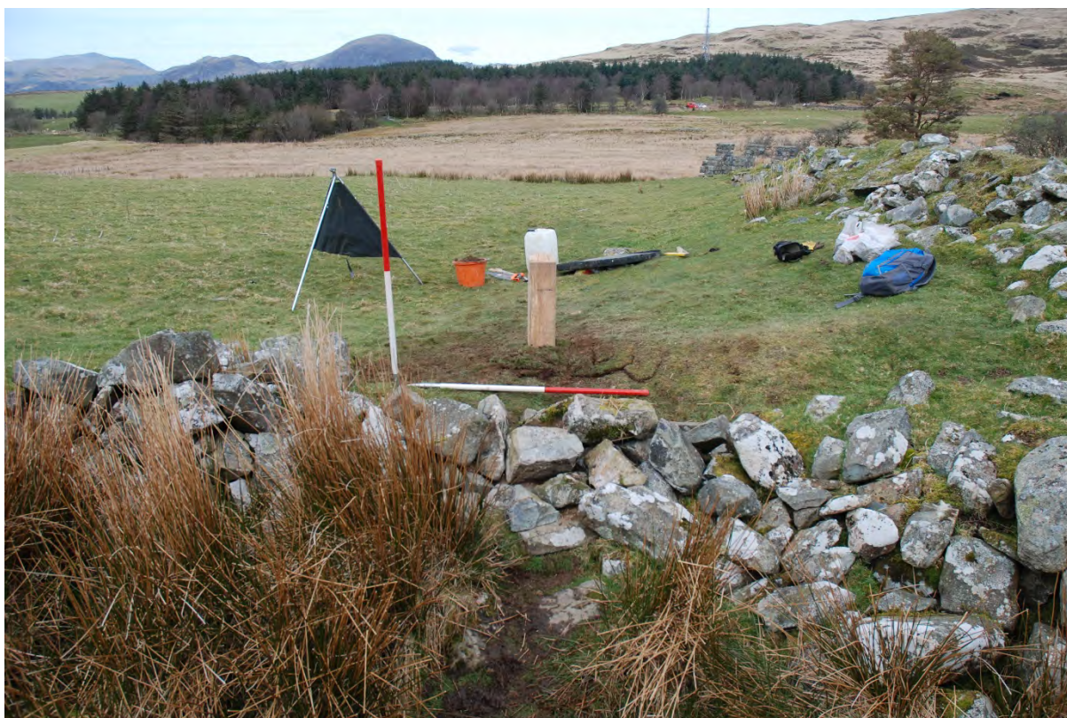
Plate 12. Northeast view showing the gap filled with stones at the base (northeast side of the motte).