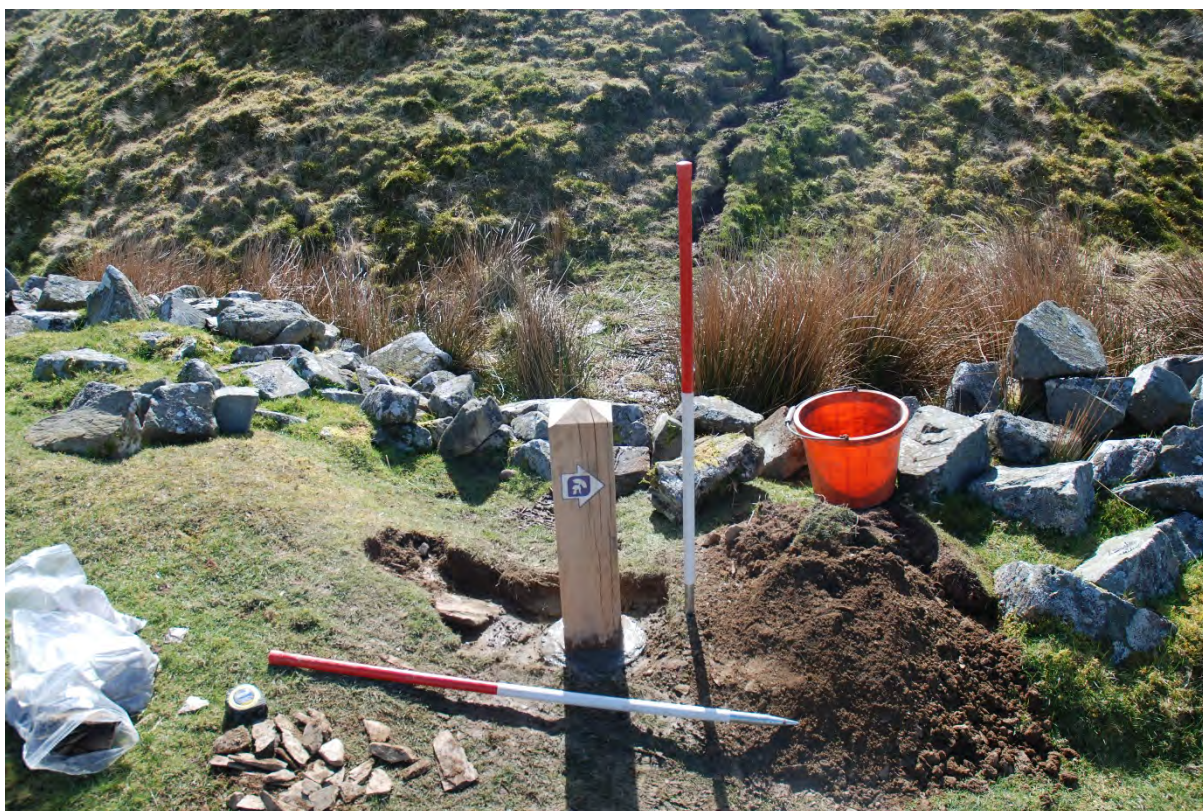
Plate 7. Southwest view showing waymarker cemented in place.