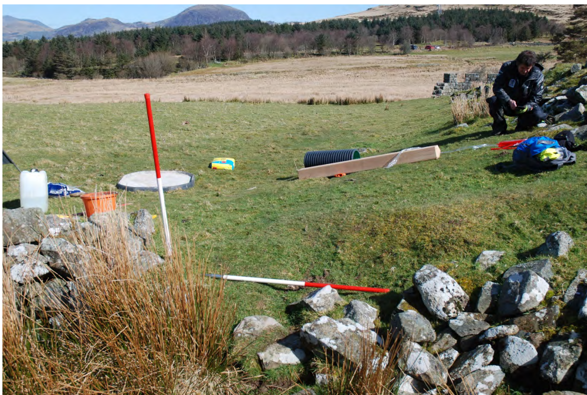
Plate 11. Northeast view showing gap in wall at base of the motte (northeast side of the motte).