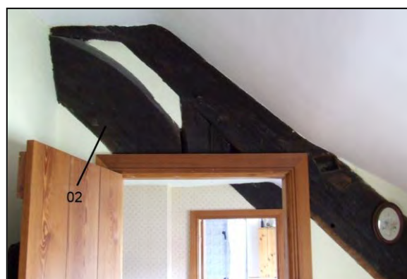
Figure 2: Timber above door, central truss

The position of the truss sampled is shown in Fig 3. Sample 01 had 57 rings, including 28 sapwood rings, plus the spring vessels of the next year ( 28\frac{1}{4}C ), and the series was compared with the dated reference material, but as expected, this short series failed to date.