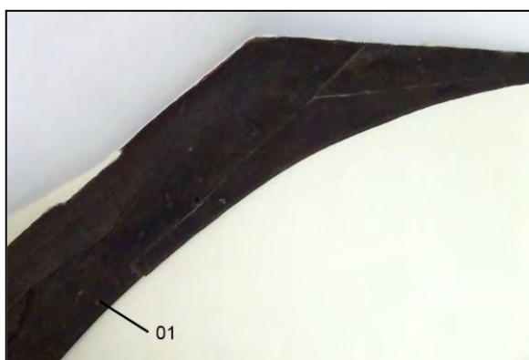
Figure 1: West cruck of central truss

It was decided that there were too few rings for dendrochronological dating, but two samples were taken in case it might be possible to carry out radiocarbon dating at a later stage. Sample 01 was taken from the west cruck of the central truss (Fig 1), next to the stairs, and had complete sapwood. Sample 02 was taken from a timber above the door on the east side of the truss (Fig 2).