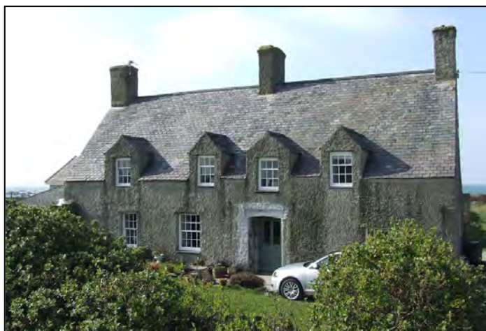
Trefadog, Llanfaethlu, Isle of Anglesey