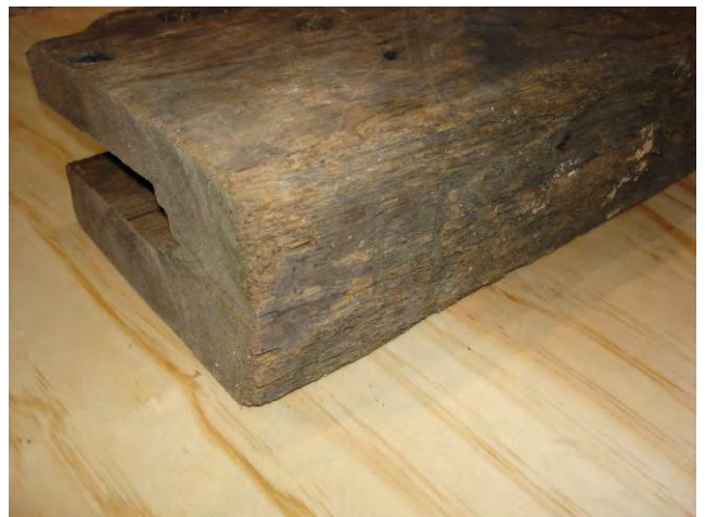
Fig 1b: Timber angg02 showing location of sample slice with III chiselled carpenters' mark