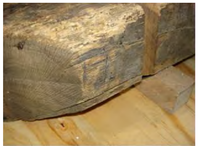
Fig 1a: Timber angg01 showing location of sample slice with II chiselled carpenters' mark