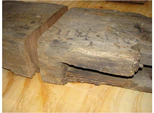
Fig 1c: Timber angg03 showing location of sample slice