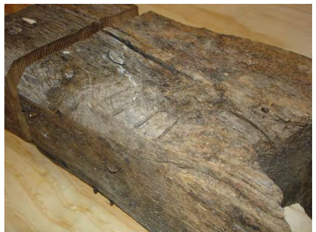
Fig 1e: Timber angg05 showing location of sample slice with IIII chiselled carpenters' mark