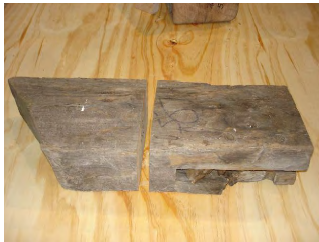
Fig 1d: Timber angg04 showing location of sample slice