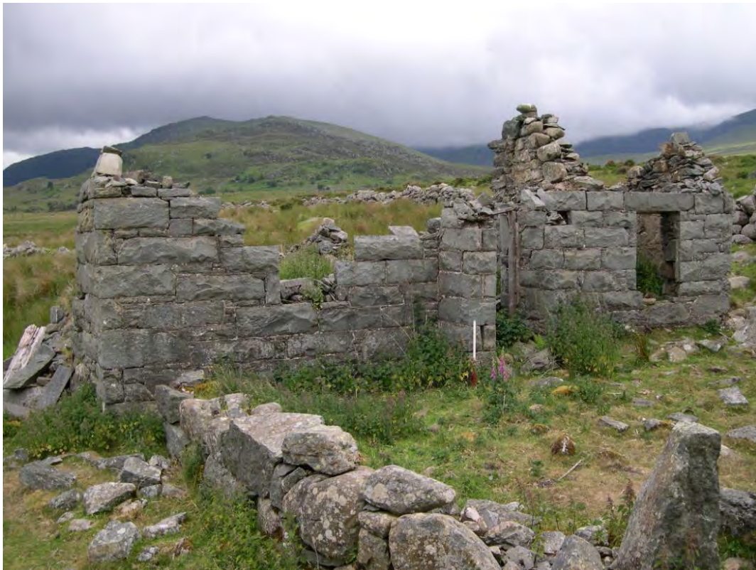
Plate 6: Farmstead at Hafodygors-wen (NPRN 279053)