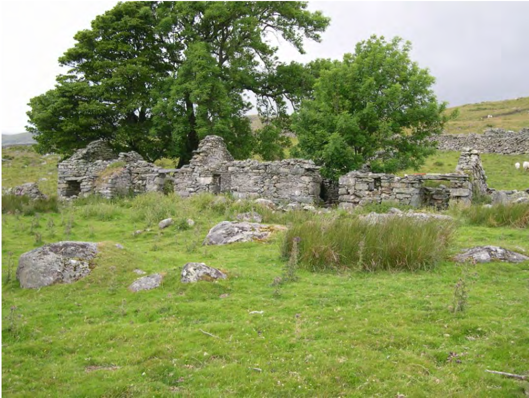
Plate 5: Farmstead at Ffrith-y-Bont (NPRN 279146)