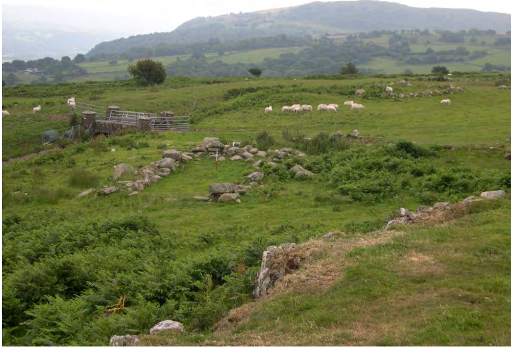
Plate 3: Longhouse settlement south of Pen-y-gaer (NPRN 302044)