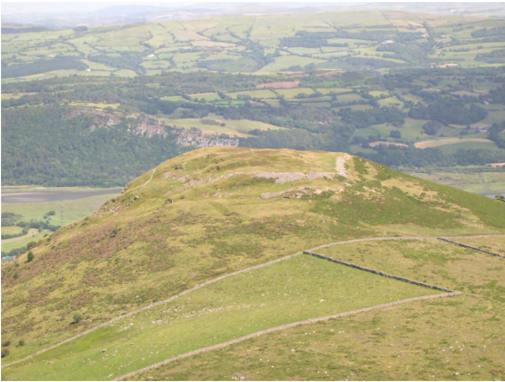
Plate 1: Pen-y-gaer hillfort overlooking the Conwy valley (NPRN 95289)