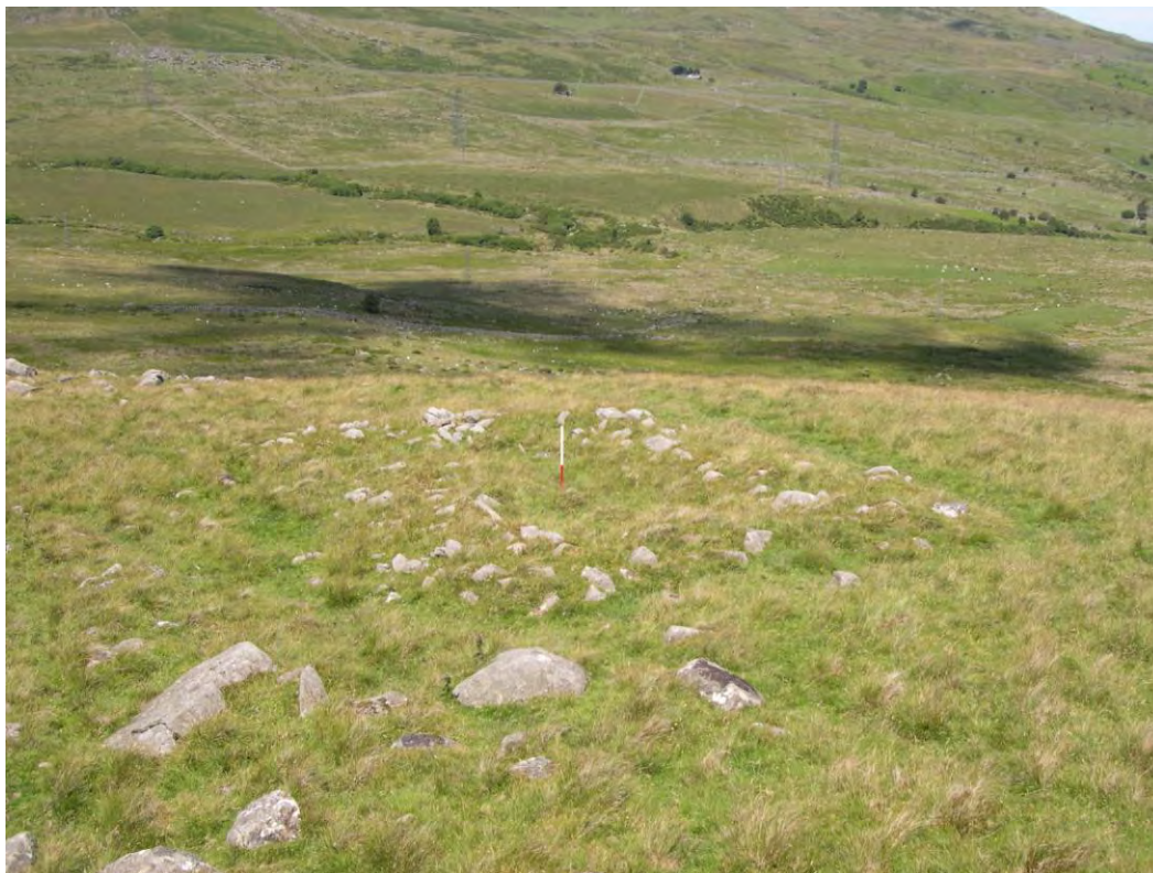
Plate 4: Longhouse on northern slope of Penygadair (NPRN 279161)