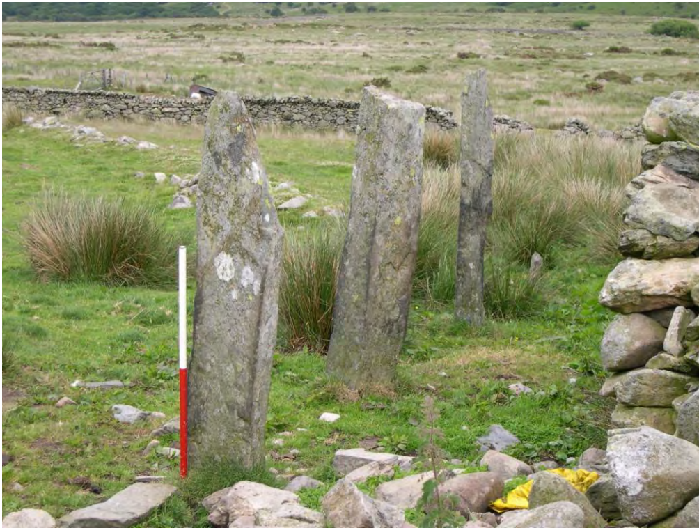
Plate 7: Upright orthostatic stone structure at Ffrith-y-bont (NPRN 279061)