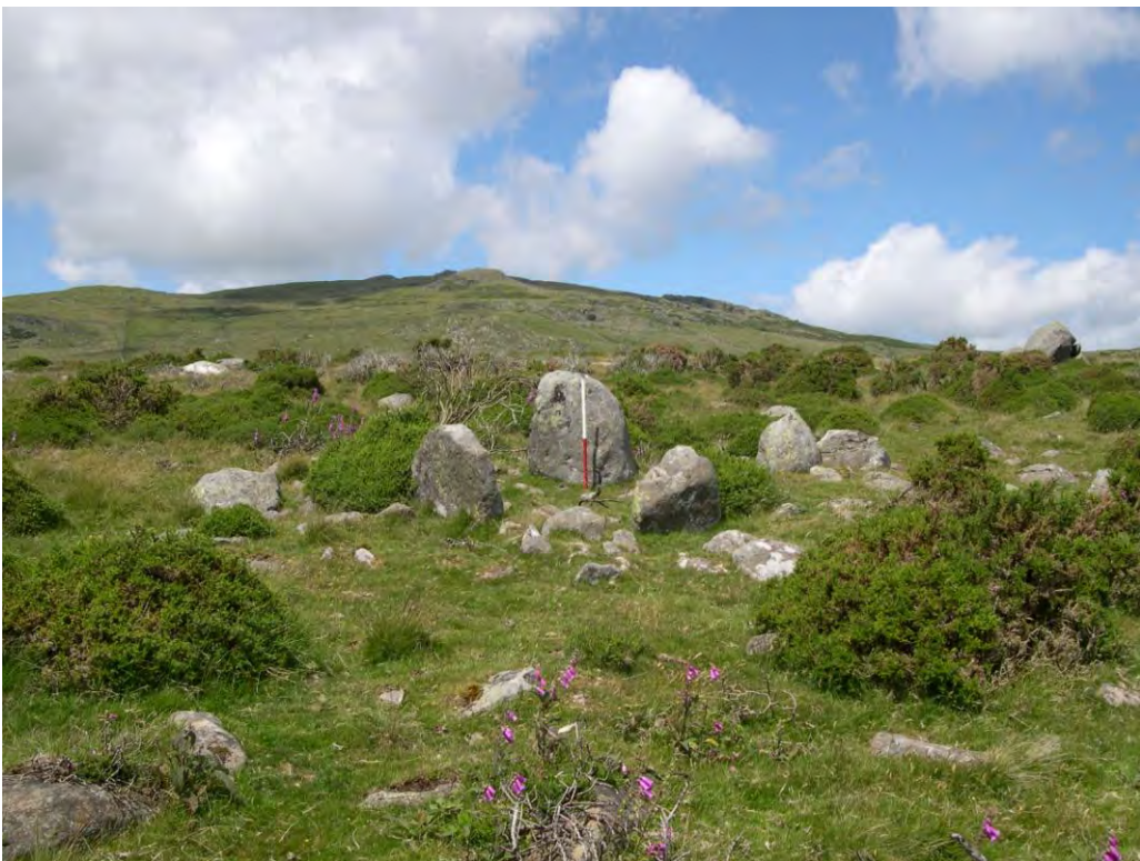
Plate 2: Ring Cairn located to the south of Hafodygors-wen (NPRN 308030)