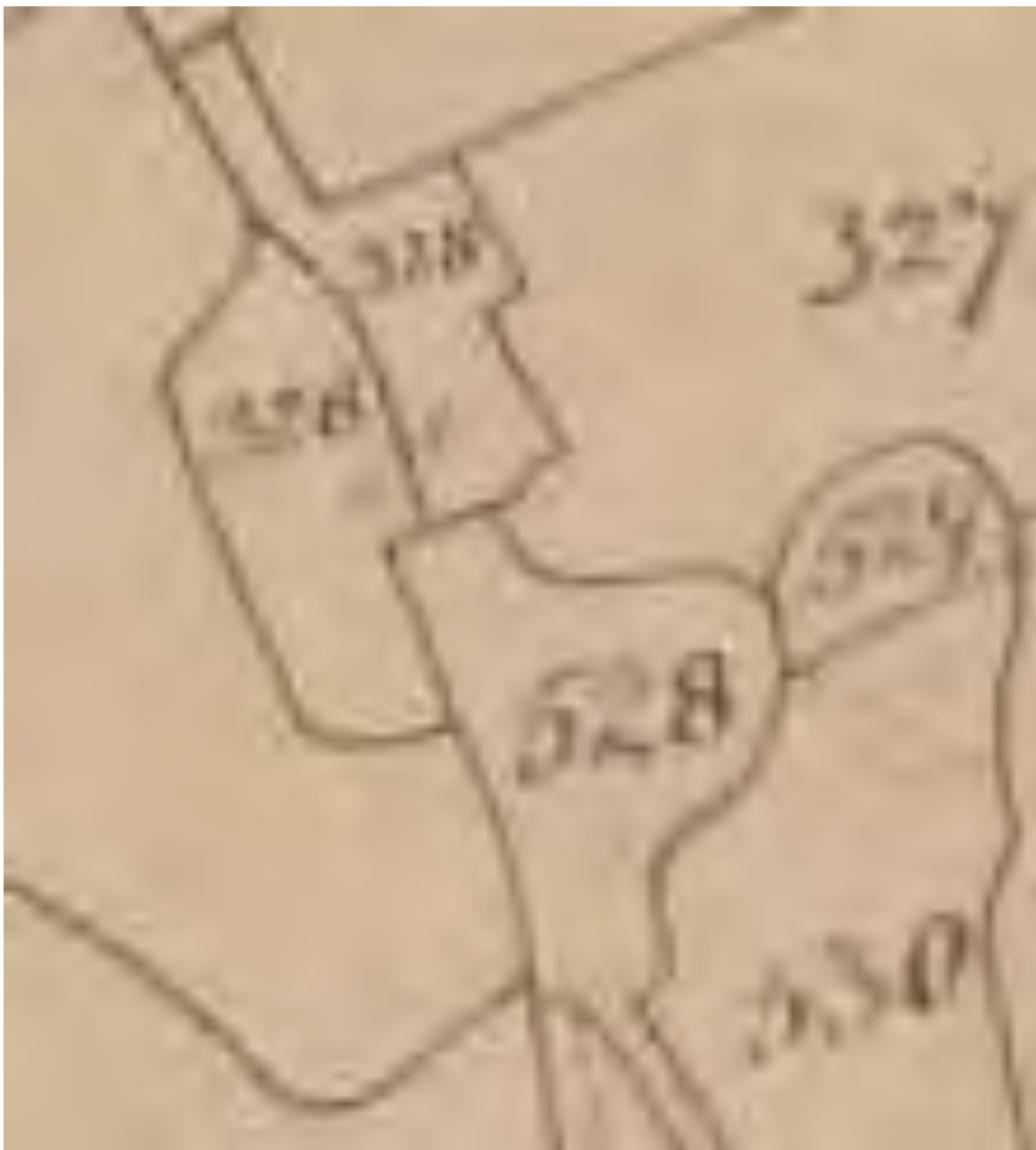
Map 3a: detail of 1847 tithe map