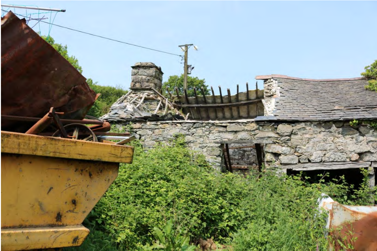
Cottage (building G) SH 7919 6751

A one-unit building, possibly a small cottage, orientated east-west, with a chimney in the west-facing gable. It is rubble-built with a slate roof, which is now collapsing.