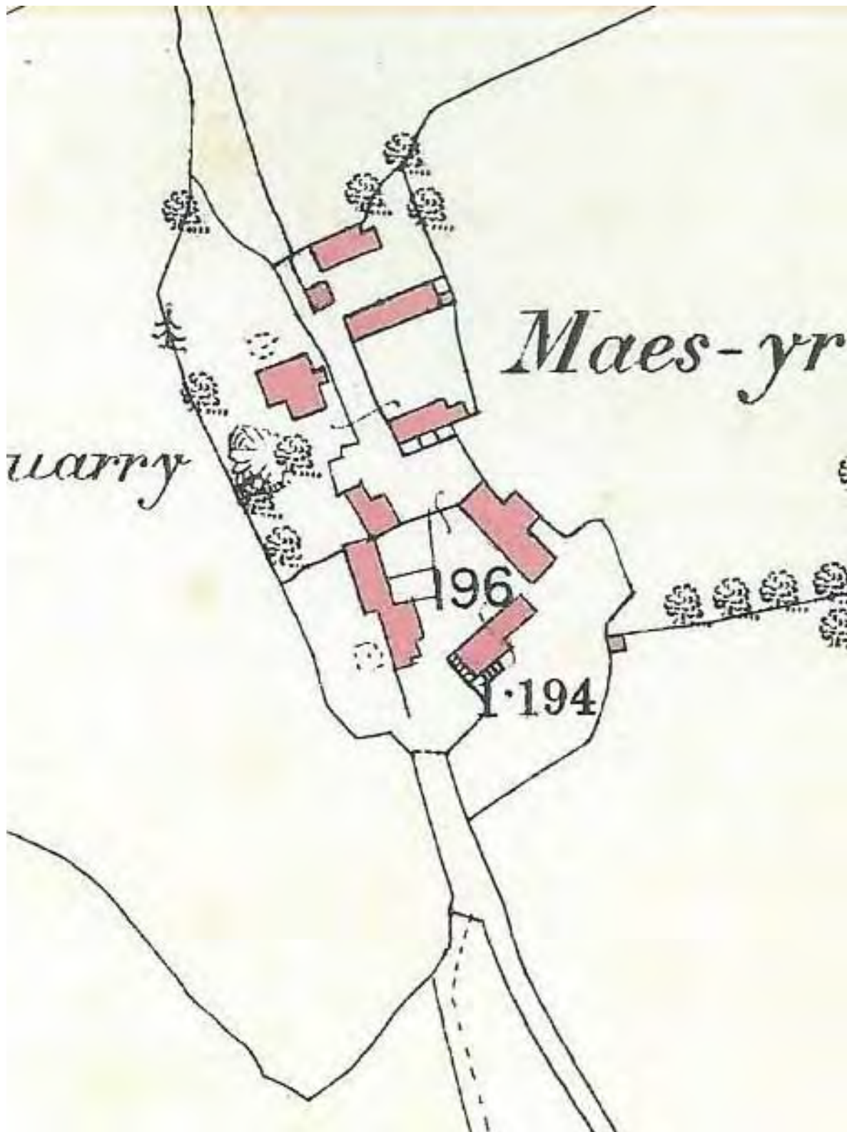
Map 4: 25" ordnance survey of 1889

The Wynnstay rentals record payment for masons' work at Maes yr Hendre on 19 July 1850 (13s 9d) and on 25 July (10s and 17s) (NLW: Wynnstay rentals R105).