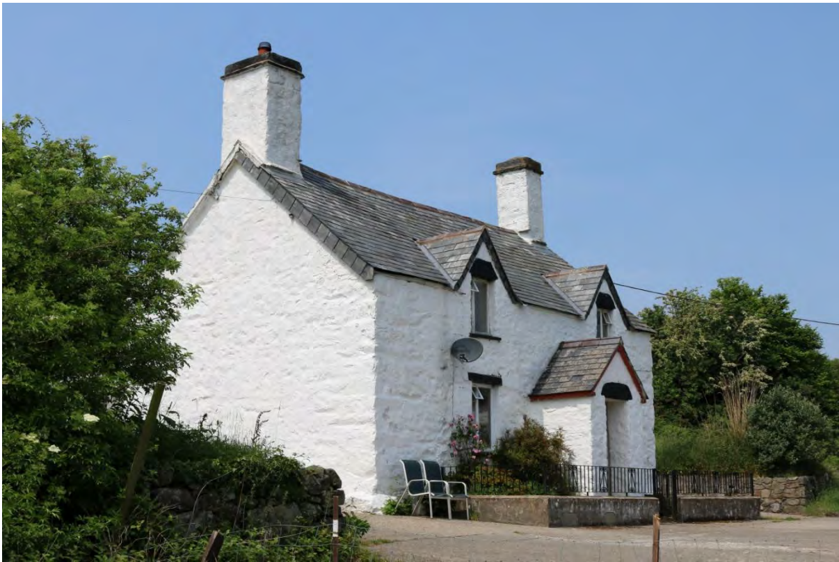
Maes yr Hendre farmhouse SH 7918 6750

Maes yr Hendre farmhouse is a two-storey double-fronted east-facing structure of probably 19 th century date, typical in scale and design of estate-built Conwy valley farmhouses of the period. It is of lime-washed rubble construction with a slate roof, stone end chimney stacks, with modern casement windows and is east-facing. The upper windows rise through the eaves. The gabled porch is a later addition. There is a modern extension to the rear.