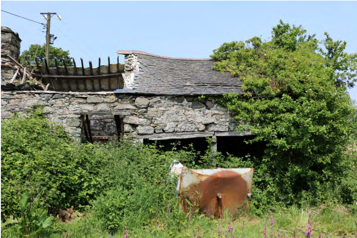
Cart shed (building G)SH 7920 6752

A cart-shed contiguous with the cottage, orientated east-west; the cart opening is supported by a timber lintel on a vertical-positioned slab support. It is now heavily overgrown. It was in existence by 1843; as noted (building A), cart-sheds reflect the growing use of wheeled vehicles from the late 18 th century in the area. It is possible that the existence of two cart-sheds reflects the joint tenancy of the farm.