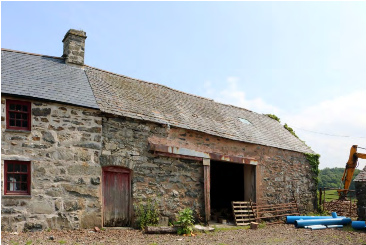
Barn (building B) SH 7923 6746

The barn is located on the eastern perimeter of the yard and is orientated north-west to south-east. It adjoins flush to the cottage but is of later construction, perhaps dating from the early to mid 19 th century. It is rubble-built, with some brick-work in the south-east facing gable; continuous roof of Ordovician slate, with a sky-light, supported by V-strut trusses. There is a segmental-arched entrance with boarded door and pegged frame to the left, large modern sliding barn door to right. A 20 th century corrugated iron extension adjoins to the rear.