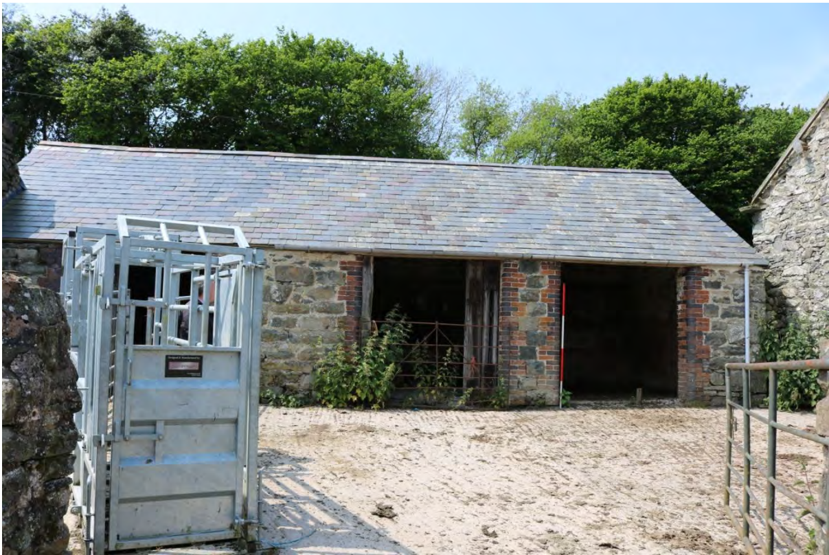
Shippon (building C) SH 7919 6746