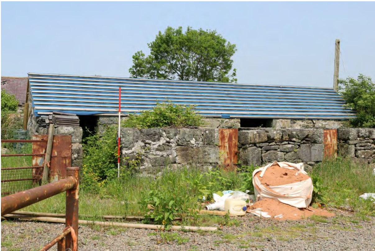
Pigsties (building E) SH 7921 6748