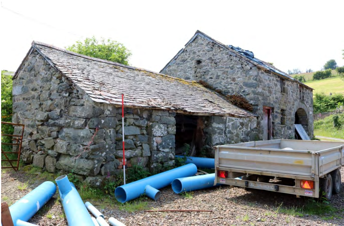
Cart shed, possible hayloft (building A) SH 7922 6745

This building is located on the south-eastern perimeter of the yard and is orientated south-west to north-east. It adjoins the cart shed and is stepped down from it. It is a single-storey building of rubble construction with a roof of thick torched slates. Facing the yard is a plain central cart entrance which originally had a further entrance to the right and a wider opening to the left; these are now blocked. It is suggested that this building may have functioned as hayloft at one stage.