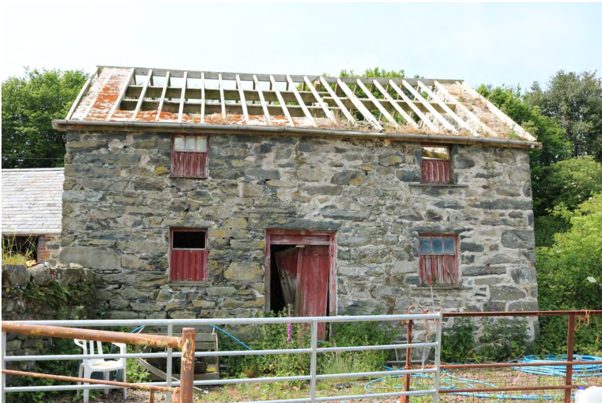
Granary 'granar' (building D) SH 7920 6747

Orientated north-west to south-east on the west side of the yard; a substantial rubble-built double-fronted structure, two storeys high; the slate roof has been removed, revealing the pine rafters. No evidence of chimneys was observed.