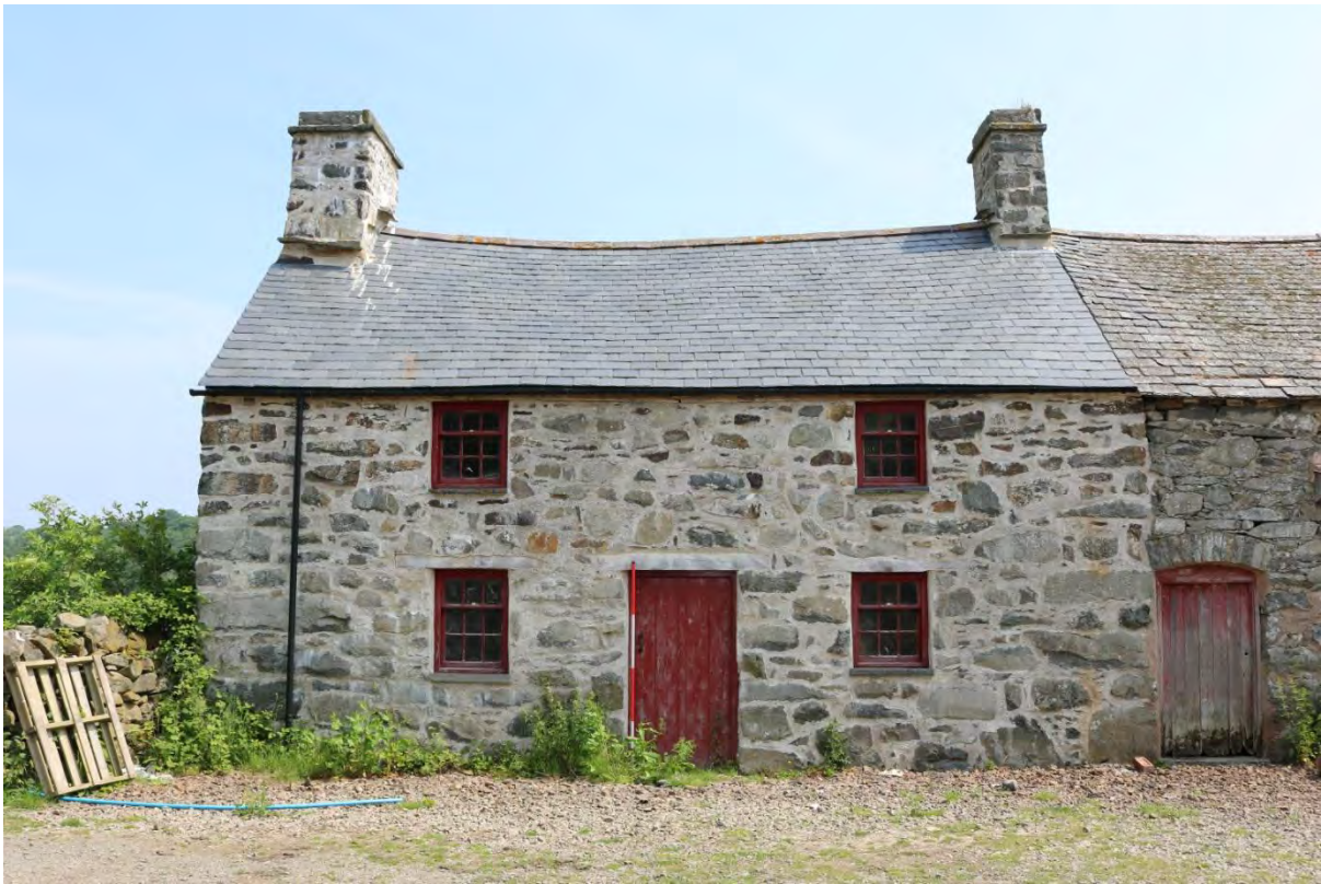
Maes yr Hendre cottage (building B) SH 7922 6747

Maes yr Hendre cottage (so called) is located on the eastern perimeter of the yard and is orientated north-west to south-east. It is a two-window two-storey end-chimney farmhouse, probably of early 18 th construction, restored externally under a grant scheme in 2012, built of rubble with a recent replacement slate roof; weather-coursing and simple corncicing to chimneys, that to the right formerly projecting.