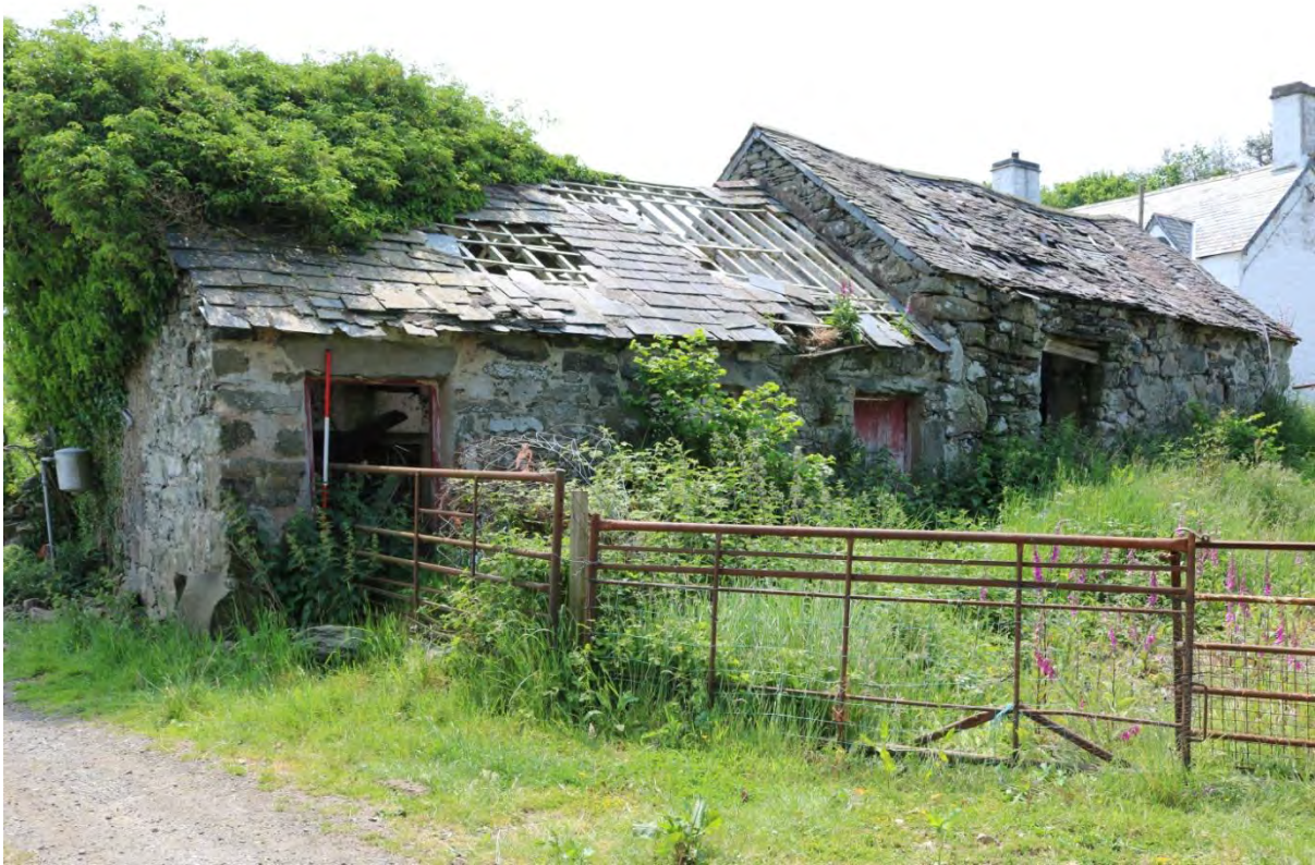
Dairy (building F) SH 7920 6751

A two-unit dairy building, orientated east-west; rubble construction and slate roof, now in poor condition. It was in existence by 1843. Dairies were where the cows were milked and the milk left to cool. They are an unusual feature of farms in the region.