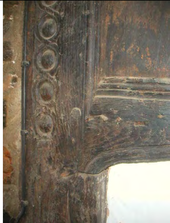
Plate 4 Doorway detail