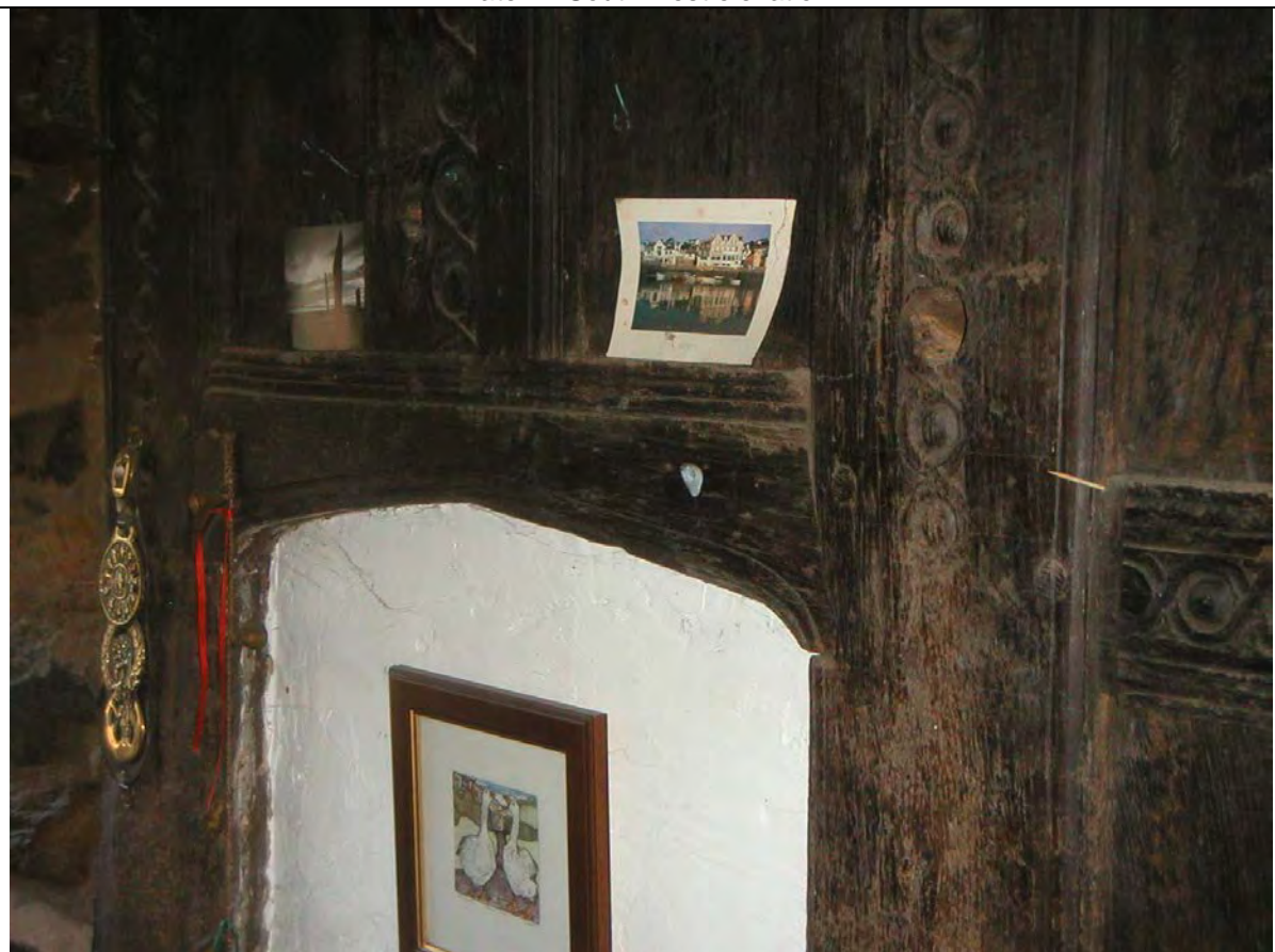
Plate 2 Screen doorway