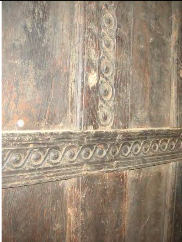
Plate 3 Screen detail