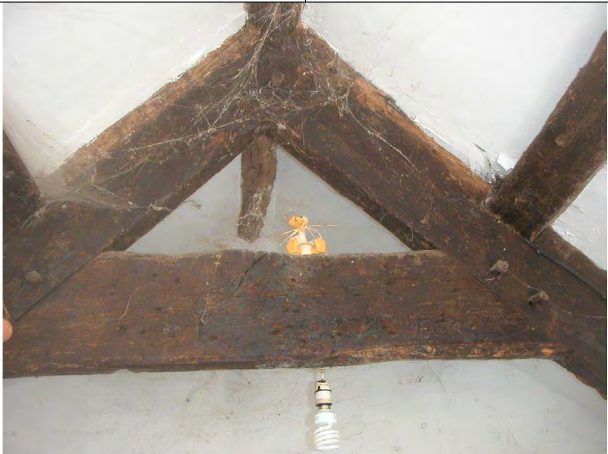
Plate 5 Truss 3 (porch roof)