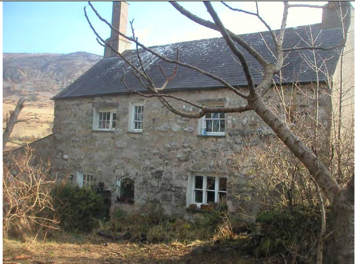
Plate 1 South-west elevation