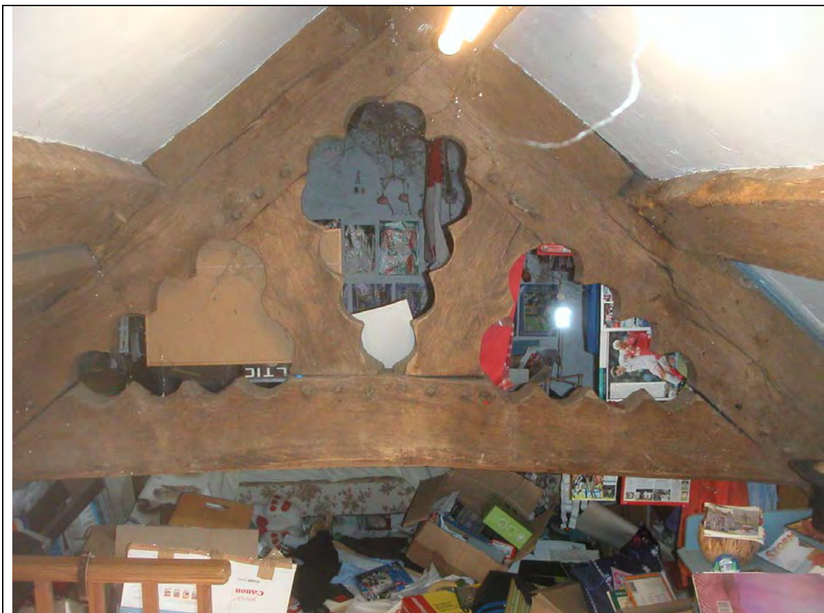
Plate 6 Truss 1