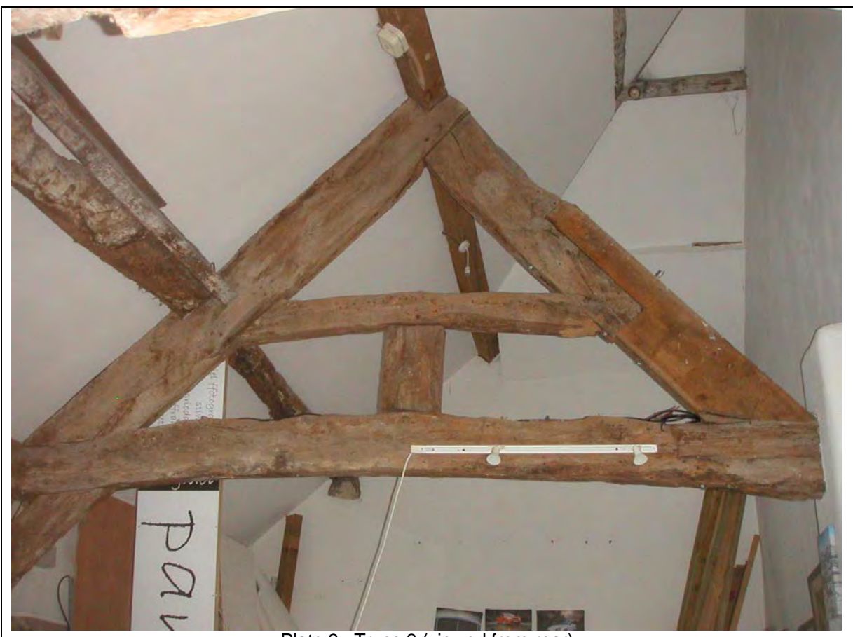
Plate 3 Truss 3 (viewed from rear)