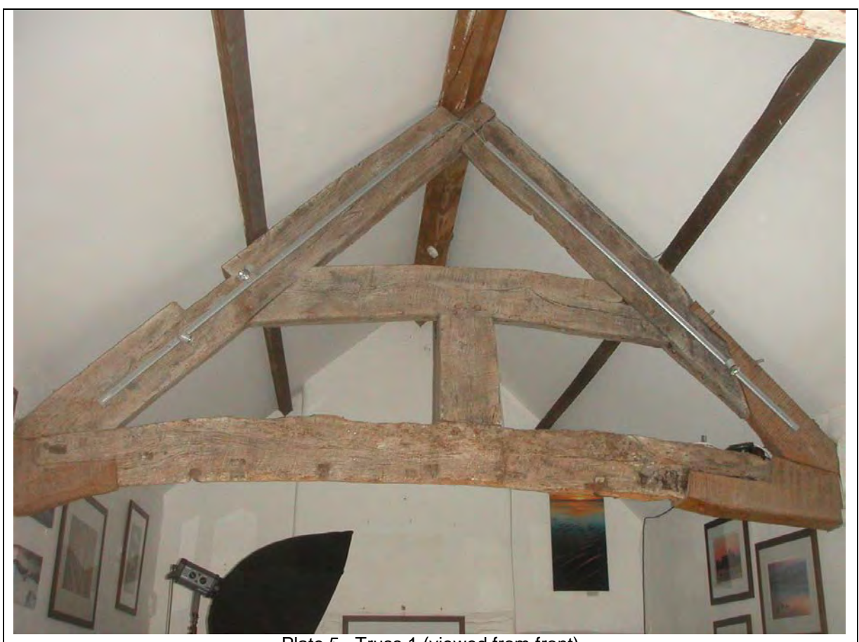
Plate 5 Truss 1 (viewed from front)