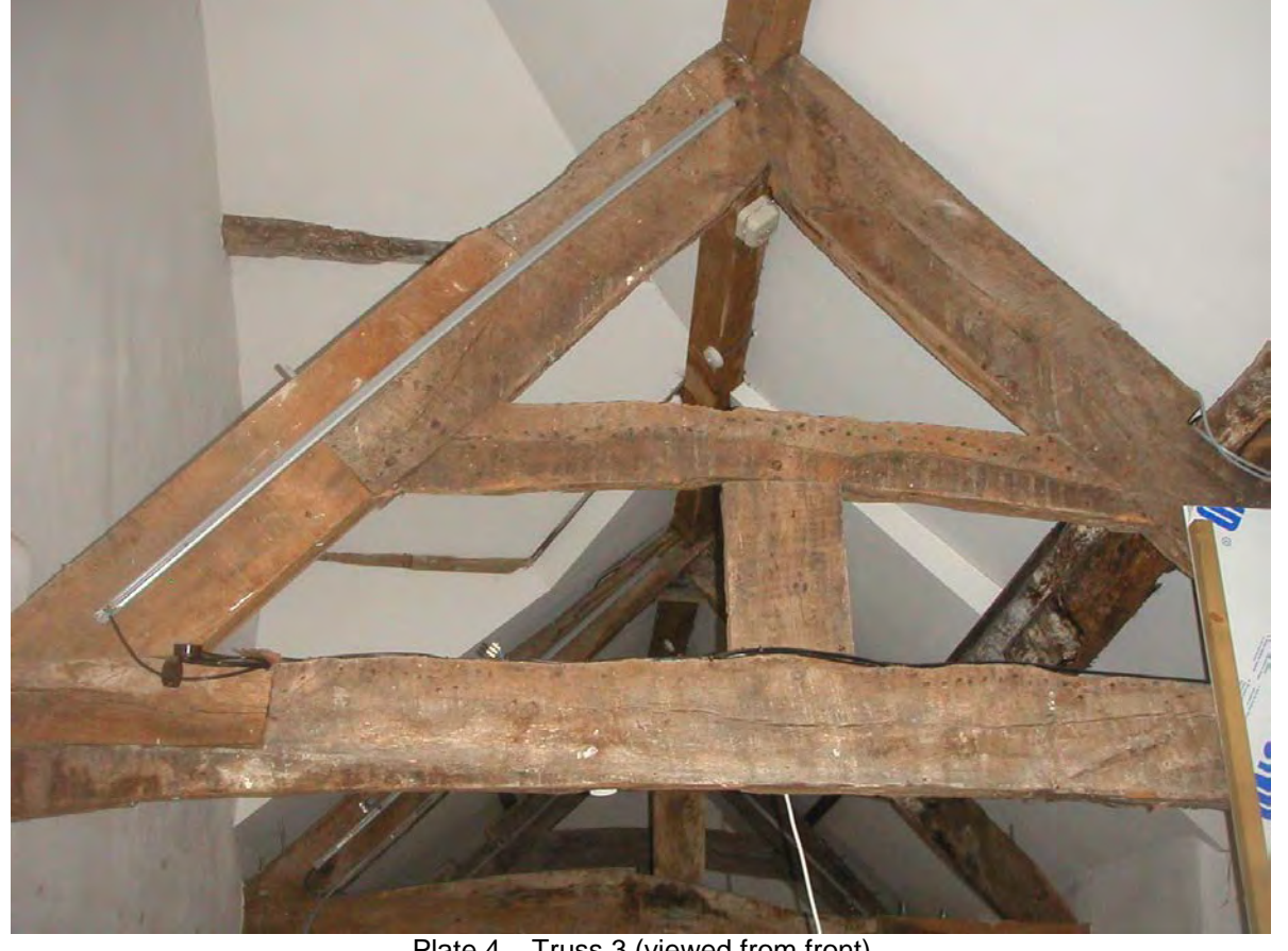
Plate 4 Truss 3 (viewed from front)