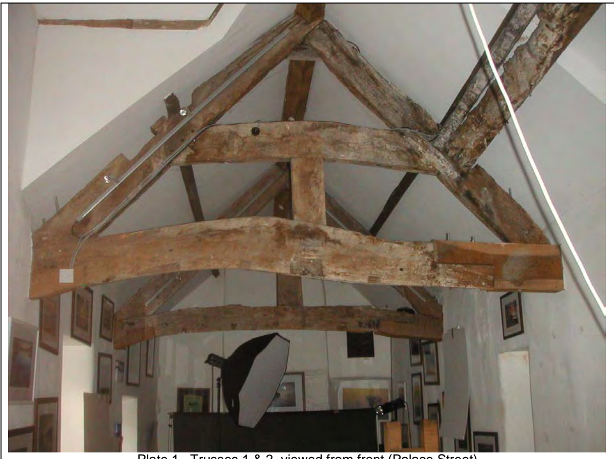
Plate 1 Trusses 1 & 2, viewed from front (Palace Street)