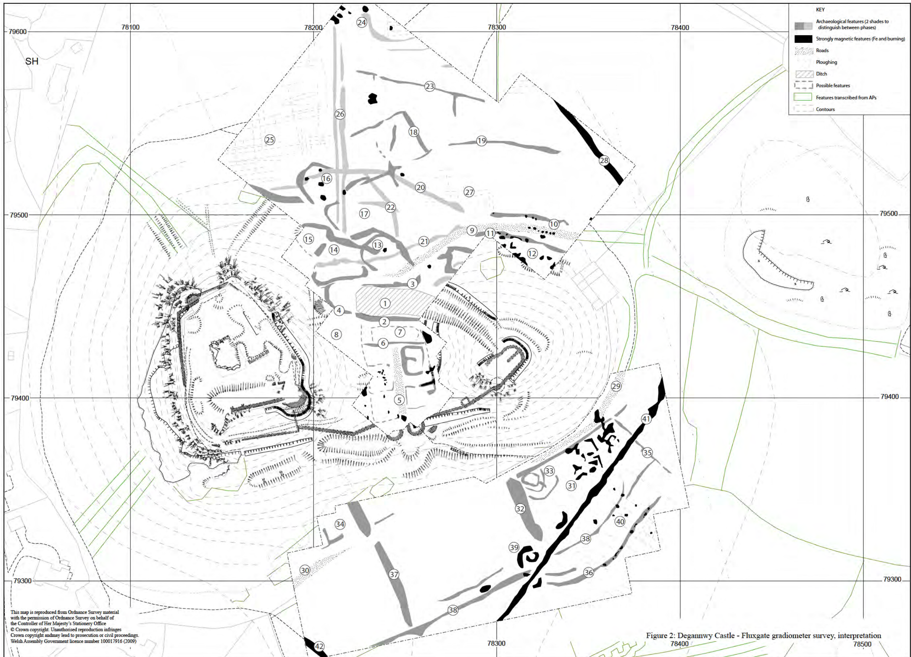
Figure 2: Degannwy Castle - Fluxgate gradiometer survey, interpretation