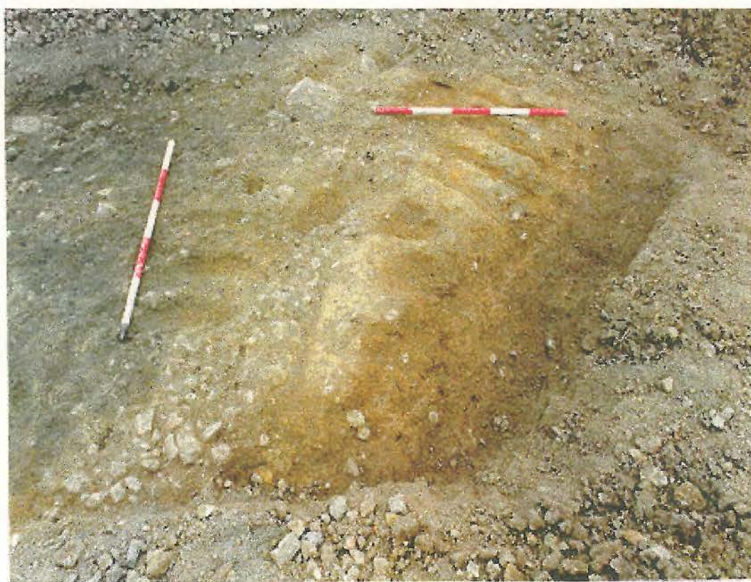
N.E. side of burnt mound showing linear slot (part stone filled) and edge of modern drain.