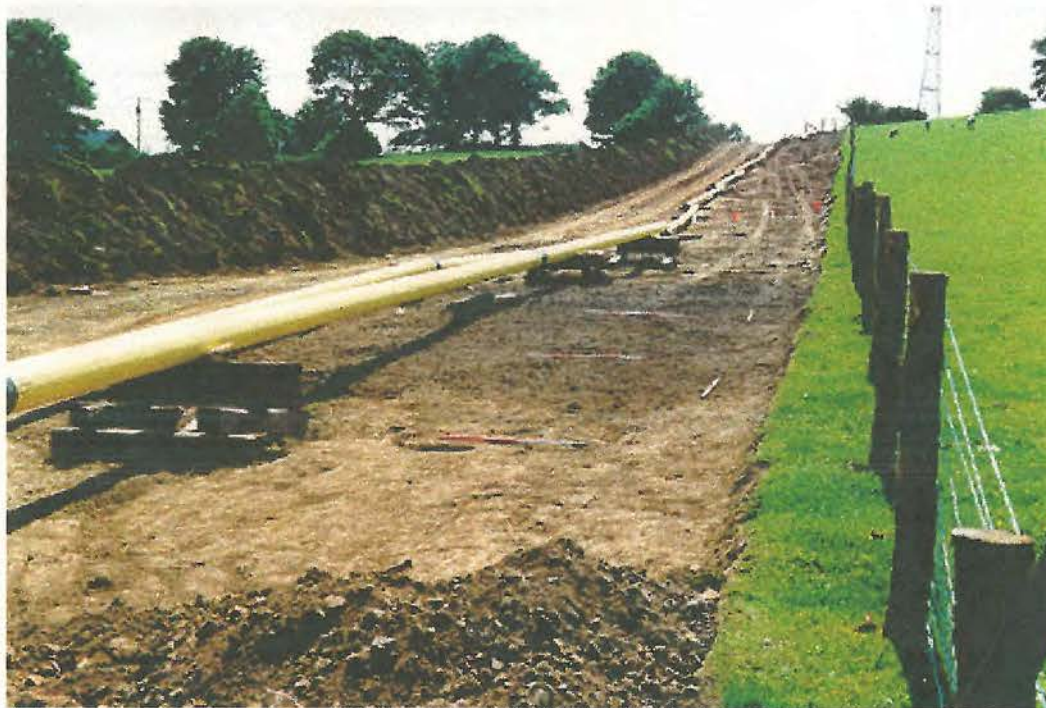
Burnt mound from N.E. after initial clearing