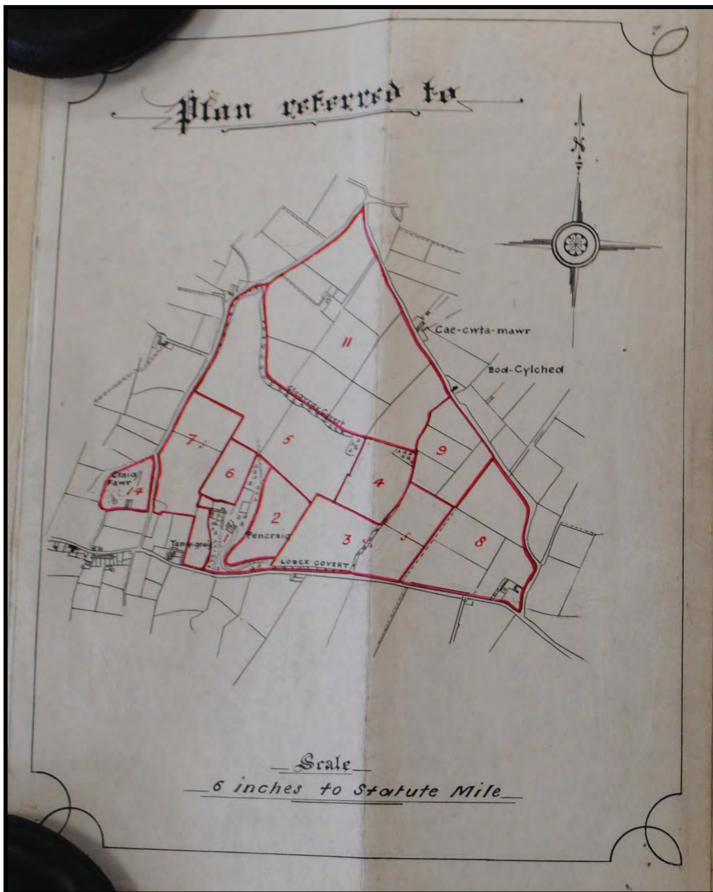
Figure 03: Anglesey Archives, WD/12/47. Conveyance dated 1910 plan showing the extent of Dafarn Newydd as Area 8.