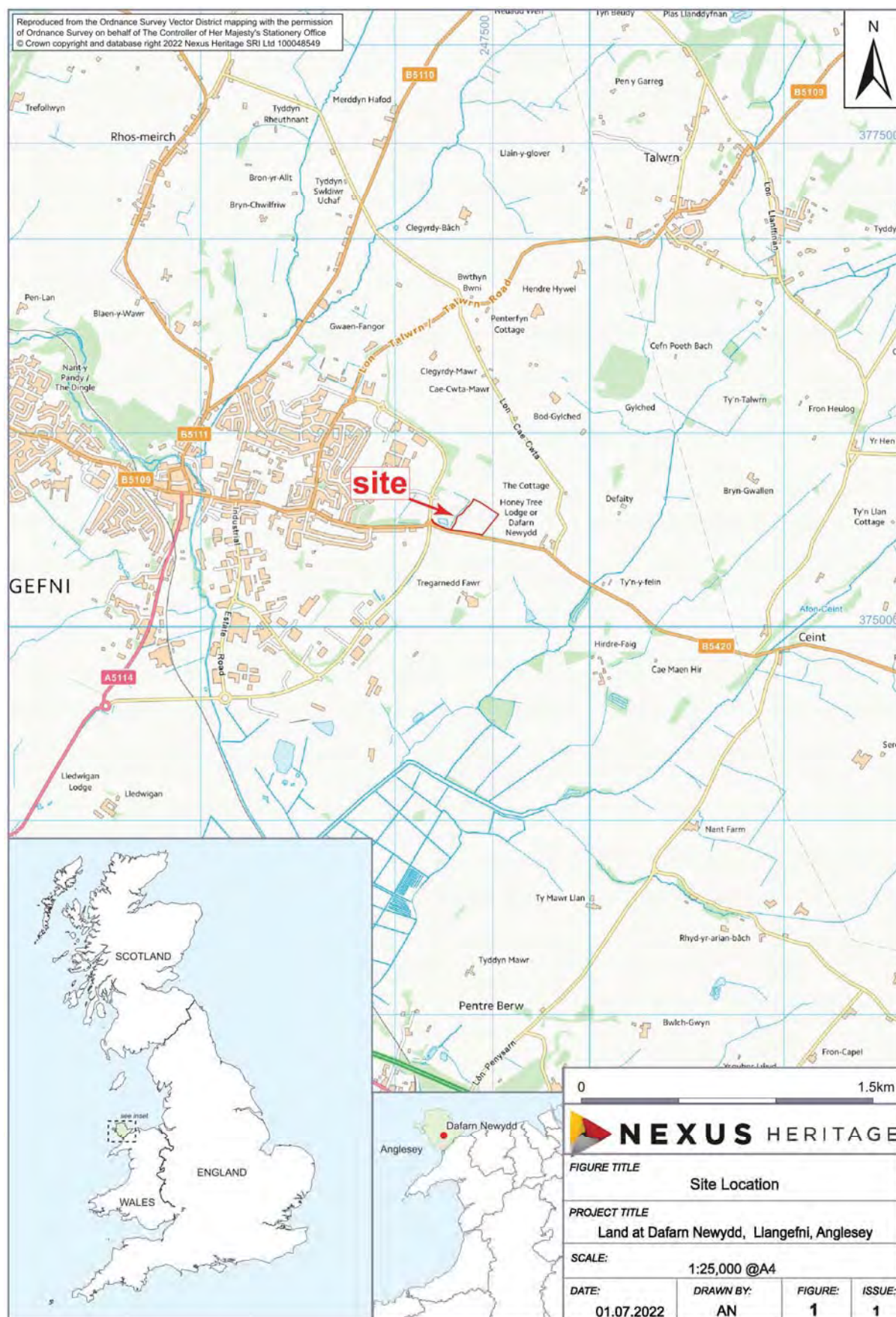
Figure 01: Reproduction of Nexus Heritage Report 3586.R01 Figure 01; Scale: as shown.