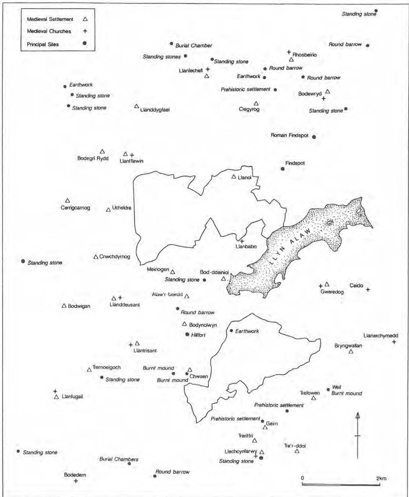
Fig. 1 Location of archaeological and historical sites in the area