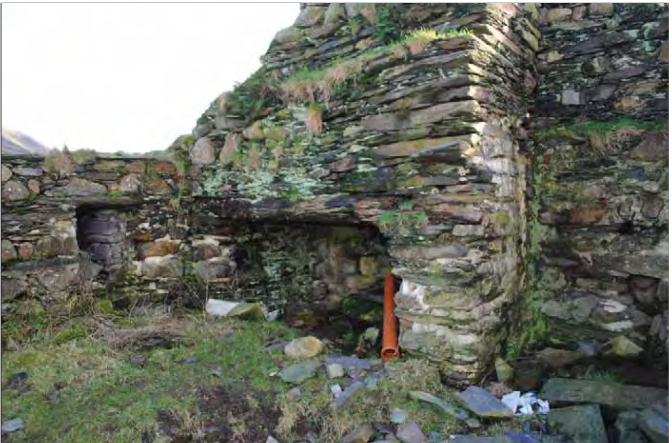
Plate 16: The Inglenook fireplace within Pandy