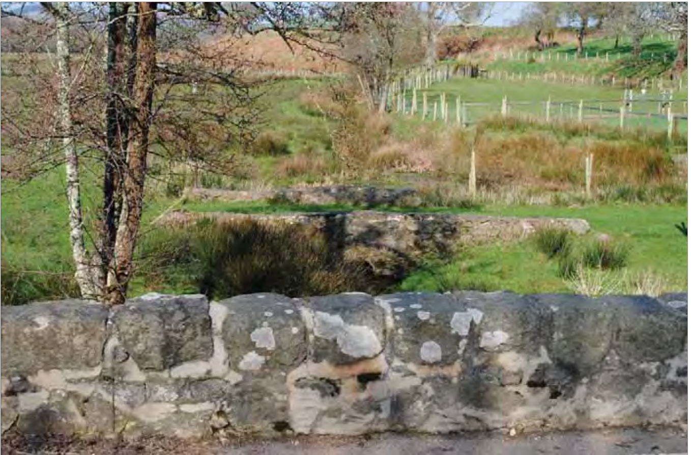
Plate 06: The leat at Felin Rhyd-Hir from the South East