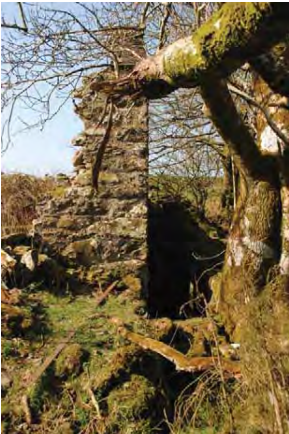
Plate 08: Felin Ynys Goch from the East South East, showing the wheel pit