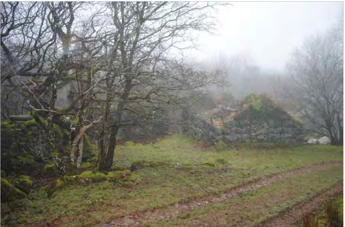
Plate 10: Felin Isaf from the South East