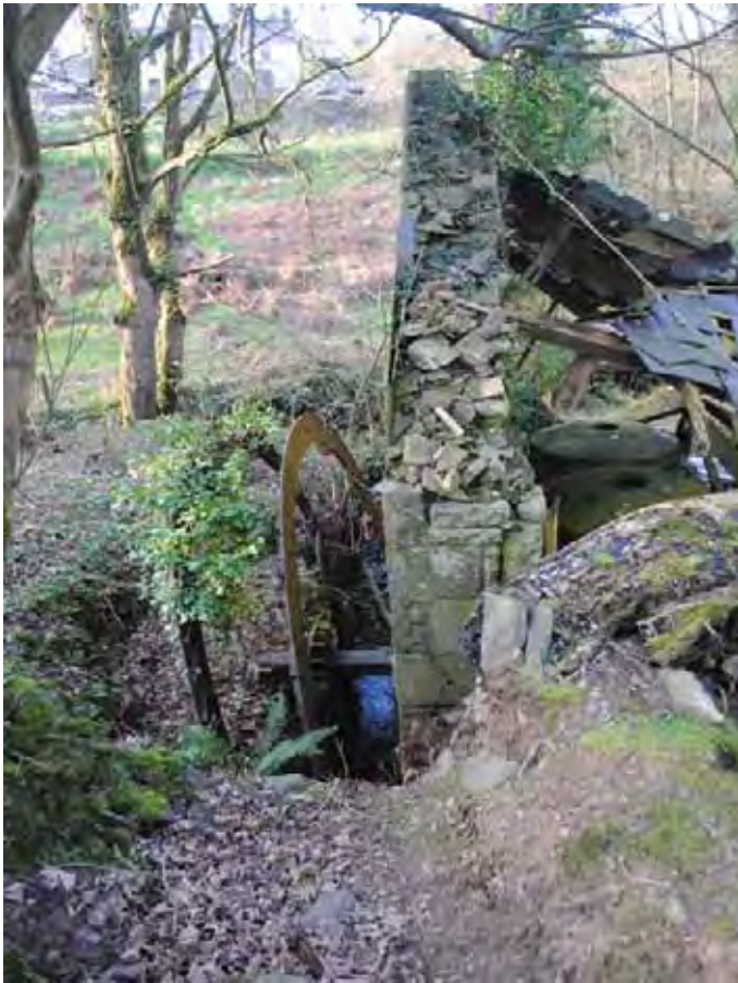
Plate 03: The wheel pit and waterwheel at Felin Trygarn, Bryncreos from the North-West