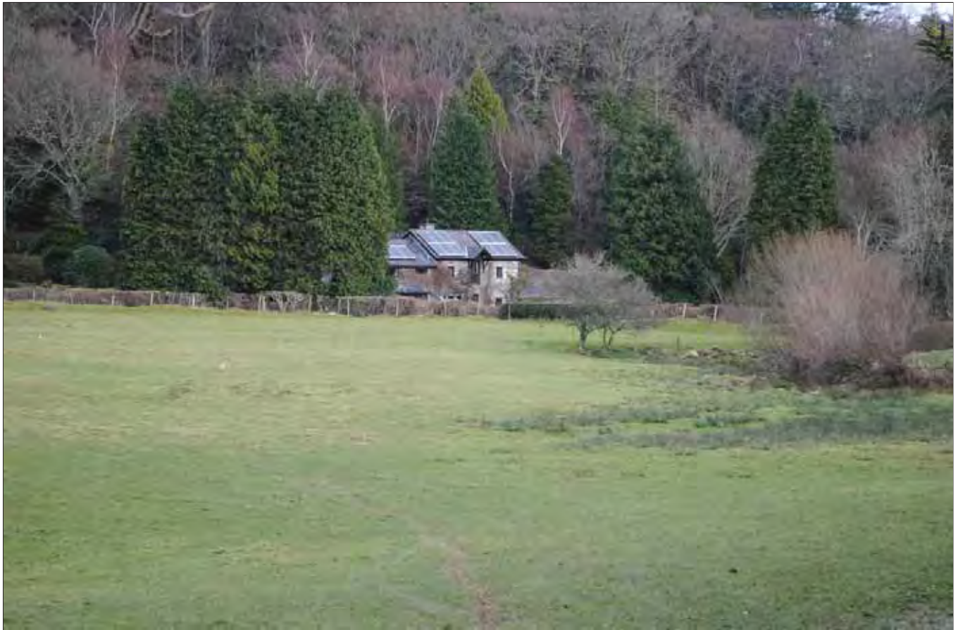
Plate 19: The Converted Felin Bulkeley from the West