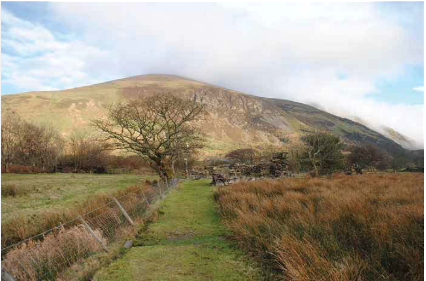
Plate 15: Pandy from the West