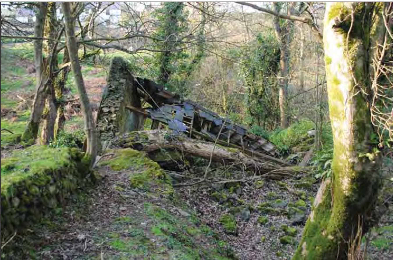
Plate 02: Felin Trygarn from the West