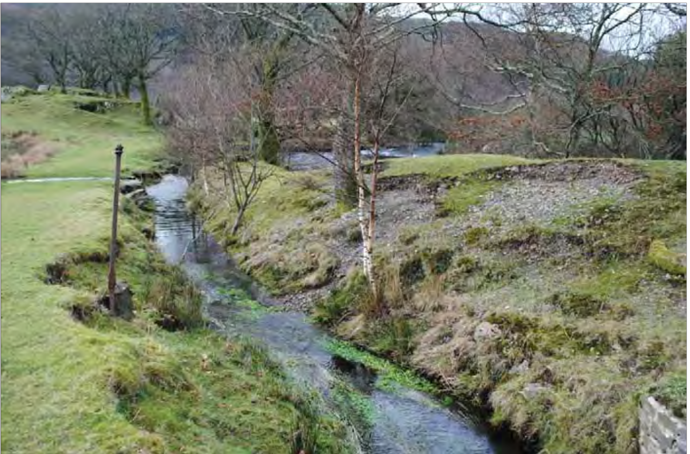
Plate 18: The Leat West of Pandy where it enters the River