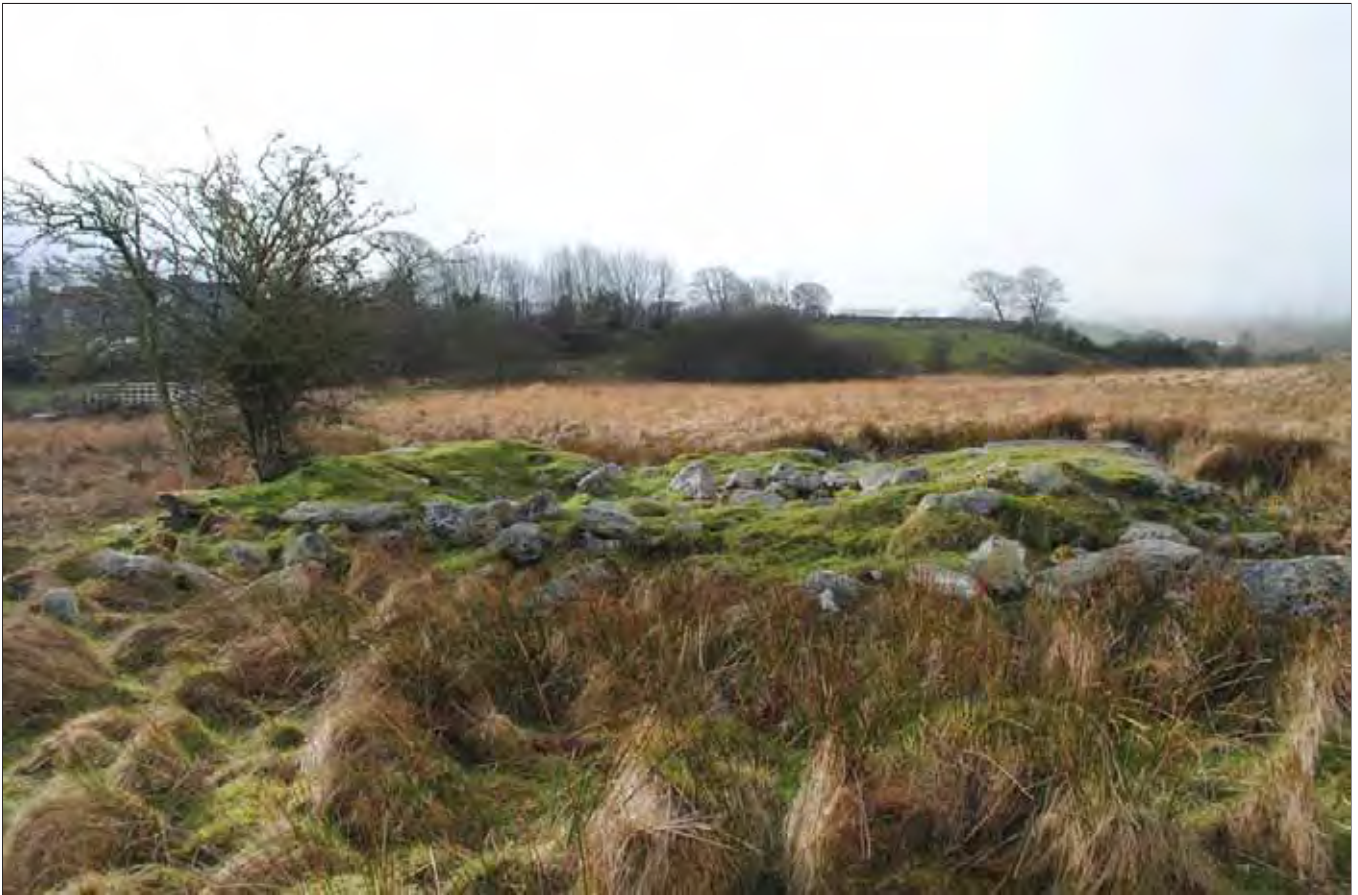
Plate 11: Pandy, Llanllyfni from the South West