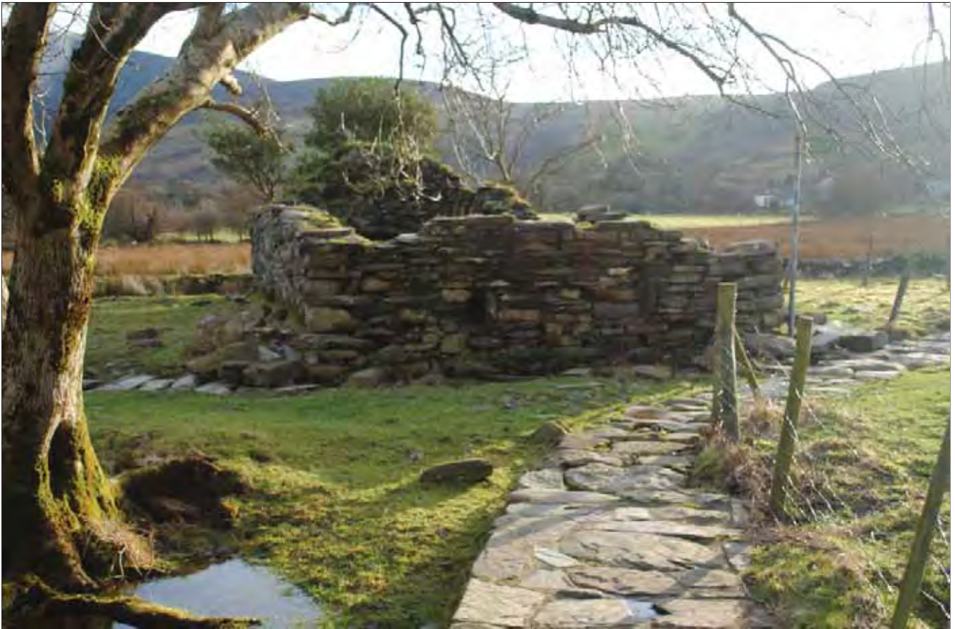
Plate 17: Pandy from the North