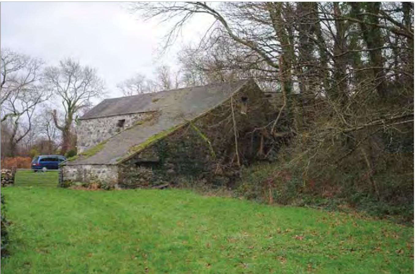
Plate 14: Felin Forgan from the North