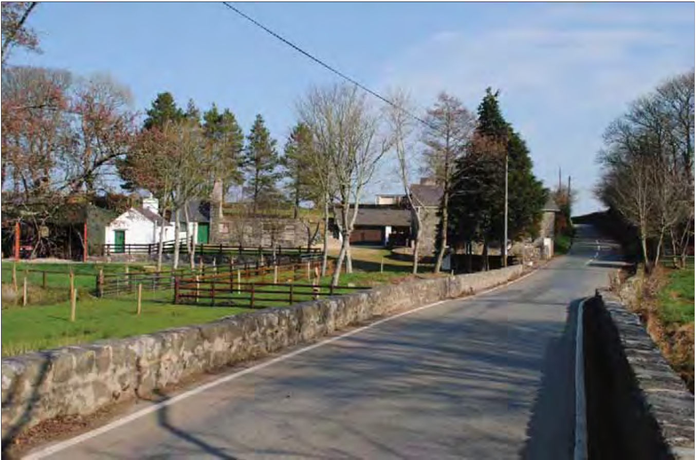
Plate 05: Felin Rhyd-Hir from the West South West