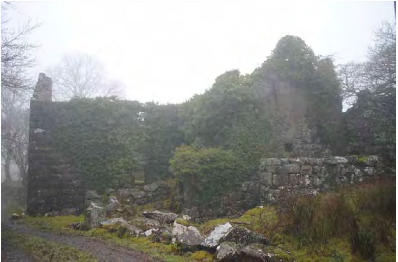
Plate 09: Felin Isaf from the north