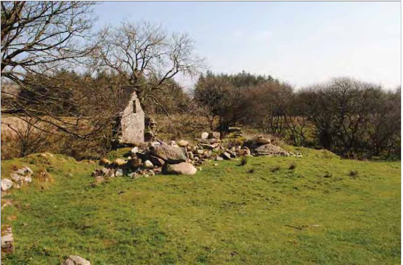
Plate 07: Felin Ynys Goch from the West South West, with the leat to the left