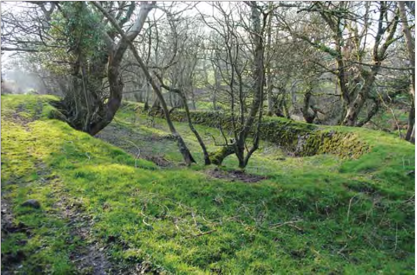
Plate 01: The millpond at Felin Trygarn, Bryncroes from the North-West