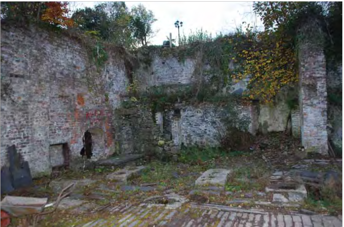
Plate 22: The interior of Penlan Flint Mill from the east