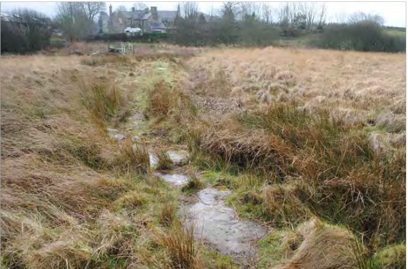
Plate 12: The Leat at Pandy, Llanllyfni from the North North West