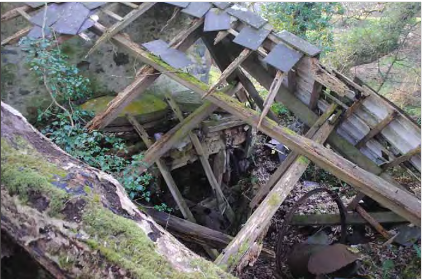
Plate 04: Felin Trygarn from the West, shwing the remains of the Hurst Frame and two millstones