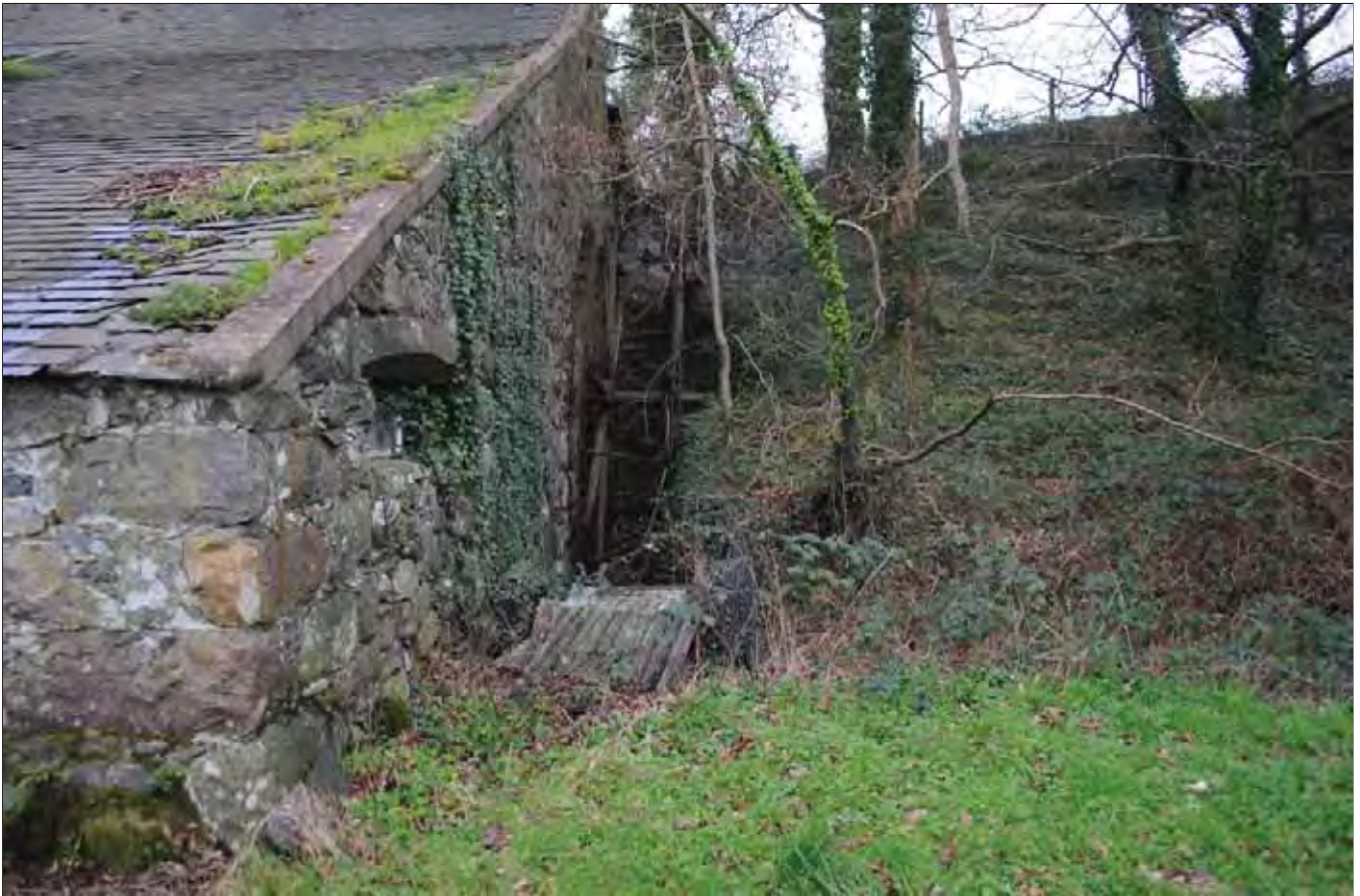
Plate 13: Felin Forgan from the North West showing Mill Wheel and Overshot