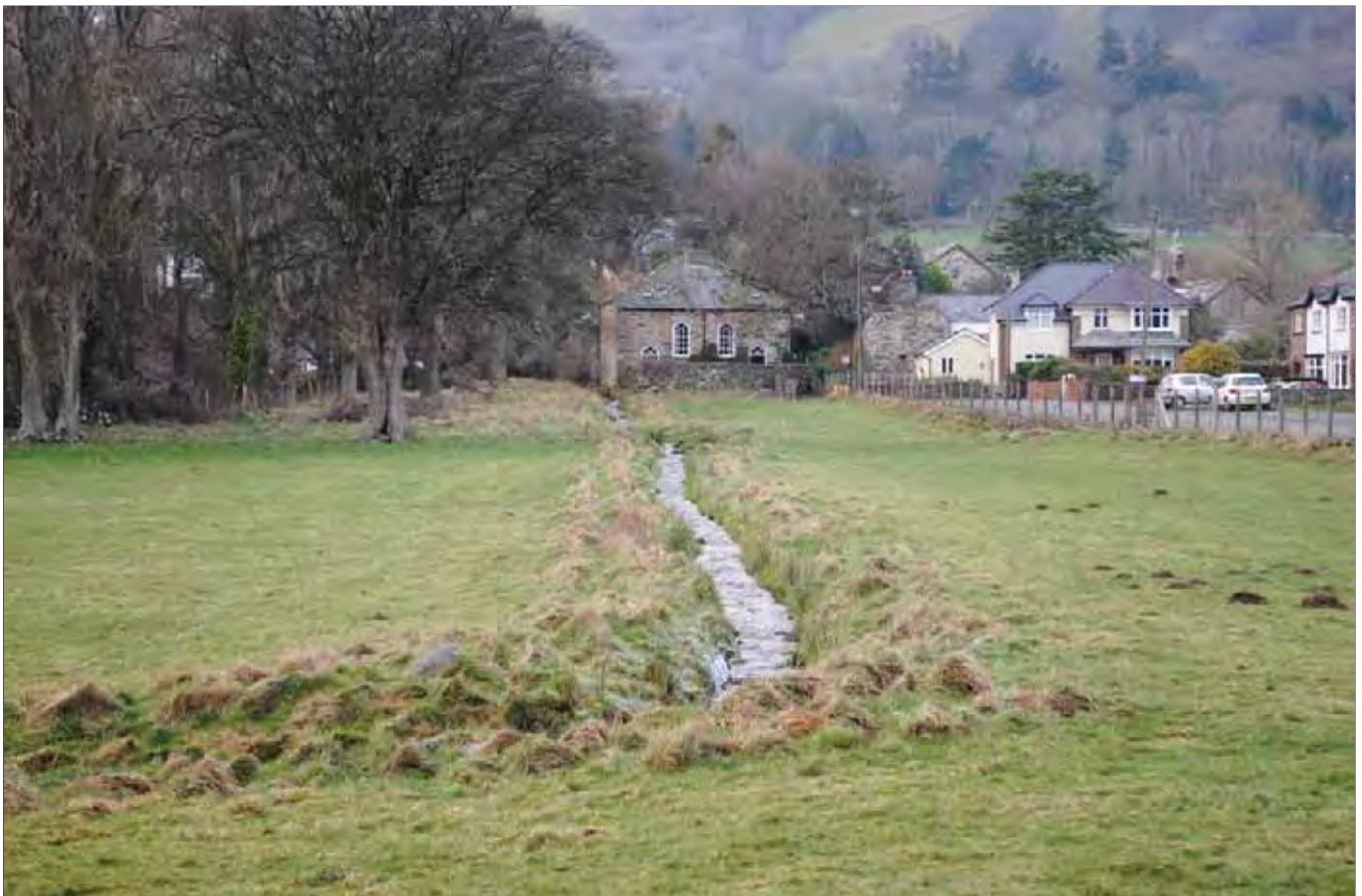
Plate 20: The Leat of Felin Bulkeley from the West North West with Rowen Baptist Chapel