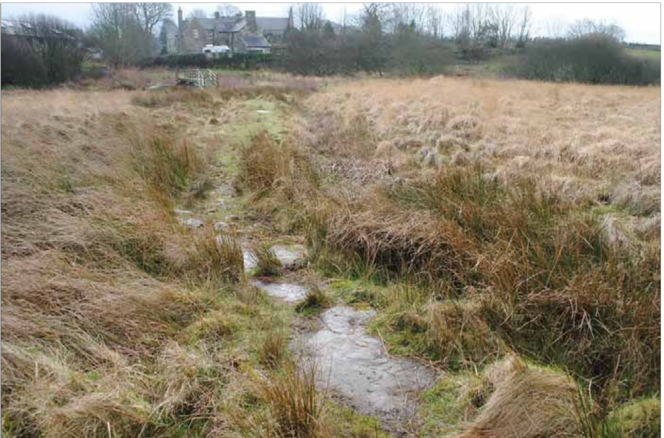
Plate 12: The Leat at Pandy, Llanllyfni from the North North West