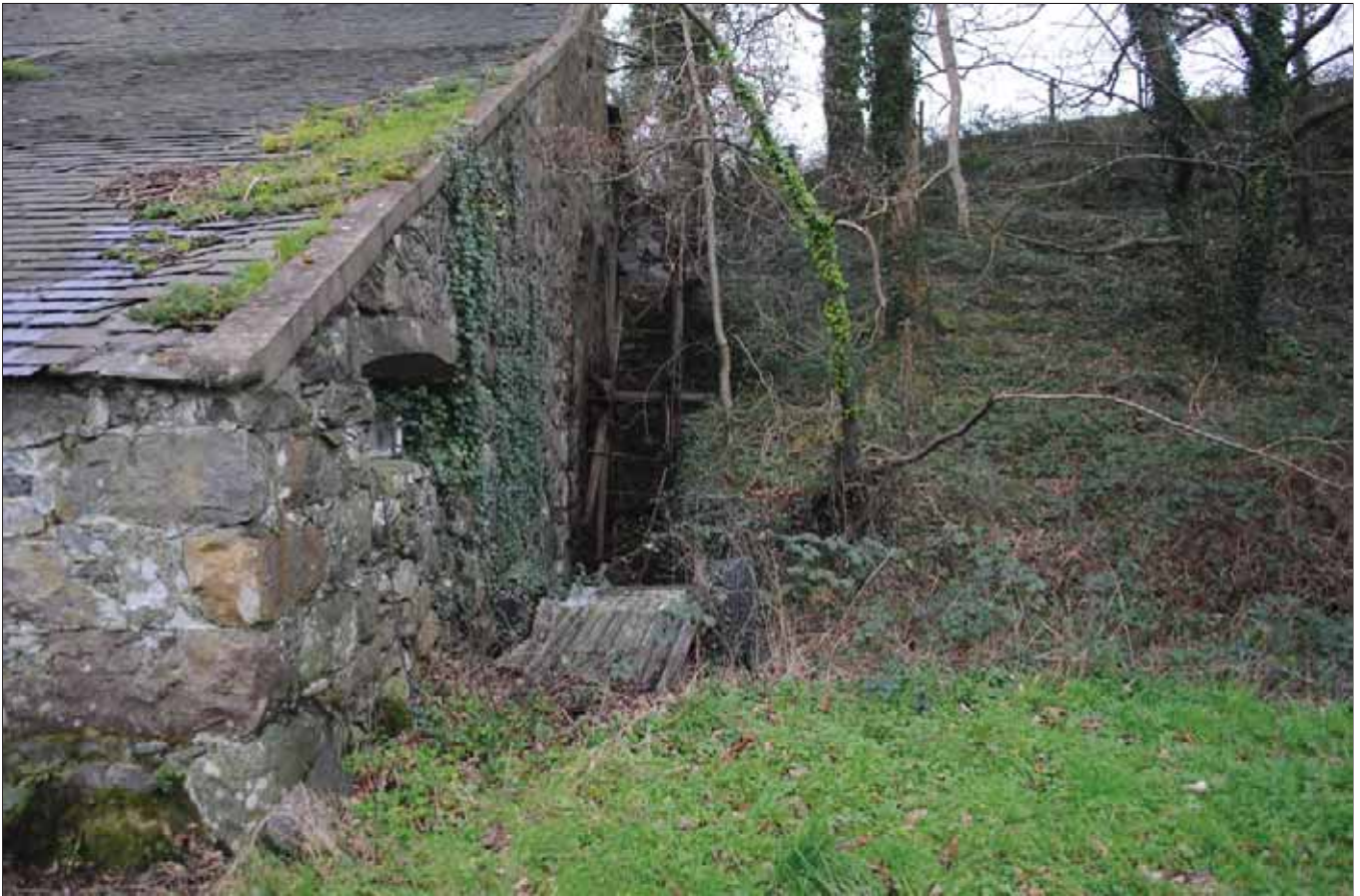
Plate 13: Felin Forgan from the North West showing Mill Wheel and Overshot