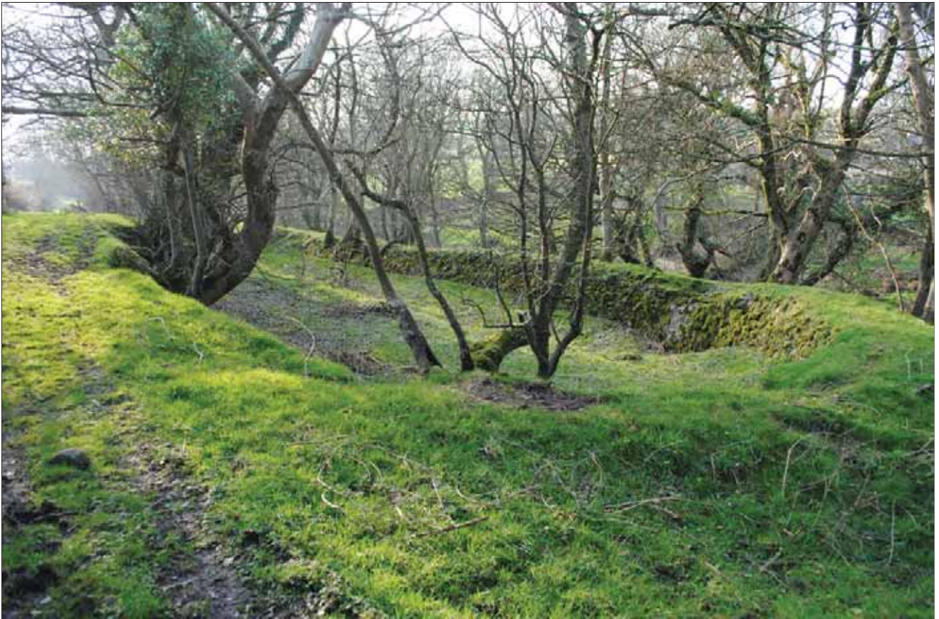
Plate 01: The millpond at Felin Trygarn, Bryncroes from the North-West