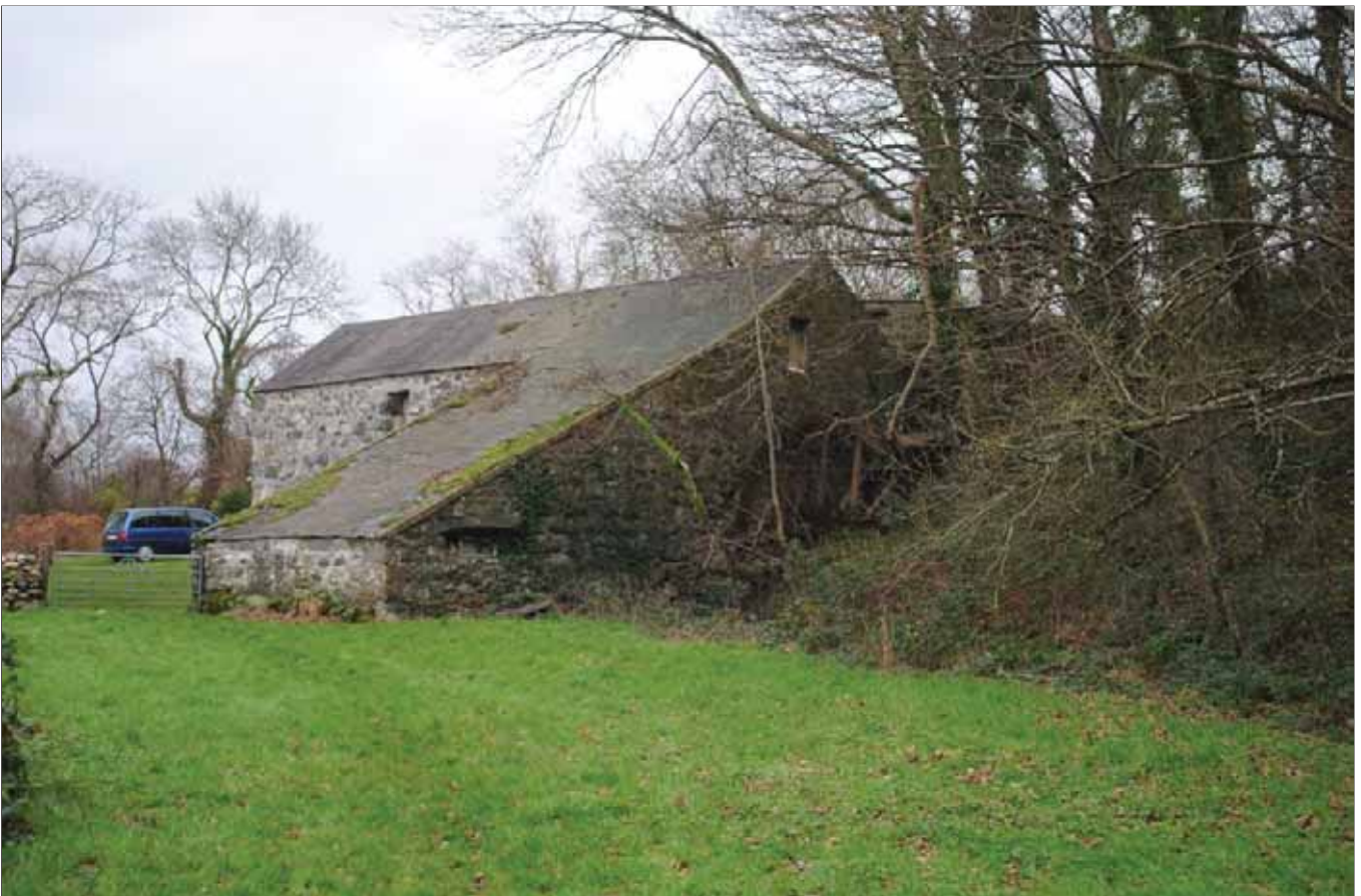
Plate 14: Felin Forgan from the North