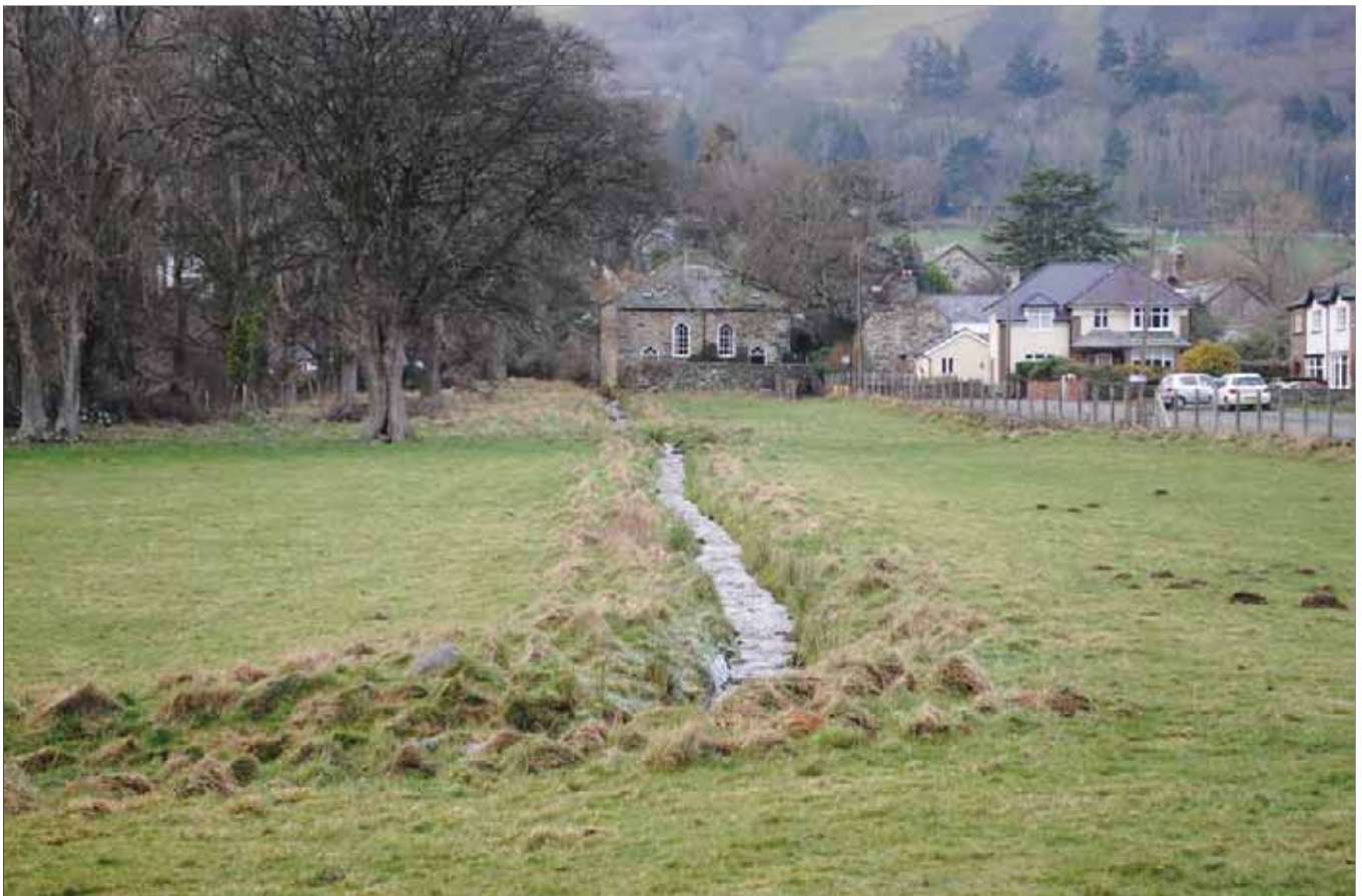
Plate 20: The Leat of Felin Bulkeley from the West North West with Rowen Baptist Chapel