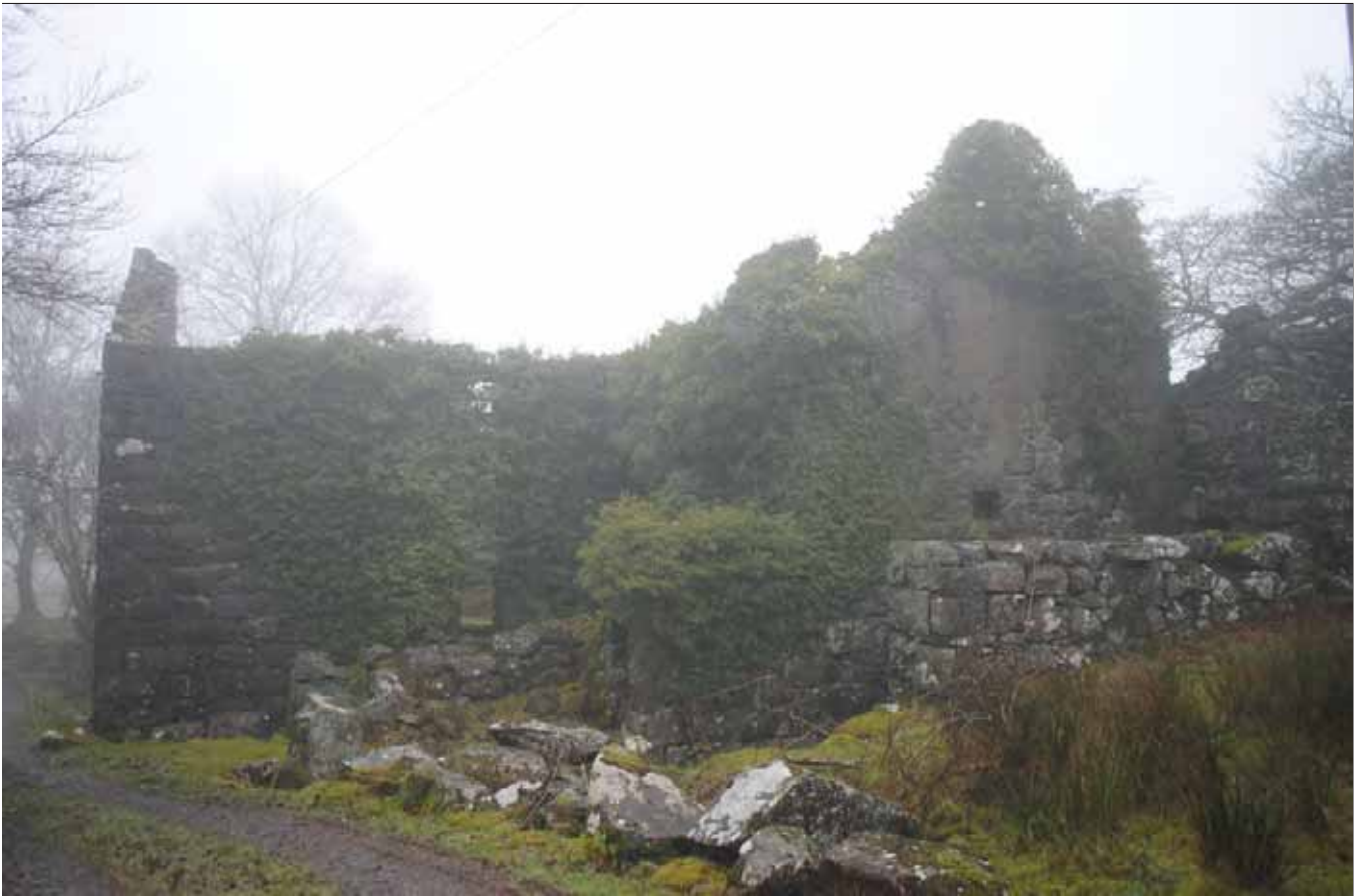
Plate 09: Felin Isaf from the north