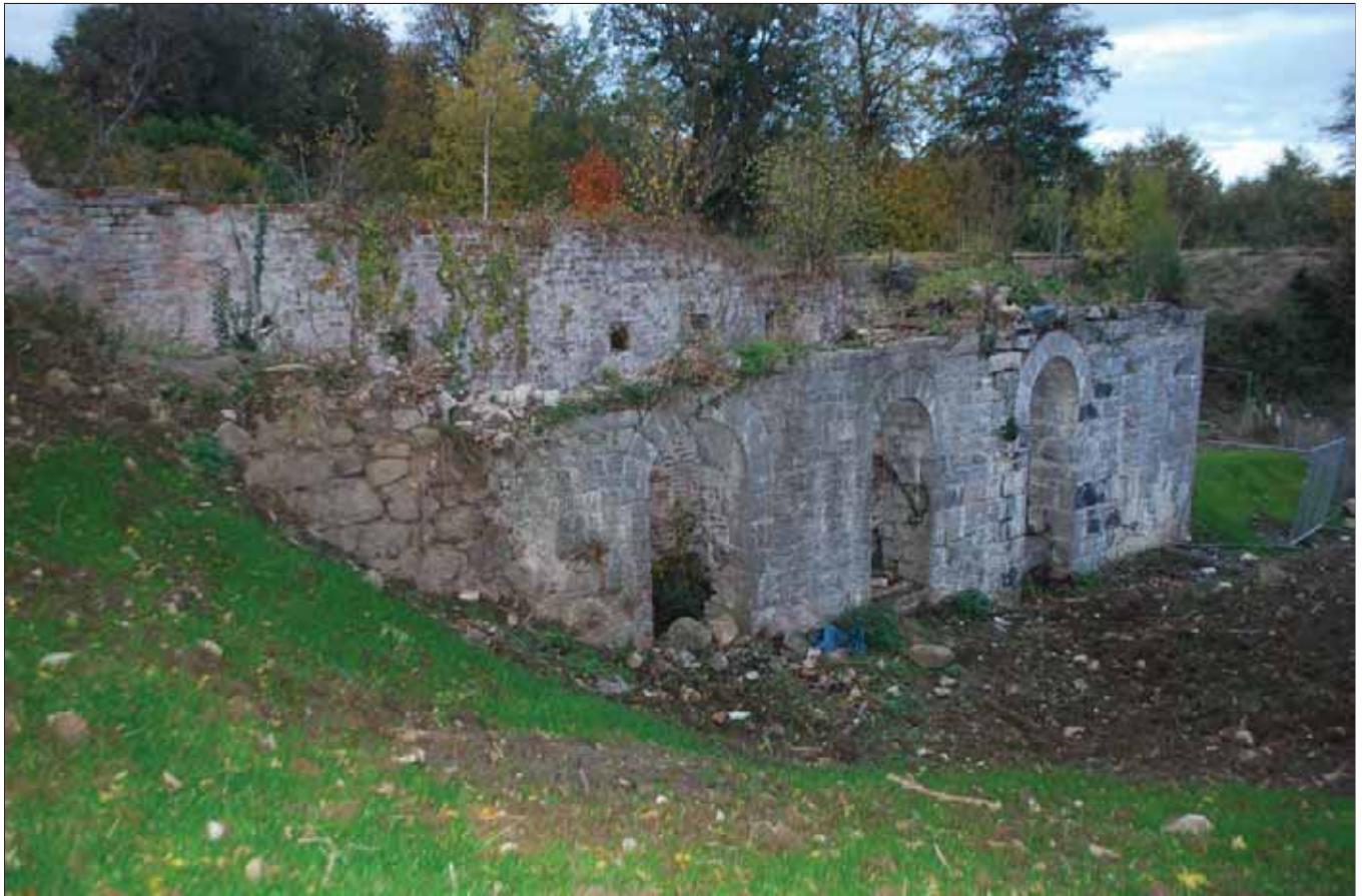
Plate 21: Penlan Flint Mill, Llandegai from the south-west