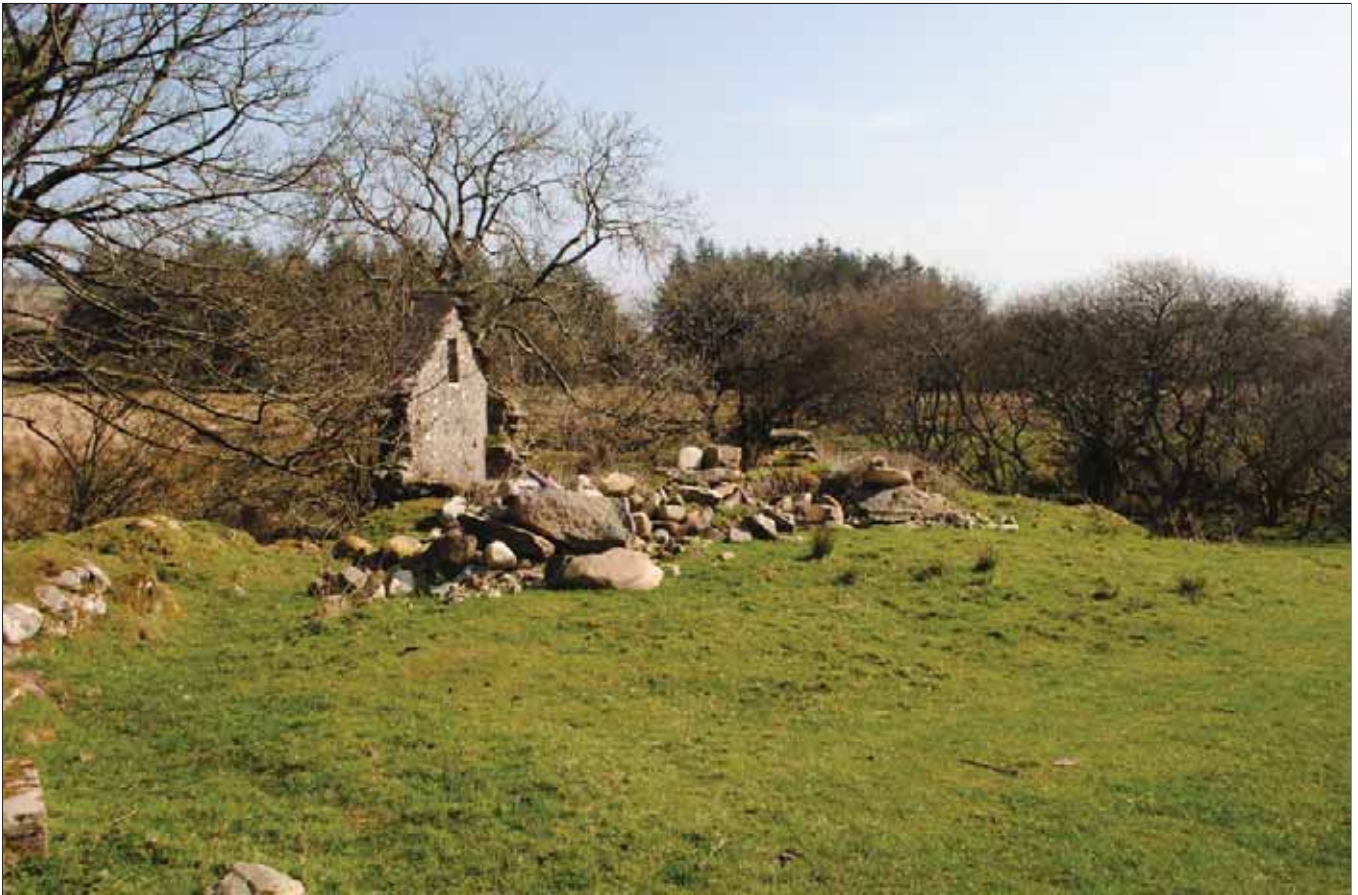
Plate 07: Felin Ynys Goch from the West South West, with the leat to the left