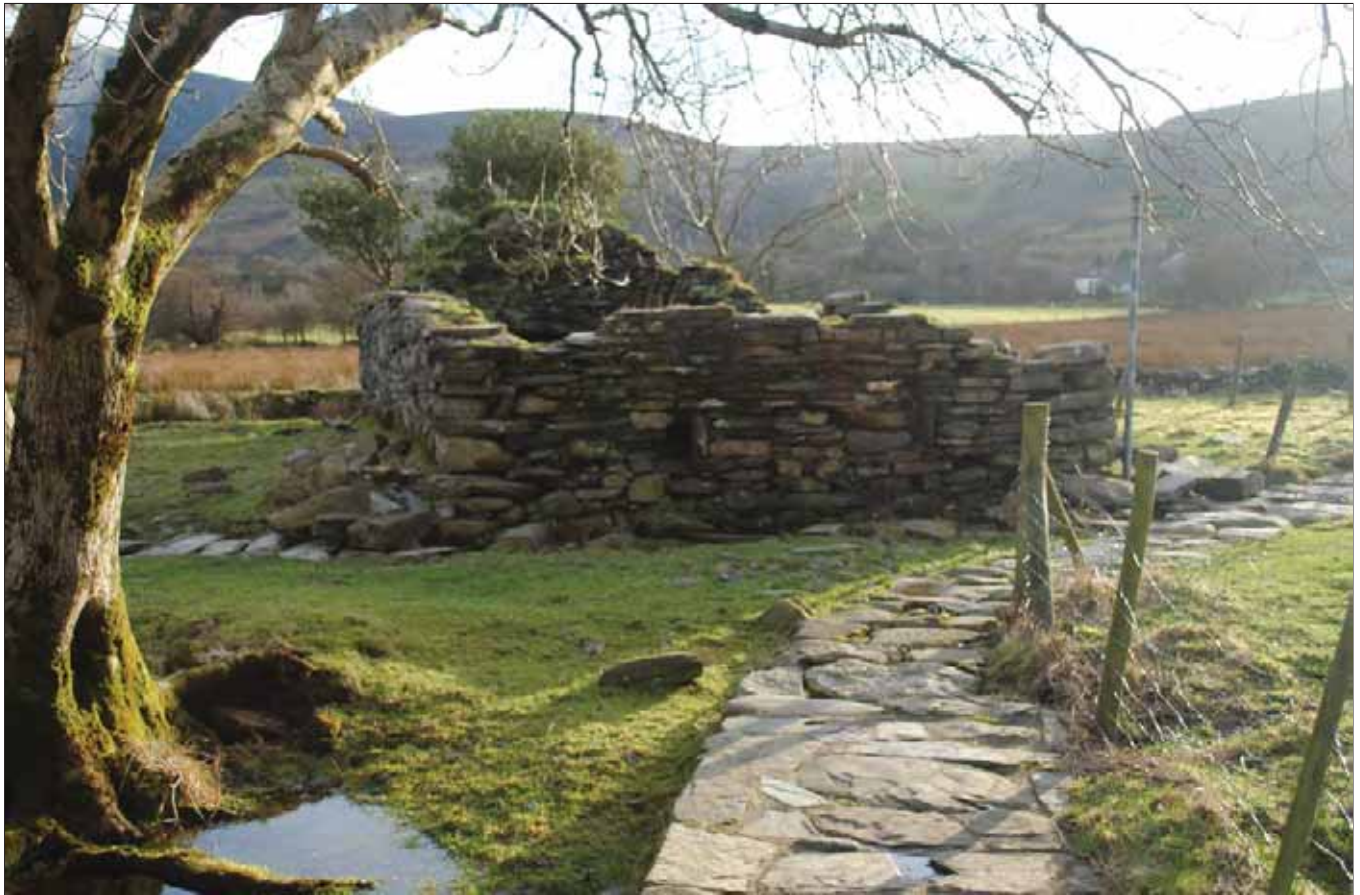
Plate 17: Pandy from the North