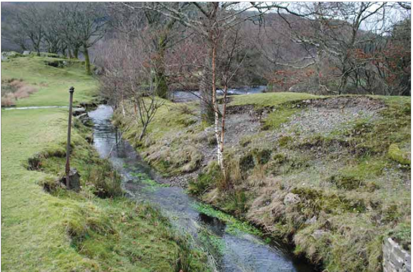
Plate 18: The Leat West of Pandy where it enters the River