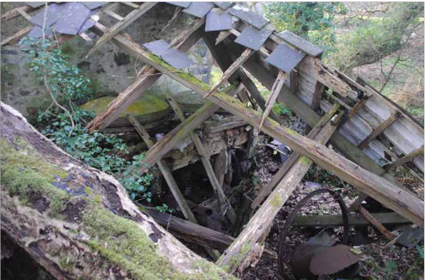
Plate 04: Felin Trygarn from the West, showing the remains of the Hurst Frame and two millstones