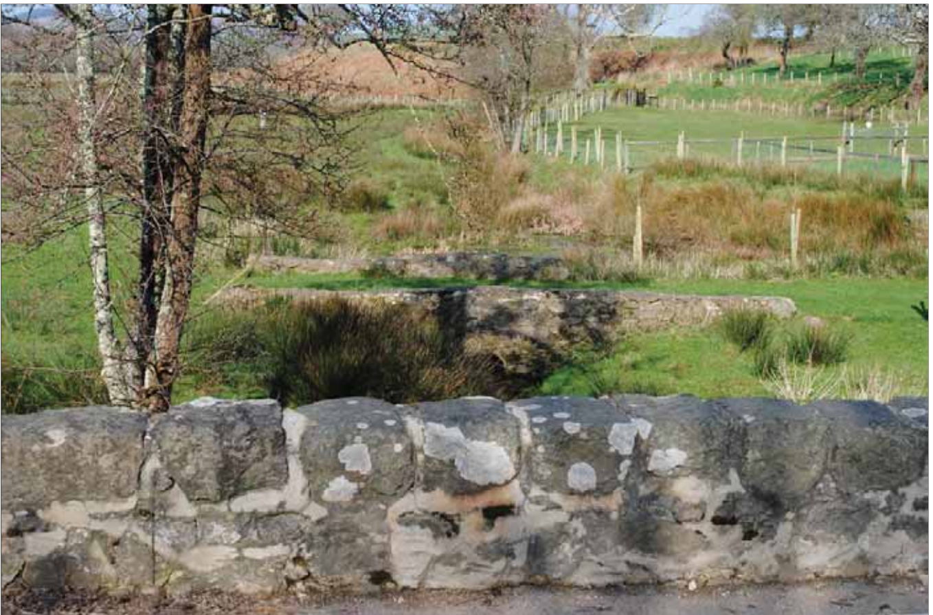
Plate 06: The leat at Felin Rhyd-Hir from the South East