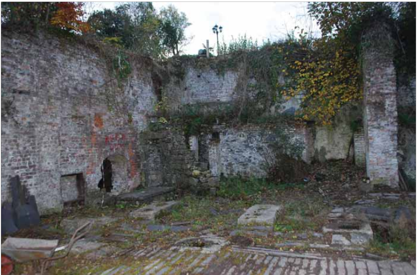
Plate 22: The interior of Penlan Flint Mill from the east