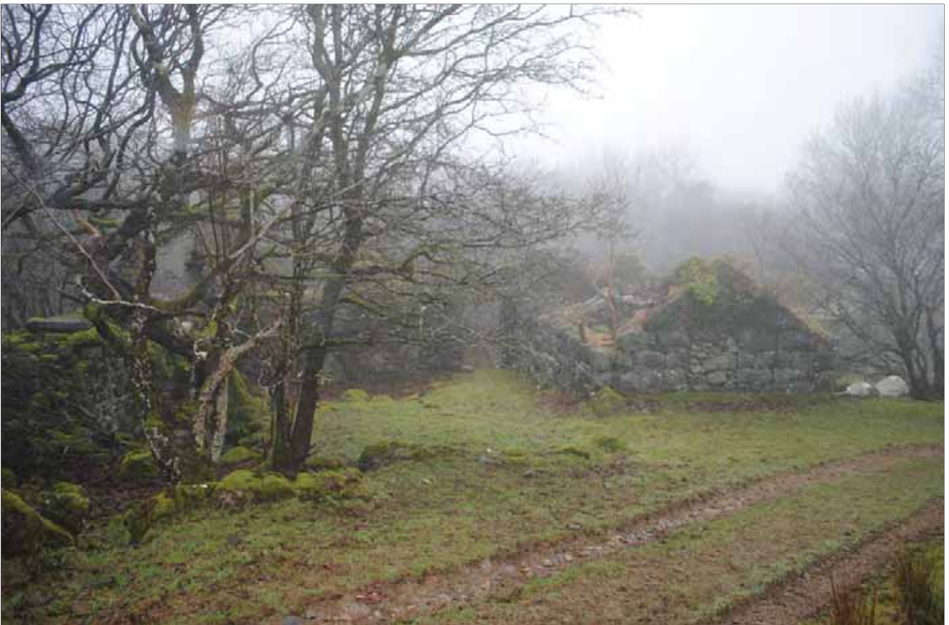
Plate 10: Felin Isaf from the South East