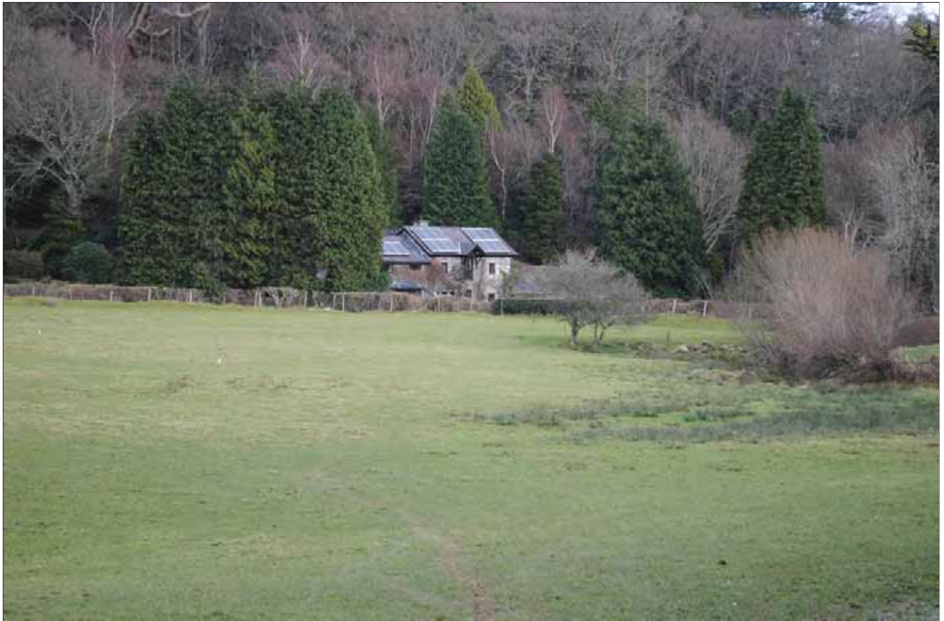
Plate 19: The Converted Felin Bulkeley from the West