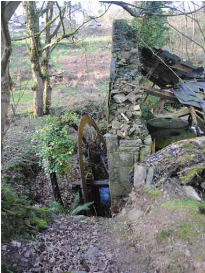
Plate 03: The wheel pit and waterwheel at Felin Trygarn, Bryncreos from the North-West