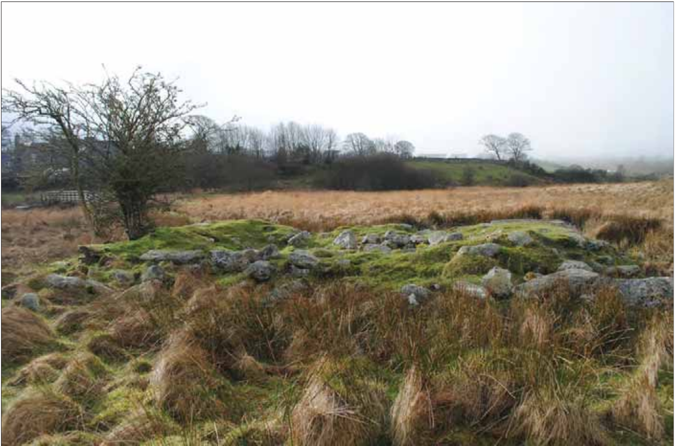
Plate 11: Pandy, Llanllyfni from the South West