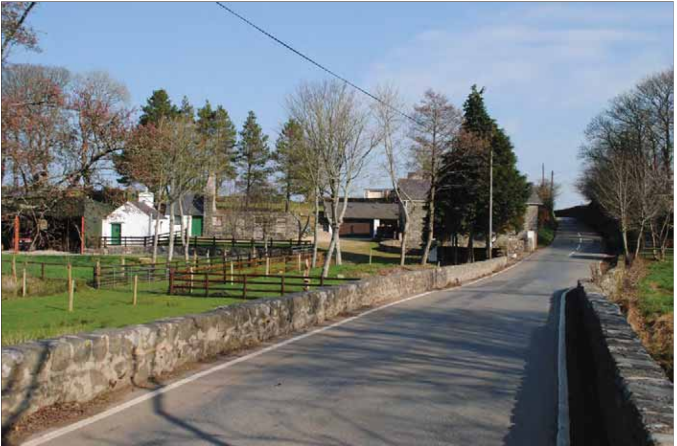
Plate 05: Felin Rhyd-Hir from the West South West