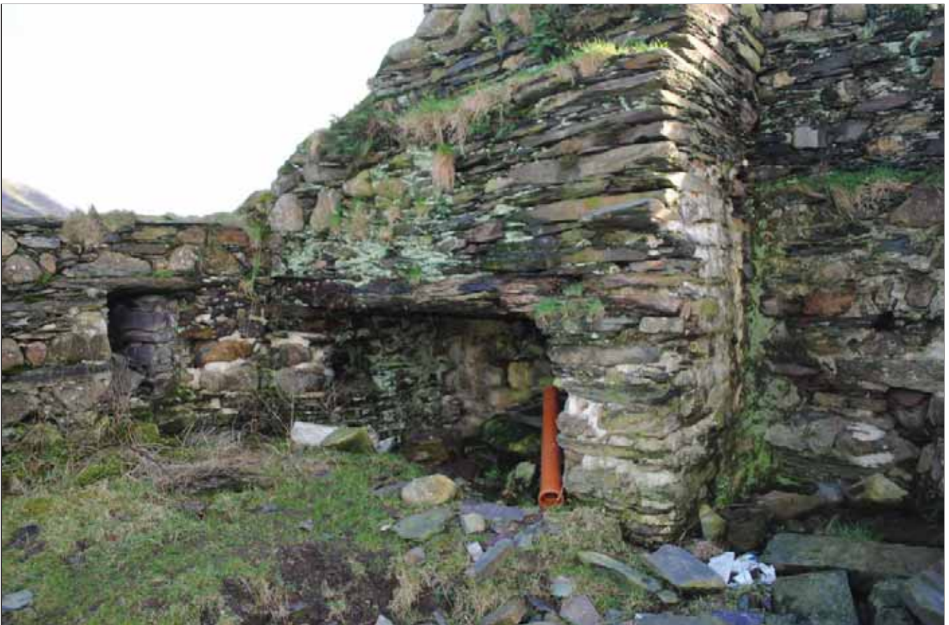
Plate 16: The Inglenook fireplace within Pandy