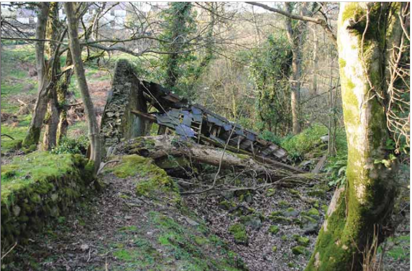
Plate 02: Felin Trygarn from the West