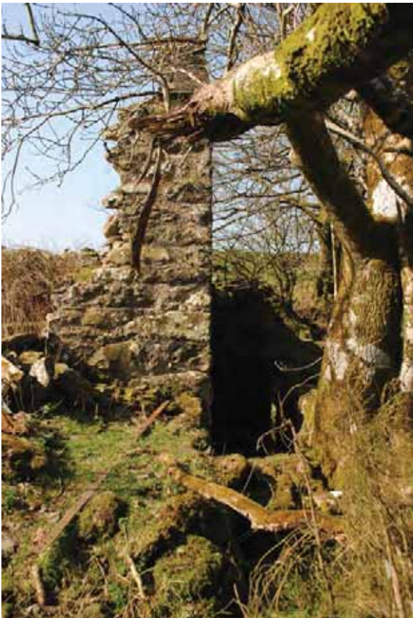
Plate 08: Felin Ynys Goch from the East South East, showing the wheel pit