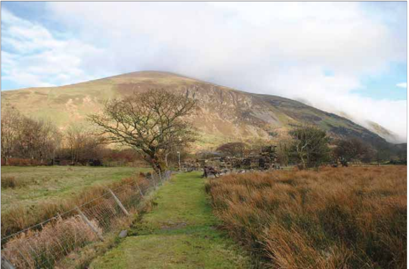
Plate 15: Pandy from the West