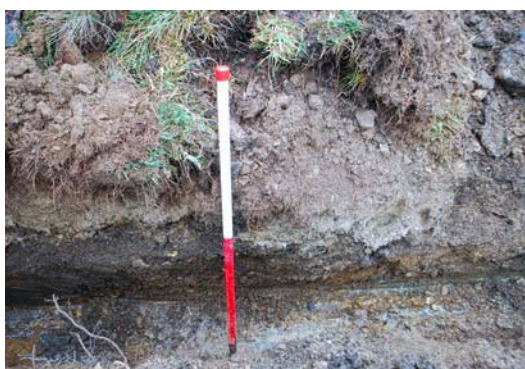
Plate 06 - Excavation of footings for new pole 25A, about 30m from site 06. View from the north