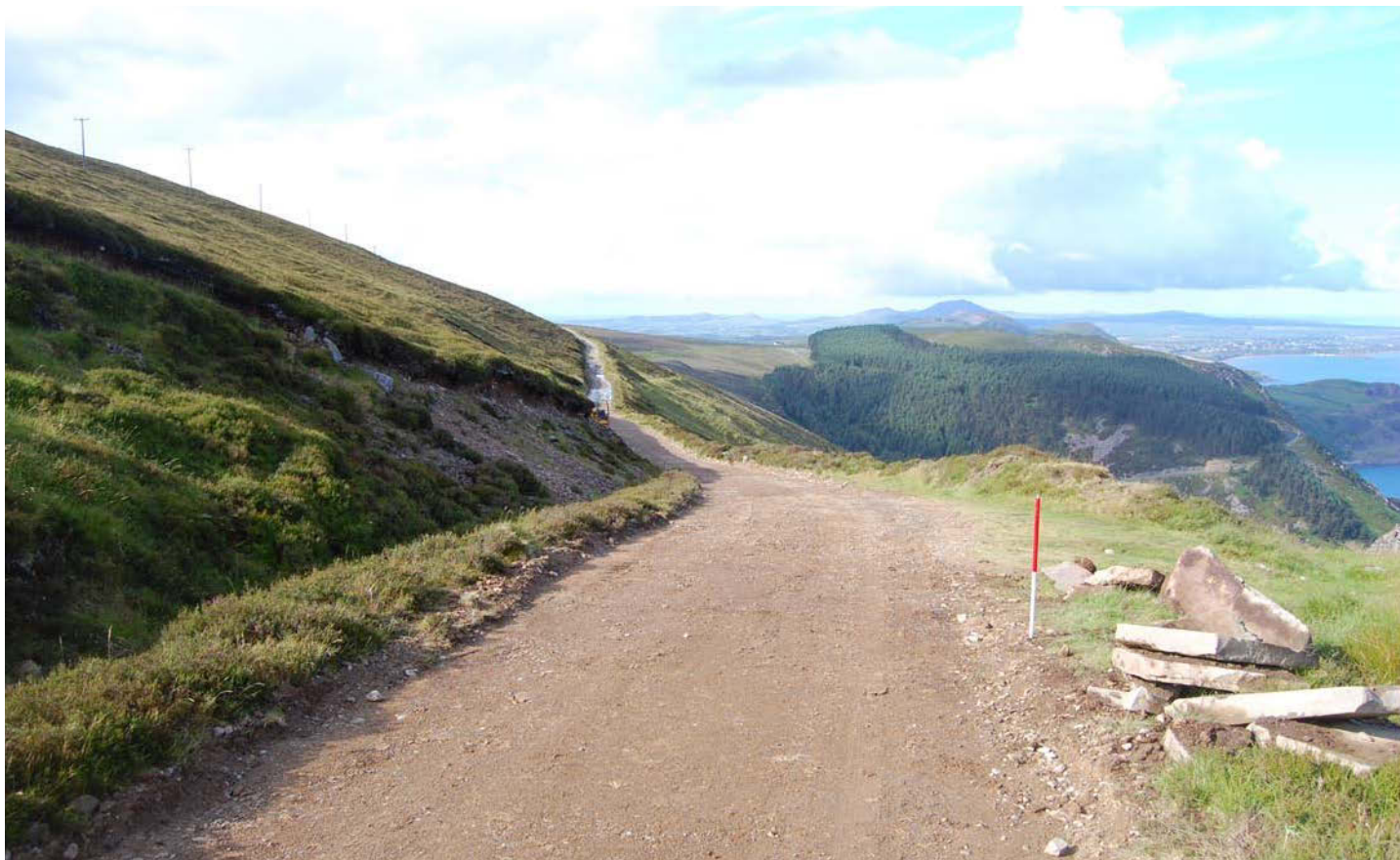
Above: Plate 04 - Re-instated section of trackway with bur- ied cable below. View from the north. Scale 1m