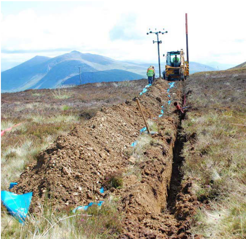
Below: Plate 01 - Cable trench excavation looking toward pole 25A. View from the west