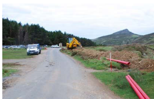
Plate 09 - Excavation of cable trench close to pole 03