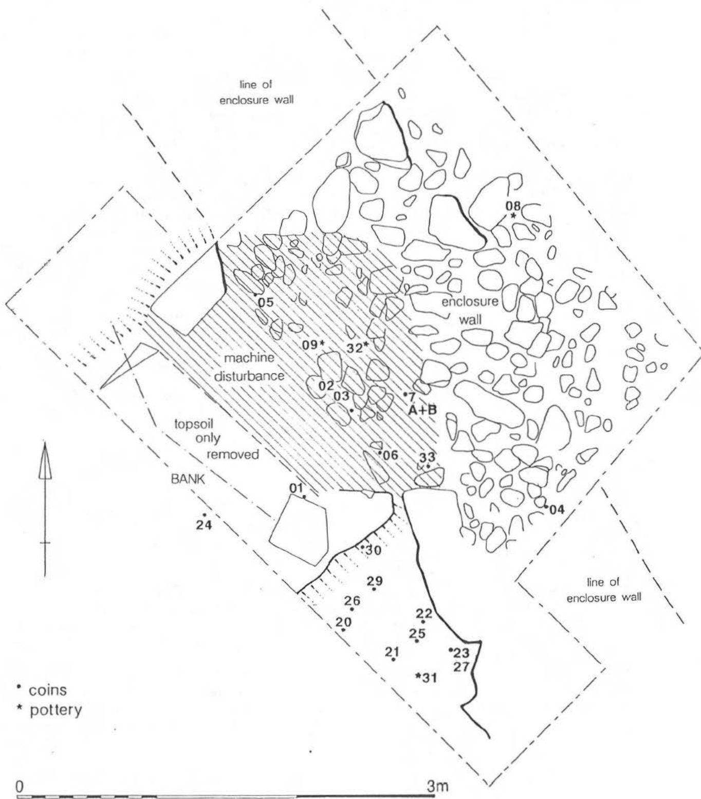
Fig. 3. Excavation Area A.