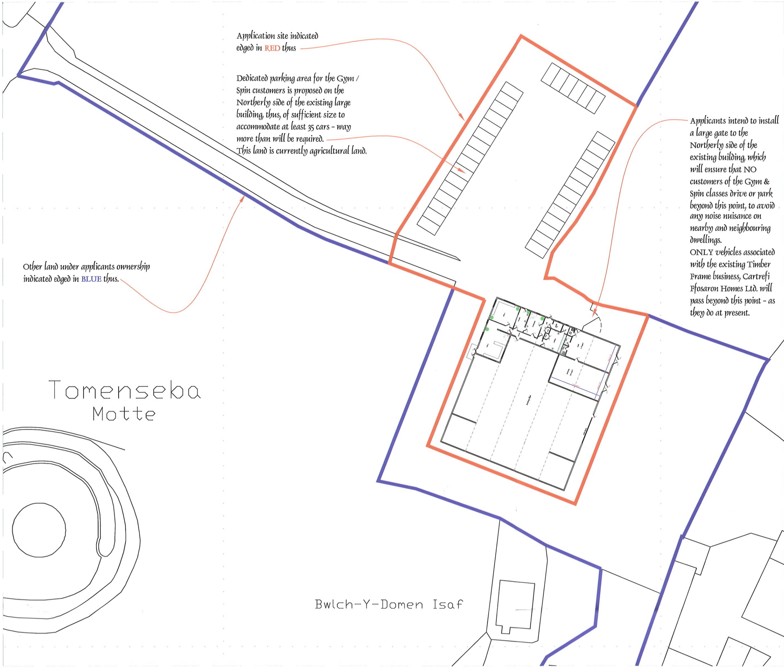
Site Plan - As Proposed 1:500