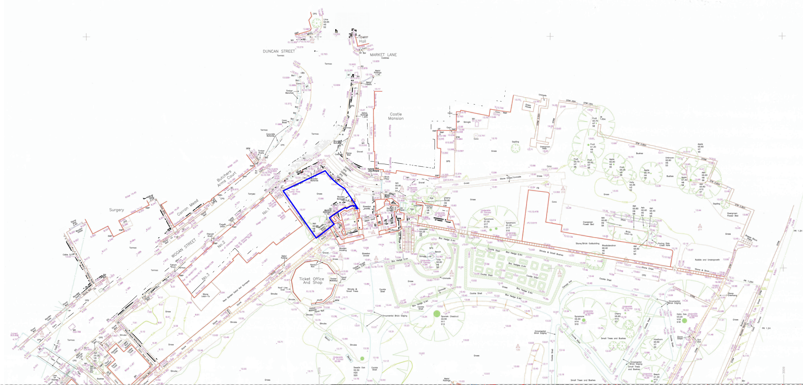
P 200.1 SURVEY PLAN SHOWING AREA OF WORKS SCALE 1:500@A3

Responsibility is not accepted for errors made by others scaling from this drawing. All construction information should be taken from figured dimensions only. Dimensions are in millimetres unless otherwise stated. All dimensions and conditions are to be checked on site prior to preparing drawings or commencing any work. Any variations or supplementary drawings are to be approved by the Architect.