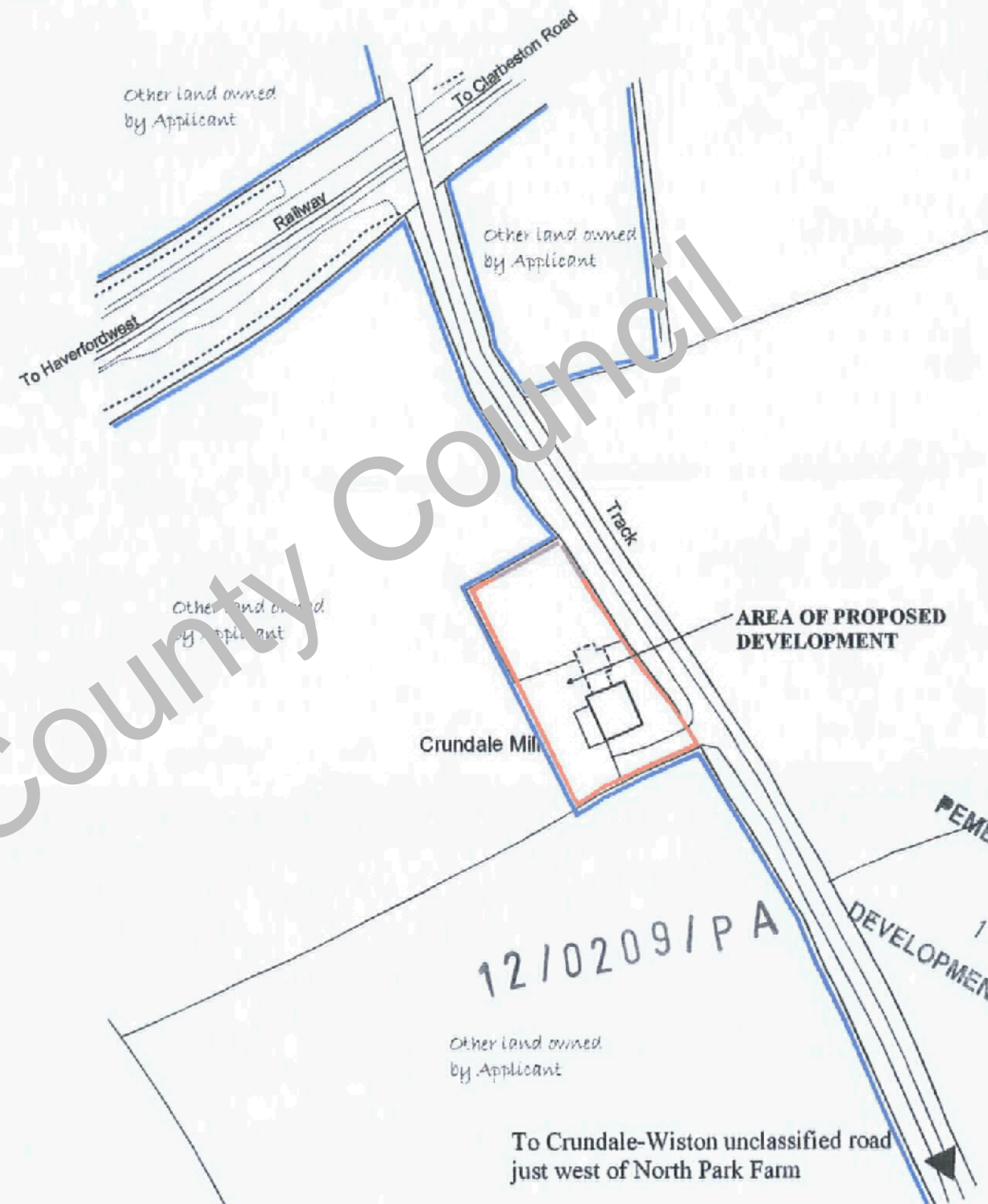
Location Plan - 1:1250