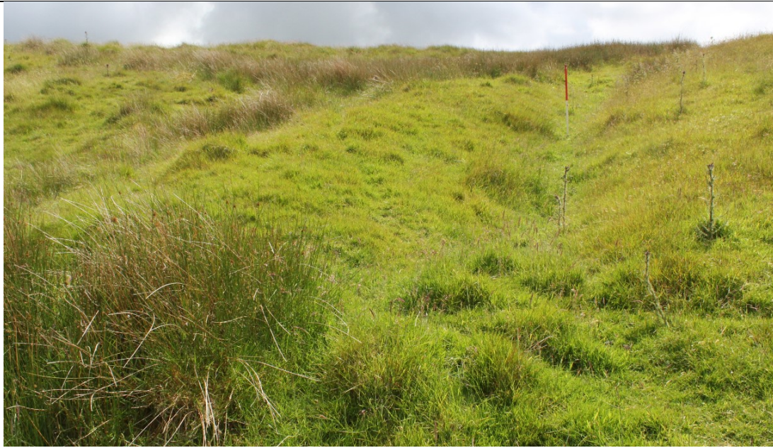
PRN 127894 a mound of unknown age and function, looking south.