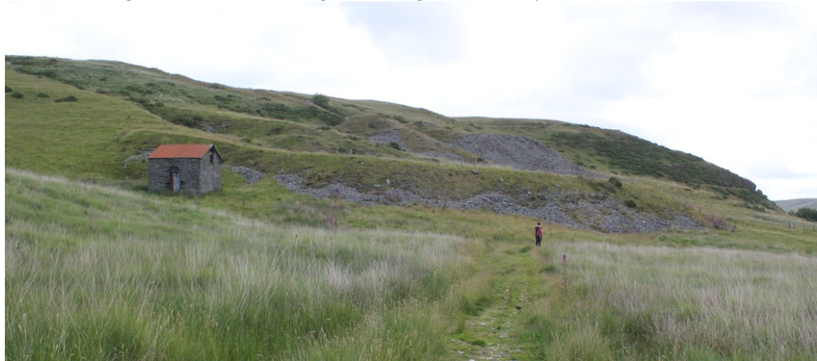
Building PRN 56534 and waste tips PRN 37221 behind.