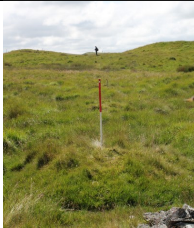
Line of mounds PRN 37212, in line with distant figure