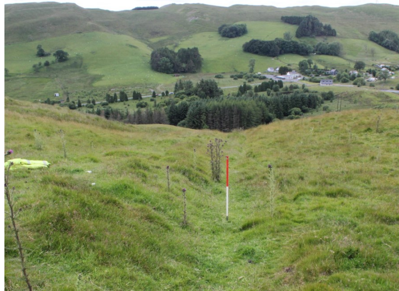
The course of flat rods between the wheel pit PRN 37218 and the winding engine house PRN 37211. Looking southwest.