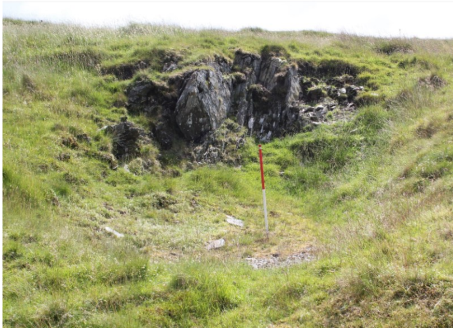
PRN 37203 Disused shaft and spoil tip