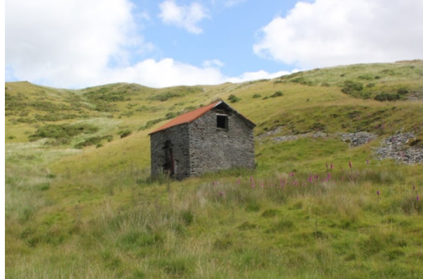
PRN 56534 looking southwest (left) and looking northeast (right) with waste tips to the rear.