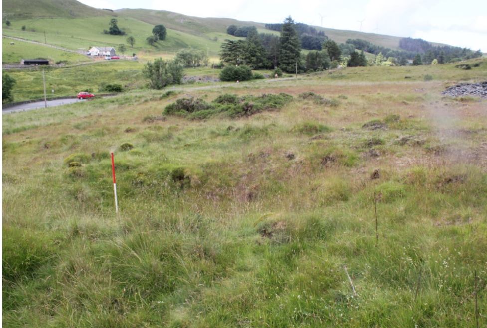
PRN 97378 Shaft and earthwork waste tips seen from the northeast looking southwest.