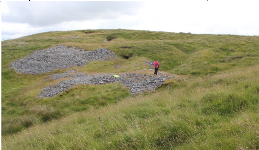
PRN 37209 Disused shafts and spoil heaps (PRN 37208).