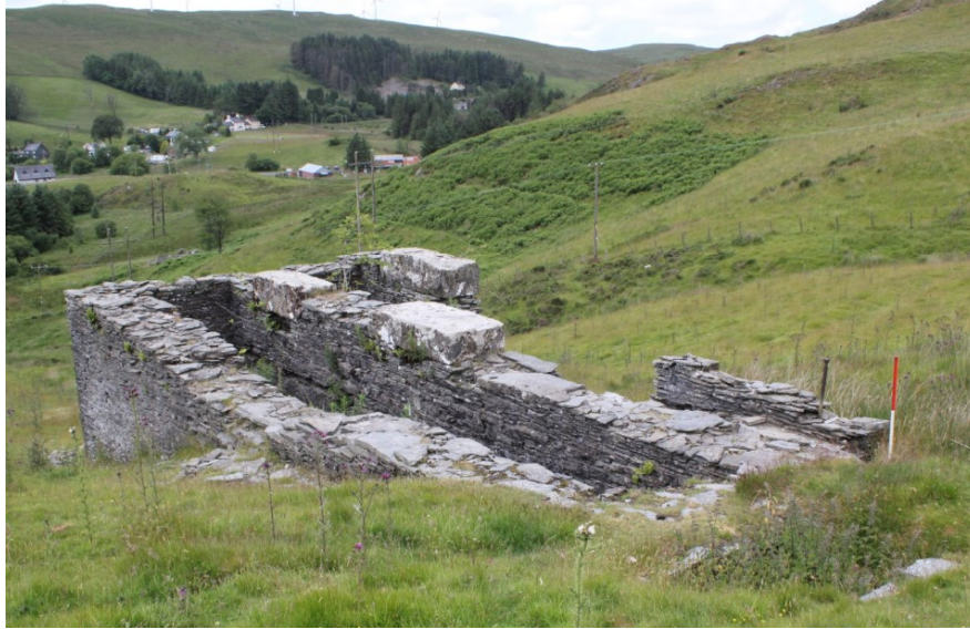
Wheel pit PRN 37218 looking west