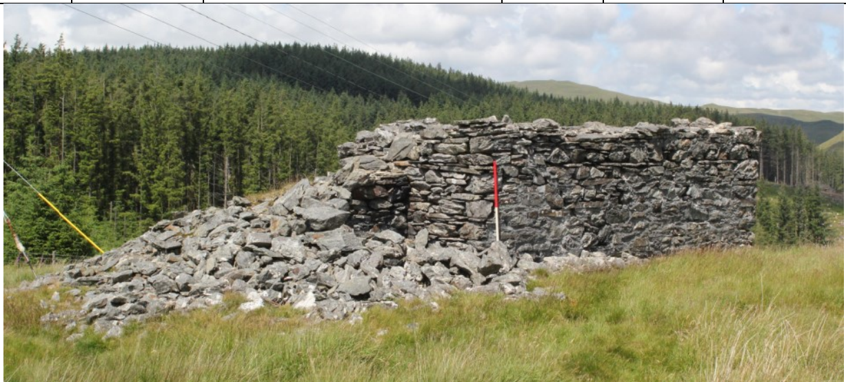
The Engine House PRN 37211 looking north