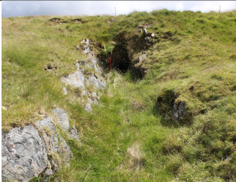
PRN 37210 Disused shaft