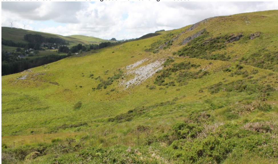
Course of the leat PRN37154 above and leat PRN 37165 below running along the hillslope looking west.