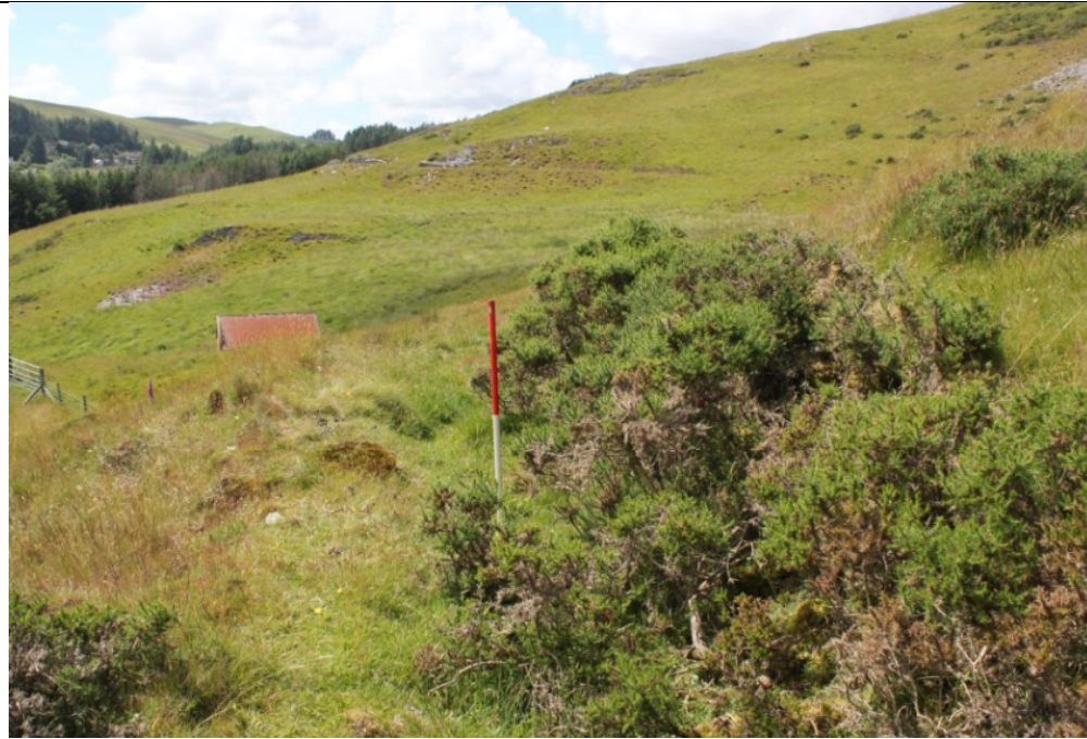
The course of leat PRN 37165 looking west.