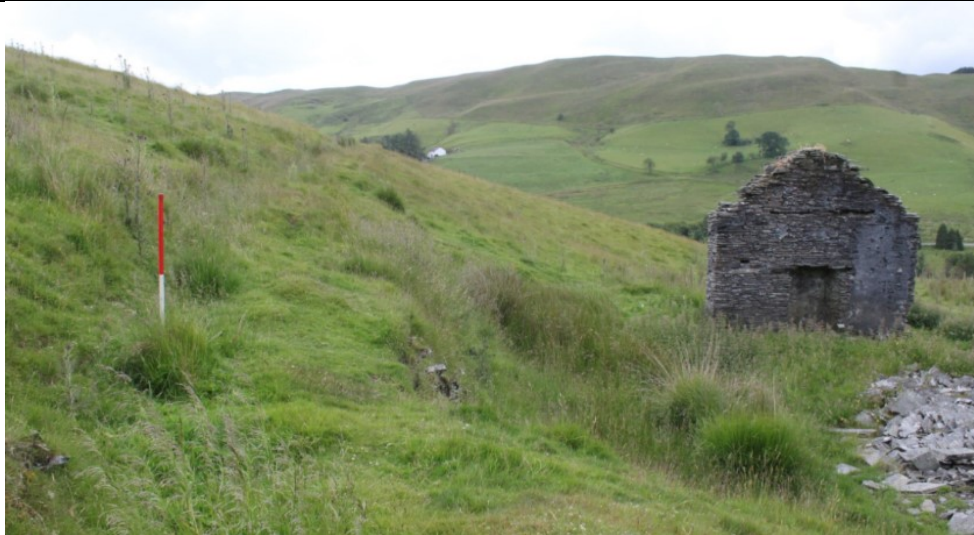
Course of the leat PRN37154 looking south from building PRN56533