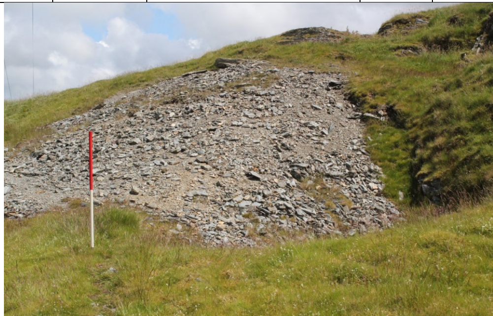
PRN 37202 Disused shaft and spoil tip