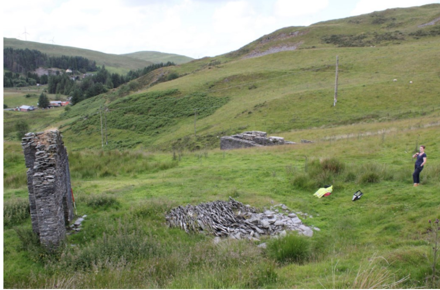
Remains of building PRN 56533 looking west towards wheel pit PRN 37218.