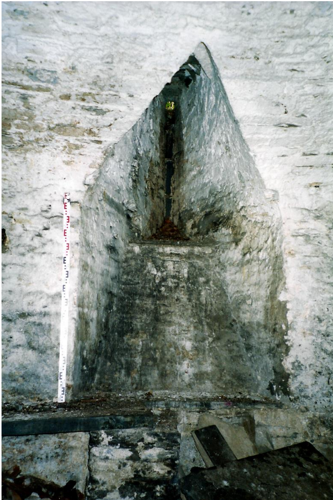
Cardigan Castle North Tower basement W arrow-slit