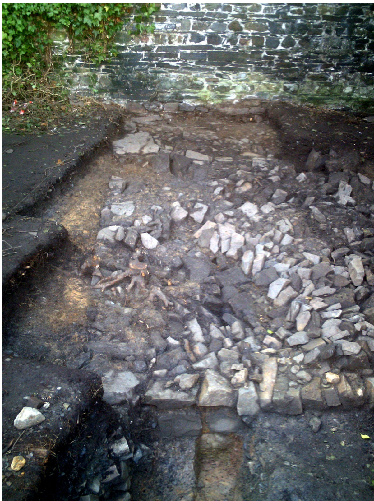
Cardigan Castle - Square foundation of 1171 structure discovered NW of Green Street – Glen K Johnson (2012)