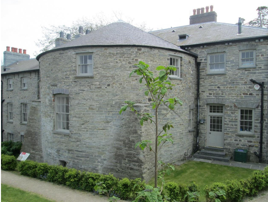
Cardigan Castle North Tower