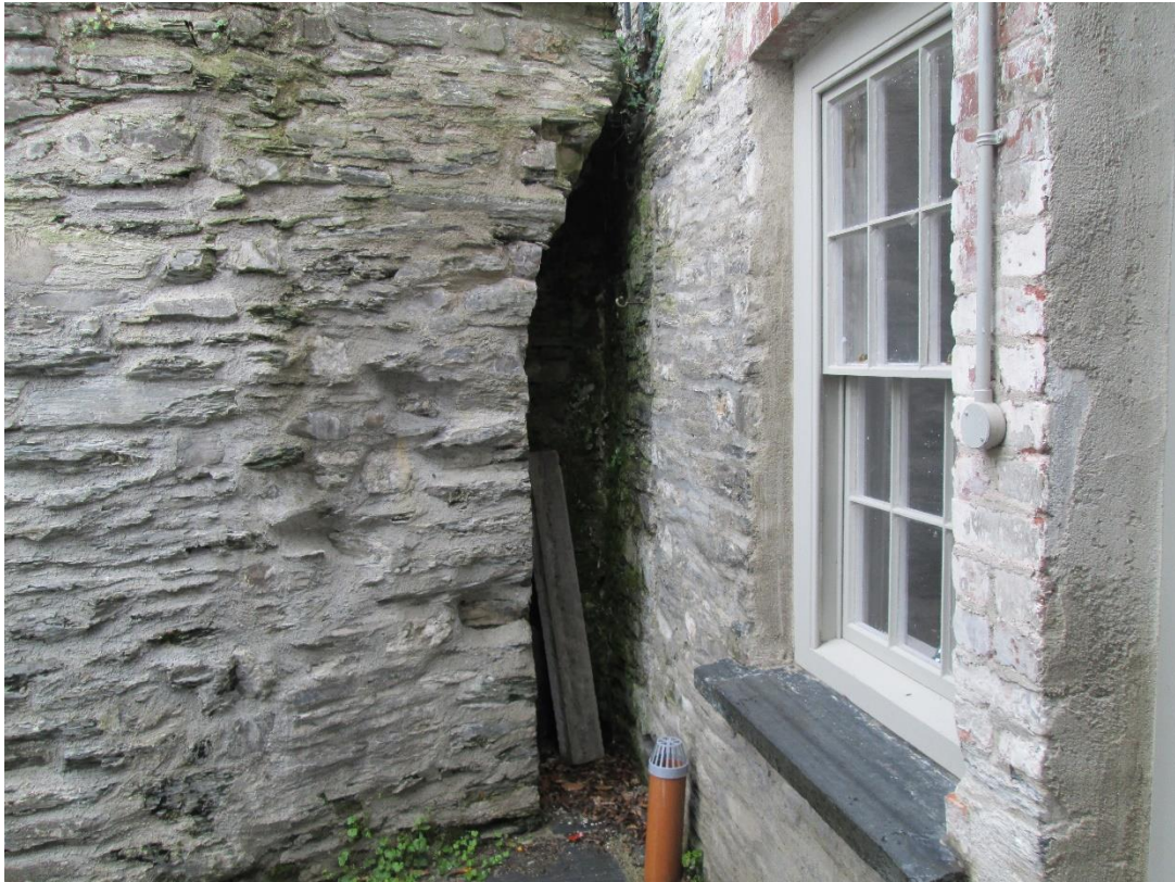
Cardigan Castle Medieval Wall and arch to NE of site, behind 43 St Mary Street