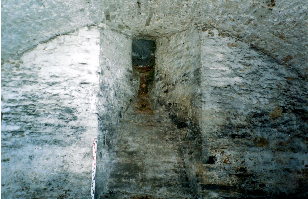
Cardigan Castle North Tower basement vault, showing N arrow-loop broadened to make a coal hatch in the 18th Century – Glen K Johnson (2003)