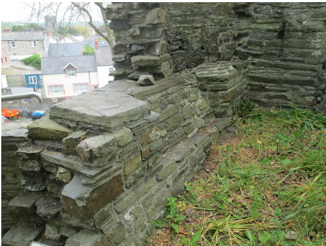
Cardigan Castle North-East Bastion – site of window – Glen K Johnson (2019)