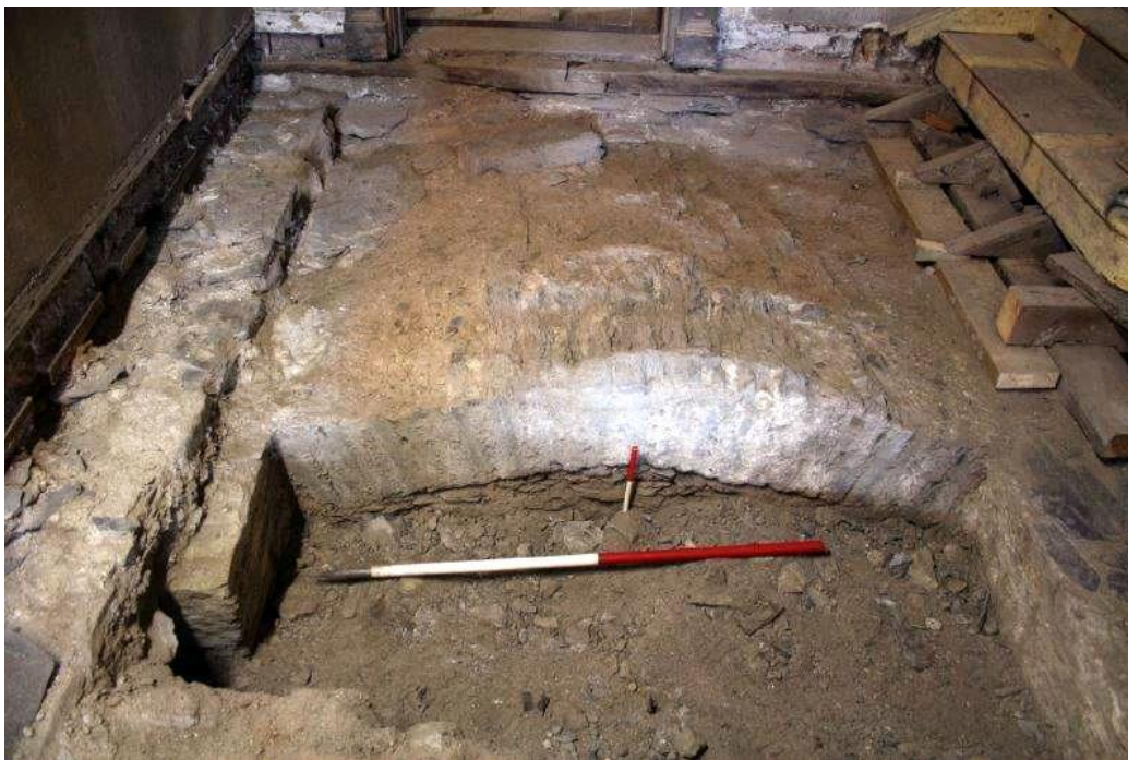
Cardigan Castle North Tower Basement Archway under the hall of Castle Green House