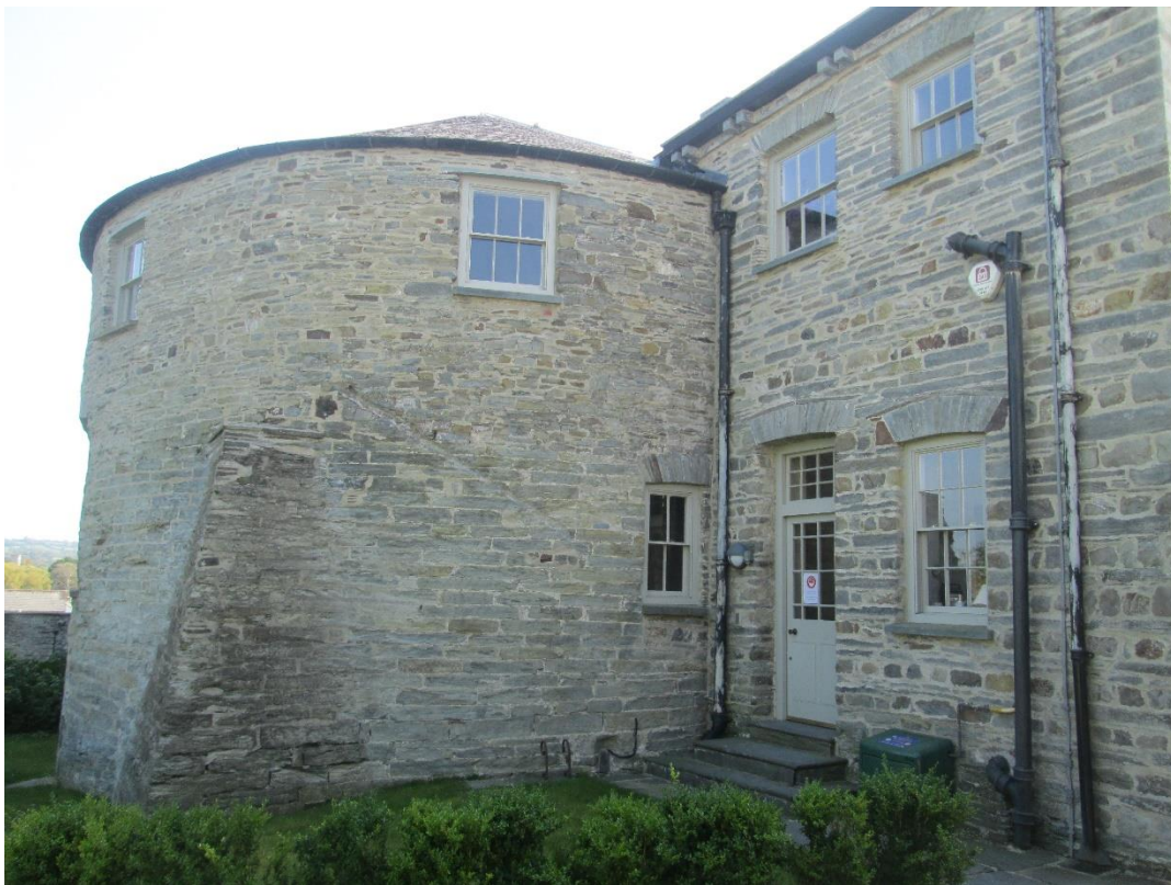
Cardigan Castle North Tower