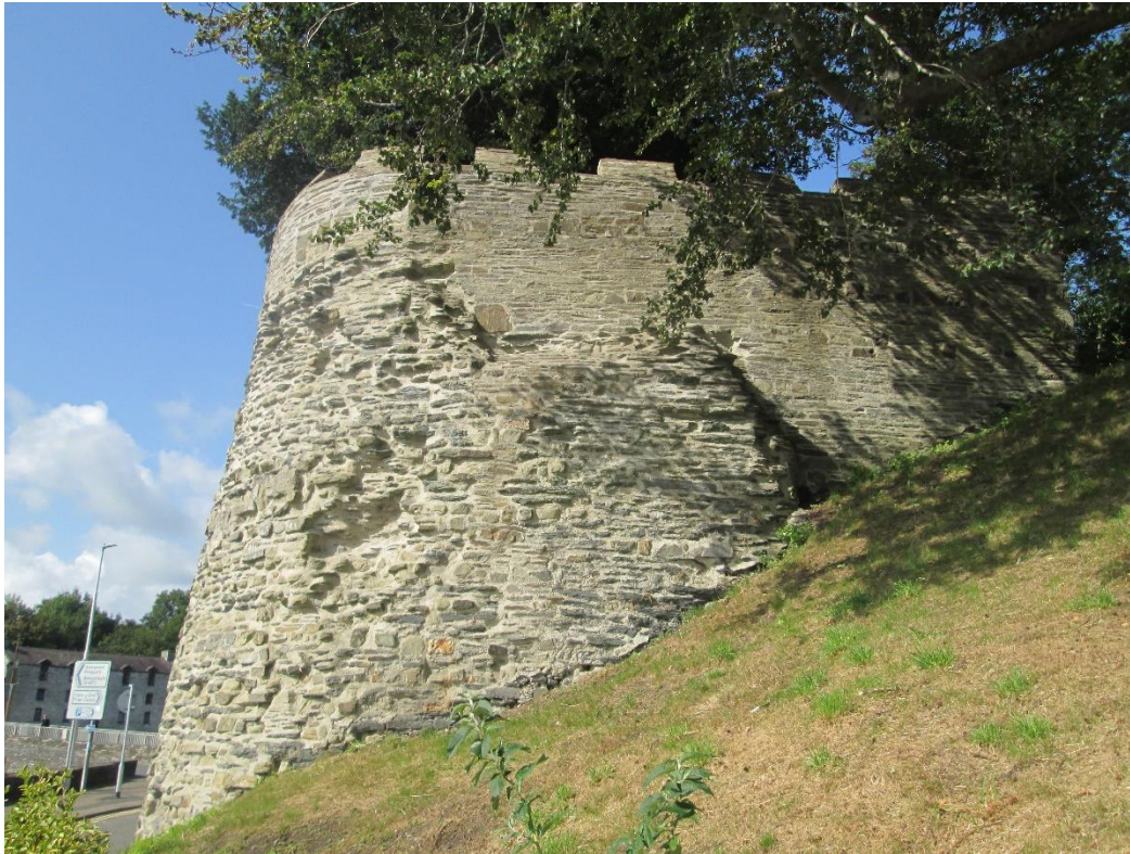
South East Tower of Cardigan Castle with Civil War cannon-ball damage visible.