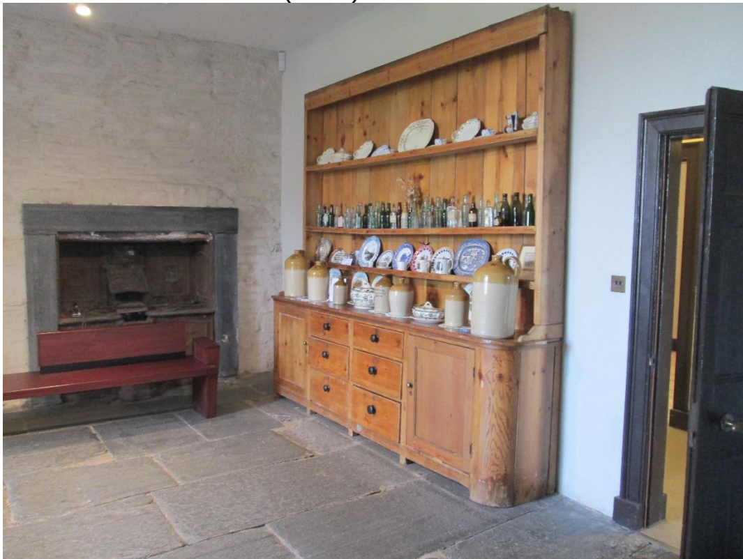
Cardigan Castle - Castle Green House 18th Century (ca 1740-1760) kitchen dresser