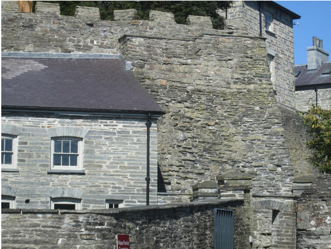
Cardigan Castle North-East Bastion