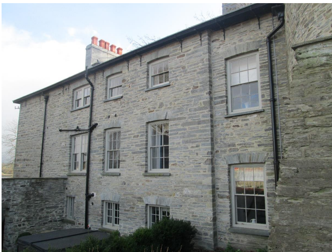
Cardigan Castle - Castle Green House 1808 E wing exterior from N – Glen K Johnson (2019)