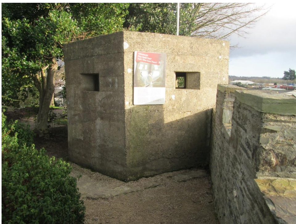
Cardigan Castle WWII Pillbox