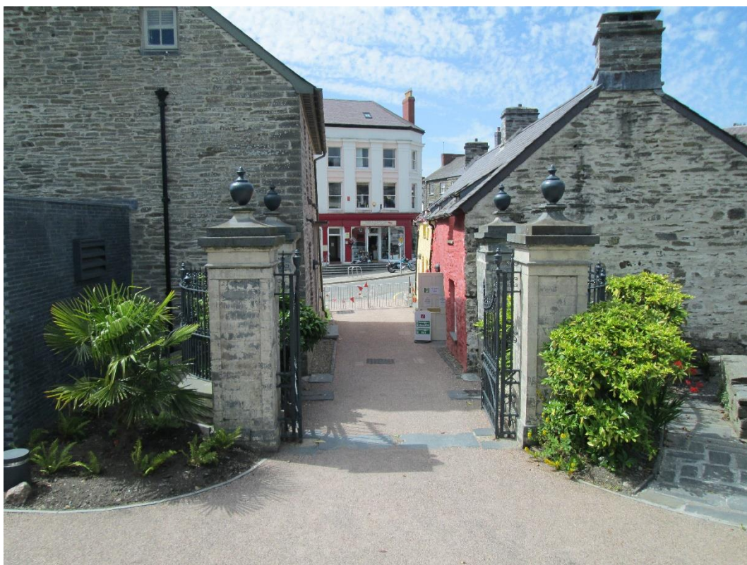
Cardigan Castle early 19th Century Entrance gates – Glen K Johnson (2015)