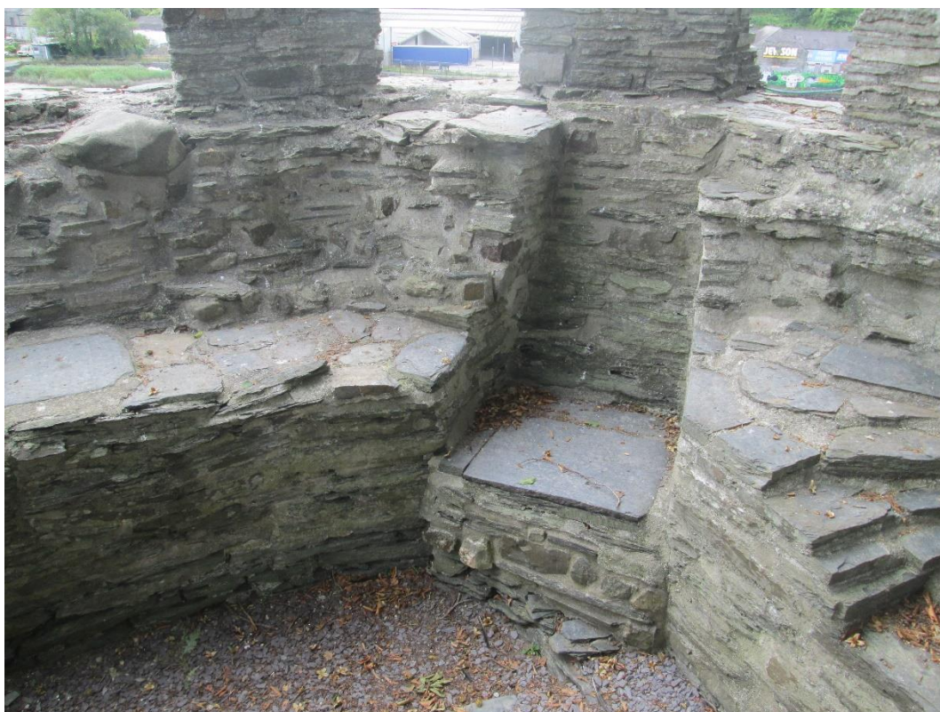
Cardigan Castle East Tower – probable site of fireplace – Glen K Johnson (2021)