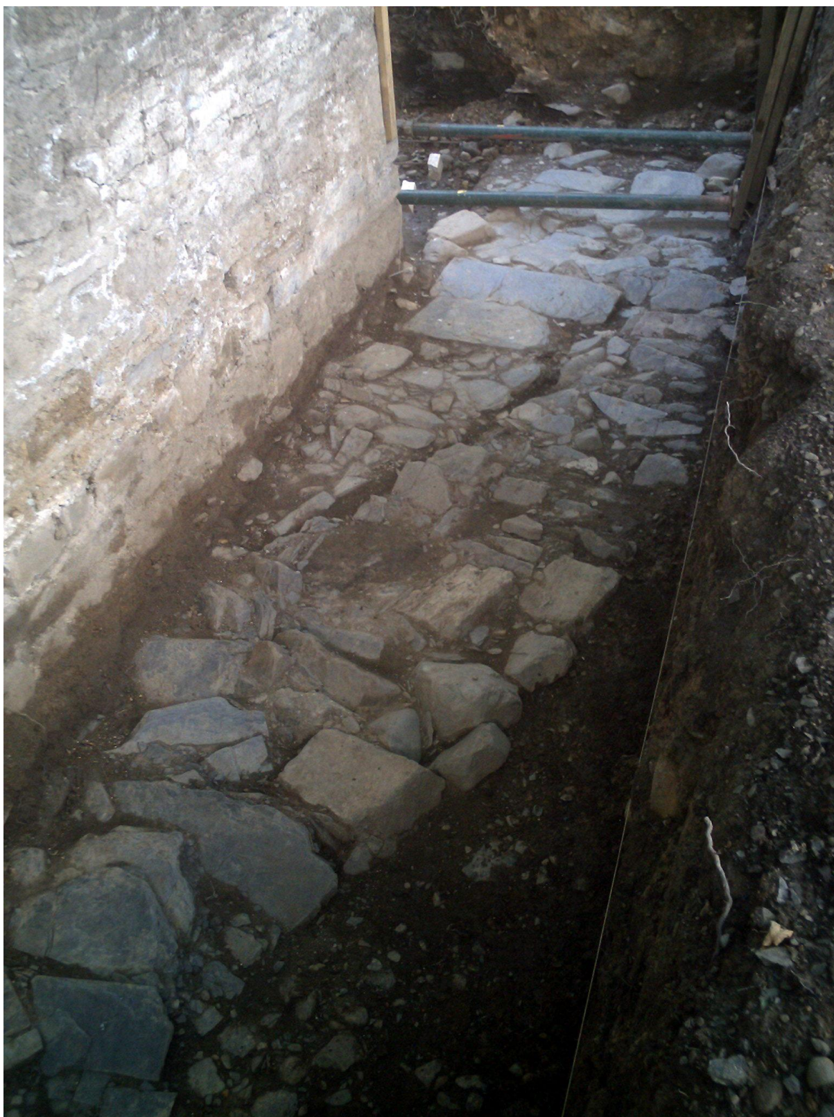
Cardigan Castle 12th Century Medieval wall under NW corner of Ty'r Ardd – Glen K Johnson (2012)