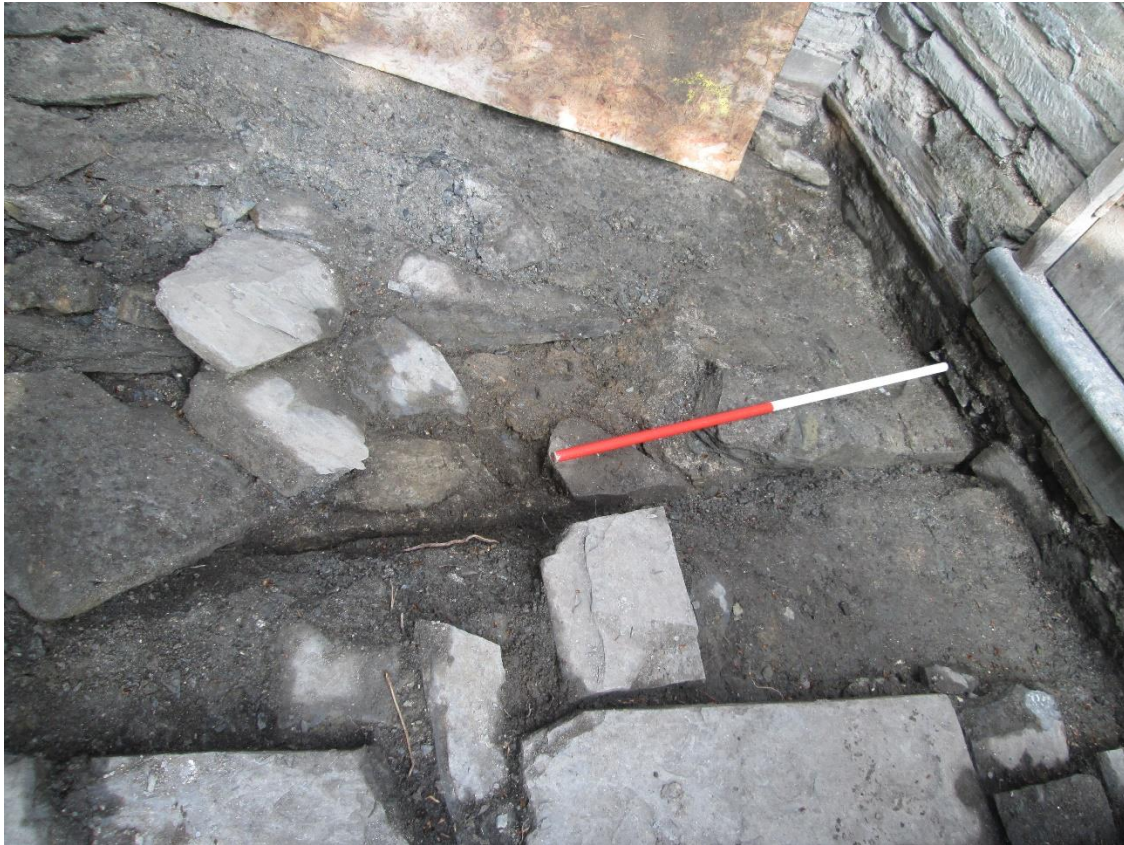
Cardigan Castle 12th Century Medieval wall by E door of E Wing of Castle Green House – Glen K Johnson (2014)