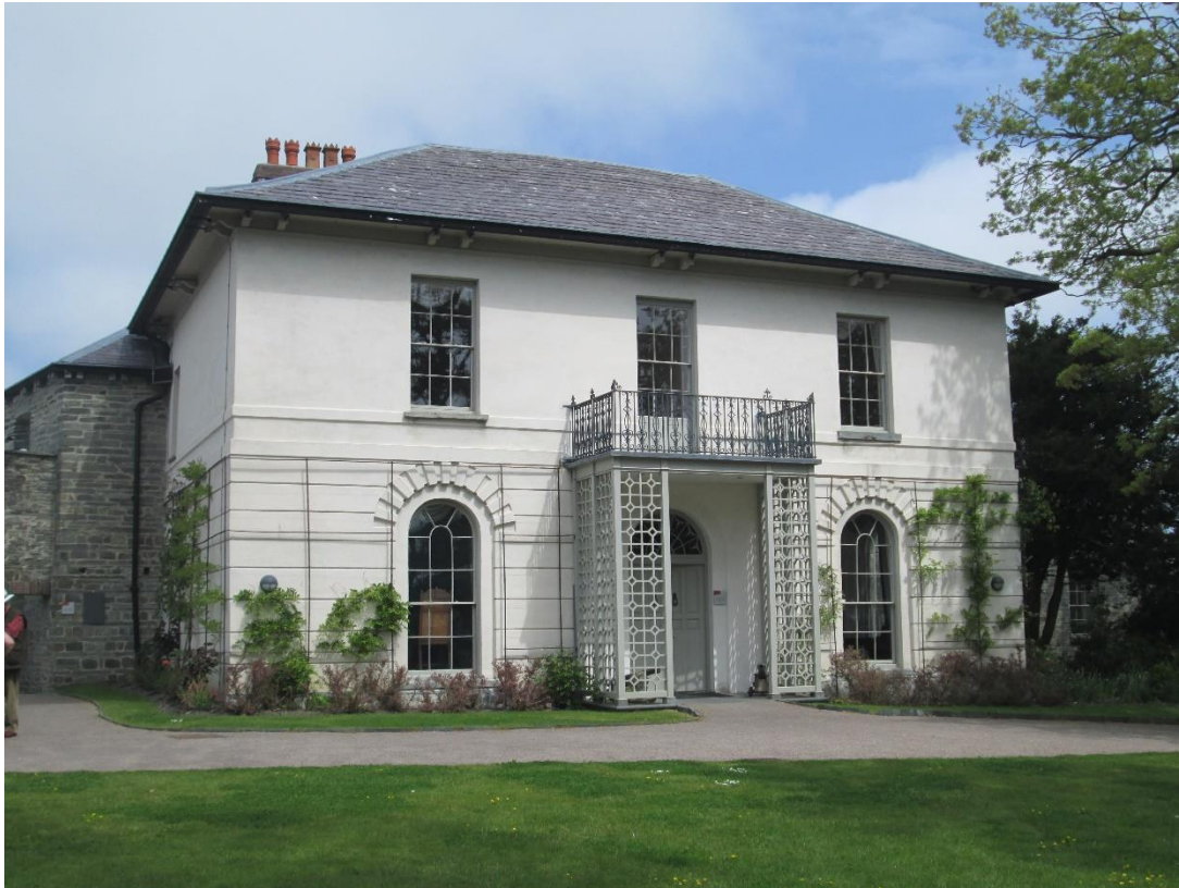
Cardigan Castle - Castle Green House 1827 front range – Glen K Johnson (2018)