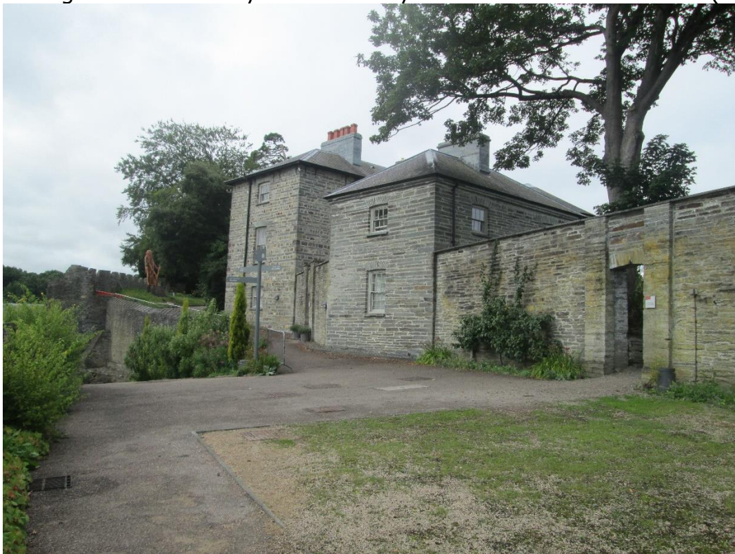
Cardigan Castle - Ty'r Ardd and Castle Green House, all of ca 1808