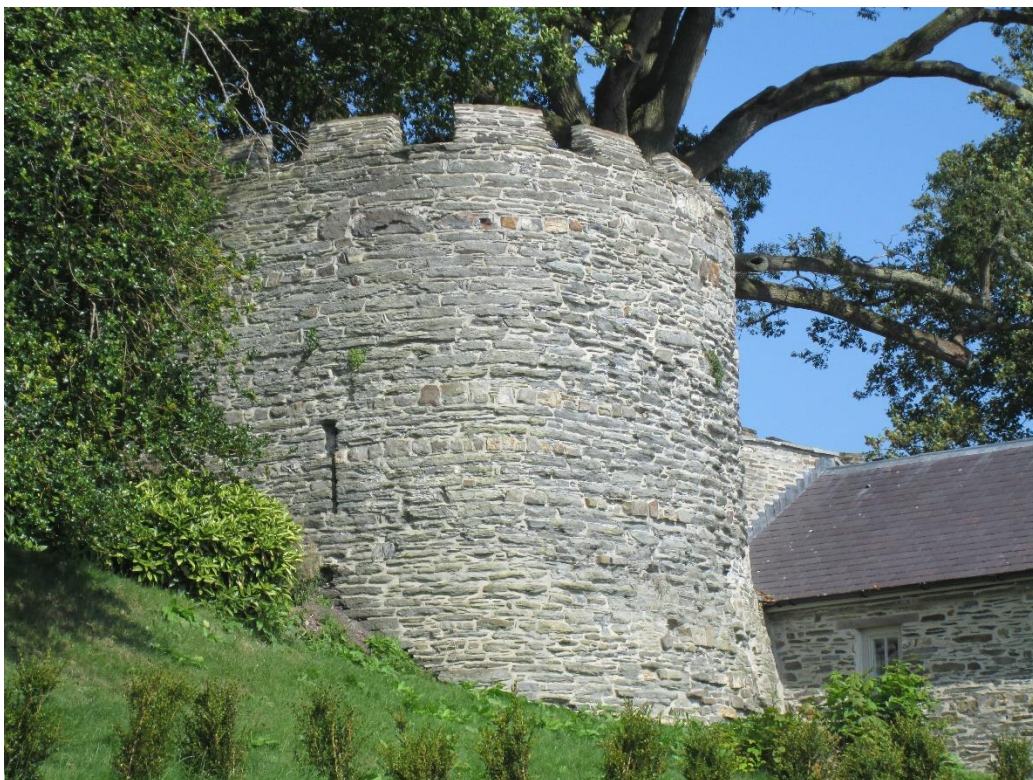
East Tower of Cardigan Castle