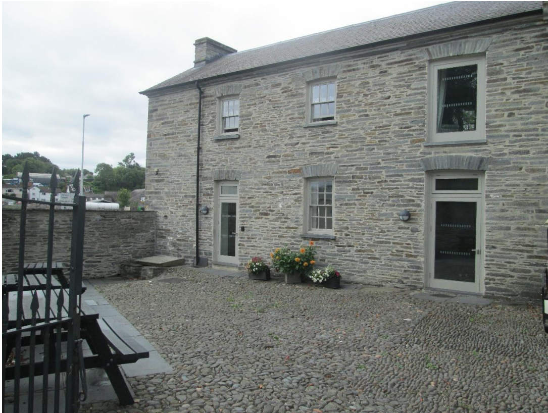
Cardigan Castle - early 19th Century Stables – Glen K Johnson (2021)