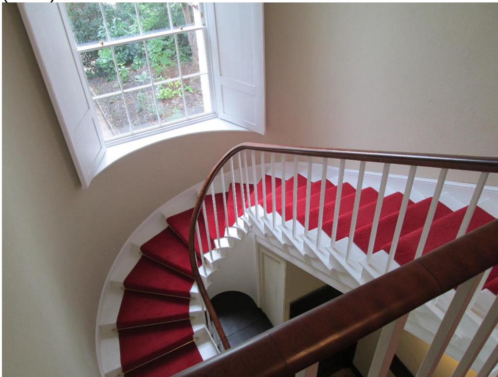
Cardigan Castle - Castle Green House 1827 interior staircase – Glen K Johnson (2015)