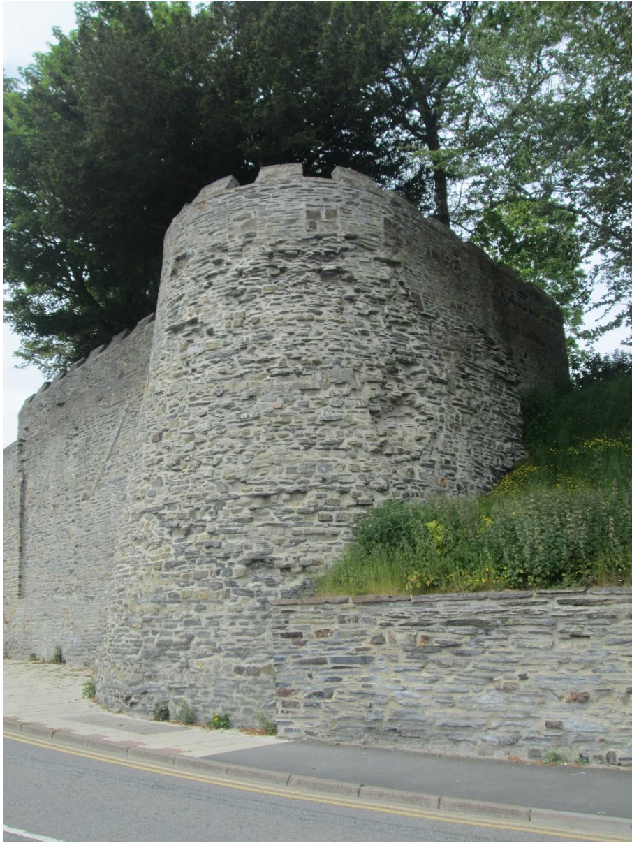
South East Tower of Cardigan Castle