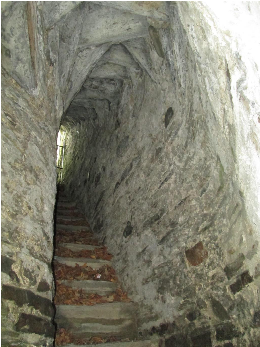
Inter-mural passage in the East Tower, Cardigan Castle