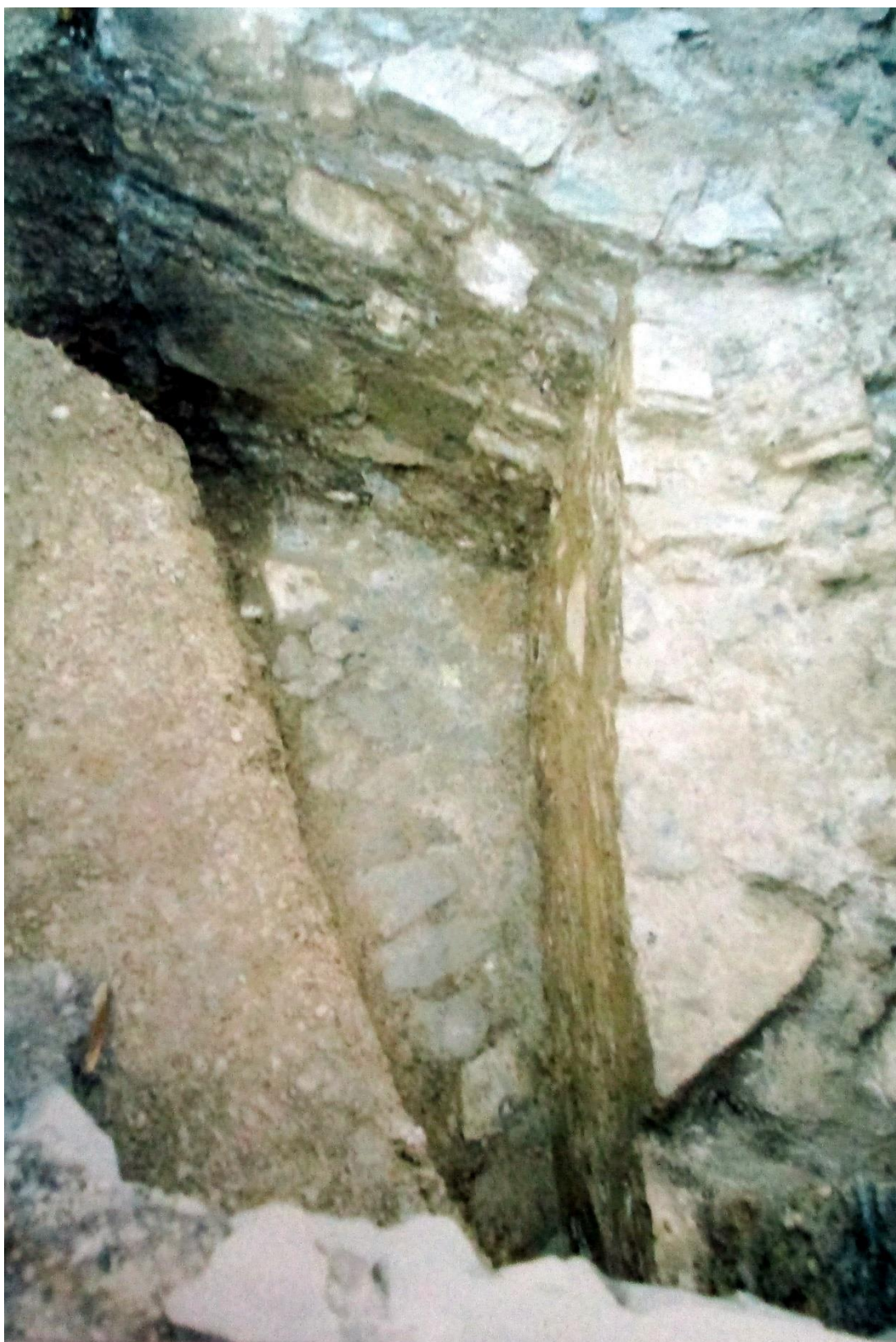
Cardigan Castle - Probable remains of Gatehouse in yard N of No. 2 Green Street – Glen K Johnson (2003)