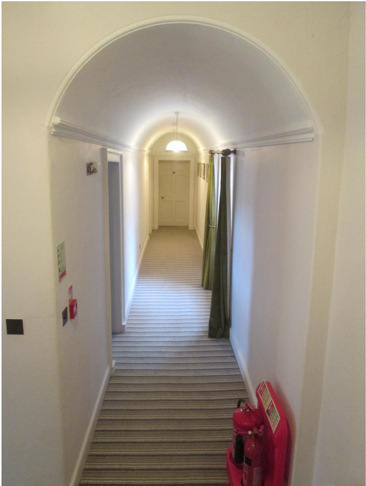
Cardigan Castle - Castle Green House 1808 E Wing interior - coved ceiling to top floor corridor – Glen K Johnson (2020)