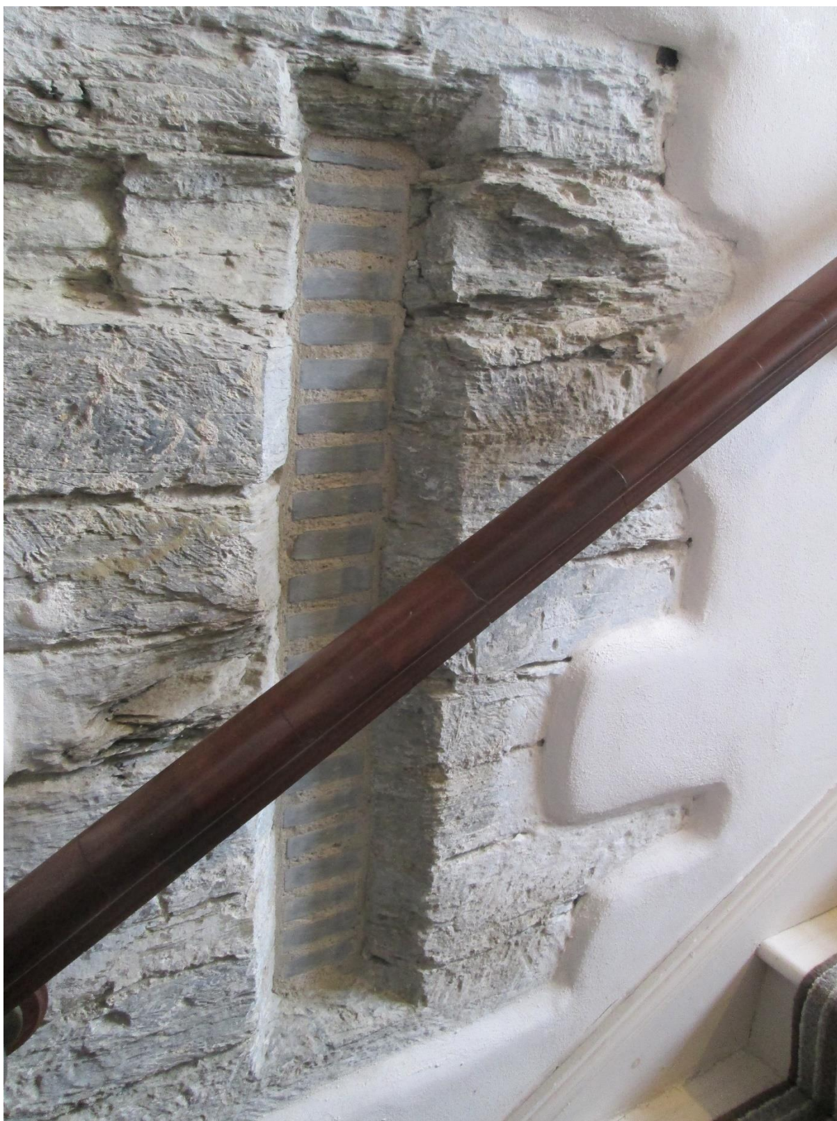
Cardigan Castle North Tower blocked arrow-slit seen from E Wing of Castle Green House – Glen K Johnson (2020)