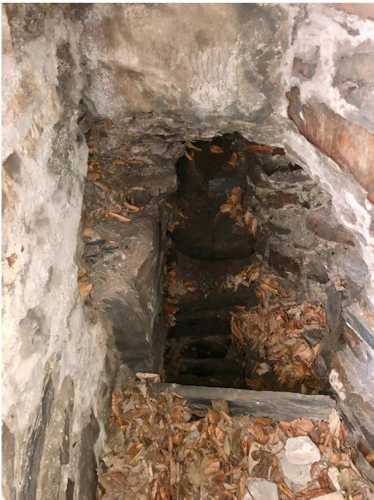
Cardigan Castle East Tower garderobe