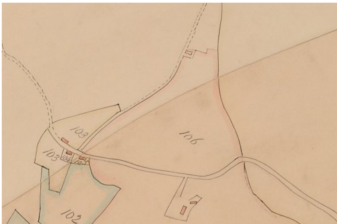
Map of the parish of Llanybyther, Carmarthenshire, 1840

A cottage and enclosure are shown on the Tithe Map. A Pyper 2020.