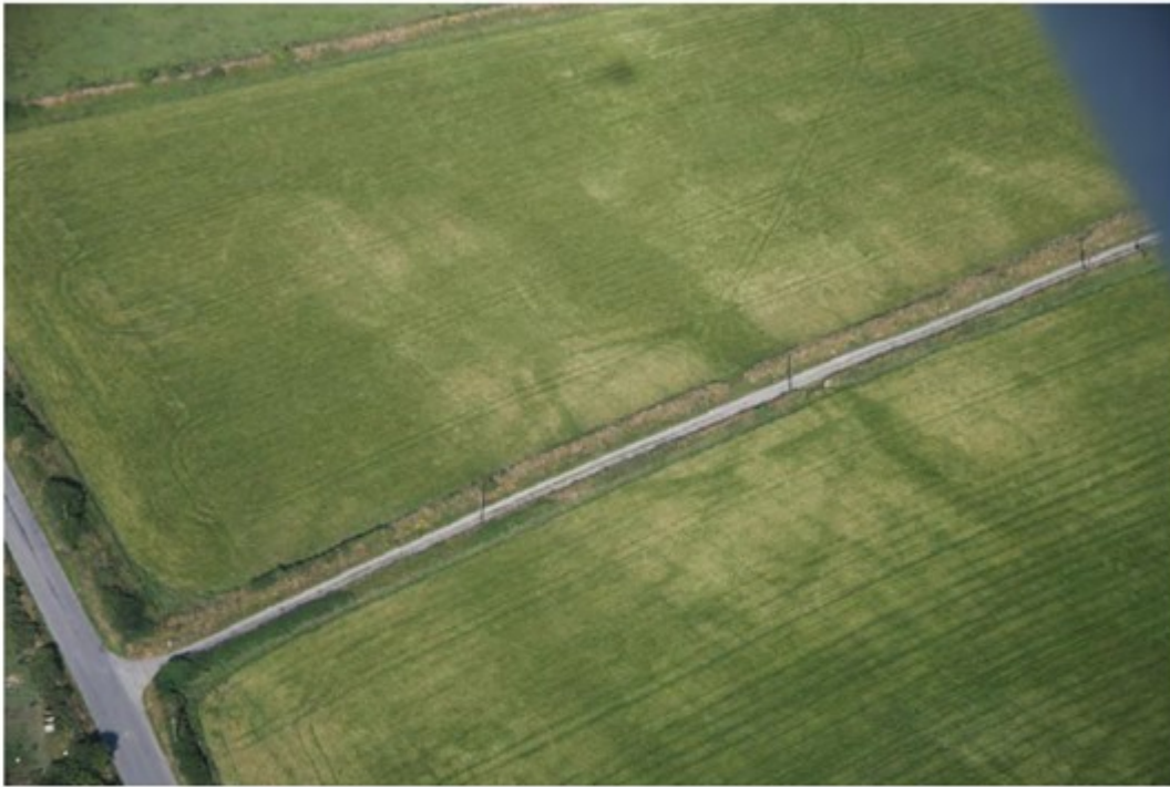
Aerial photograph RCAHMW Crown Copyright © reference 2005-cs-1497.