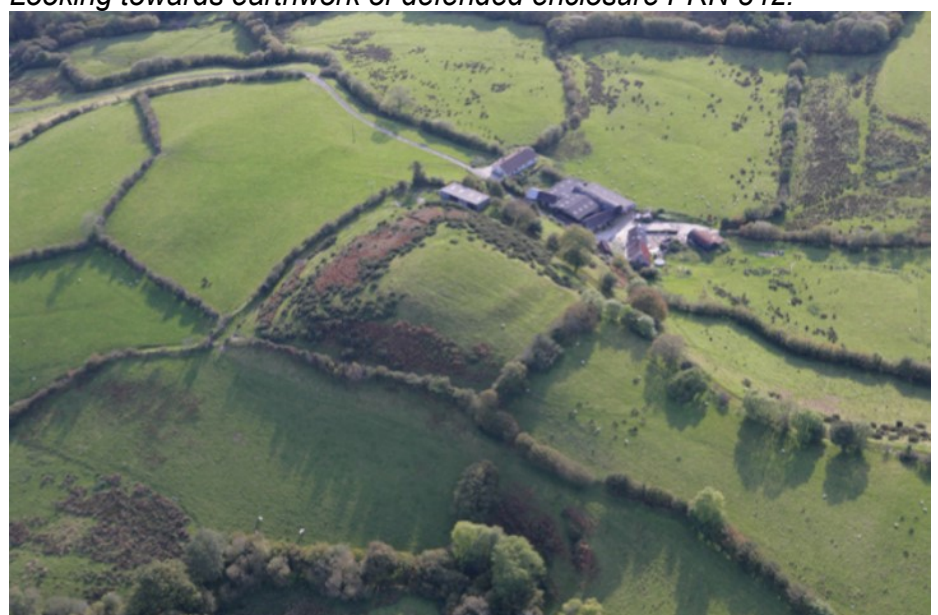
Aerial photograph of PRN 842. RCAHMW Crown copyright © reference DI2007_3366