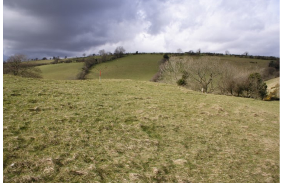
Looking towards earthwork of defended enclosure PRN 842.