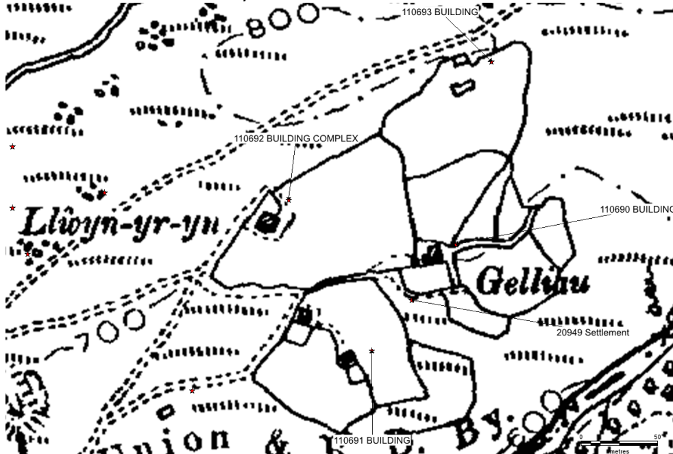
2 nd edition Ordnance Survey 1905 Carmarthenshire sheet 50.NW