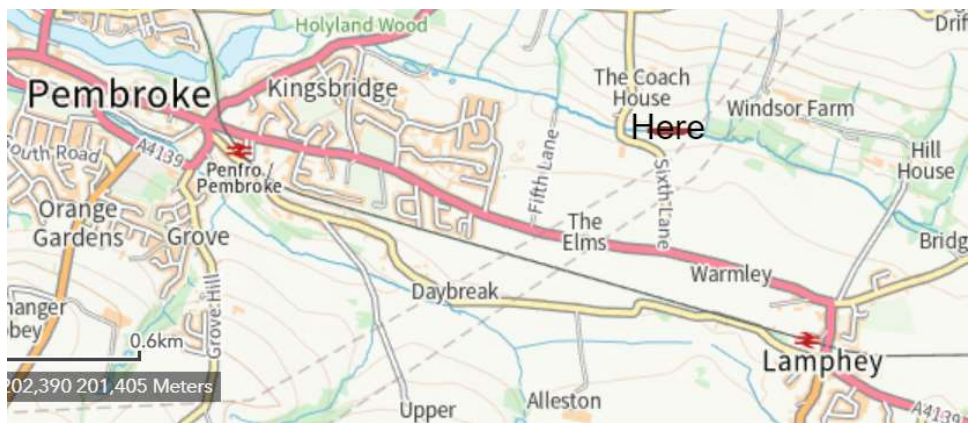
Zoomed location map: