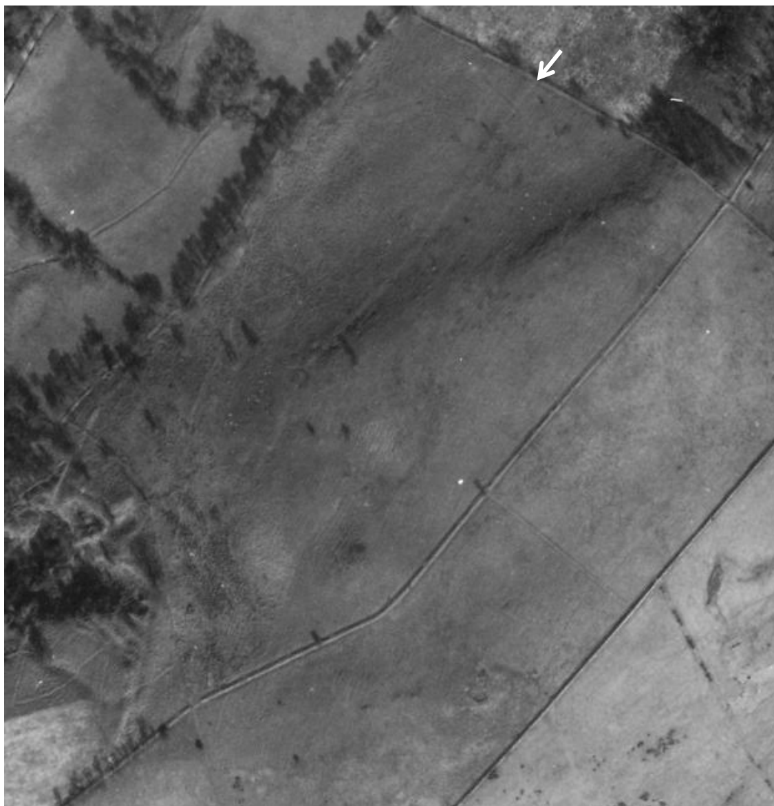
Meridian Airmap 1955 with arrow to show the possible earthwork of the Nant Dâr leat.

Let me know if there are any issues or clarification needed,