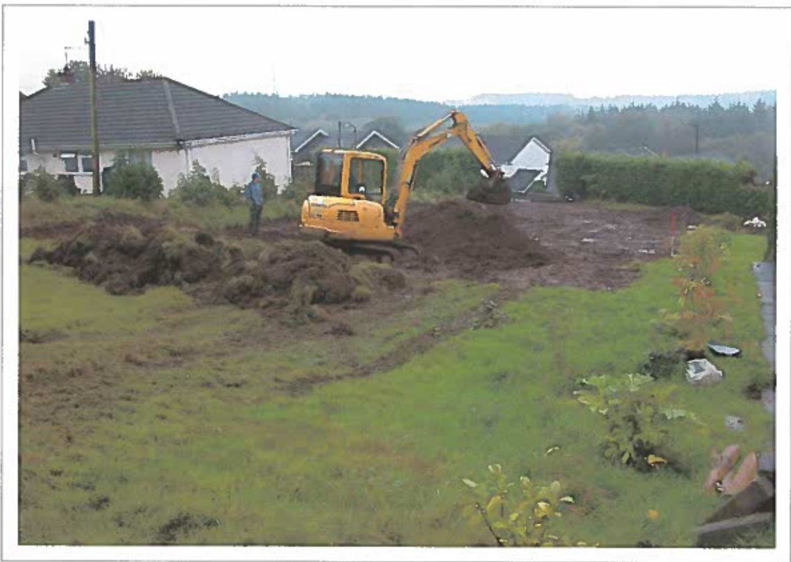
Plate 2: Genral view of stripping topsoil, looking north-east. Scale 2m.