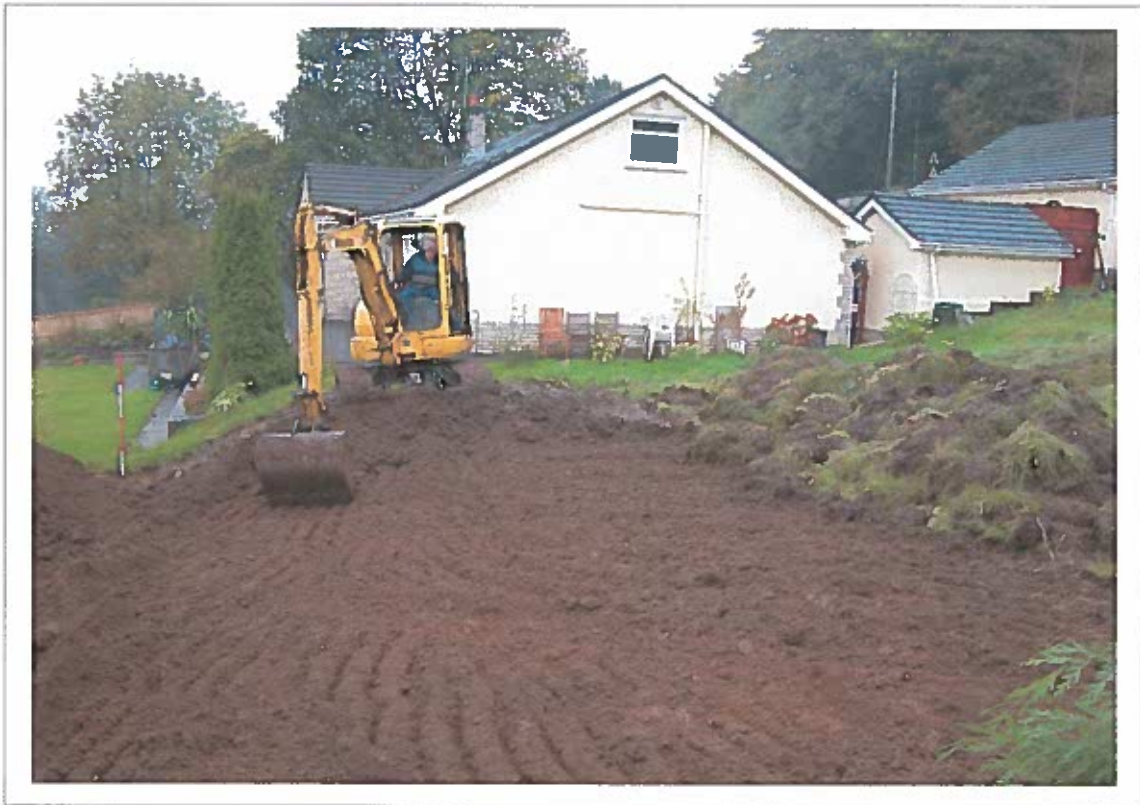
Plate 1: Genral view of cleaning back topsoil onto subsoil, in western area of house, looking south. Scale 2m.