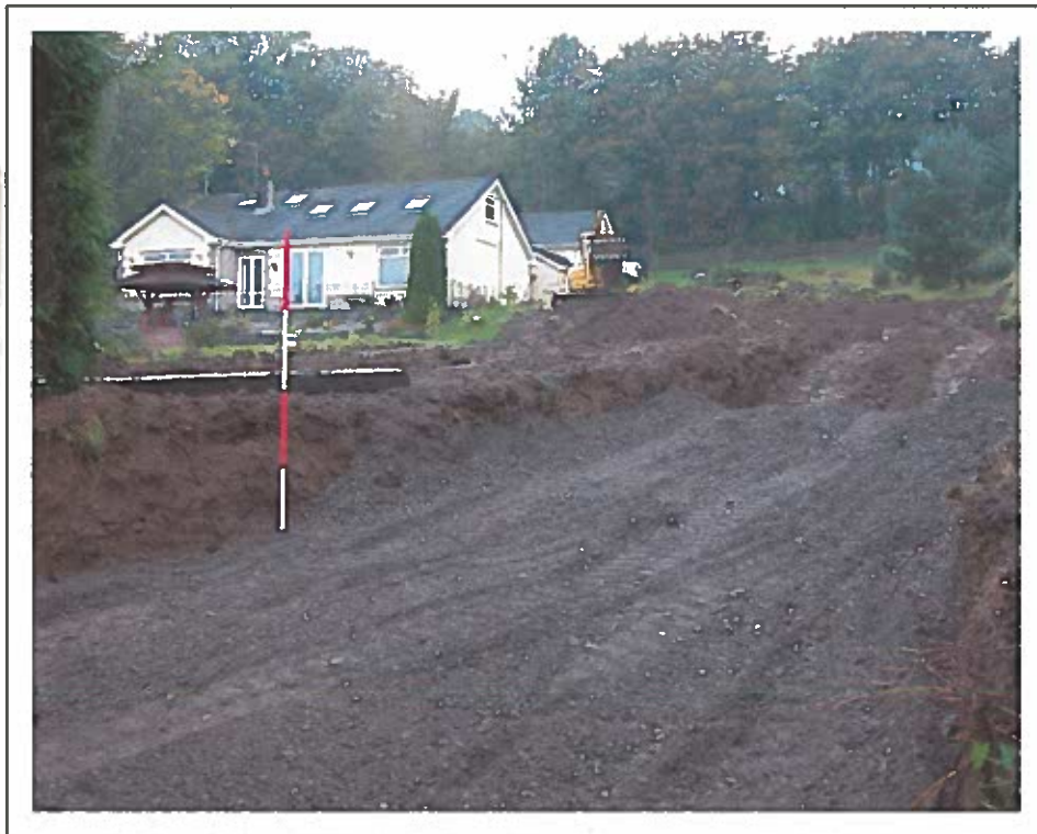
Caption: Genral view of of site looking south-west from entrance. Scale 2m