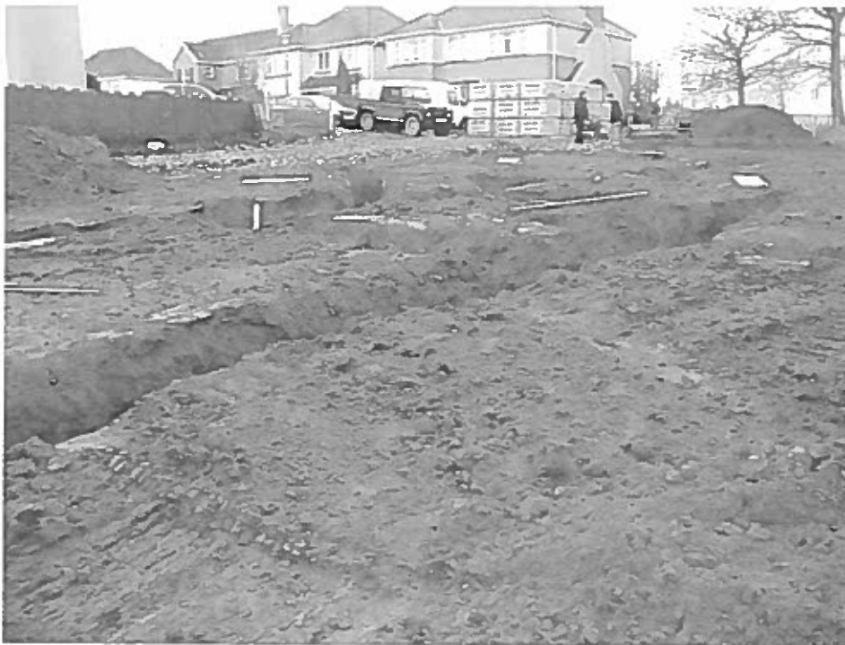
General view of site following ground works

The dearth of evidence for a Roman road through this site does not rule the site out as being on the line of the road. Previous work undertaken by Cambria Archaeology on Roman road sites identified as parch marks from aerial photographs have, on excavation, been shown to have no discernible deposits (Ken Murphy, pers. comm).