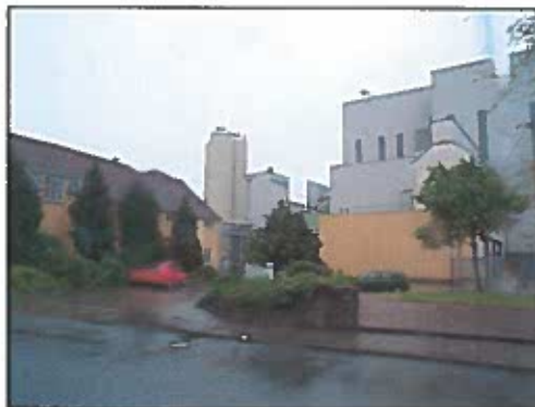
Plate 13 Creamery N91724, looking southeast from St Mary's Street