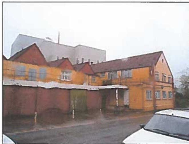
Early 20 th century Creamery buildings on St Mary's Street, looking southeast

GGAT report no. 2002/038 Project no. A766 National Grid Reference SN 202 165 SMR Project Record No. 44944