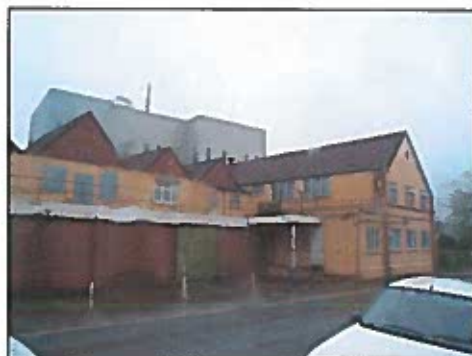
Plate 12 Creamery buildings 44851, looking southeast