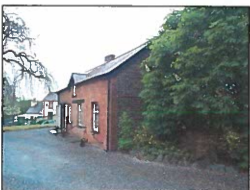
Plate 2 Millbrook coach house 44955, looking north