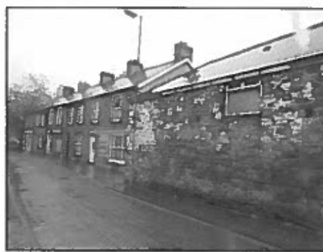
Plate 16 Hotel outbuilding and houses on St Mary Street, looking east