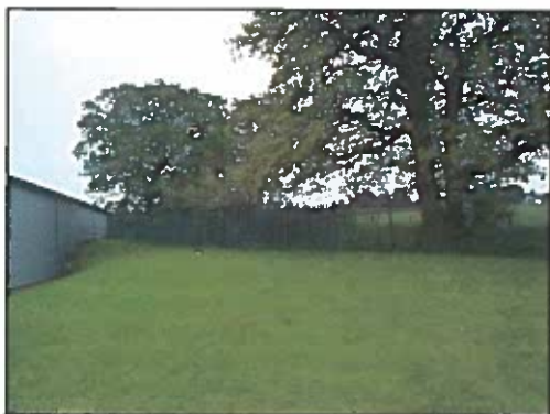
Plate 1 Hedge marking east edge of Creamery site, looking north