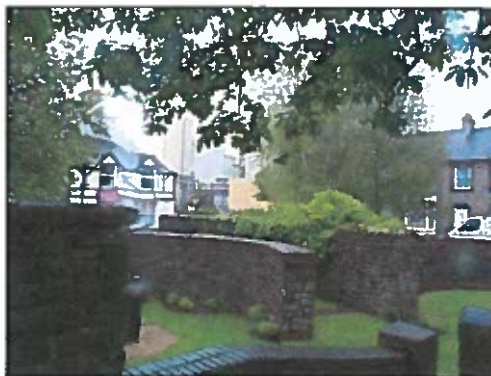
Plate 14 Hywel Dda memorial garden, looking east to creamery