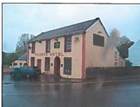
Plate 6 Fishers Arms 44950, looking north