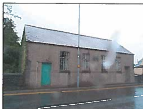
Plate 4 St Mary's Temperance Hall 44949, looking north