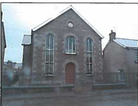
Plate 10 Nazareth Chapel 15043, looking south