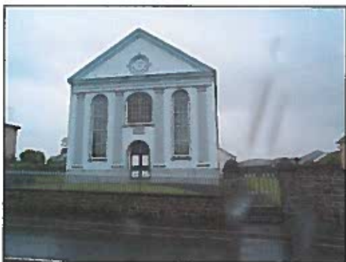
Plate 7 Tabernacle Chapel 15094, looking south