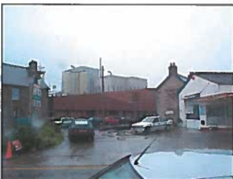
Plate 9 View from Market Street/St Mary's Street to Creamery, looking southeast