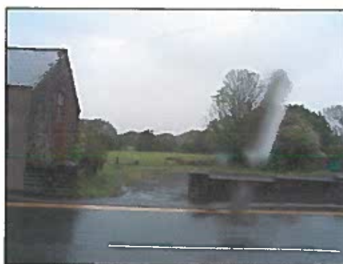
Plate 5 Site of corn mill 22718, looking north (raindrop on lens)