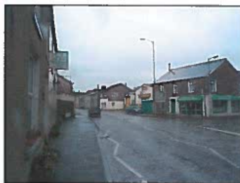
Plate 11 General view of west end of Market Street, looking east