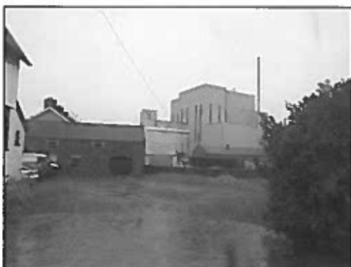
Plate 15 Looking east to creamery from Station Road