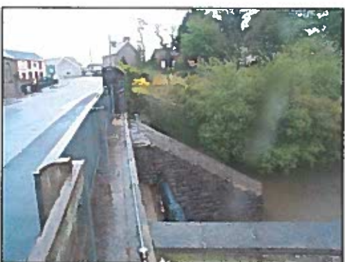
Plate 3 Whitland Bridge over Afon Gronw 44948, looking east