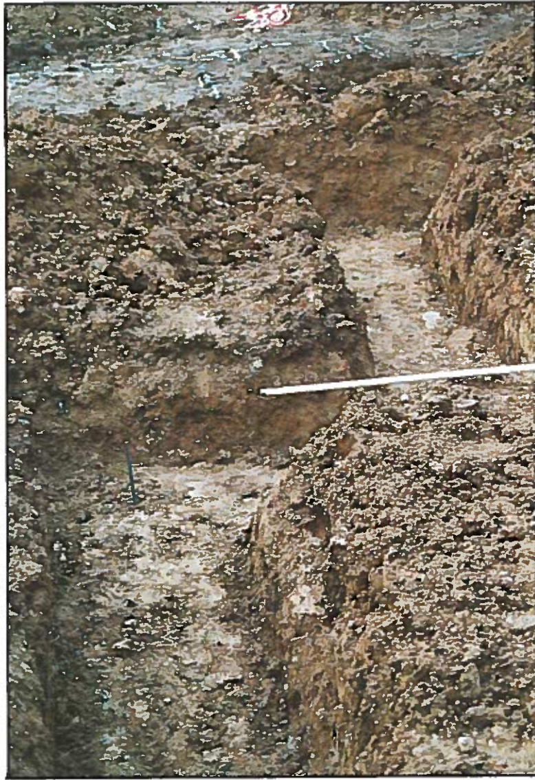
Observation of the foundation trenches for the new dwelling