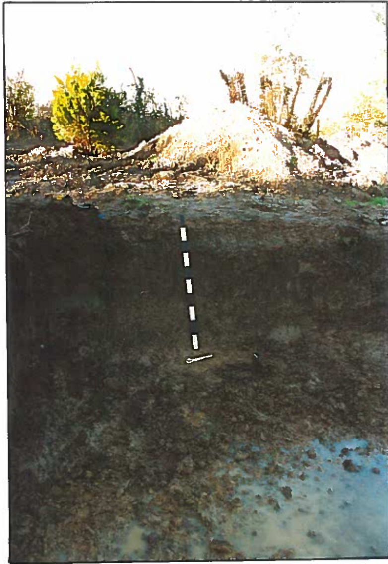
Top: Test section looking west towards Afon Felin Bottom: The same section to left of picture, looking north