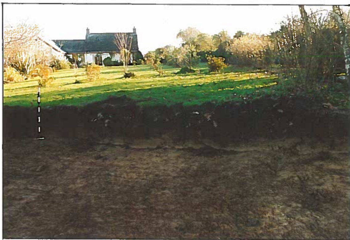
Test section looking east towards Ystrad Fflur