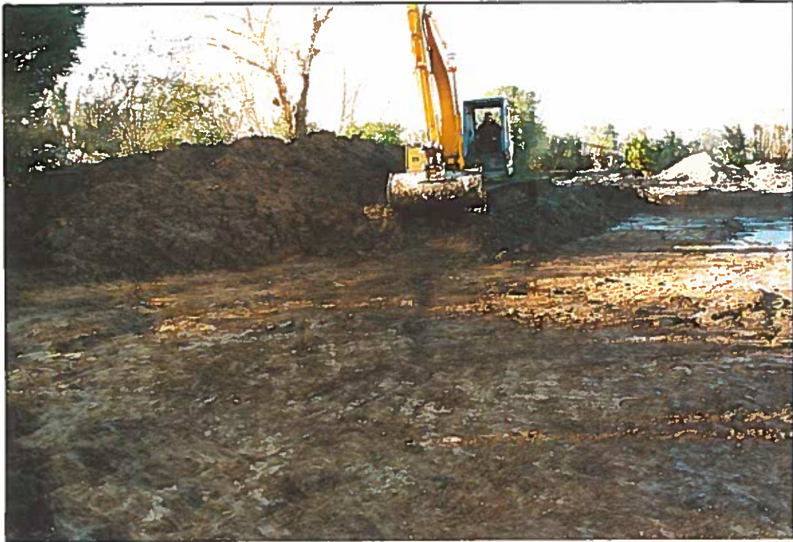
Top: Horizontal plan looking south-west Bottom: The same plan looking north-east from JCB