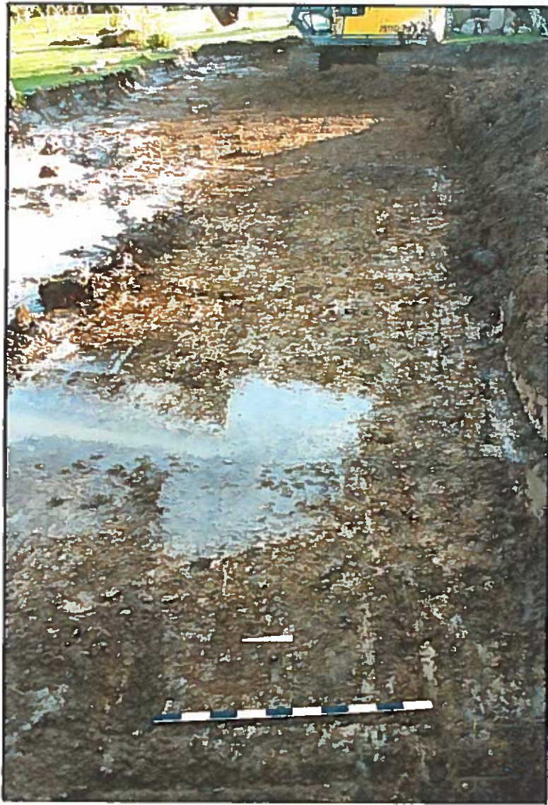
Top: Horizontal Plan of site looking east Bottom: Plan of site looking north-east from higher up