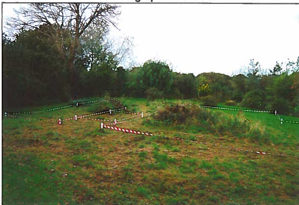
The site prior to building work