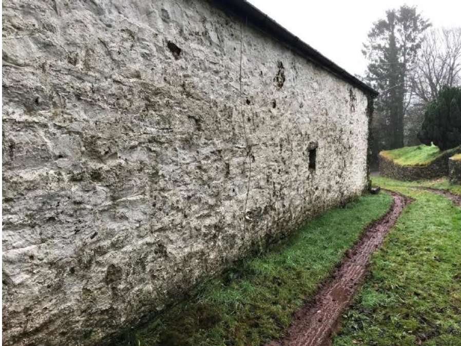
Photograph 4 (P4) – South facing elevation