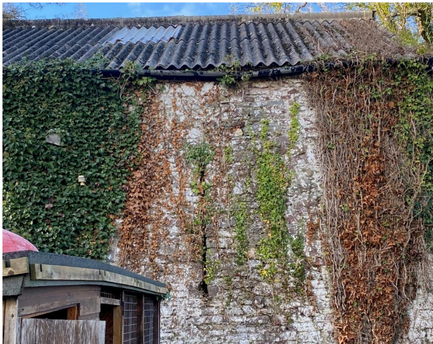
Photograph 7 (P7) – East facing elevation