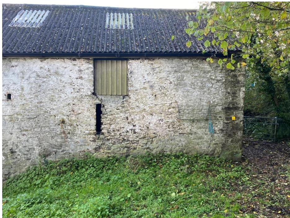
Photograph 3 (P3) – West facing elevation