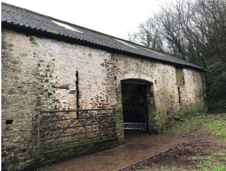
Photograph 8 (P8) – West facing elevation