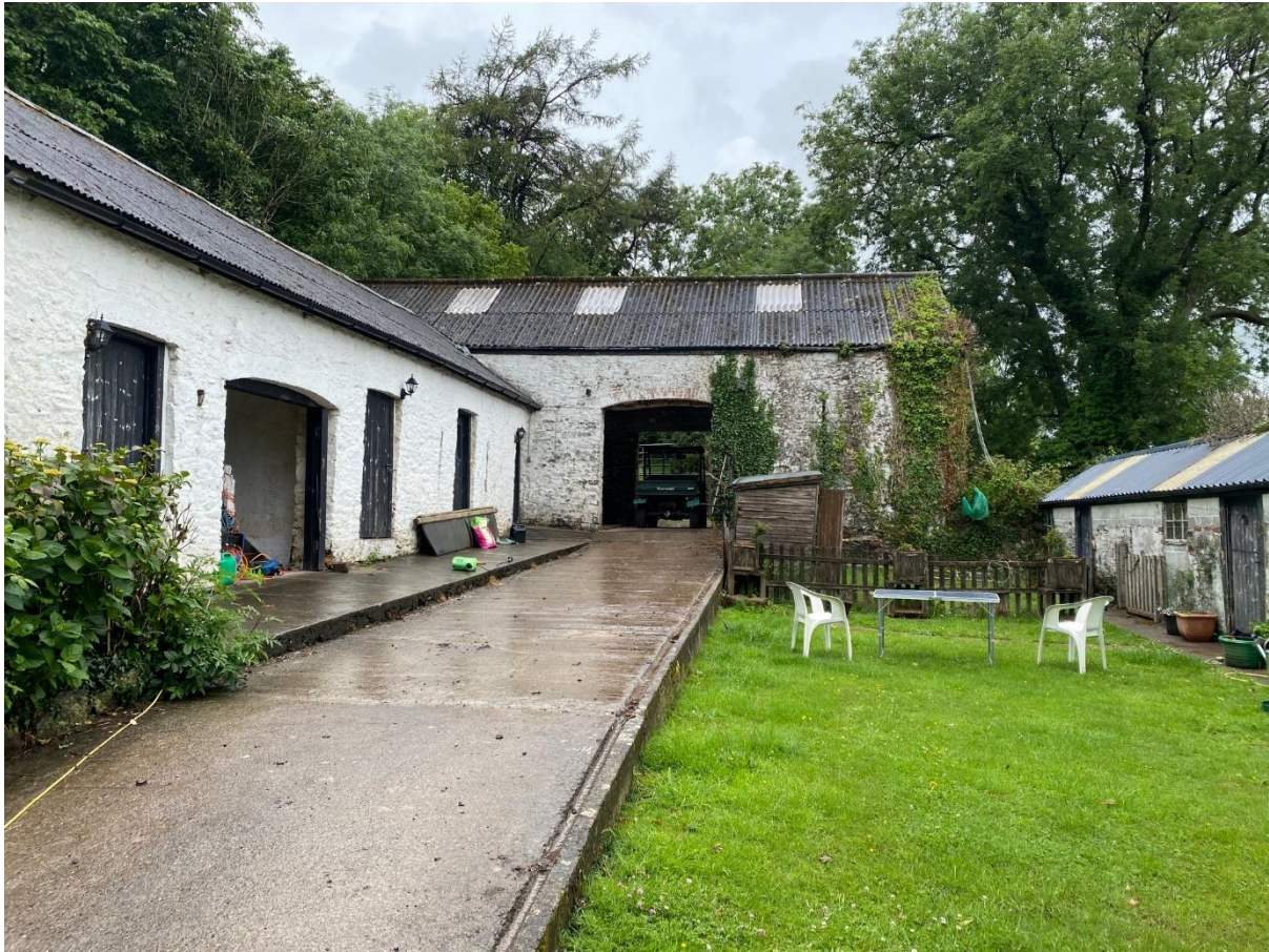
Photograph 1 (P1) – East facing elevation