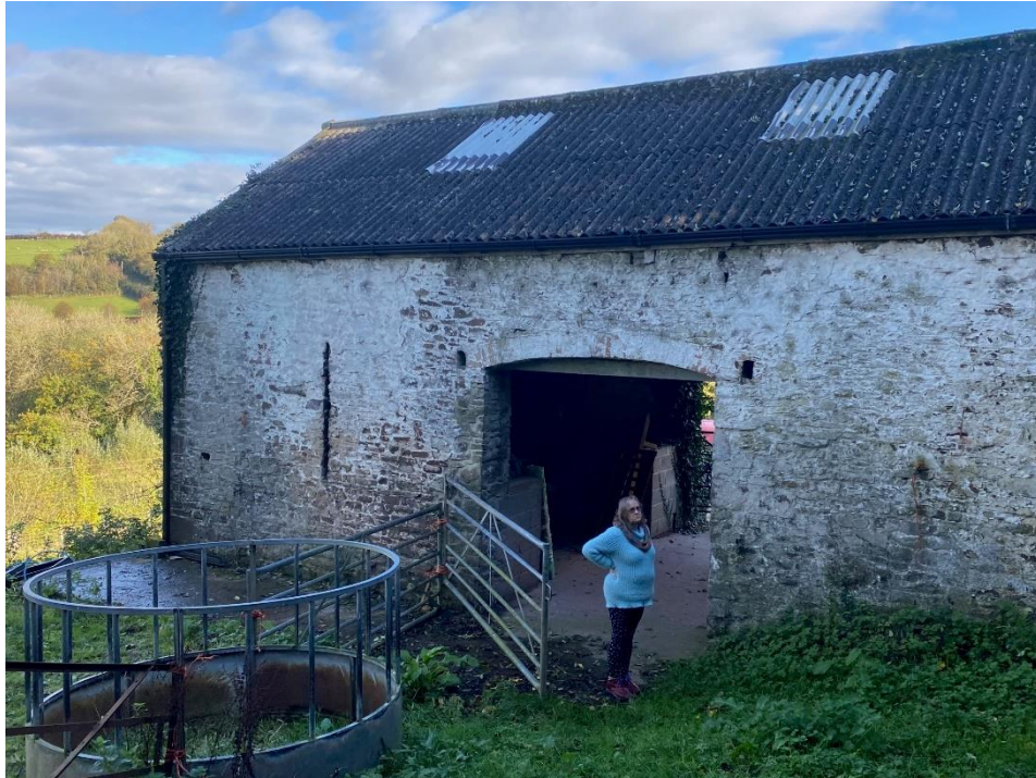
Photograph 2 (P2) – West facing elevation