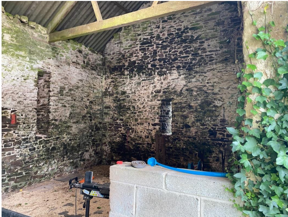
Photograph 9 (P9) – Internal view looking at North elevation