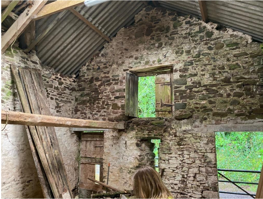
Photograph 6 (P6) – Internal view looking at South elevation