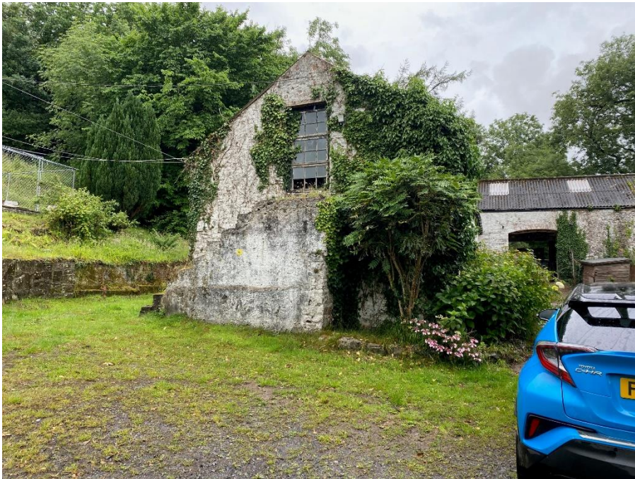
Photograph 5 (P5) – East facing elevation