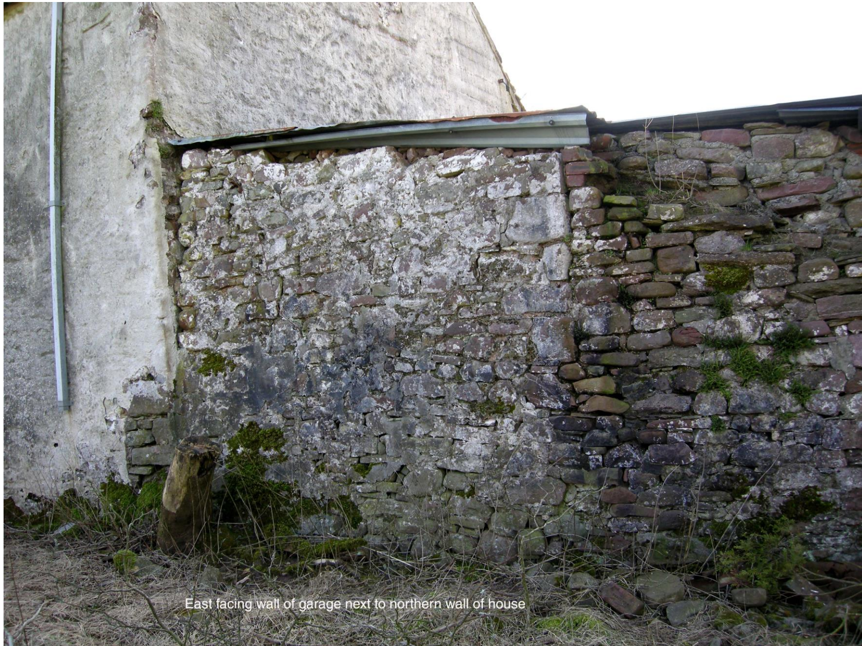
East facing wall of garage next to northern wall of house