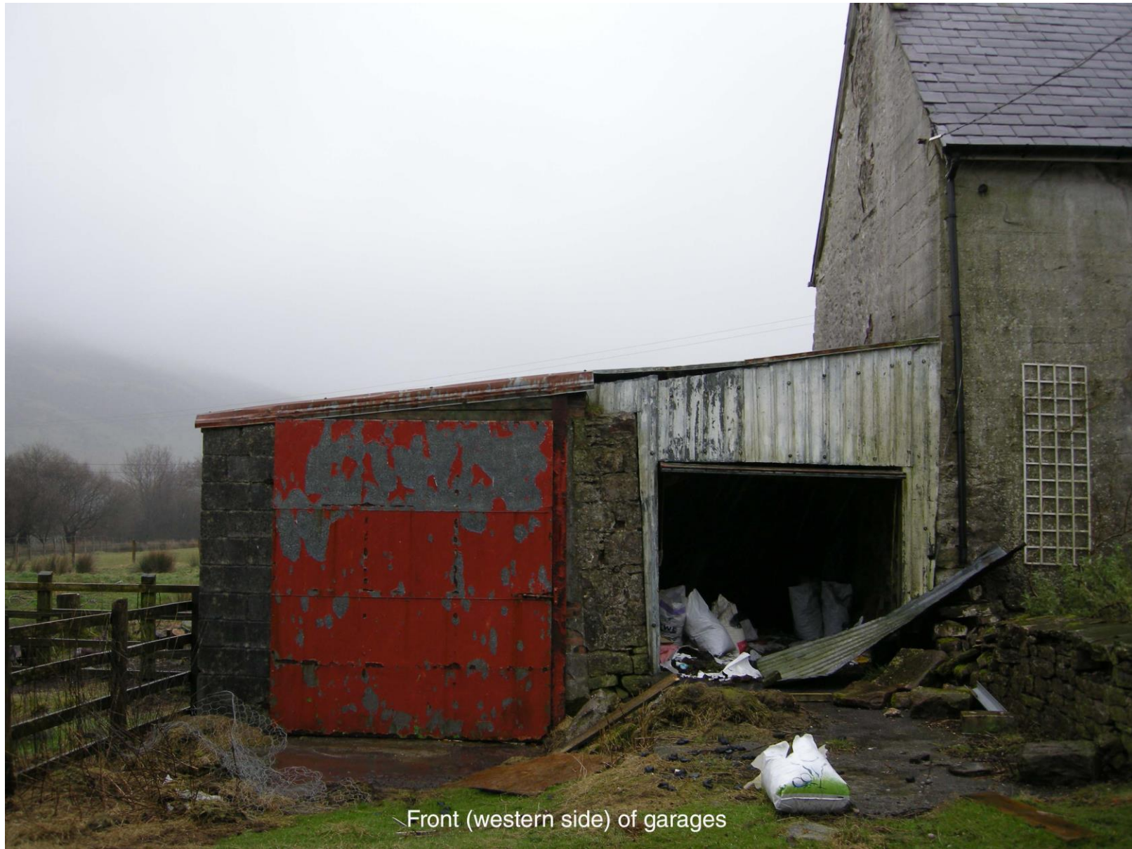
Front (western side) of garages