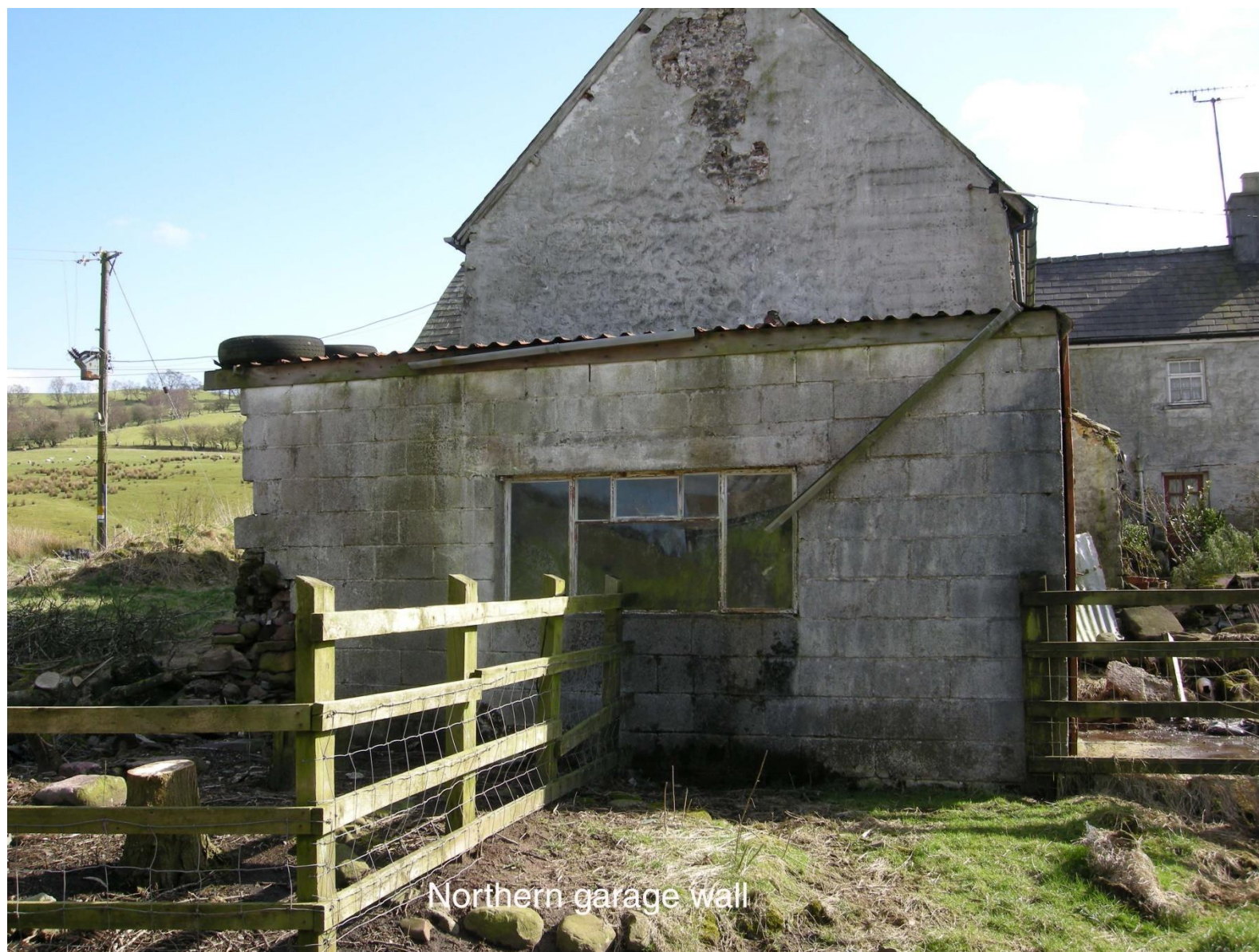
Northern garage wall