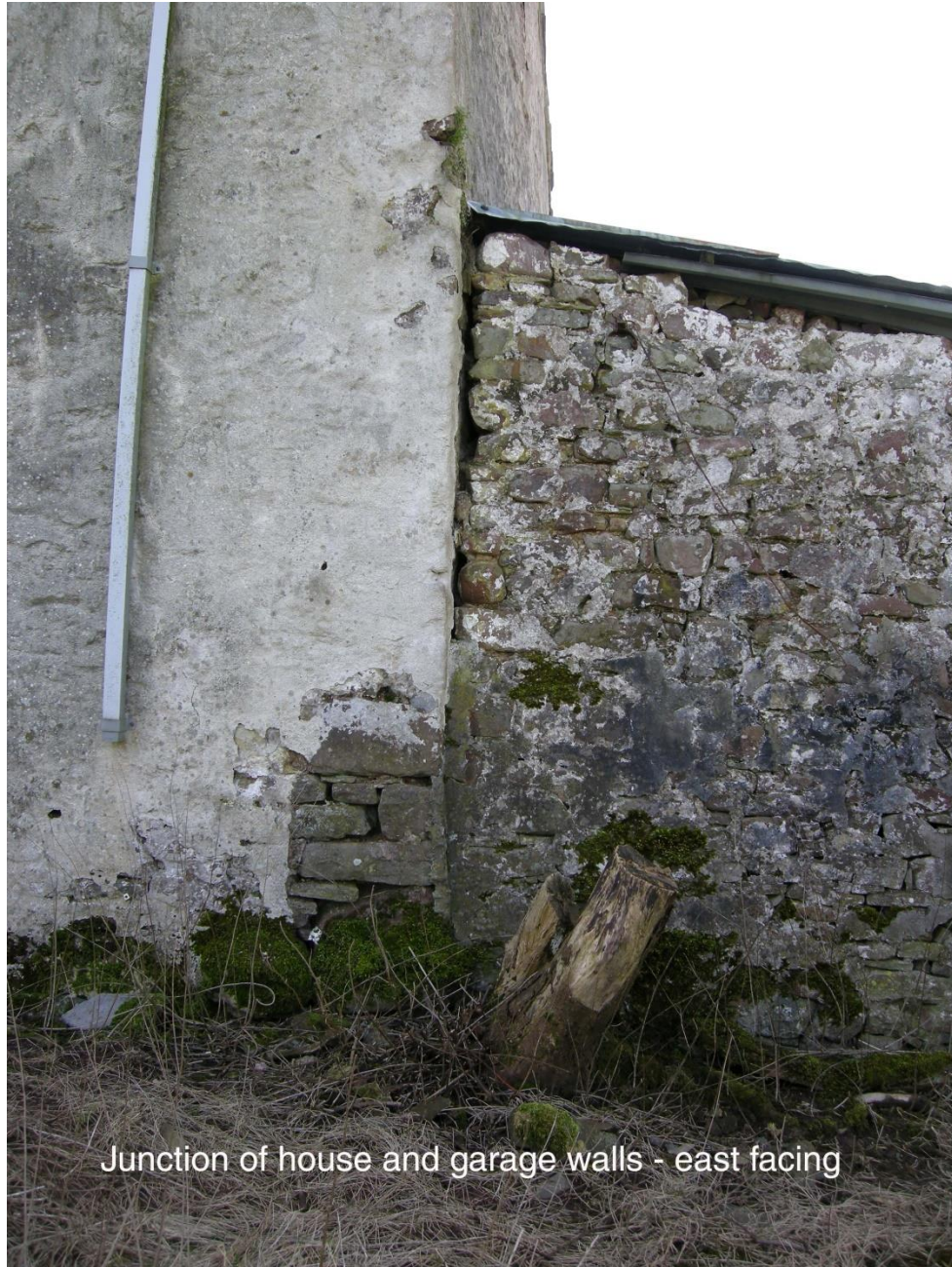
Junction of house and garage walls - east facing