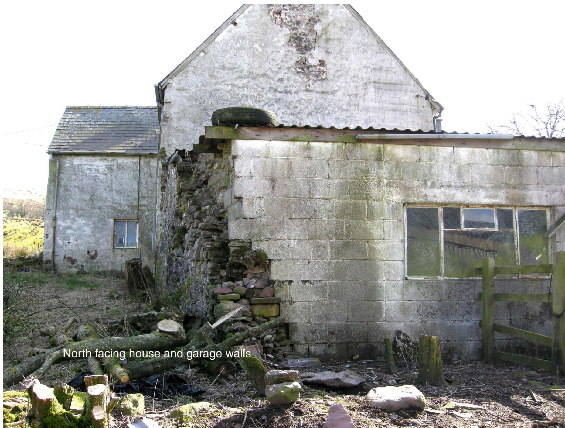
North facing house and garage walls