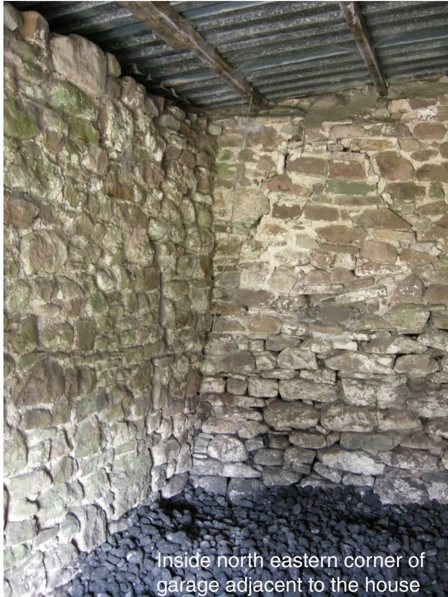
Inside north eastern corner of garage adjacent to the house