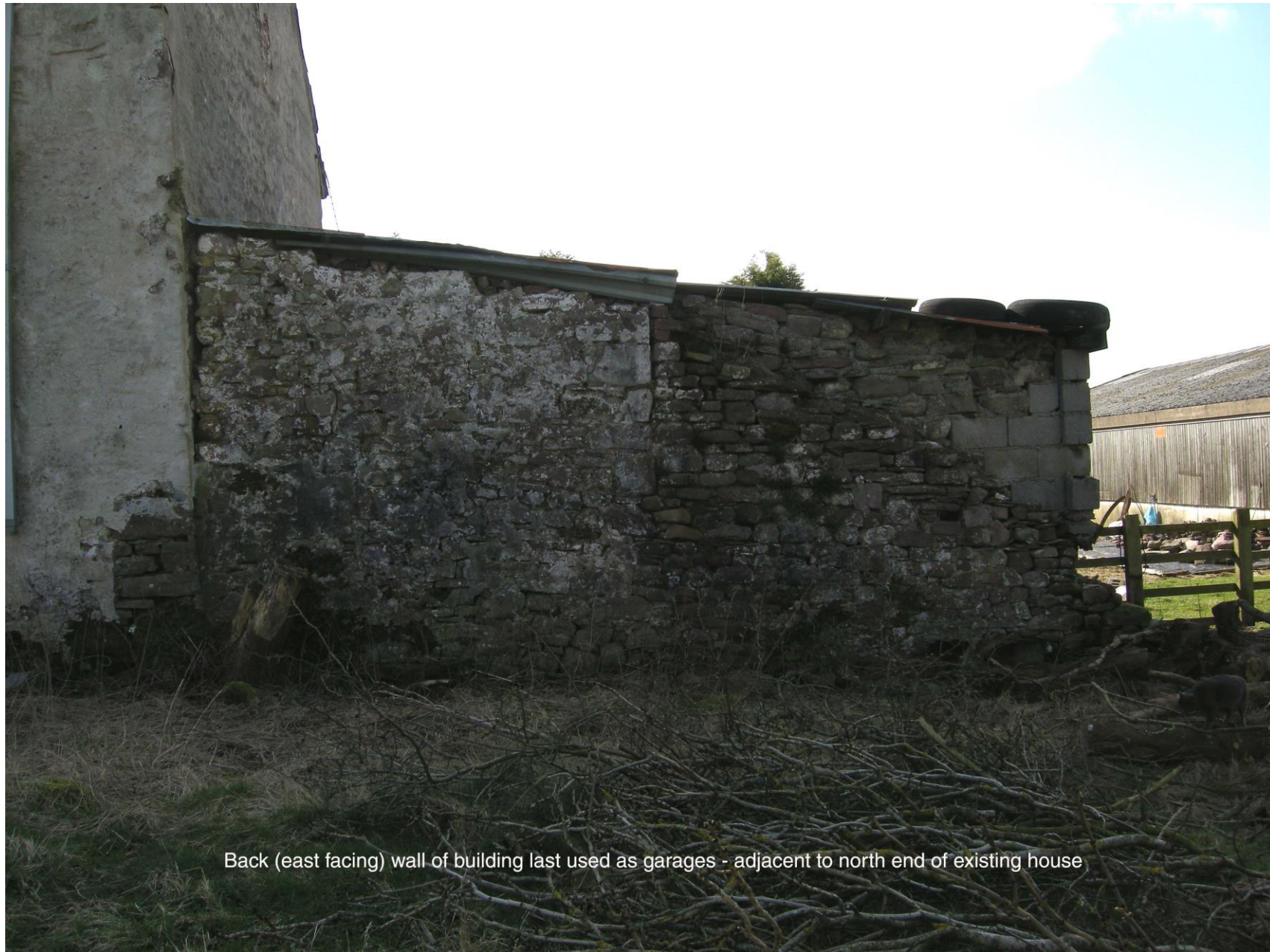
Back (east facing) wall of building last used as garages - adjacent to north end of existing house