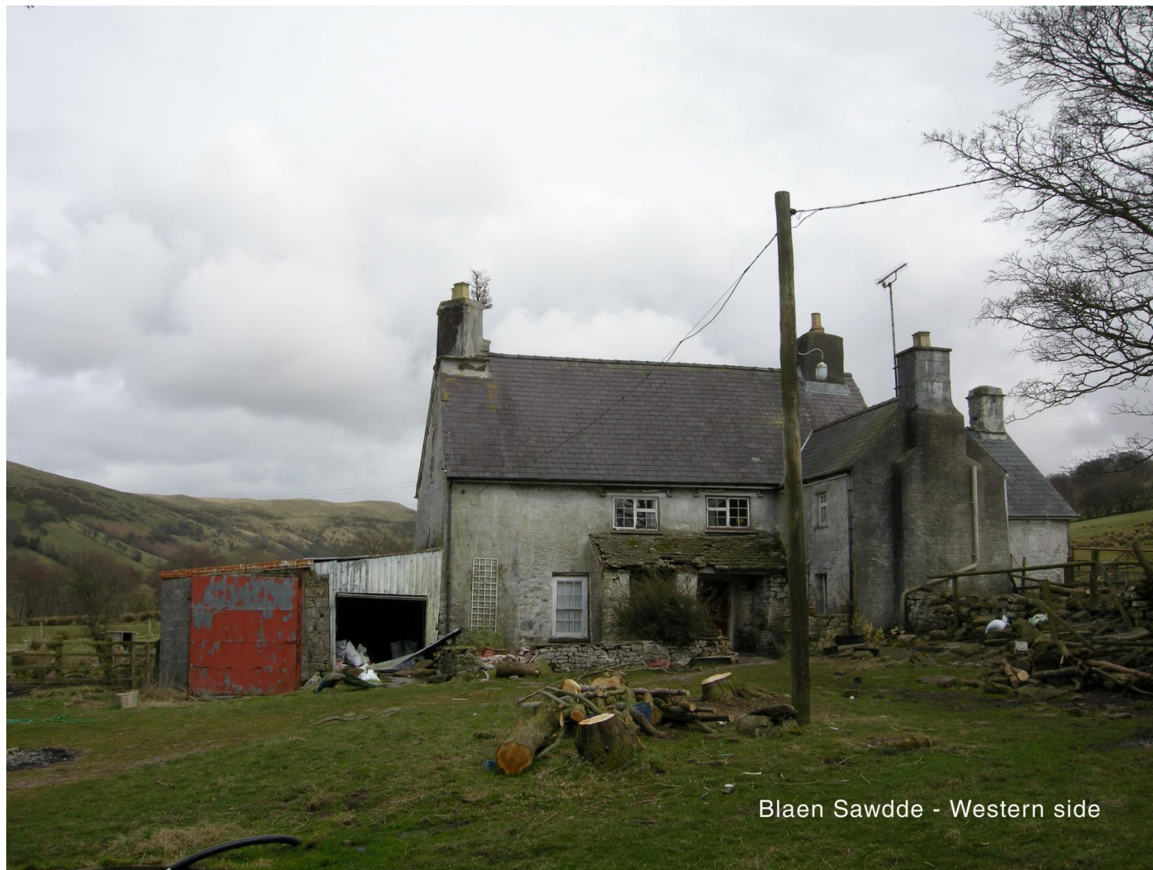
Blaen Sawdde - Western side