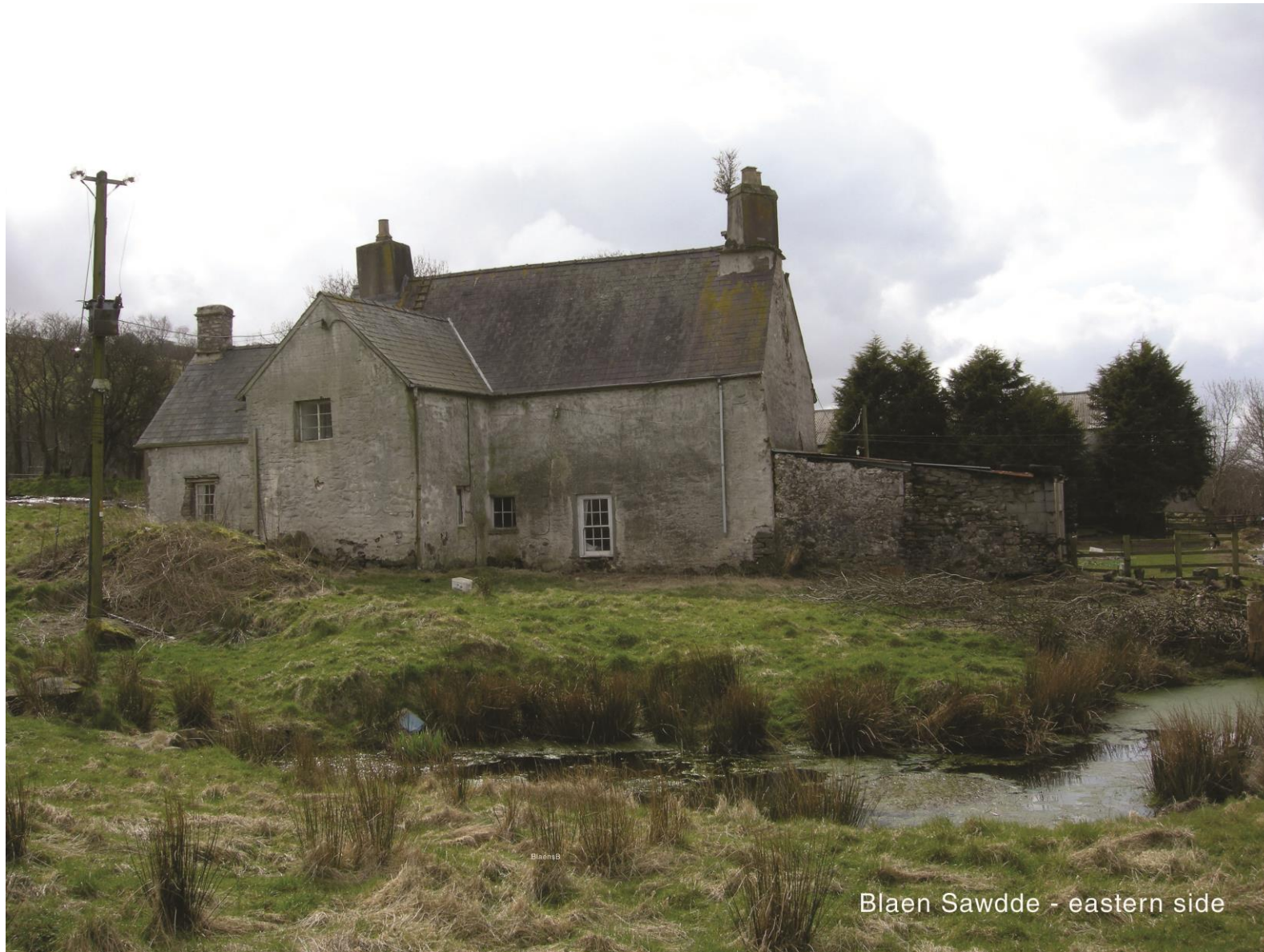
Blaen Sawdde - eastern side