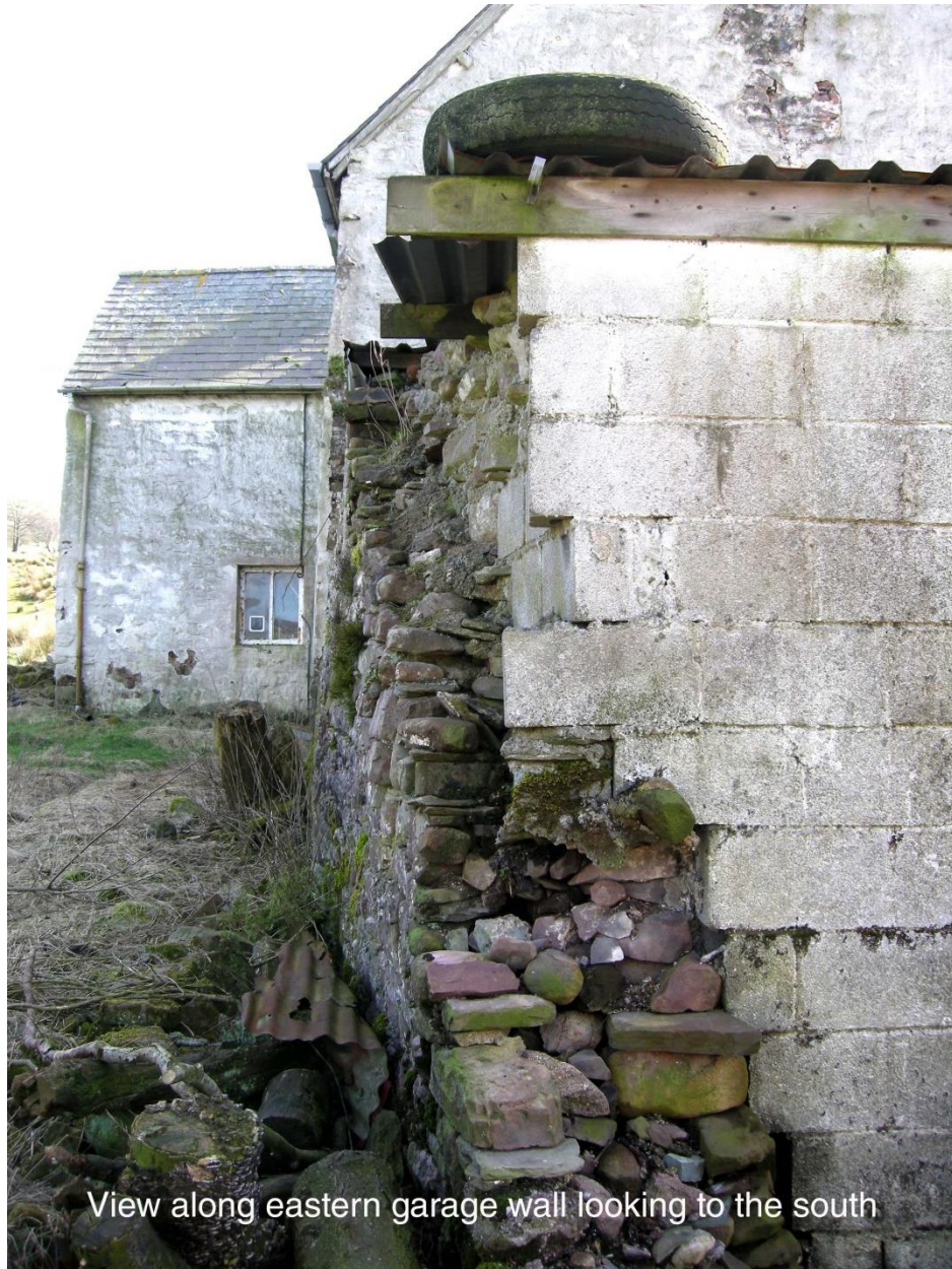
View along eastern garage wall looking to the south