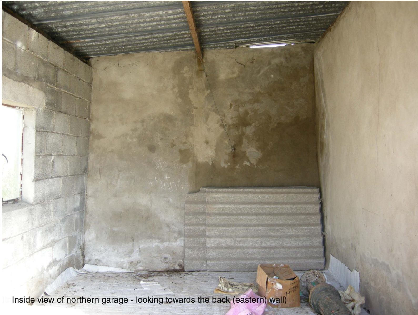
Inside view of northern garage - looking towards the back (eastern) wall