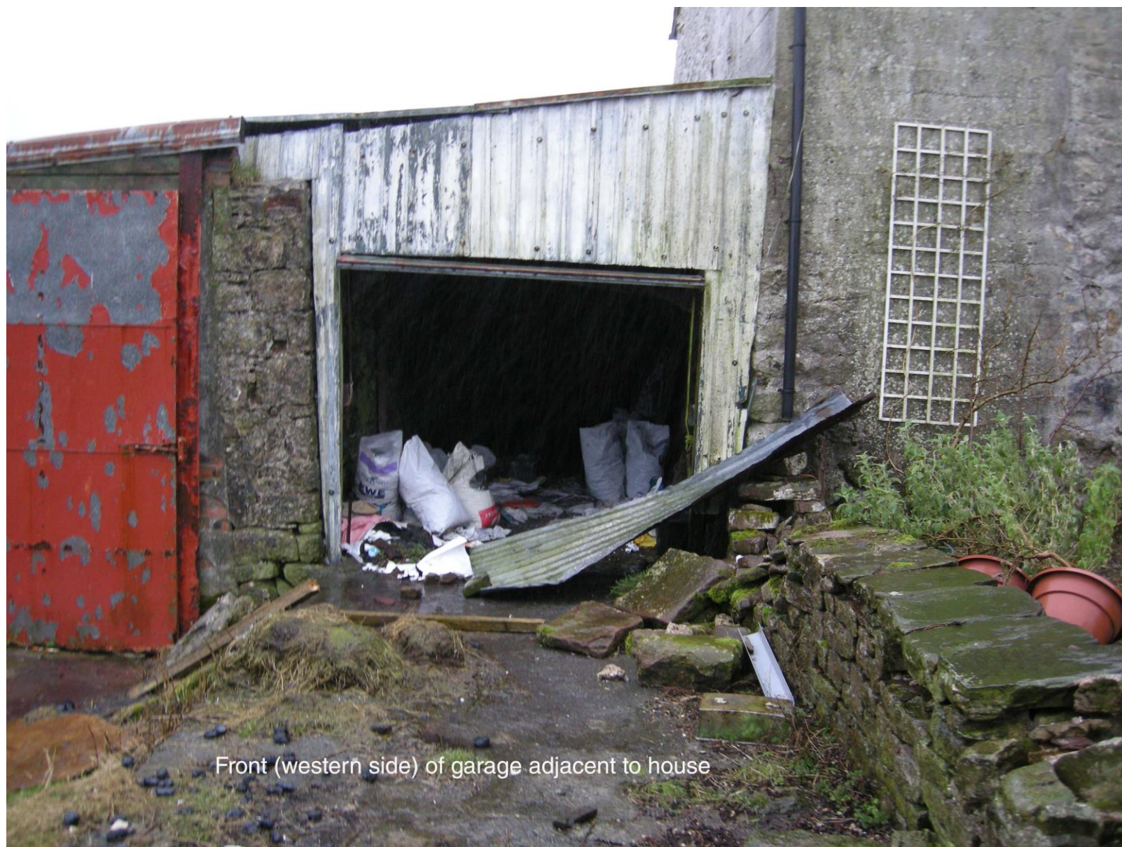
Front (western side) of garage adjacent to house