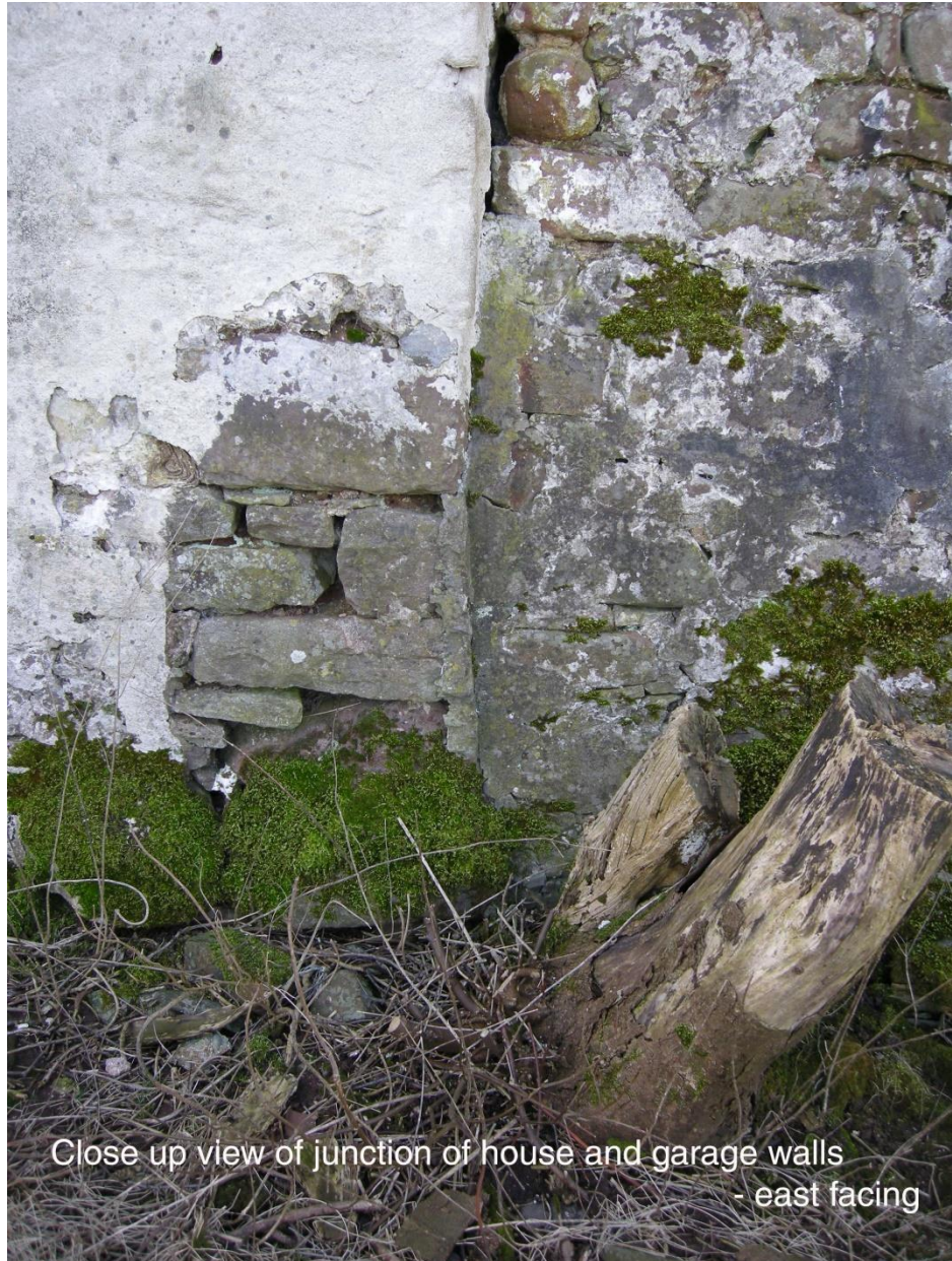
Close up view of junction of house and garage walls - east facing