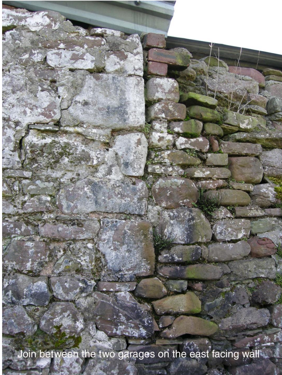
Join between the two garages on the east facing wall