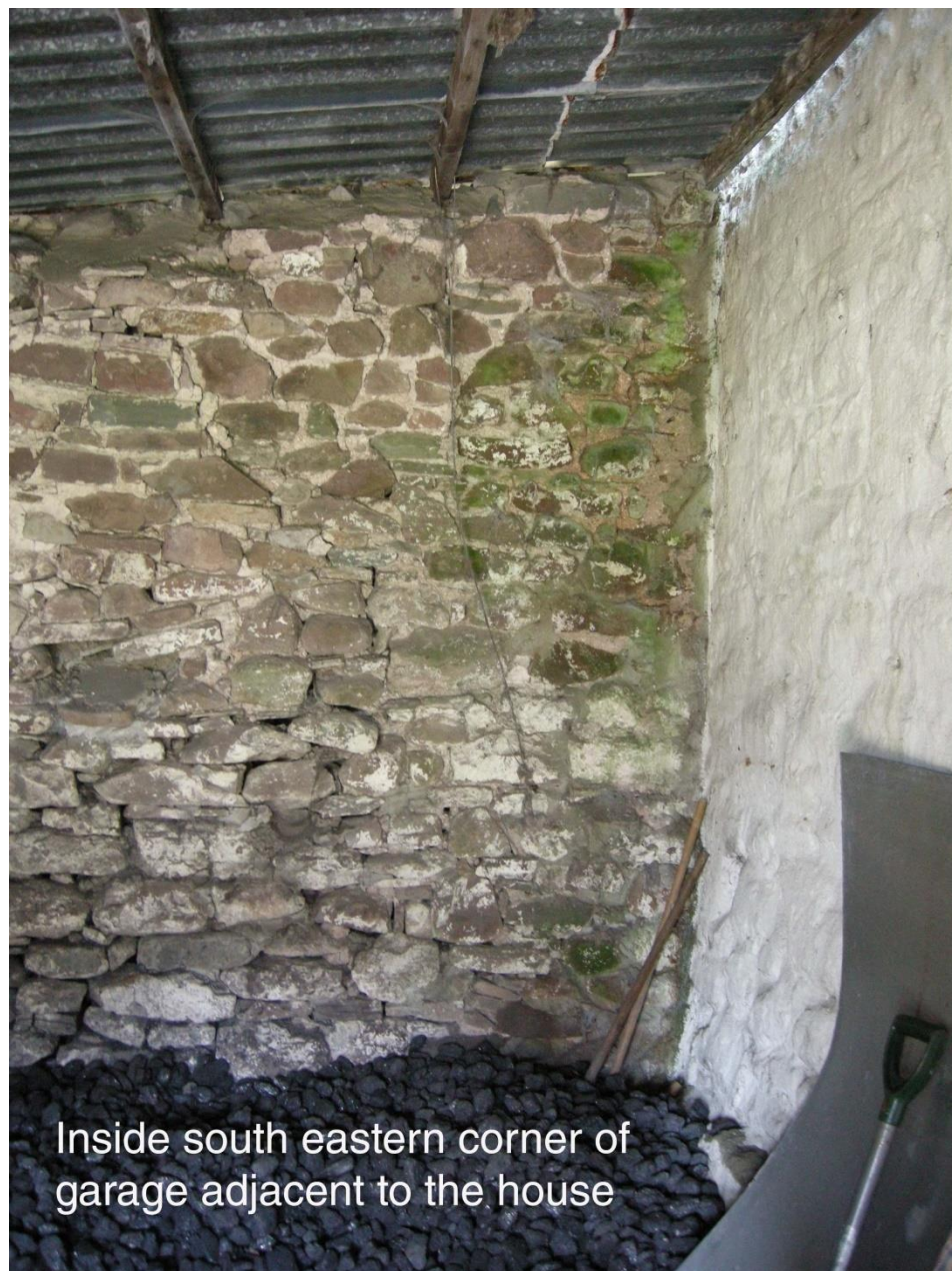
Inside south eastern corner of garage adjacent to the house