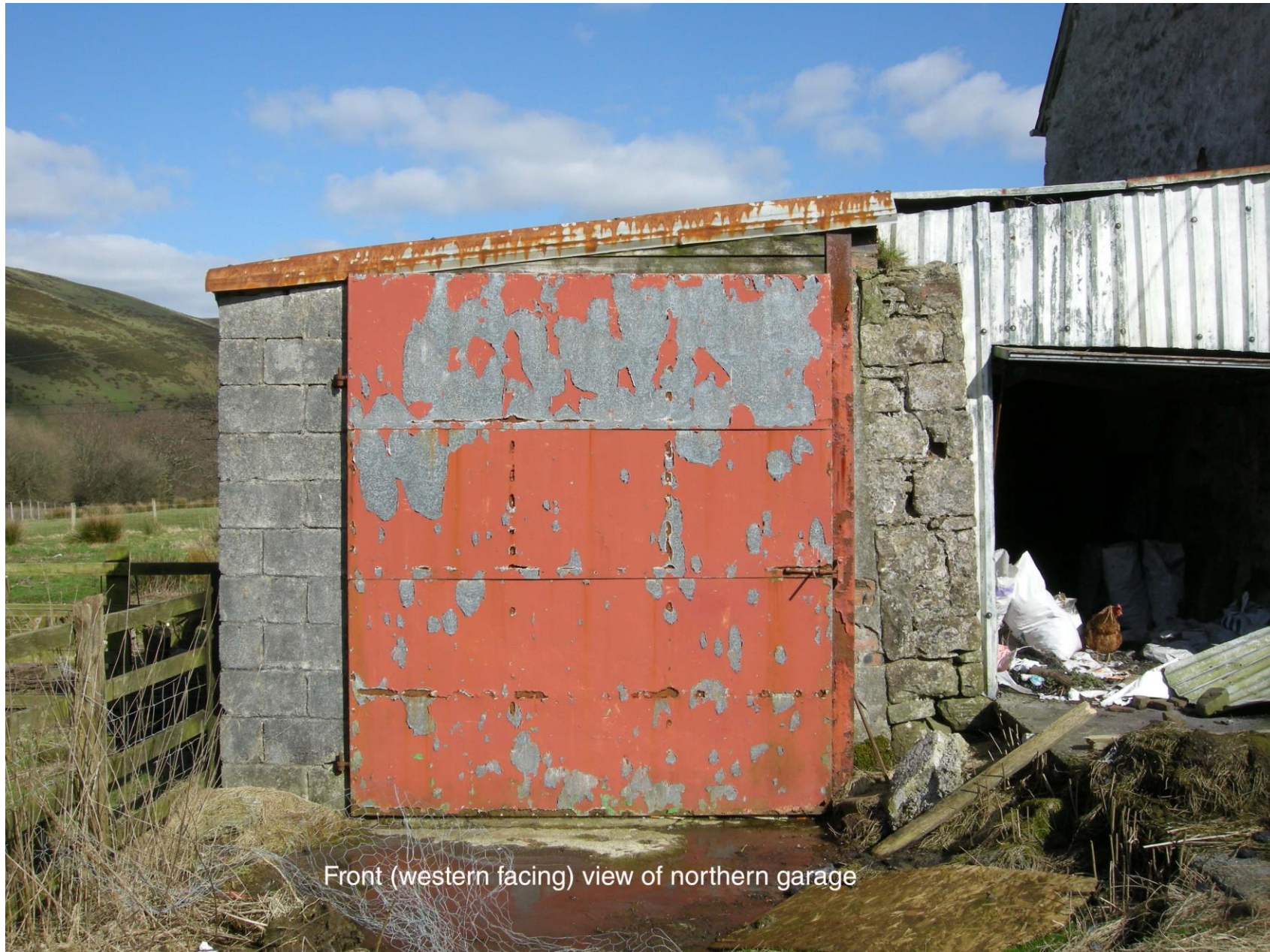
Front (western facing) view of northern garage