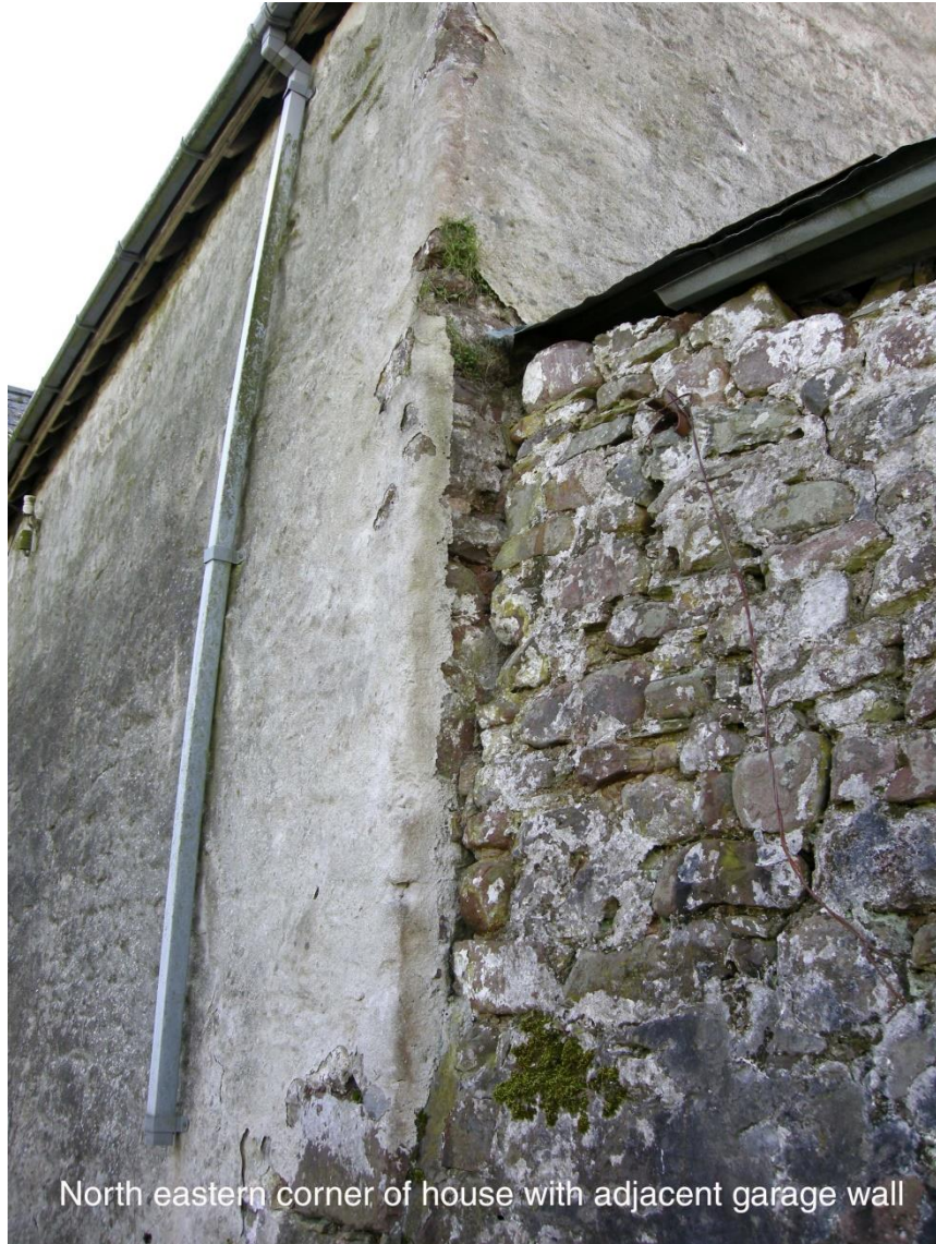
North eastern corner of house with adjacent garage wall