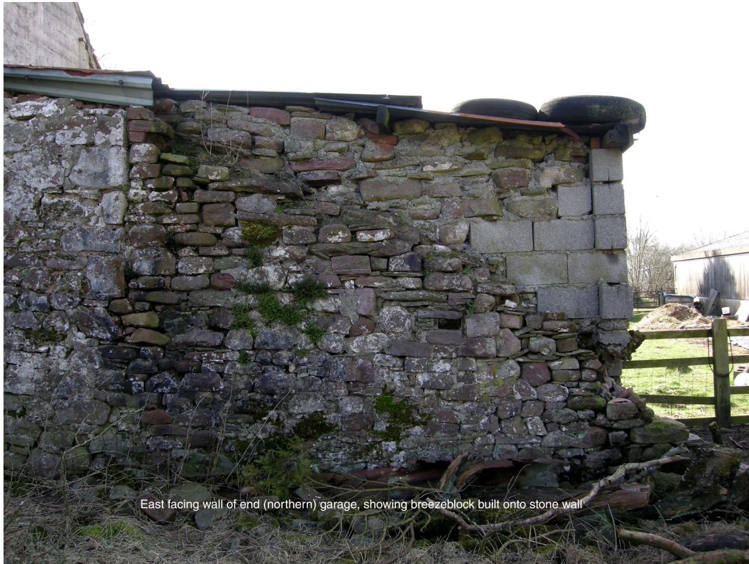
East facing wall of end (northern) garage, showing breezeblock built onto stone wall