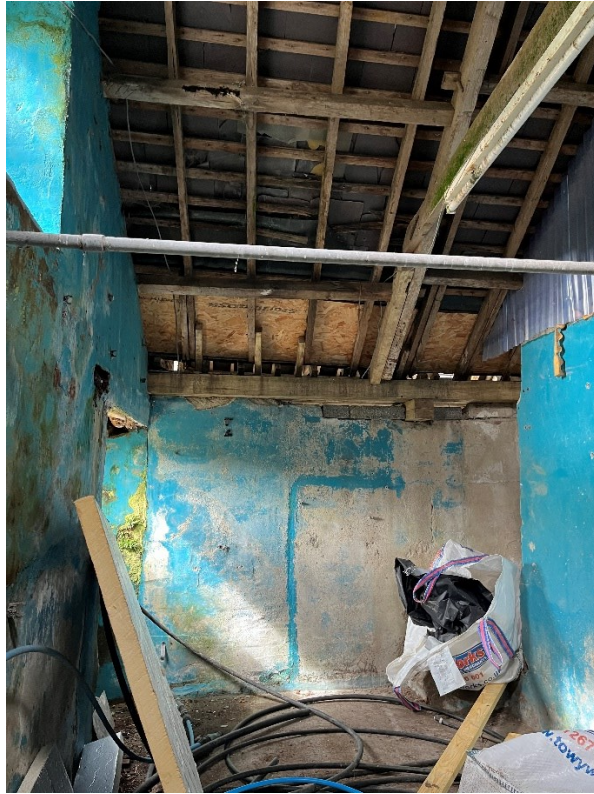
Figure 17. West Facing