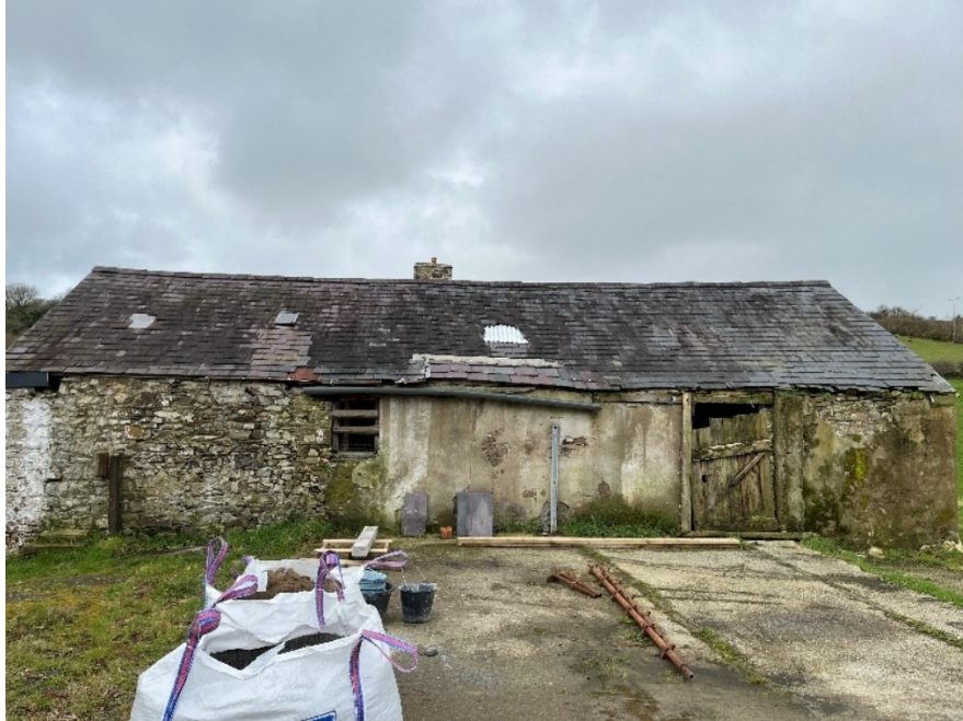
Figure 3. West Facing