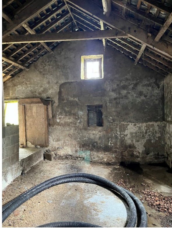
Figure 13. North Facing