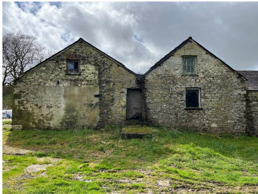
Figure 4. South Facing