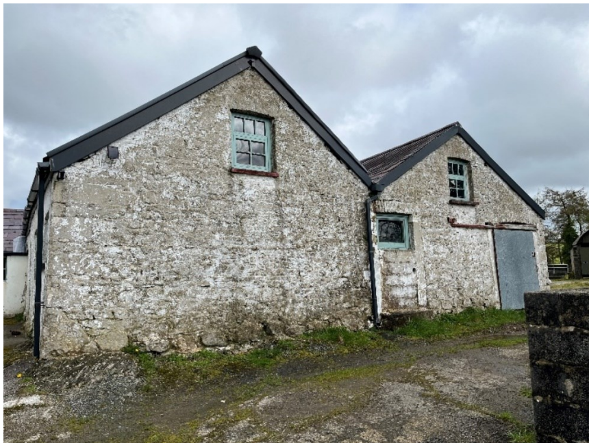
Figure 2. North-North East Facing (due to obstruction)