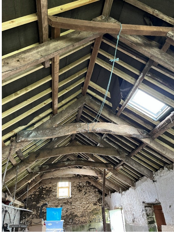
Figure 9. South Facing