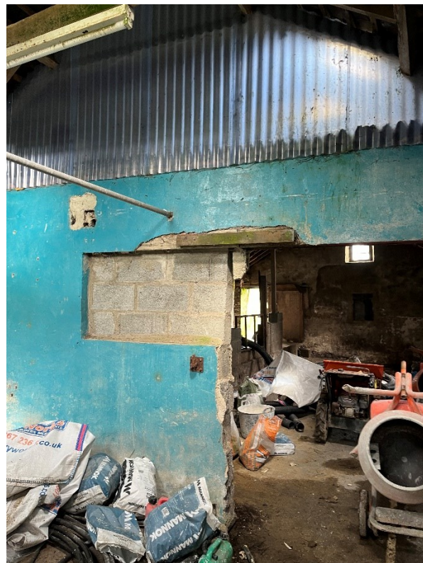
Figure 16. North-North-West Facing