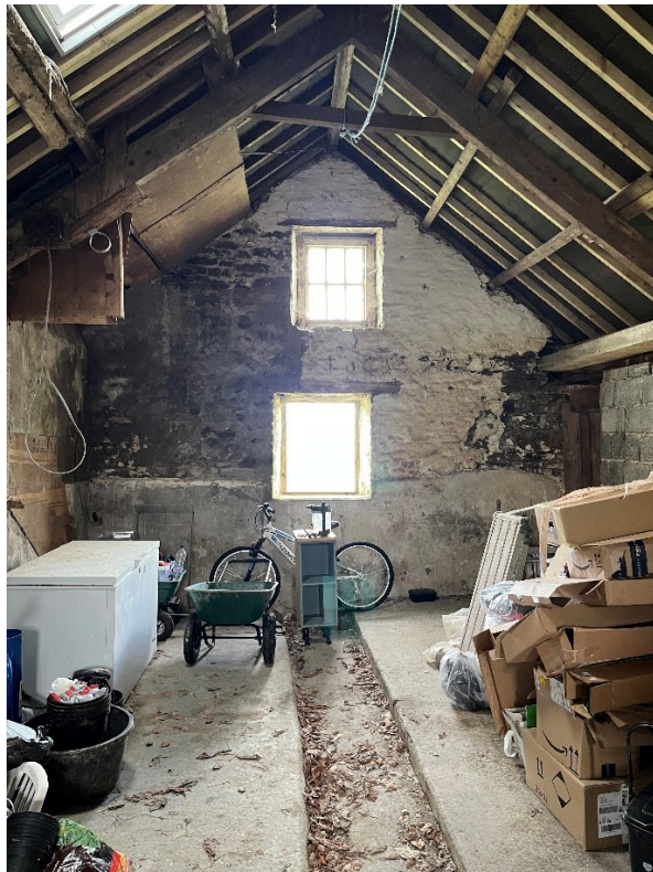
Figure 6. North Facing