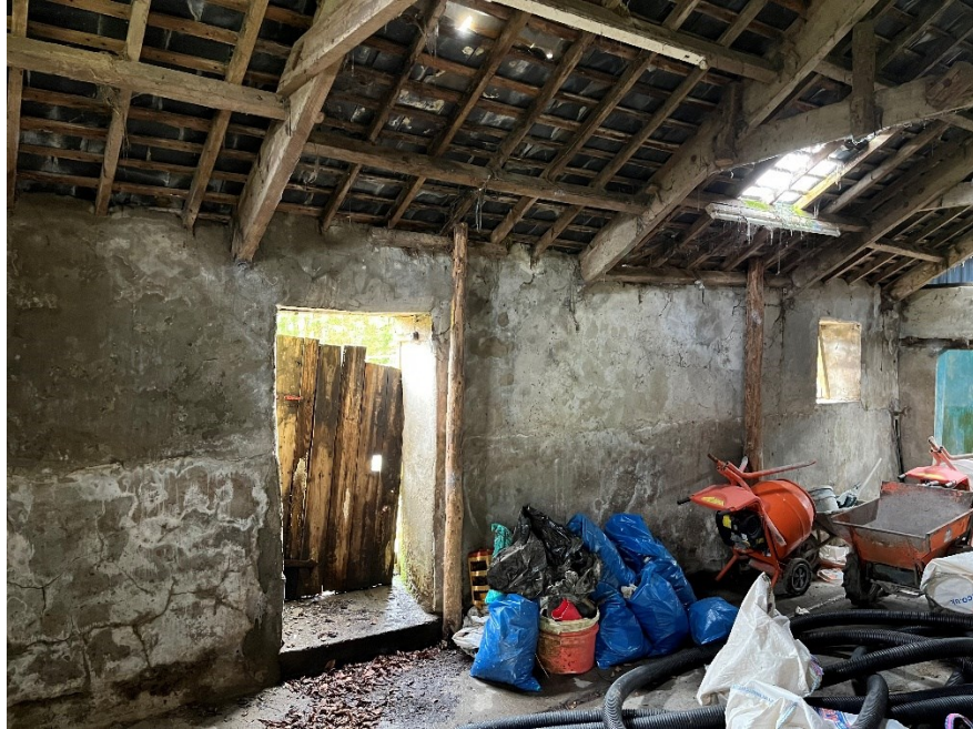
Figure 11. East-South-East Facing