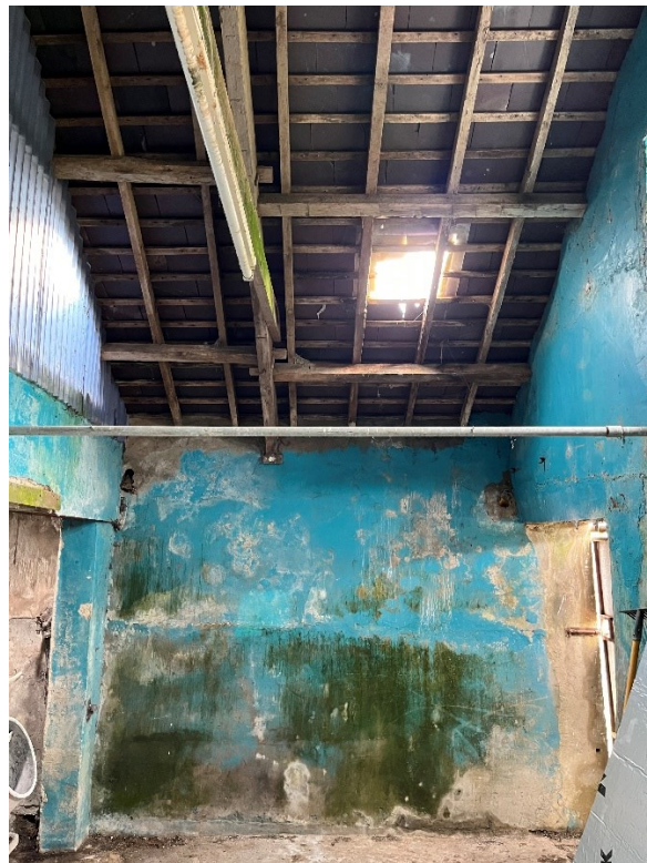
Figure 18. East Facing