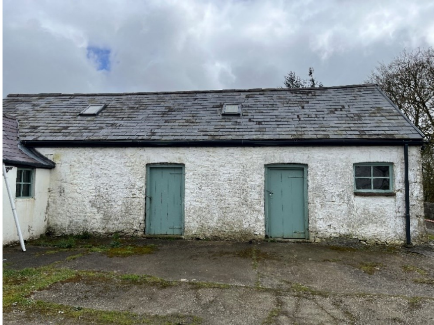
Figure 1. East Facing