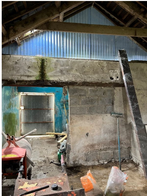
Figure 14. South Facing