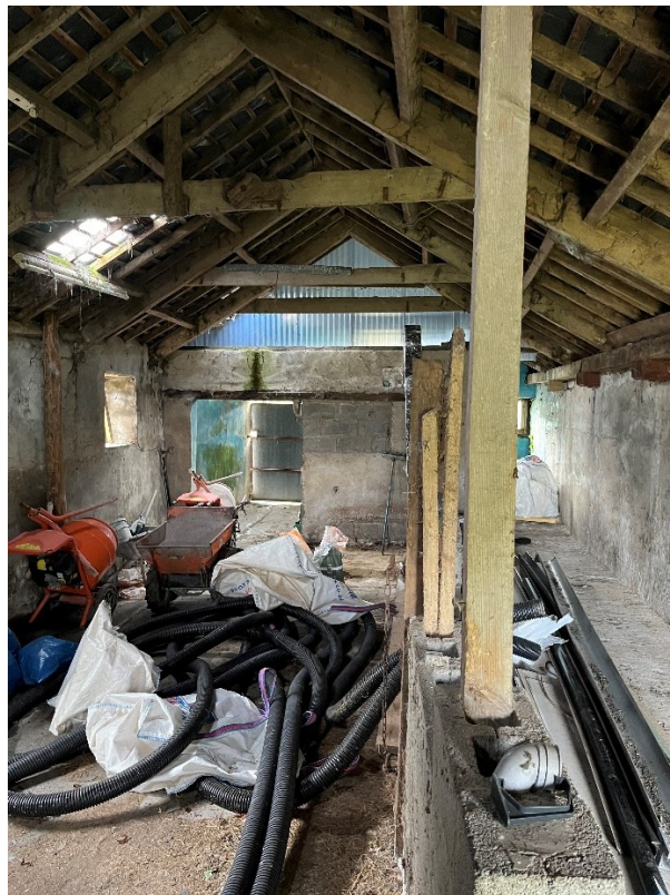
Figure 10. South Facing