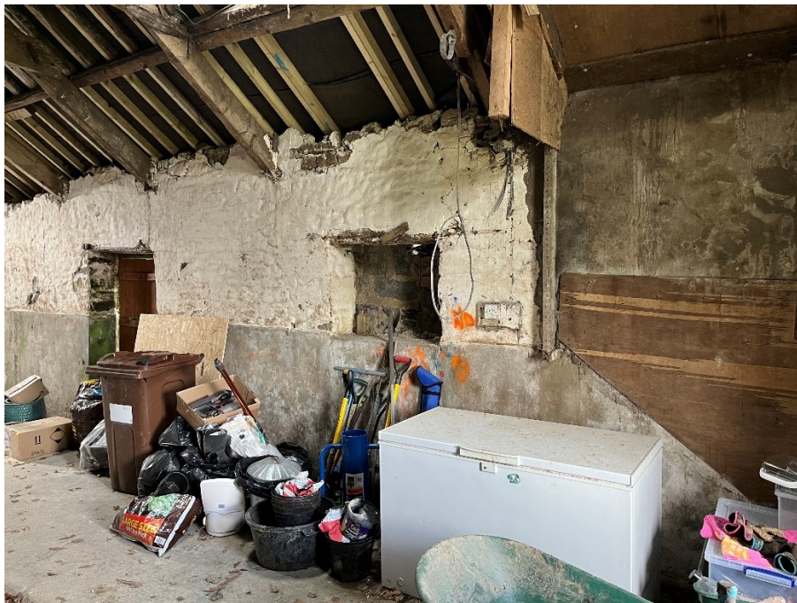
Figure 8. West-South-West Facing