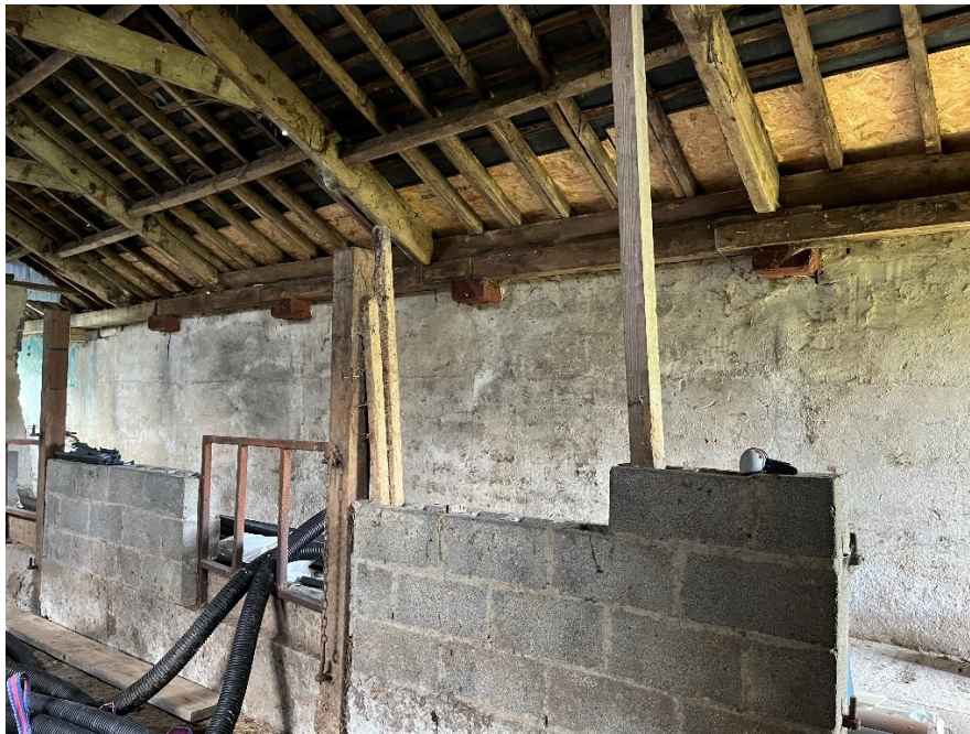
Figure 12. South-West Facing