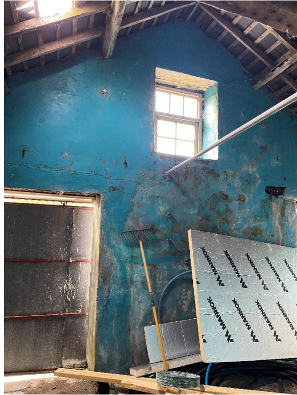
Figure 15. South-South-West Facing