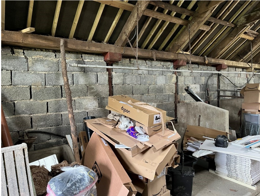
Figure 7. East-South-East Facing