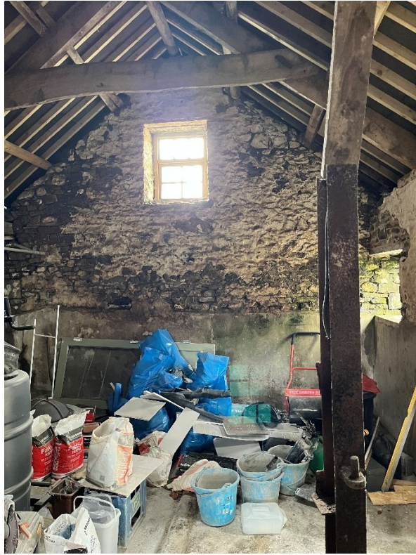
Figure 5. South Facing