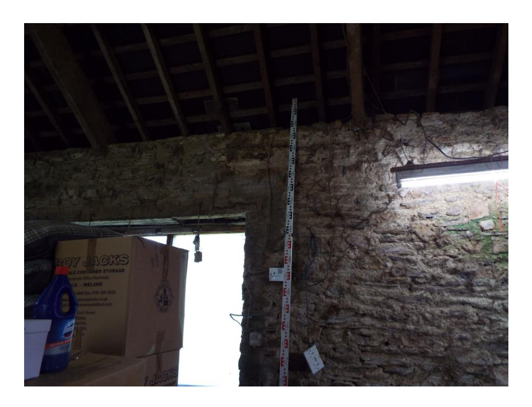
Position 16 – Internal view – wall and window on SE elevation