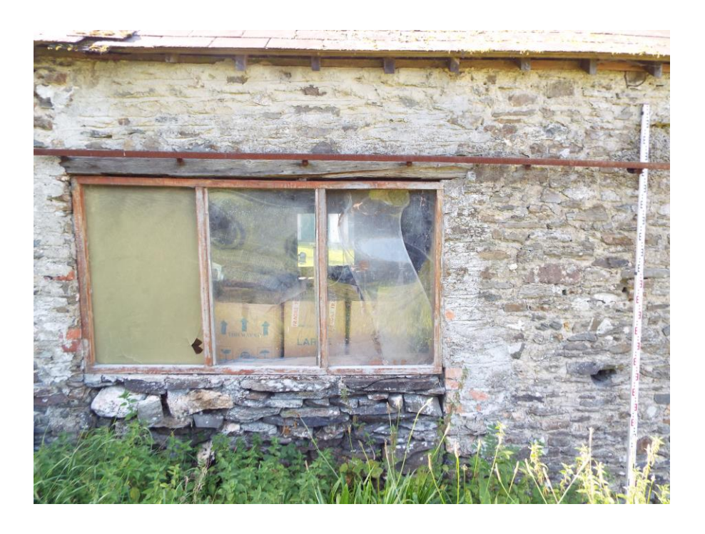
Position 10 – SE elevation showing window detail