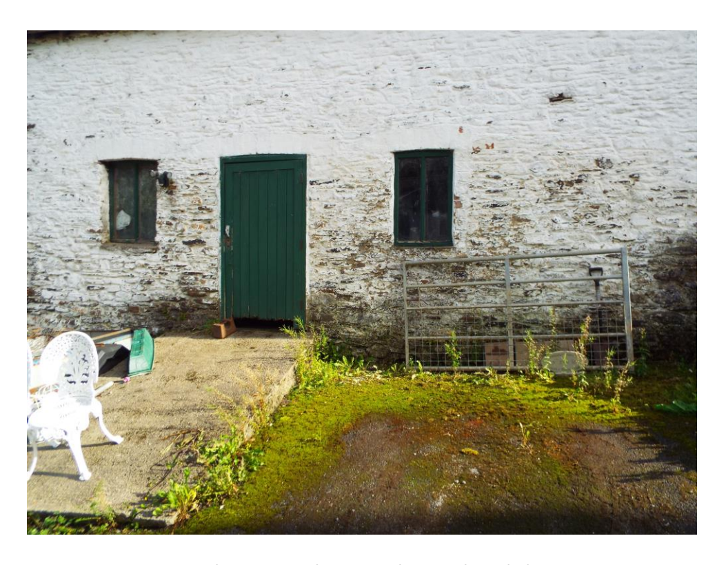
Postion13 – NW Elevation showing lower level door entry