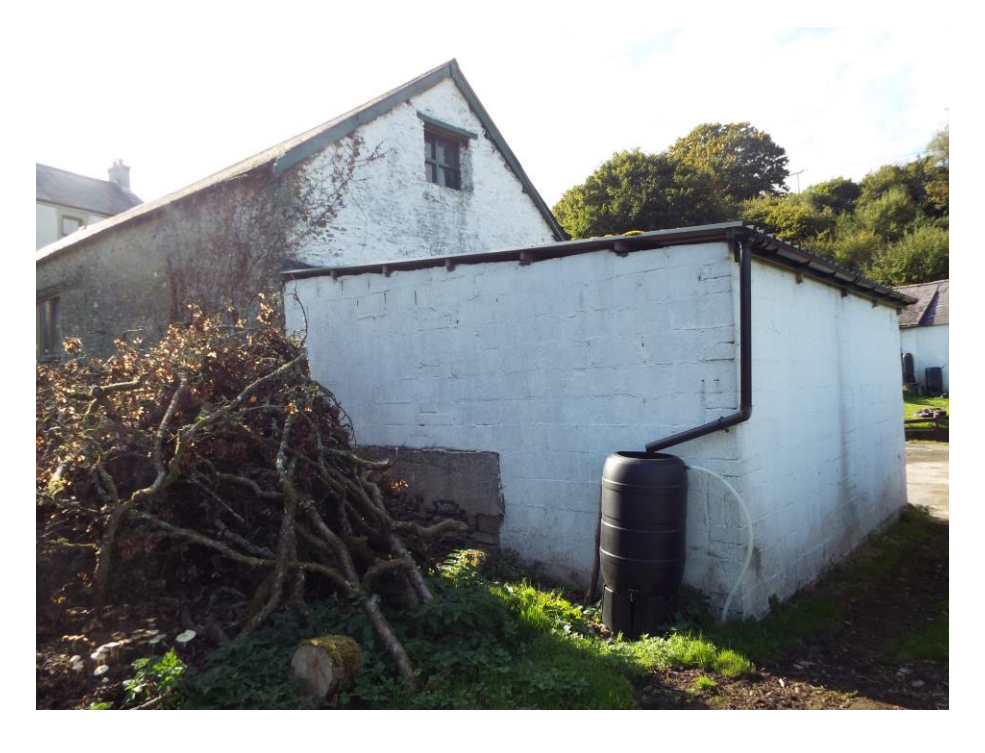
Position 7-NE elevation (unable to get direct face-on view due to proximity of the property boundary)