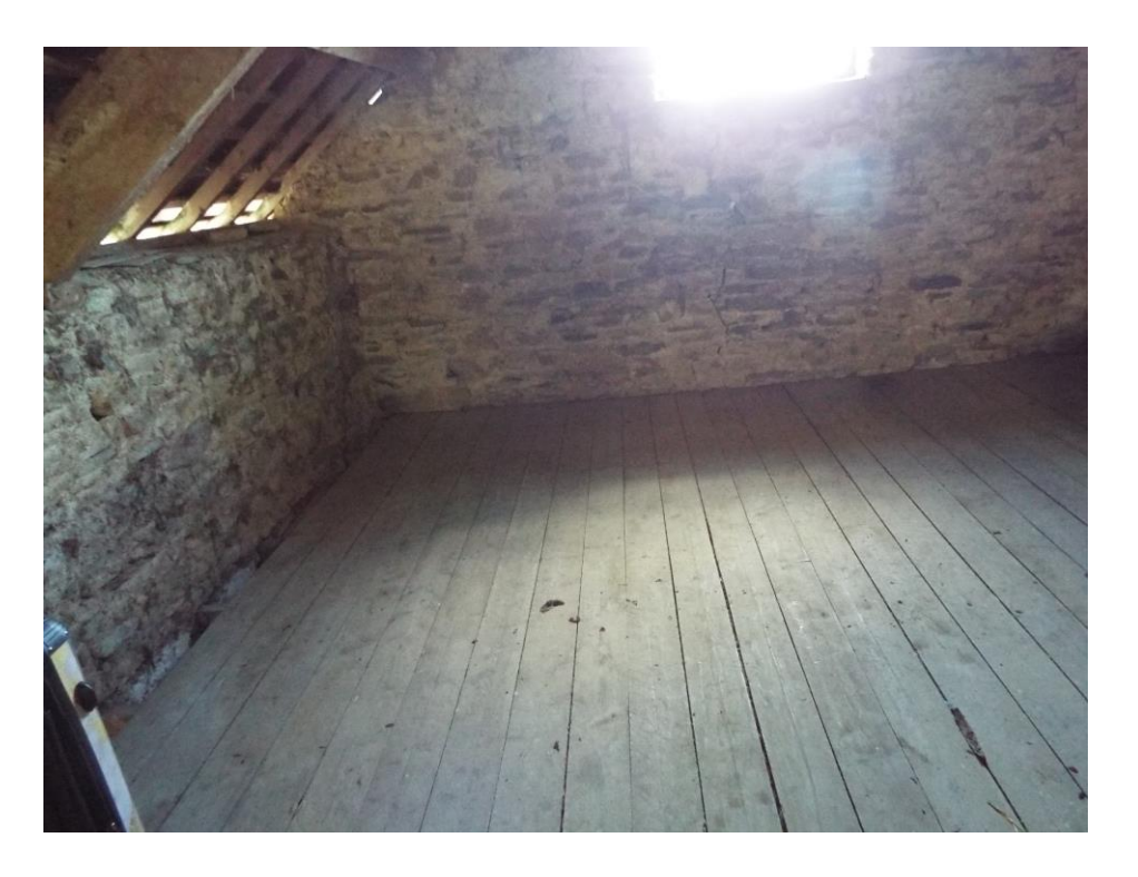
General view of mezzanine floor