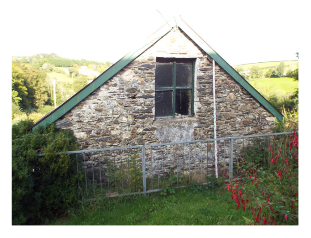
Position 5 – SW Elevation