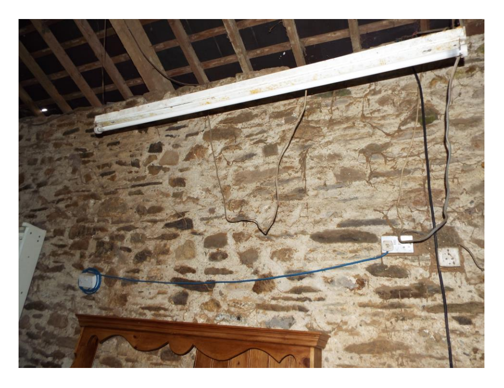
Position 17 - internal wall – NW elevation