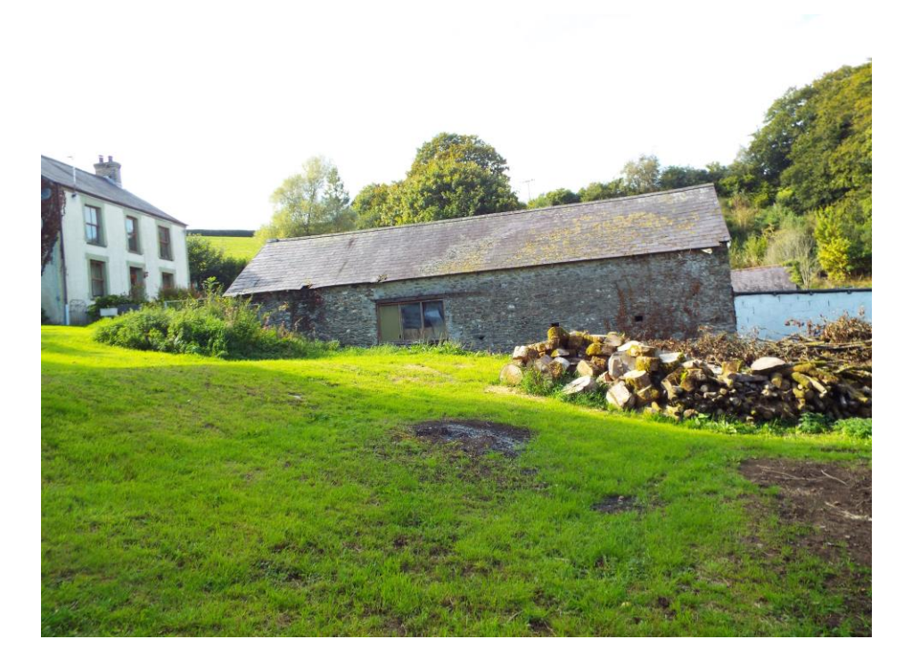
Position 3 – taken from SE point