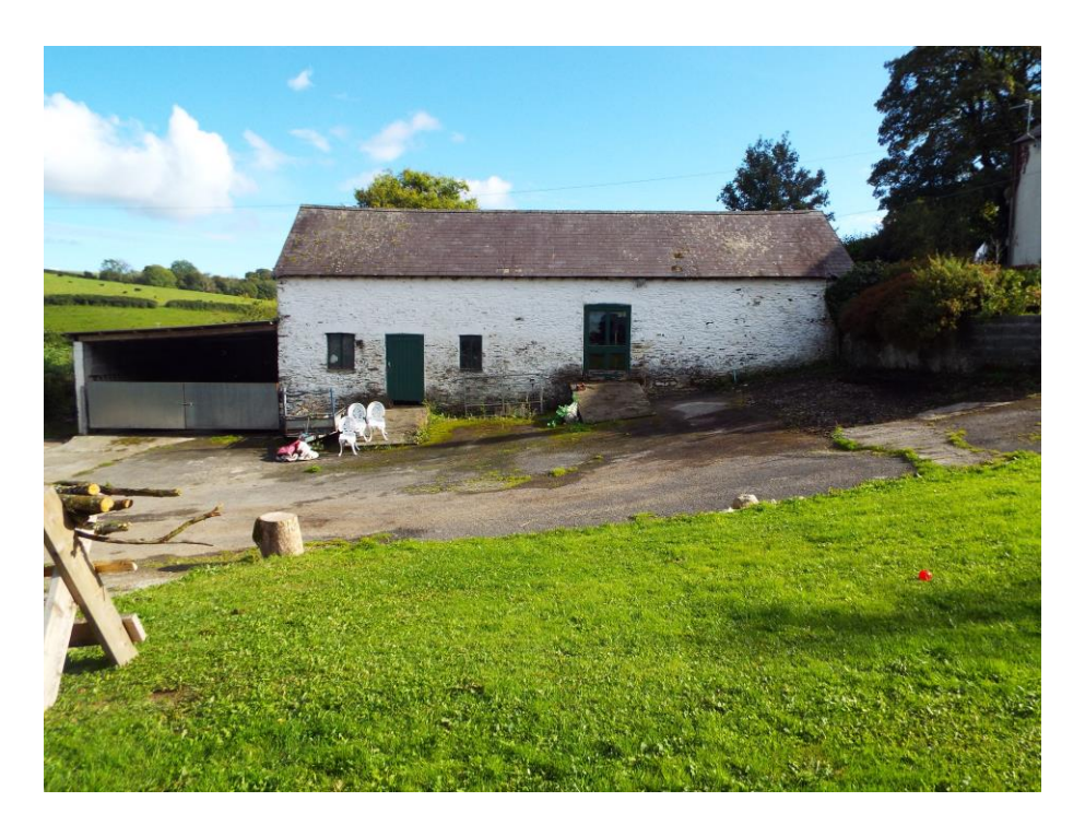
Position 8 – NW Elevation