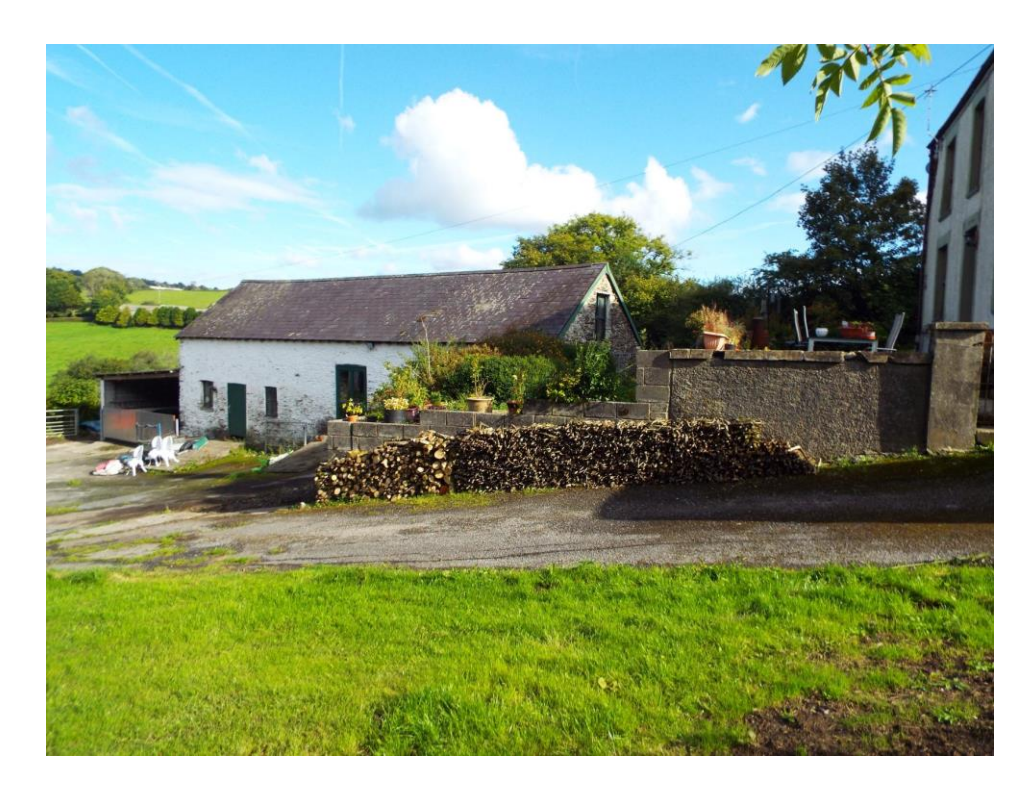
Position 1 – taken from NW point