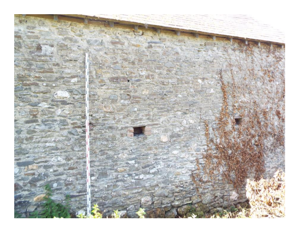
Position 11 – SE Elevation showing wall detail