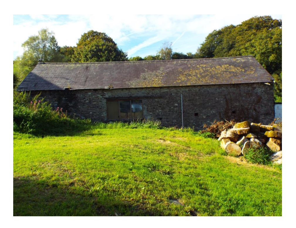
Position 6 – SE Elevation