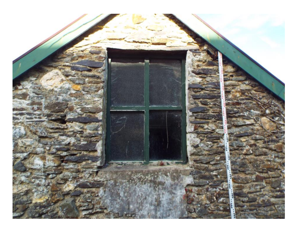
Position 9 – SW Elevation showing = window detail