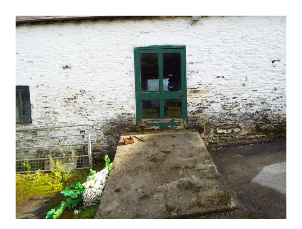
Position 12 – NW Elevation showing upper level door entry