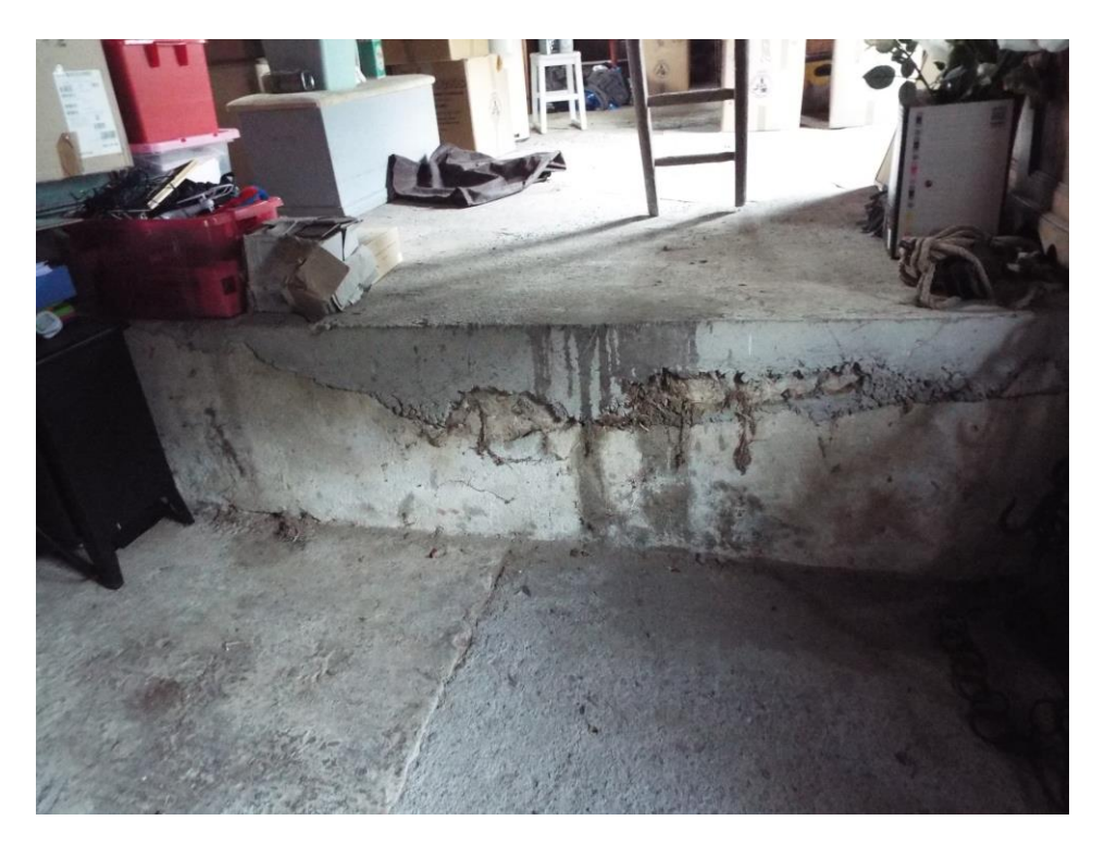
Position 15 – floor level step