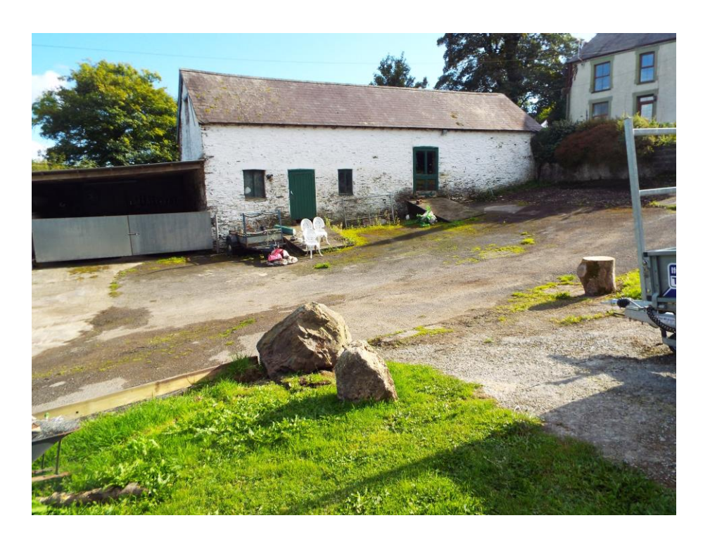
Position 4 – taken from NE point