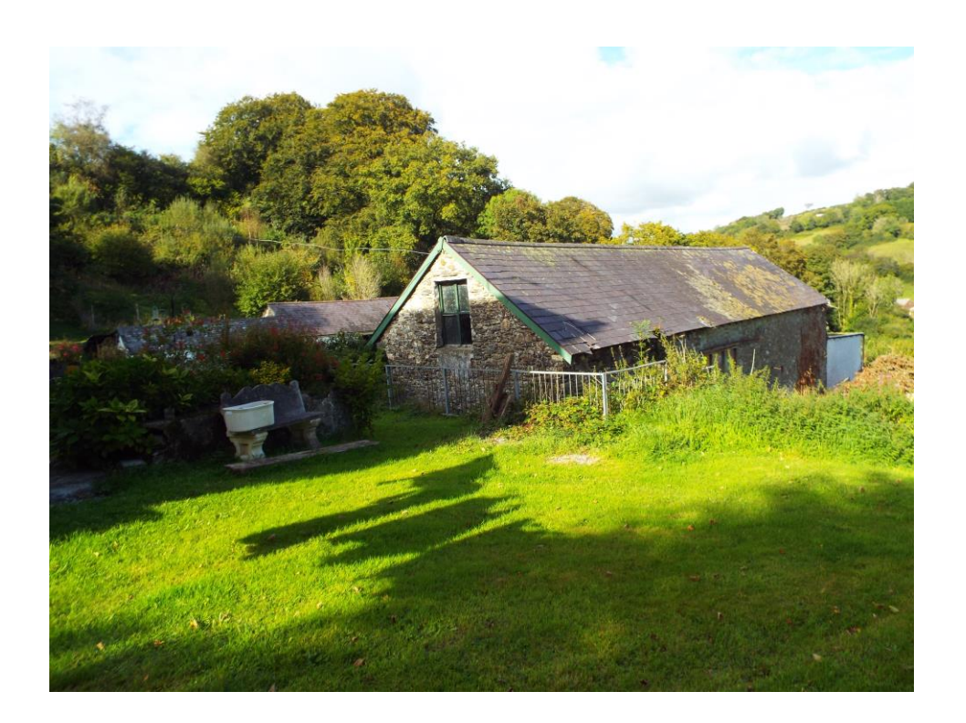
Position 2 – taken from SW point