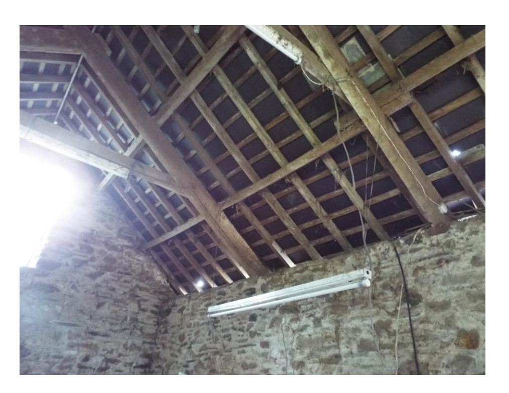
General view of roof showing rafters, purlins and A frames