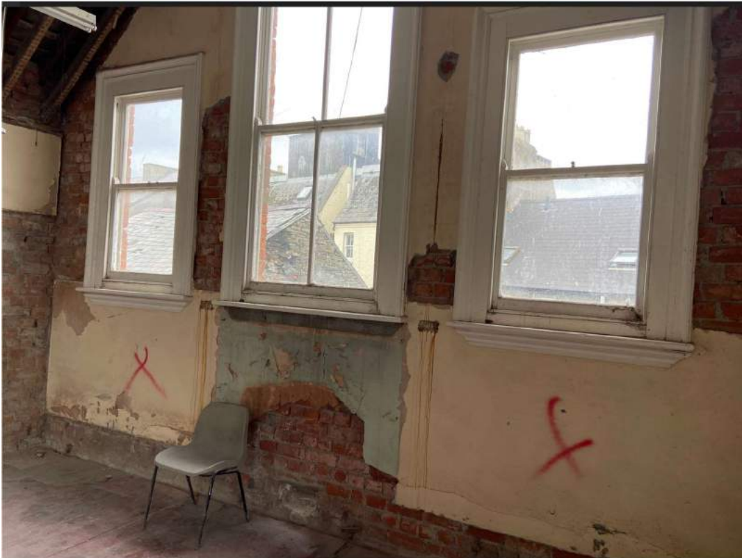
Photo 30 First Floor View Out Of Window Towards North West.