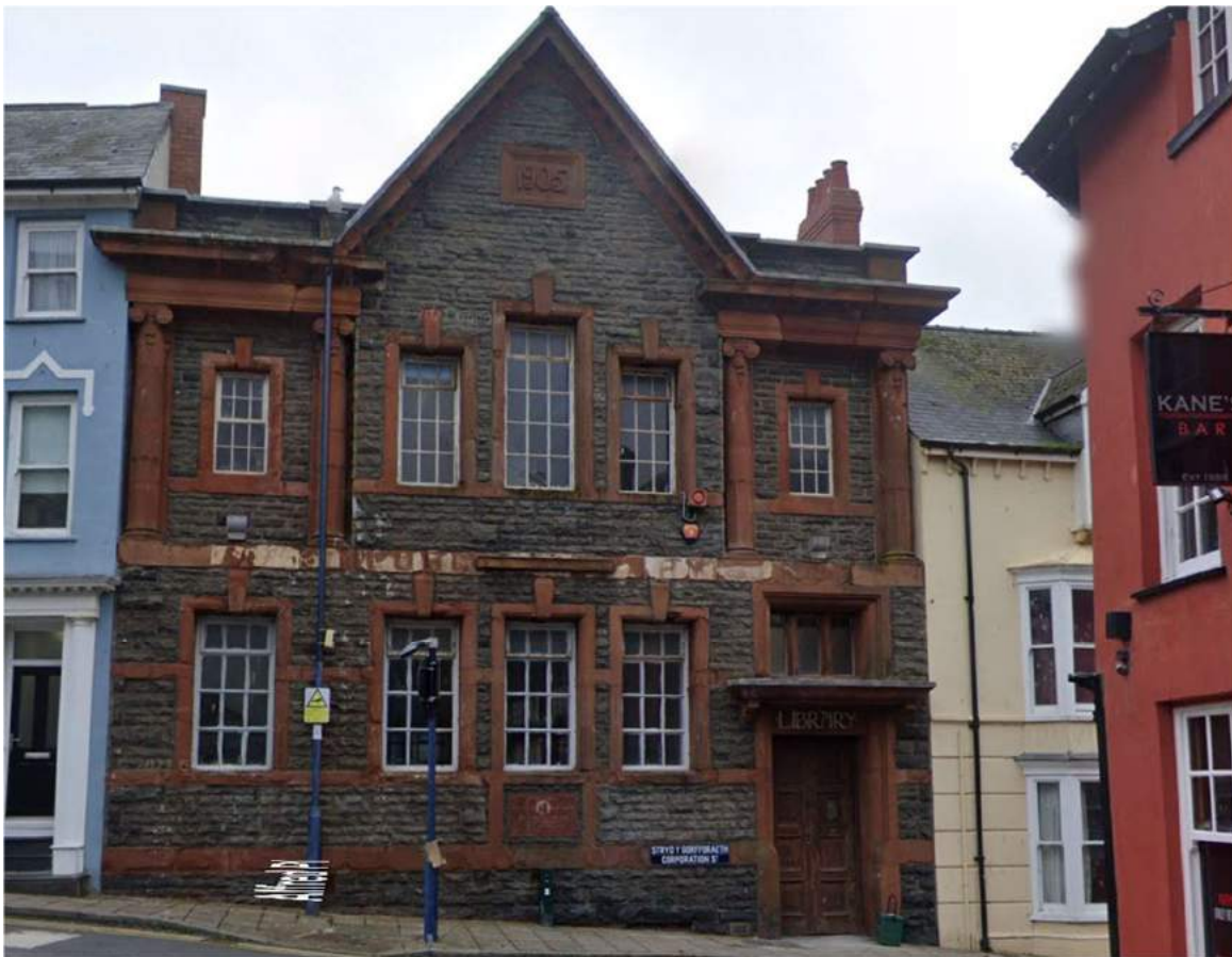
Photo 1 External Corporation St Elevation.

The development shall not begin until an appropriate photographic survey of the existing building(s) has been carried out in accordance with guidelines provided by the Local Planning Authority's archaeological advisors - Dyfed Archaeological Trust-Heritage Management. The resulting photographs should be approved by the planning authority prior to the commencement of development and deposited with the regional Historic Environment Record held, and maintained by the Dyfed Archaeological Trust, Corner House, Carmarthen Street, Llandeilo, Carmarthenshire, SA19 6AE, (Tel 01558-823121).