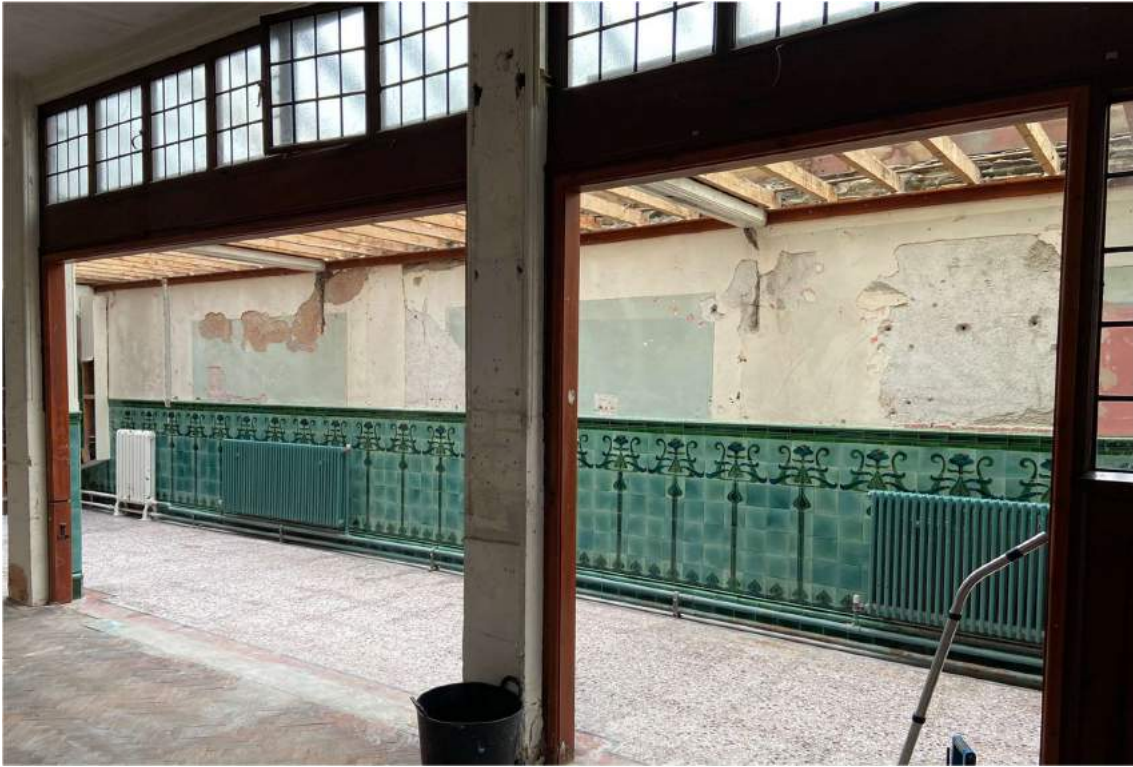
Photo 12 Tiling on North Wall.