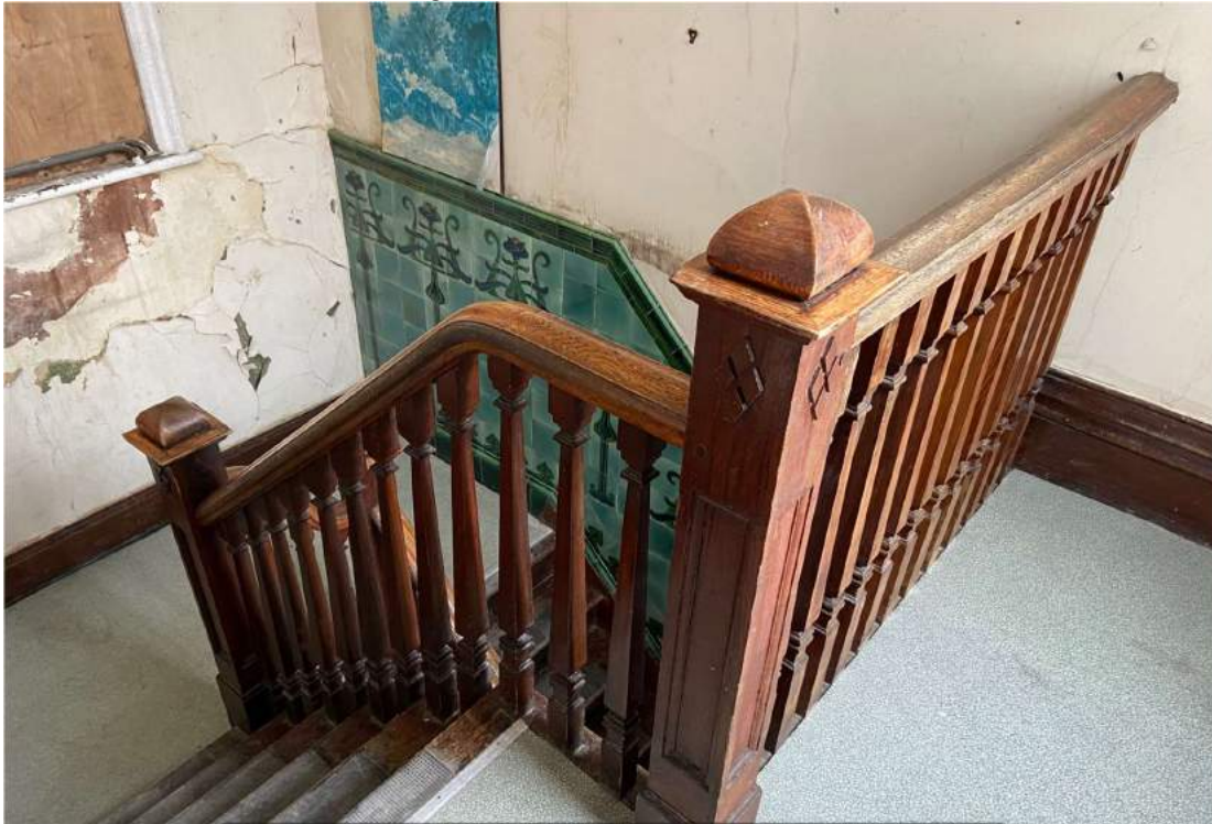
Photo 18 Ground Floor view towards West.