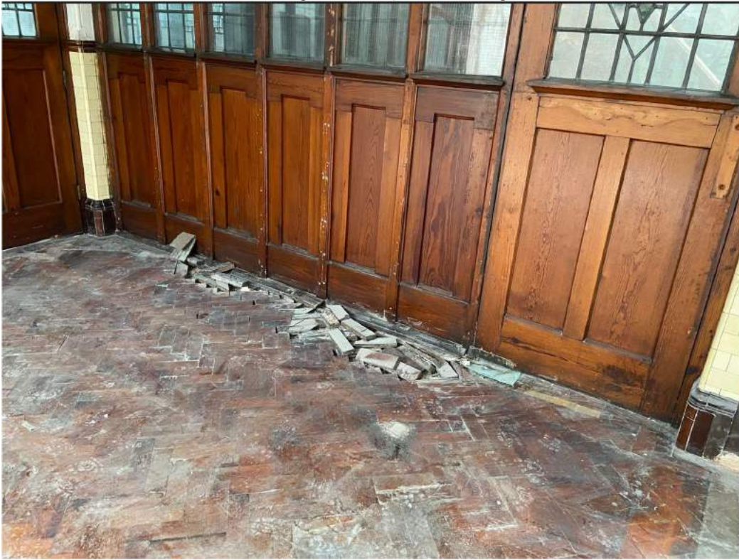
Photo 20 Ground Floor view towards South West.