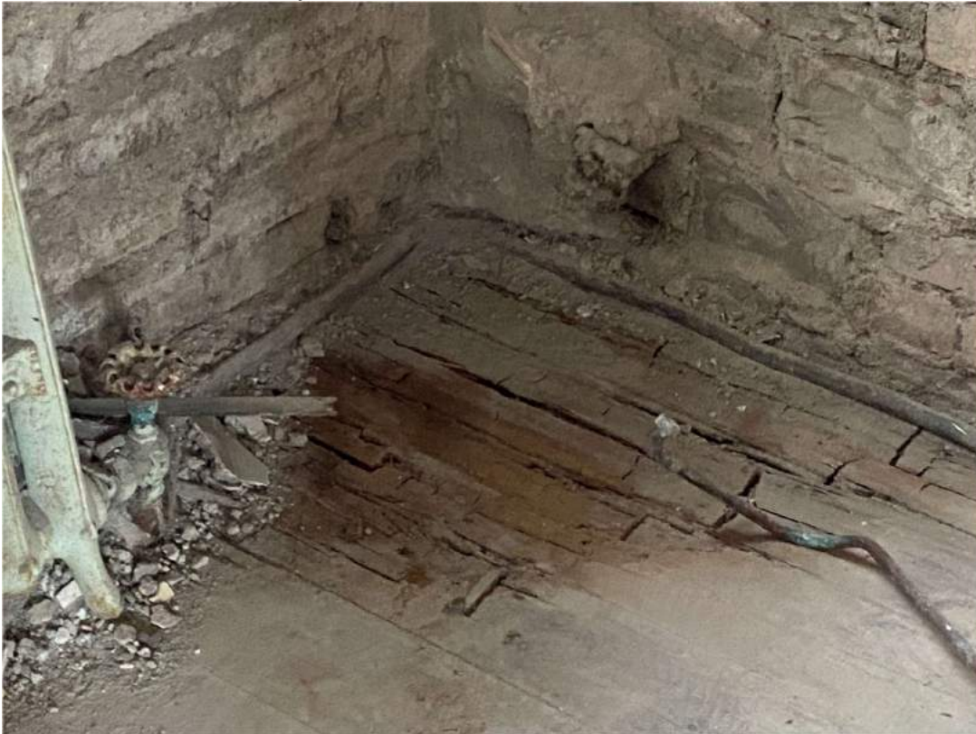
Photo 32 First Floor South Wall and Ceiling