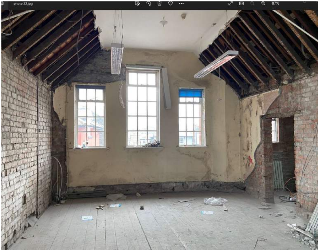
Photo 28 First Floor View Towards North.