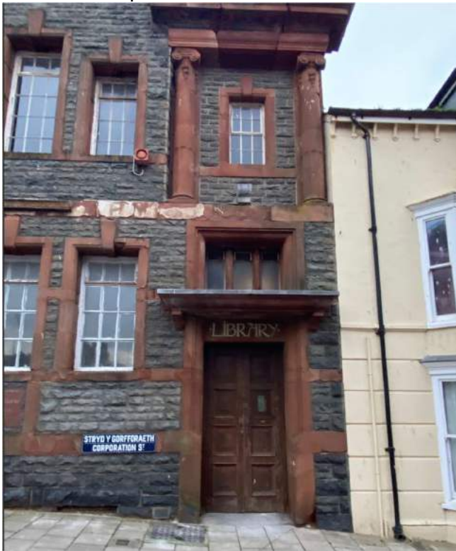
Photo 3 Corporation Street Ground Floor Windows