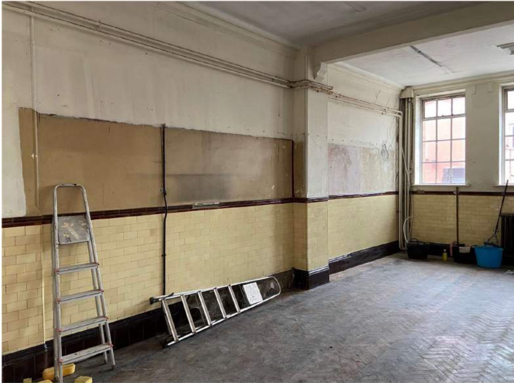
Photo 24 Room in North West Corner of Ground Floor