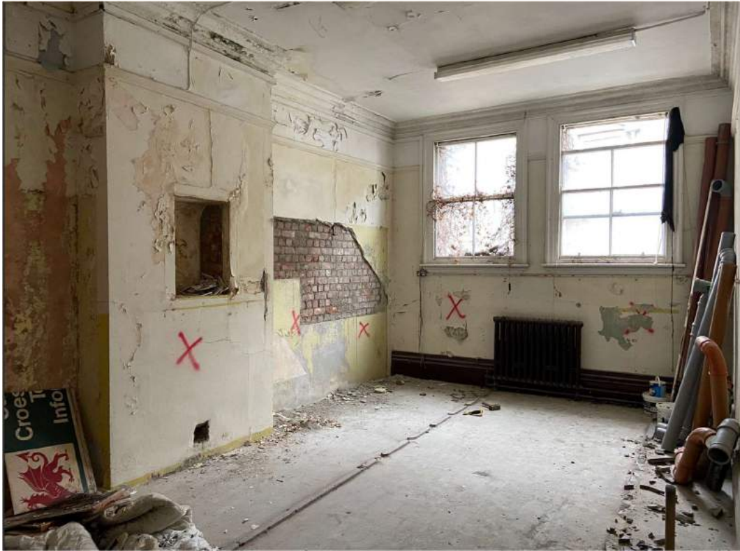
Photo 26 Bathroom on top mezzanine North East Corner.