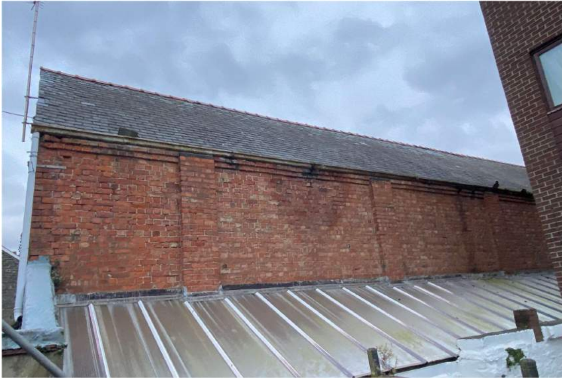
Photo 7 North Elevation Existing Upvc Windows