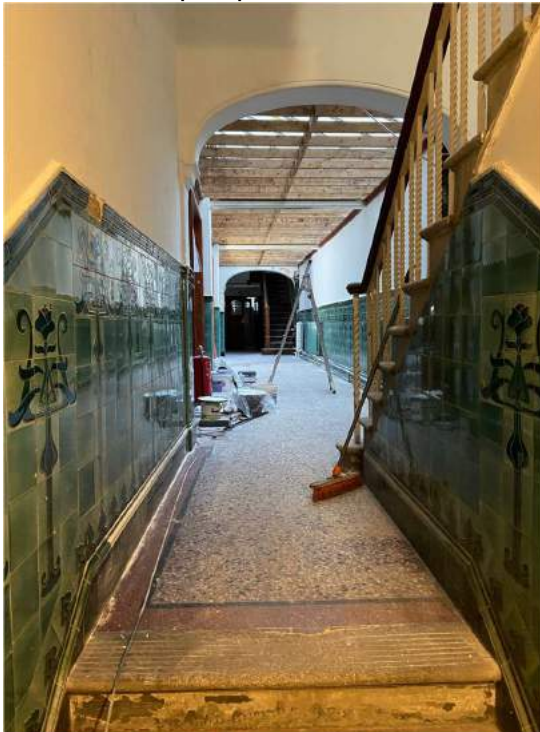
Photo 10 Looking back at entrance