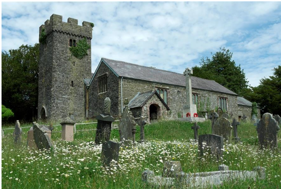
St Cathan's, Llangathen, Carmarthenshire. (PRN 709).