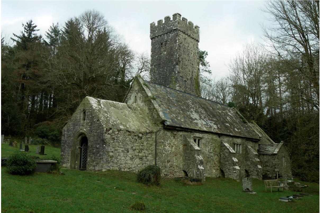
St Lawrence, Gumfreston, South Pembrokeshire. (PRN 3687).