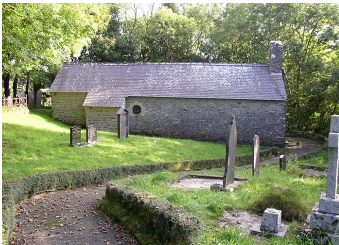
St Cynon's, Capel Cynon, Ceredigion. (PRN 5276).