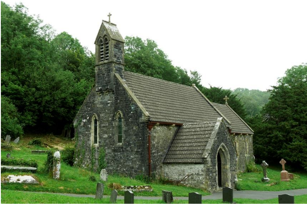
St David's, Llanddewi Velfrey, South Pembrokeshire. (PRN 3728).