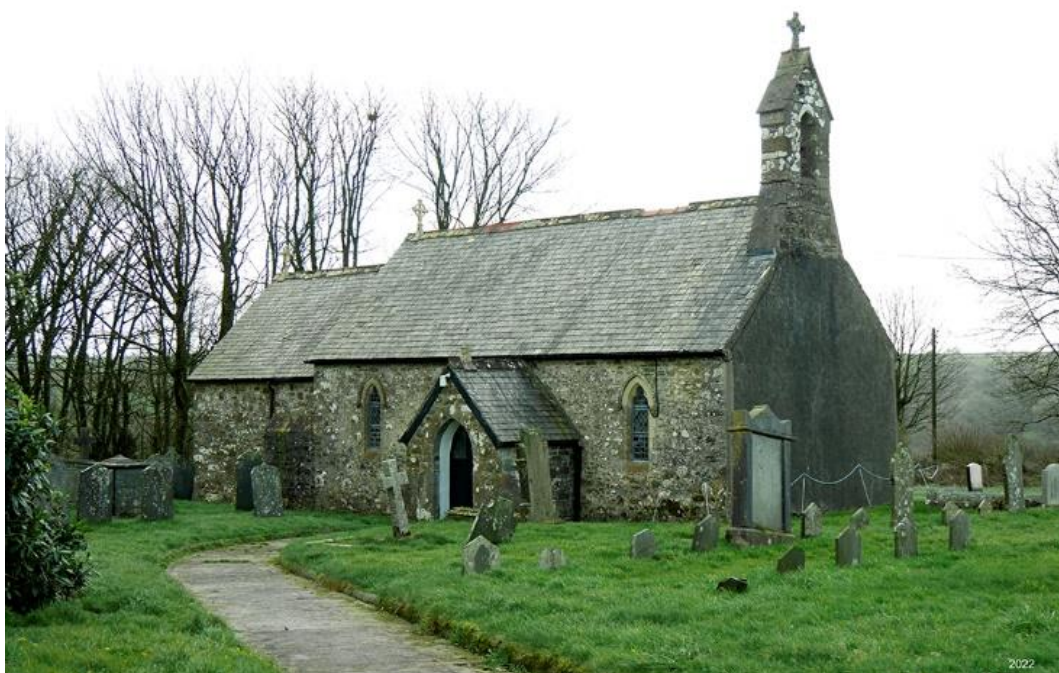
St Brynach's, Henry's Moat, North Pembrokeshire. (PRN 1295).