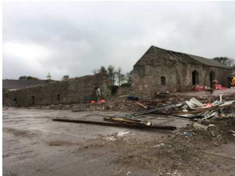
Figure 12 external view from adjoining farmyard looking towards north-east corner of barns

2.2.5 Photograph 12 below illustrates the external elevations of the buildings as viewed from the north east corner.