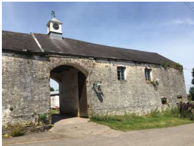
Figure 4 – front elevation to roadside displaying entrance archway