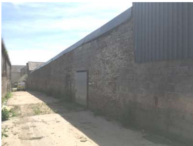
Figure 8 – long western elevation with modern farm sheds set opposite to the west