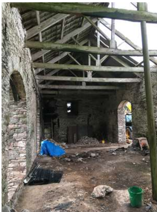
Figure 25 – northern wing