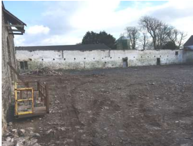
Figure 17 – inner courtyard view of long western wing