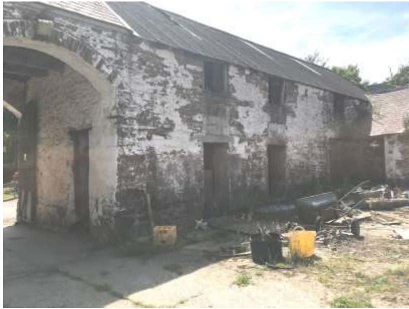
Figure 15 – southern wing from within inner courtyard looking at south-western corner