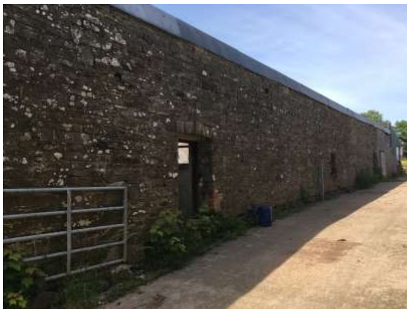
Figure 7 – long eastern elevation facing side farmyard