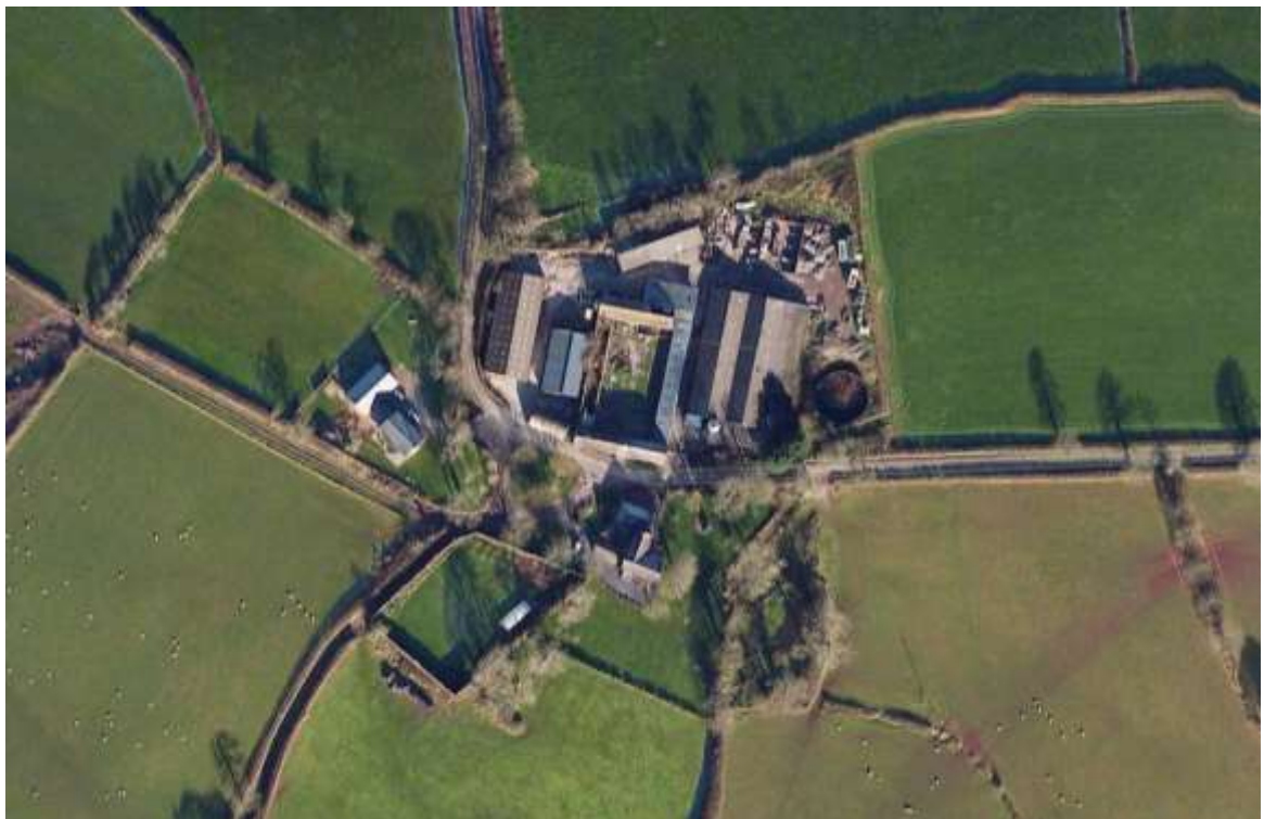
Figure 1 – Google Earth image of Pengay Farm (June 2018)