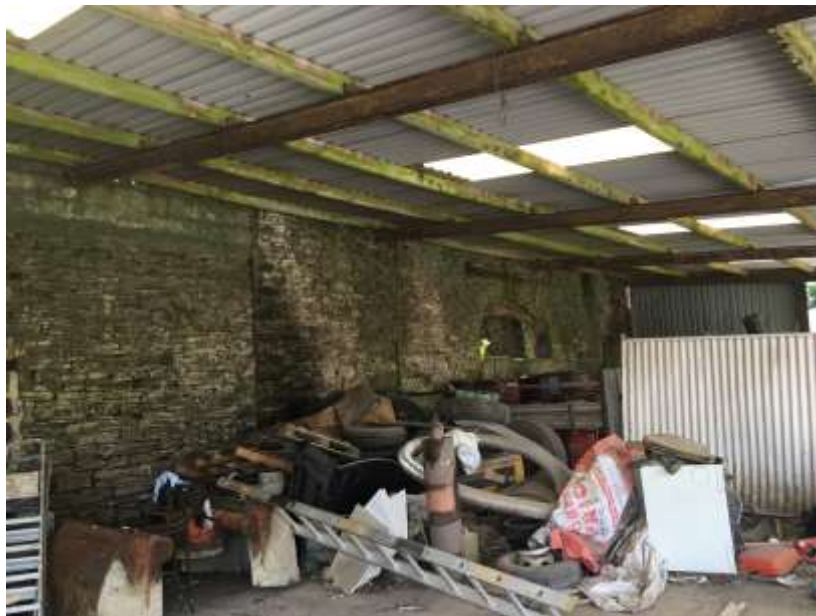
Figure 22 – south-western wing