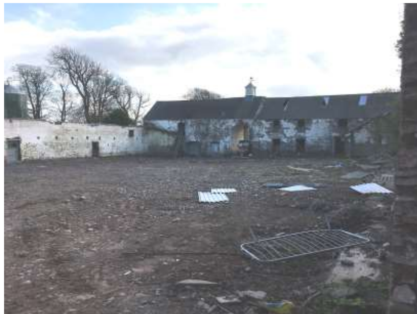
Figure 18 – view from inner courtyard towards northern rear wing