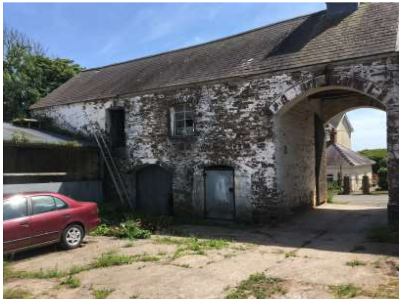
Figure 14 – view from within inner courtyard looking back through southern entrance archway and also south-eastern corner