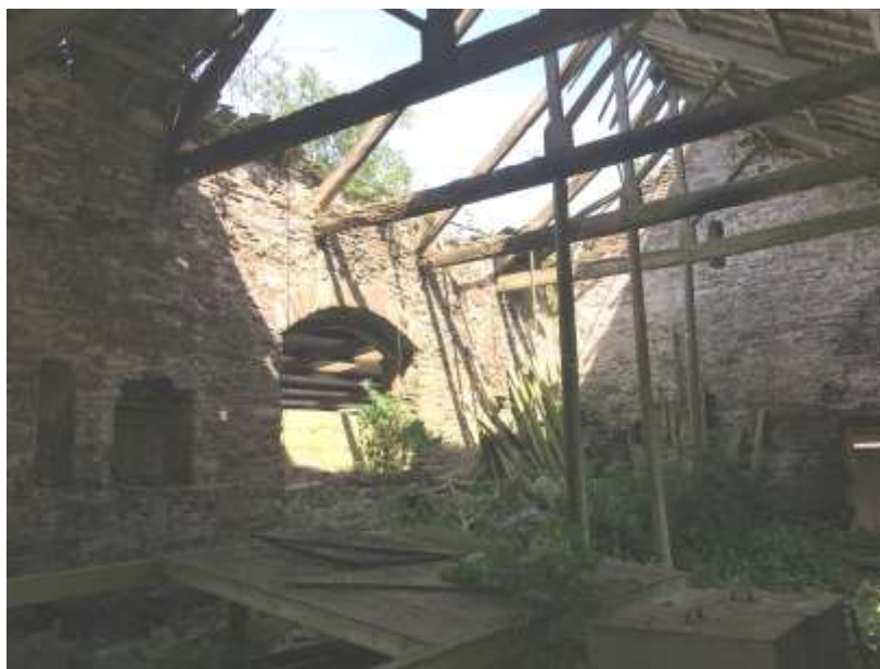
Figure 27 – north-western wing