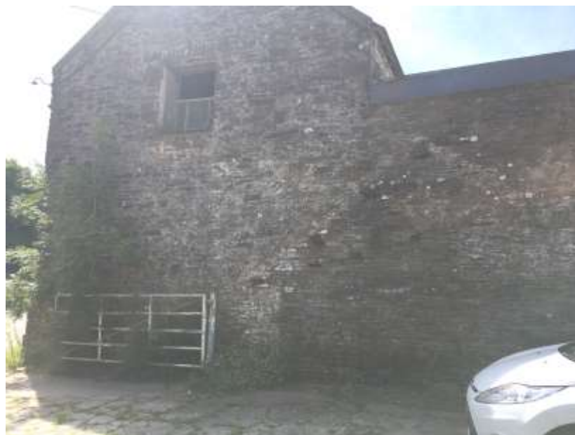
Figure 6 – south west corner

2.2.2 Photographs 6 to 8 below illustrate the entrance from Broadlay minor road into Penygau Farm.