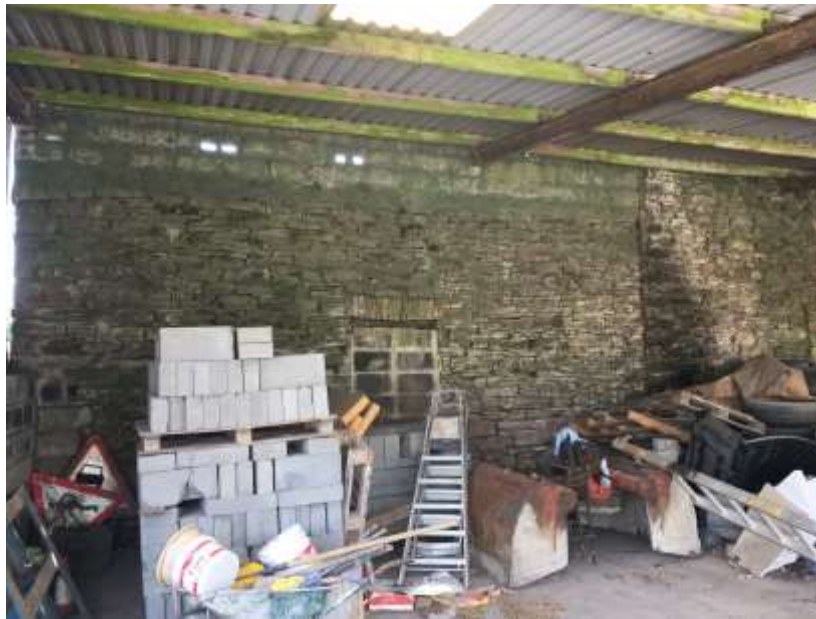
Figure 21 – ground floor southern wing