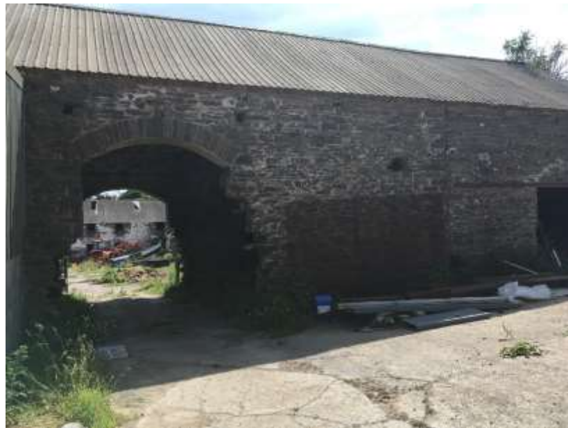
Figure 9 – image taken within inner courtyard looking back towards entrance archway

2.2.3 Photograph 9 to 10 below illustrate the external northern and western wings of the buildings.