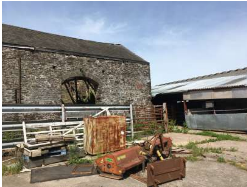
Figure 11 – external western wing and original archways over openings

2.2.4 Photograph 11 below illustrates the external western wing of the buildings.