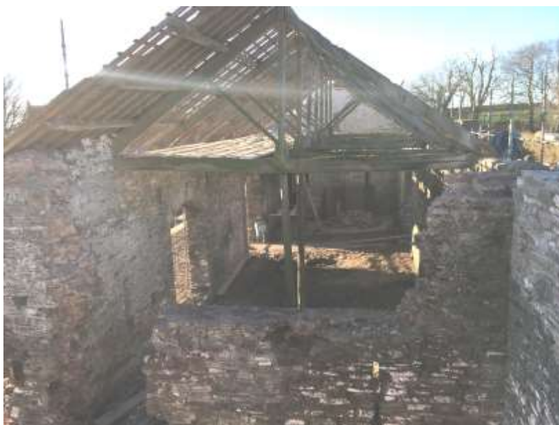
Figure 24 – northern wing