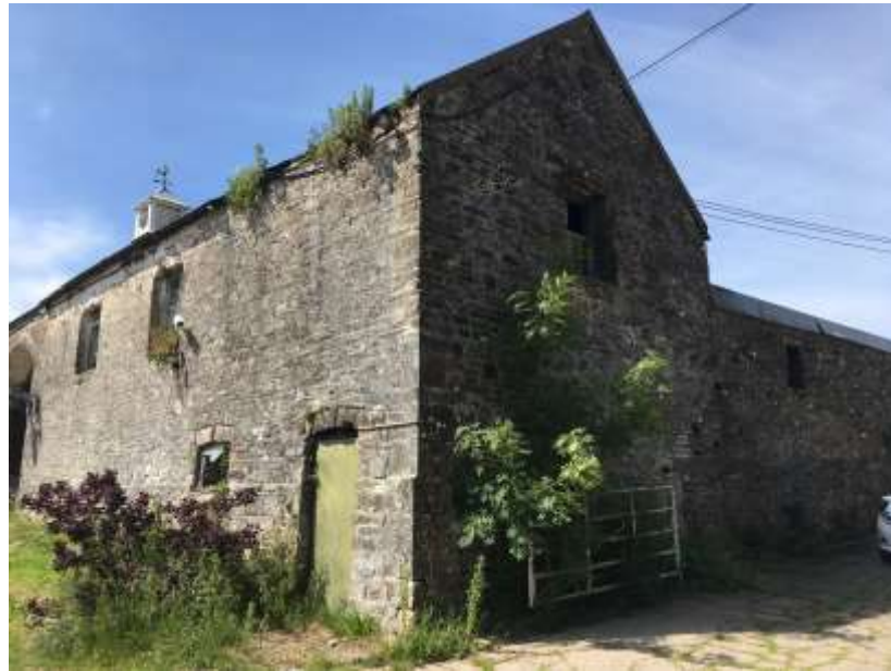
Figure 5 – south-west corner between front and eastern side barn elevations

2.2.2 Photographs 6 to 8 below illustrate the entrance from Broadlay minor road into Penygau Farm.