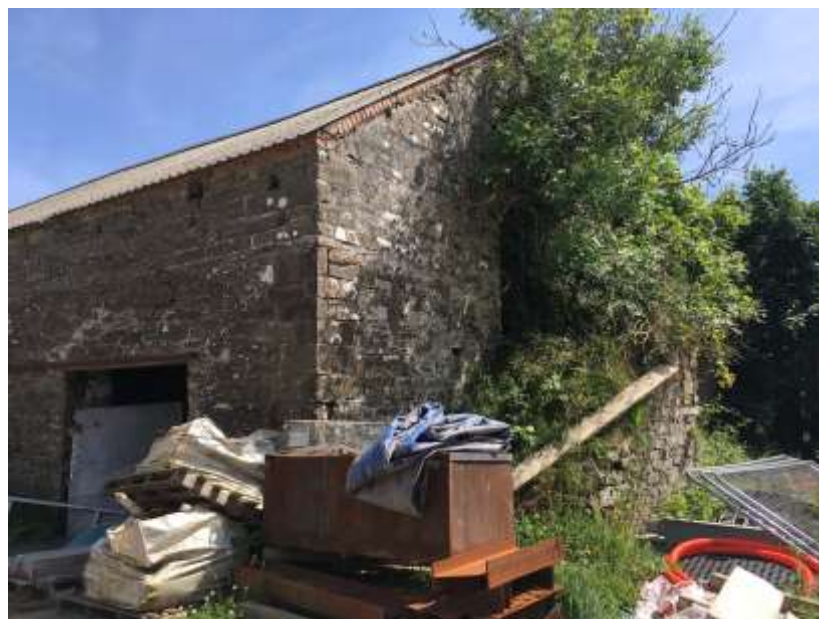
Figure 10 – taken from within inner courtyard and towards western wing of barn complex