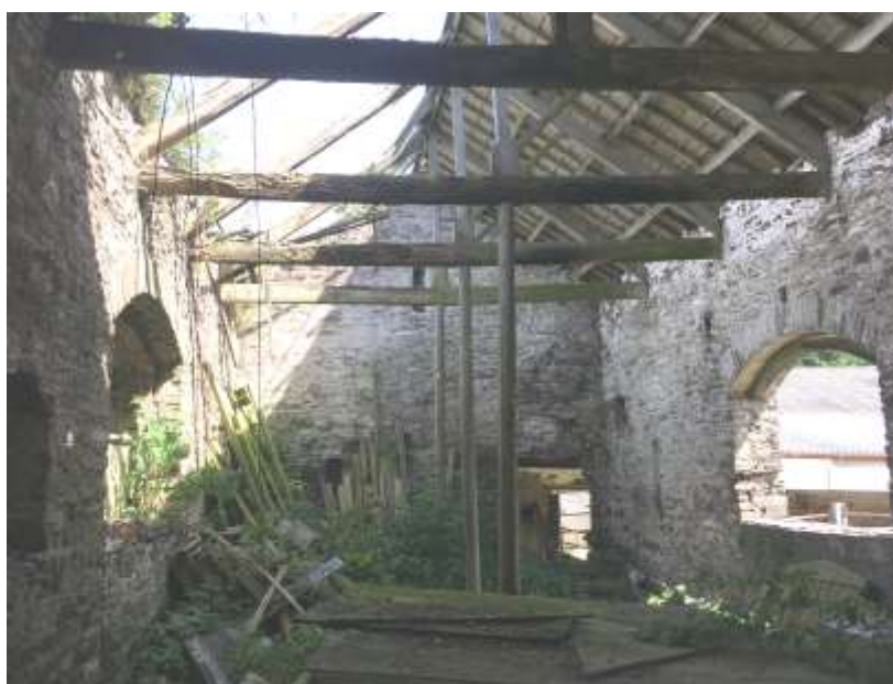
Figure 26 – north-eastern wing