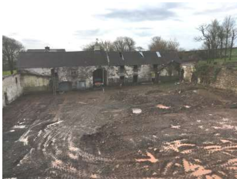
Figure 20 – extent of open inner courtyard with northern wing at distance