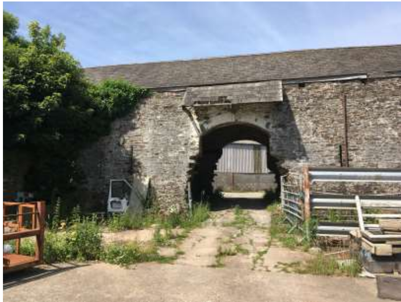
Figure 13 – northern wing looking from inner courtyard towards entrance archway

2.2.6 Photographs 13 to 20 below illustrate the external elevations of the buildings as viewed from inside the Courtyard.