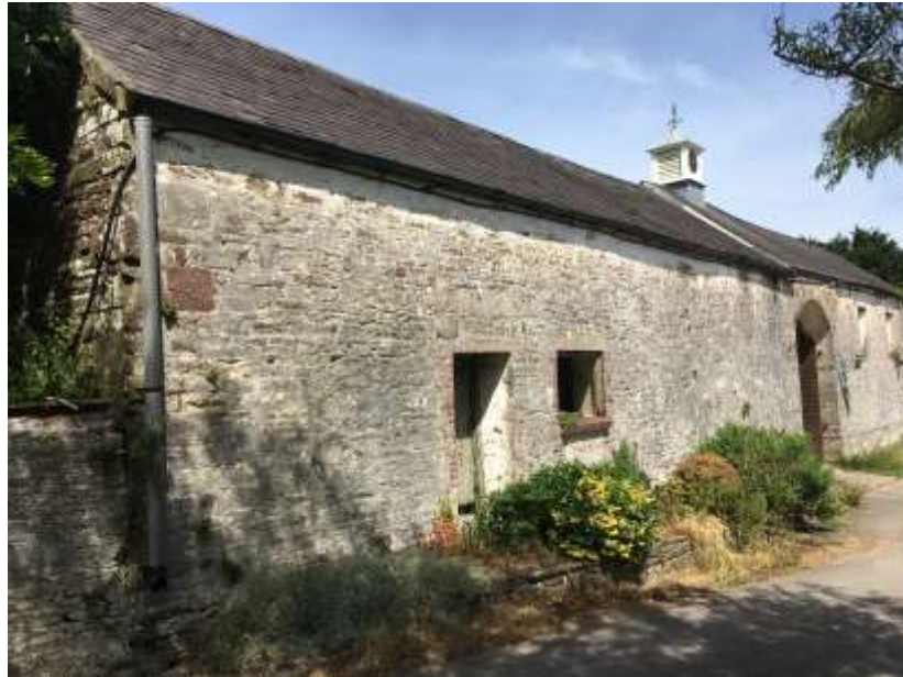
Figure 3 – front elevation of roadside barns

2.2.1 Photographs 3 to 5 below illustrate the existing building fronting the minor road from Broadlay, which runs alongside the southern wing of the buildings.