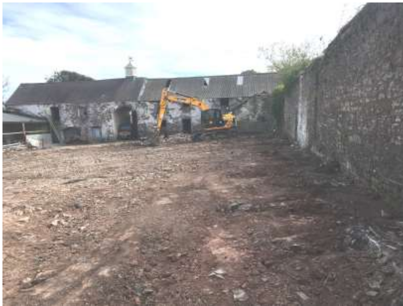
Figure 16 – inner courtyard view of long eastern elevation