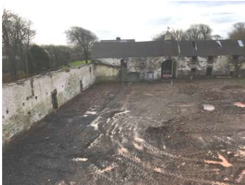
Figure 19 – view of inner western wing and northern wing in distance