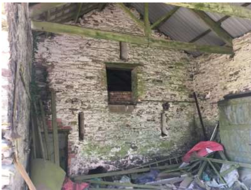
Figure 23 – northern wing