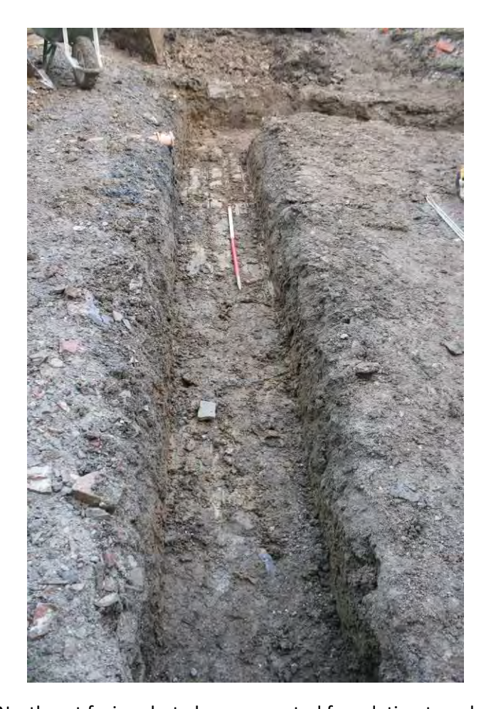
Photo 3: Northeast facing shot along excavated foundation trench. 1m scale.