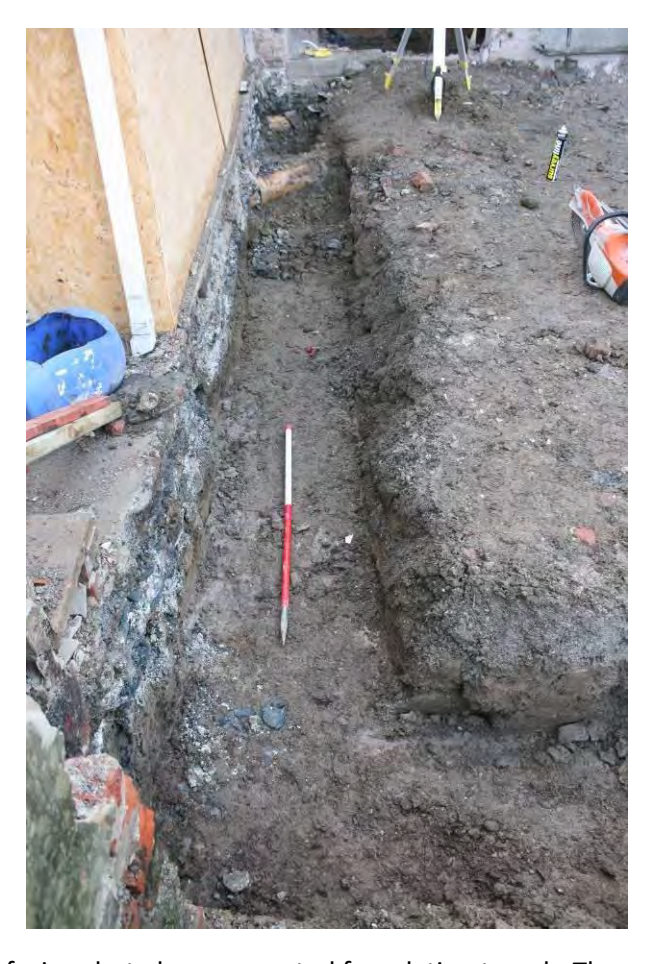
Photo 5: Southwest facing shot along excavated foundation trench. The sewer pipe to the rear truncates wall 105. 1m scale.