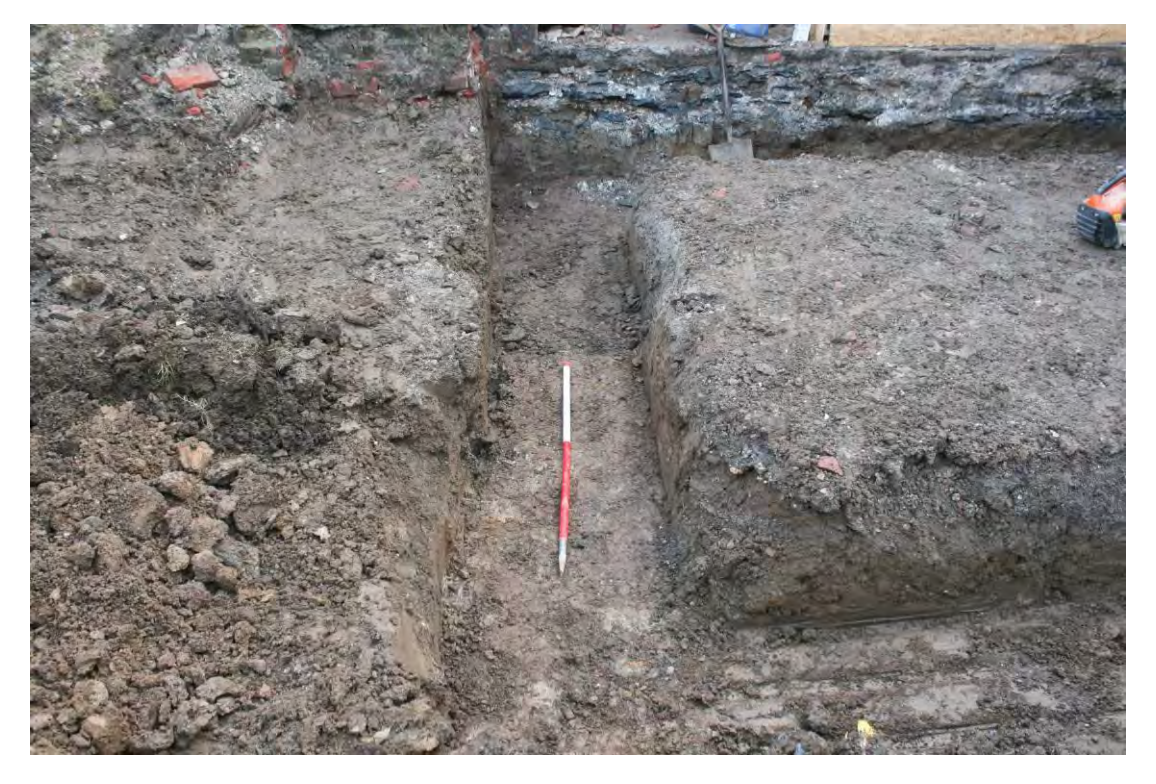
Photo 4: Southeast facing shot along excavated foundation trench. 1m scale.