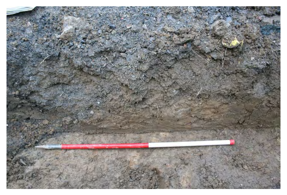
Photo 6: Northeast facing shot of a representative section of the foundation trenches. 1m scale.