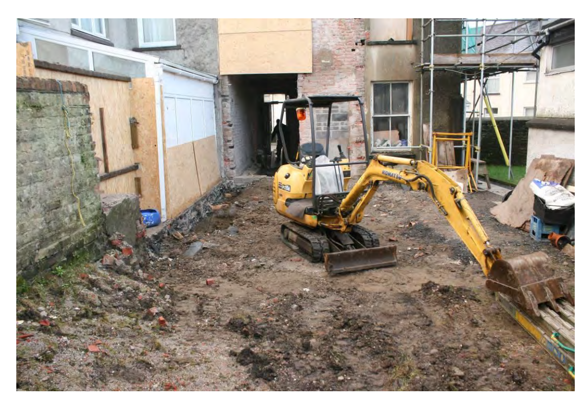
Photo 1: Southwest facing shot of the development area after the removal of the pre-existing extension.