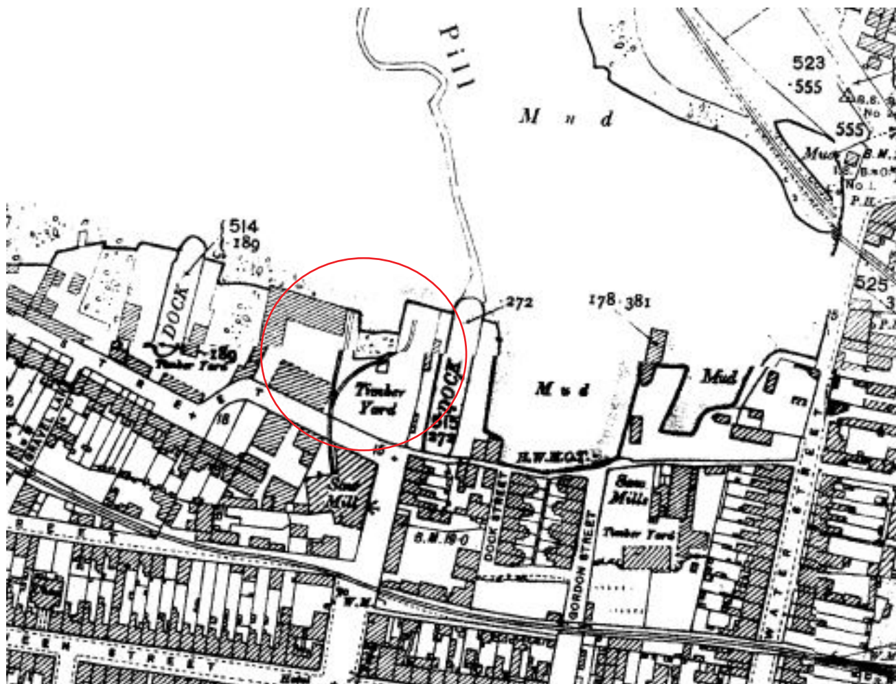
Fig. 5 OS 2nd Edition map of 1908 showing the proposed development site