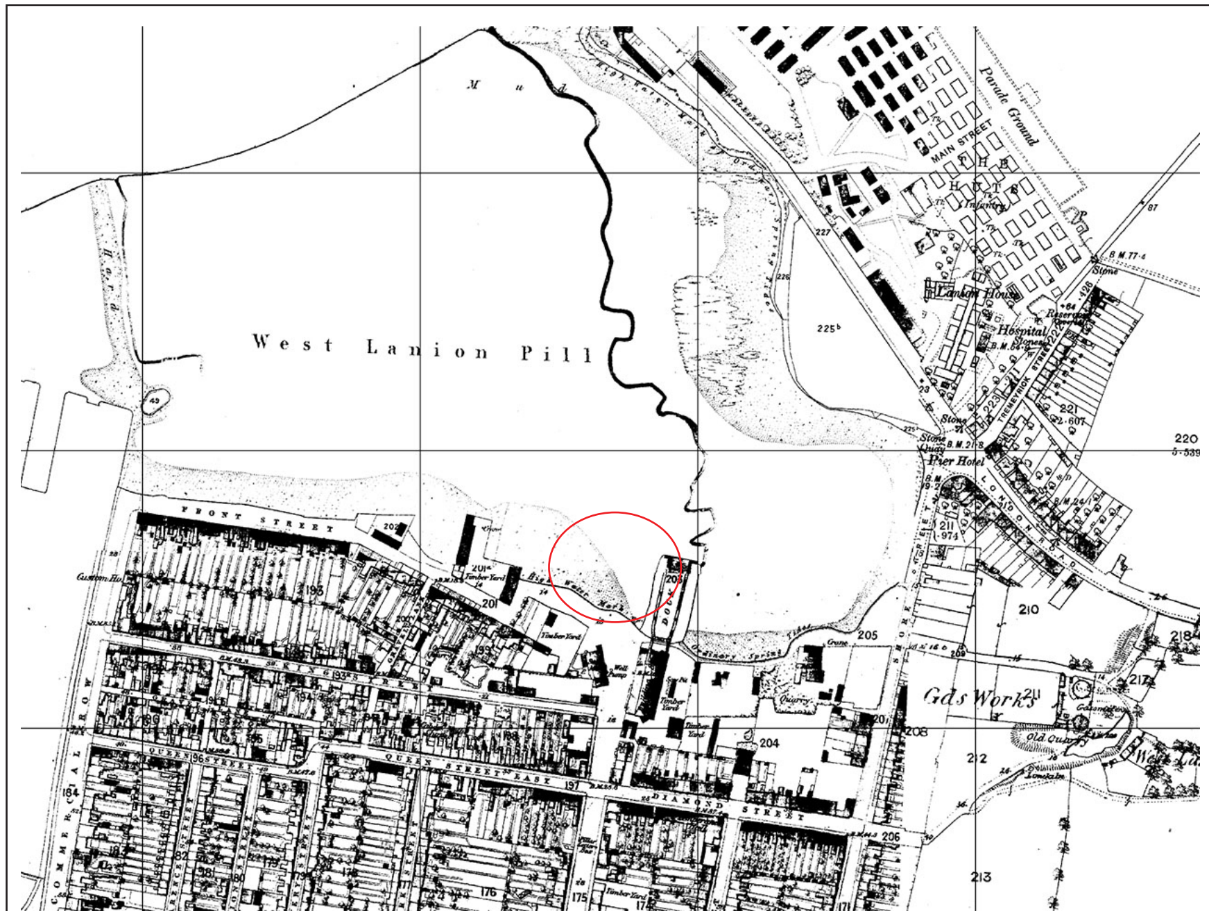
Fig. 4 OS 1st Edition Map of 1866 showing location of proposed development site