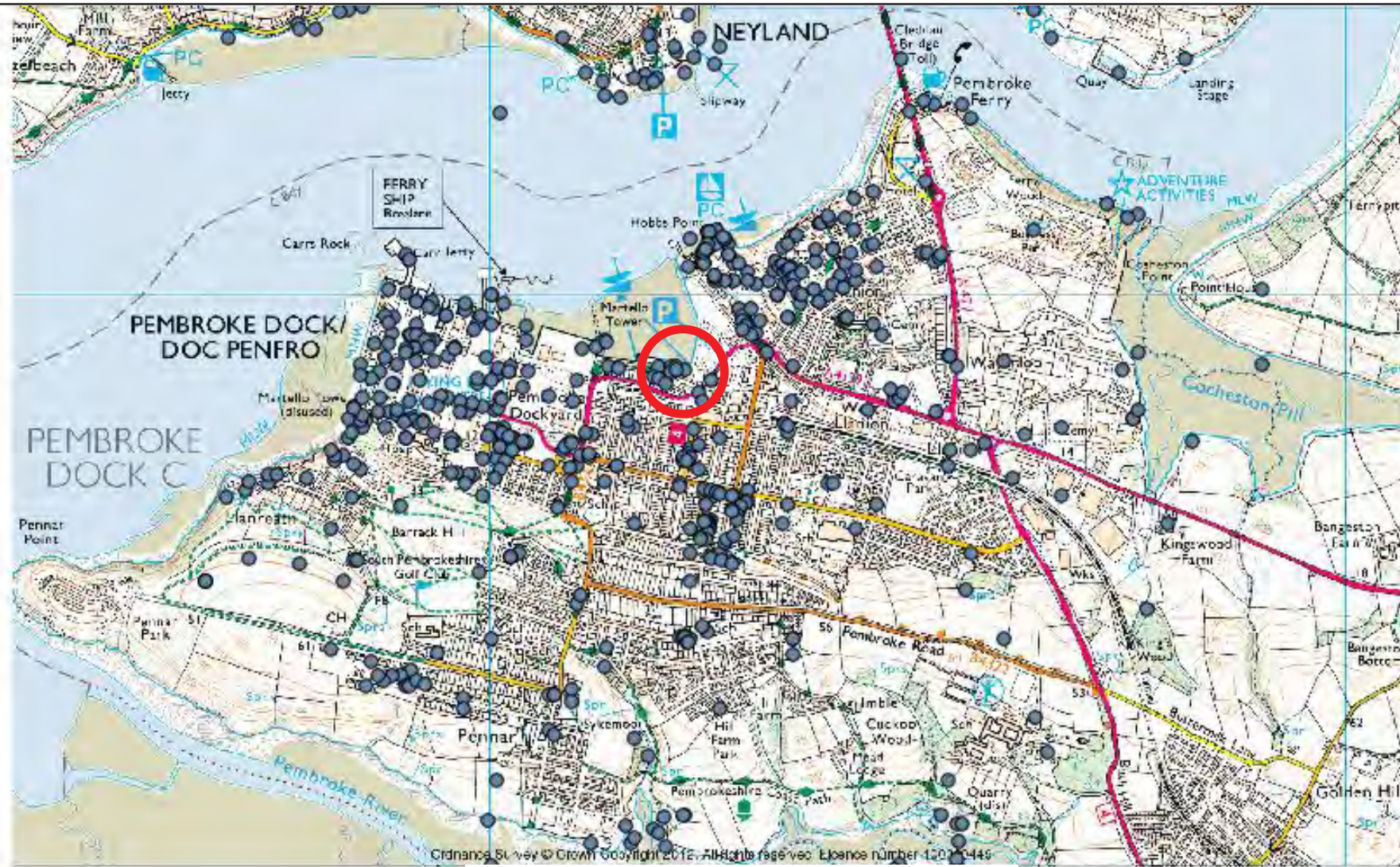
3a. Sites of archaeological significance within 2km of the proposed development area