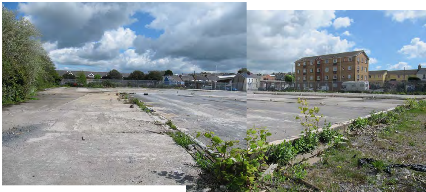
Fig. 8 View across the proposed development site.