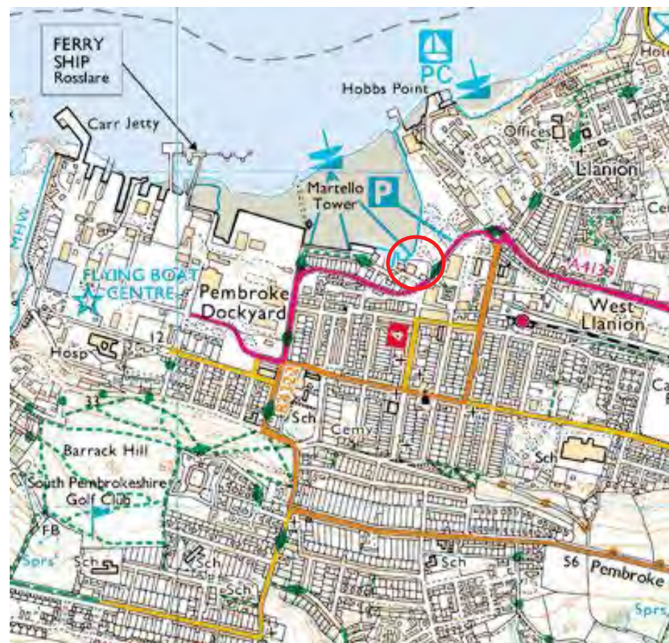
Fig. 1 Location of site