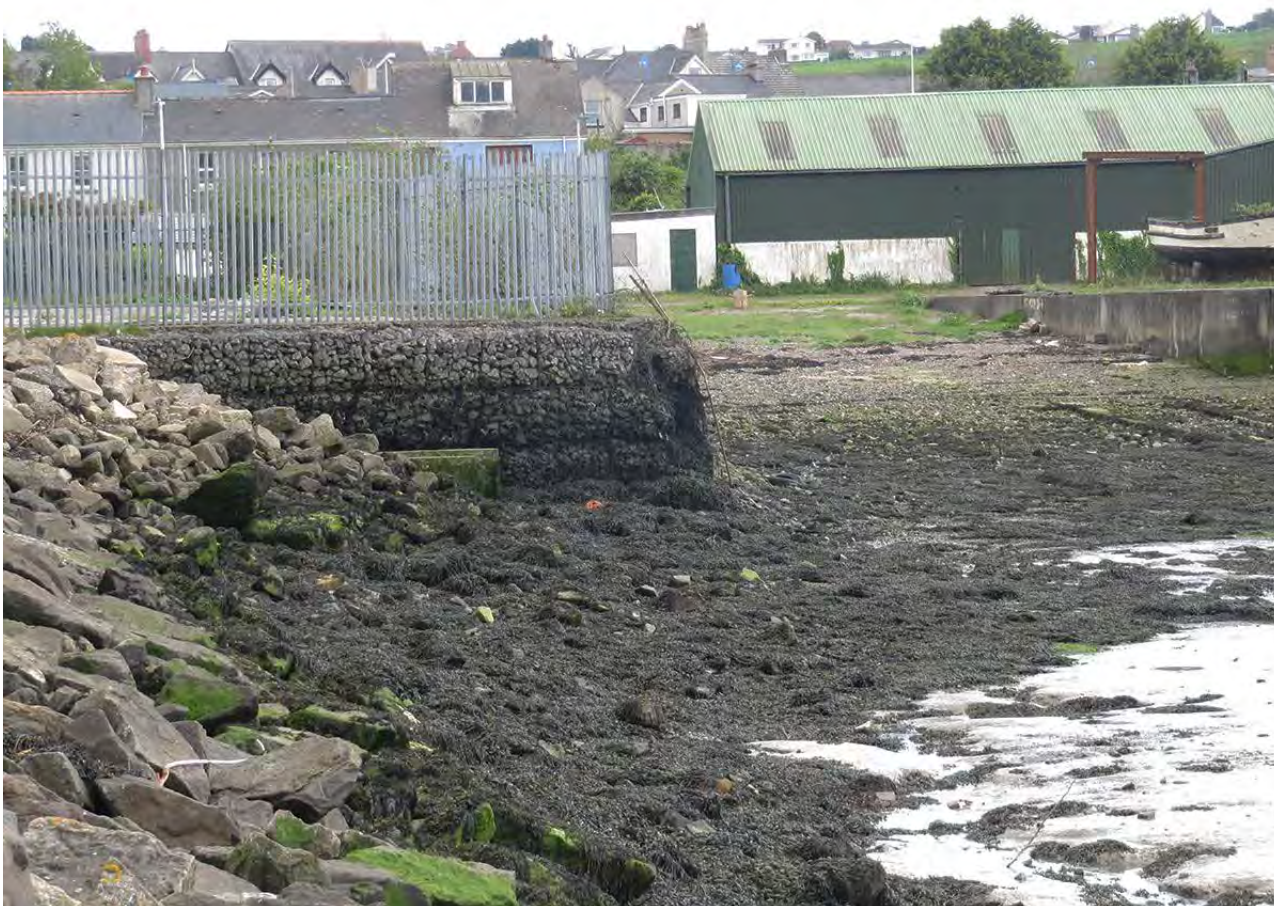
Fig. 9 View towards the NW corner of the proposed development site showing the height of the reclaimed land above the old shore line