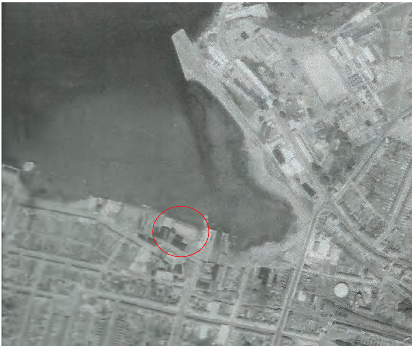
Fig. 7 RAF Aerial photo from June 1959 showing the proposed development site