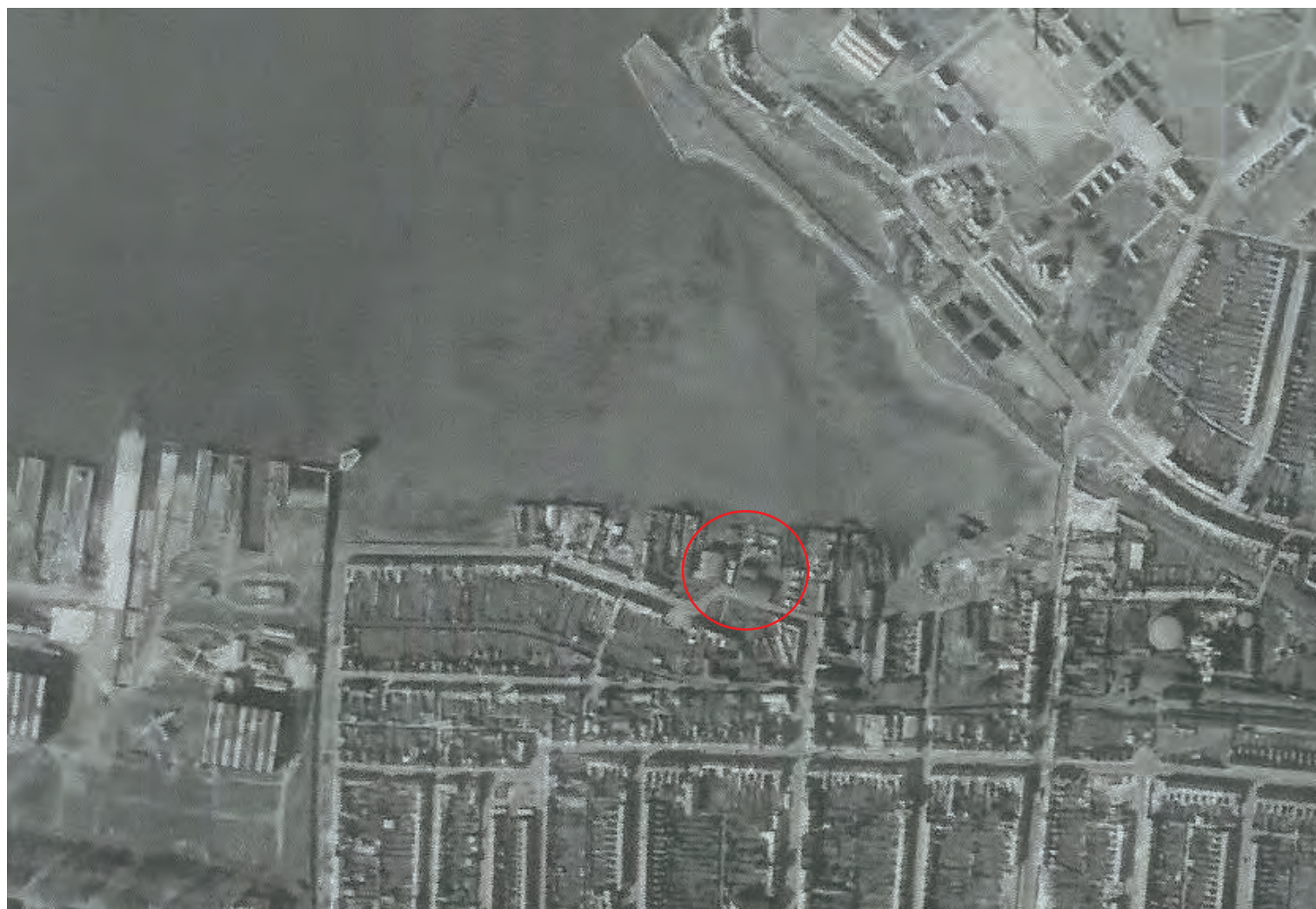
Fig. 6 RAF Aerial photo from April 1946 showing the proposed development site