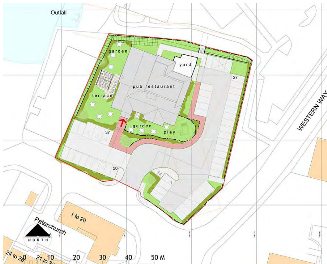
Fig. 2 Proposed development on the site