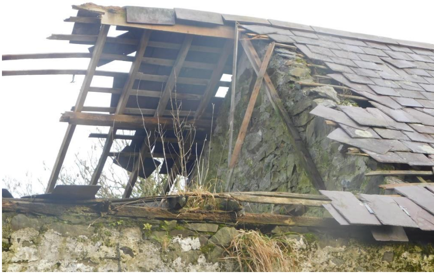
Building B facing North East