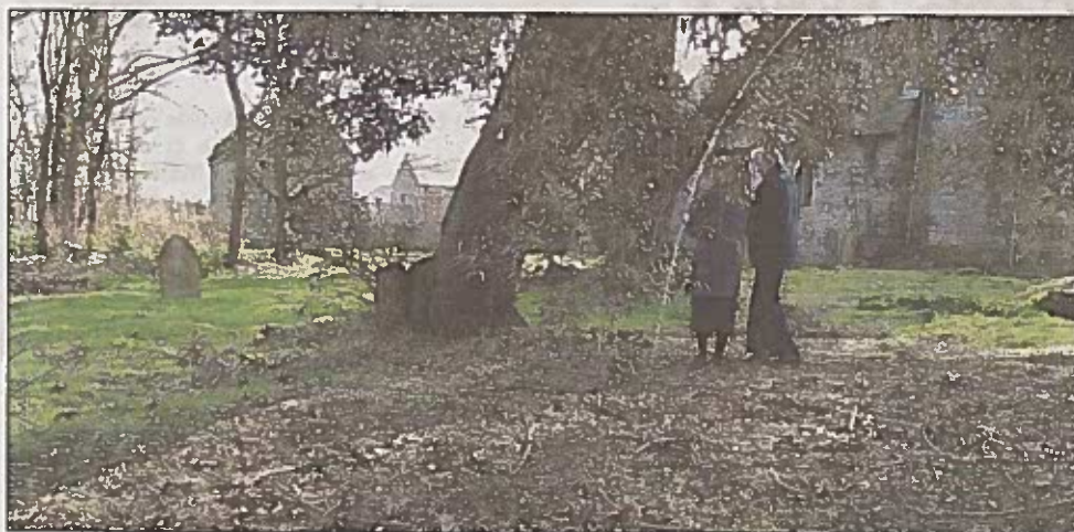
The grave site in 2016, the black pot in the centre indicates where the actual grave is.