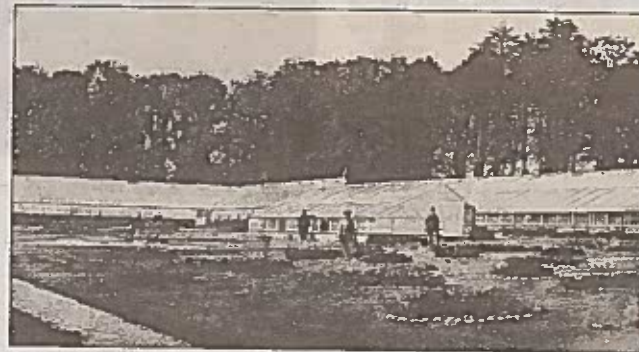
A historic photo of Picton Castle's walled garden.